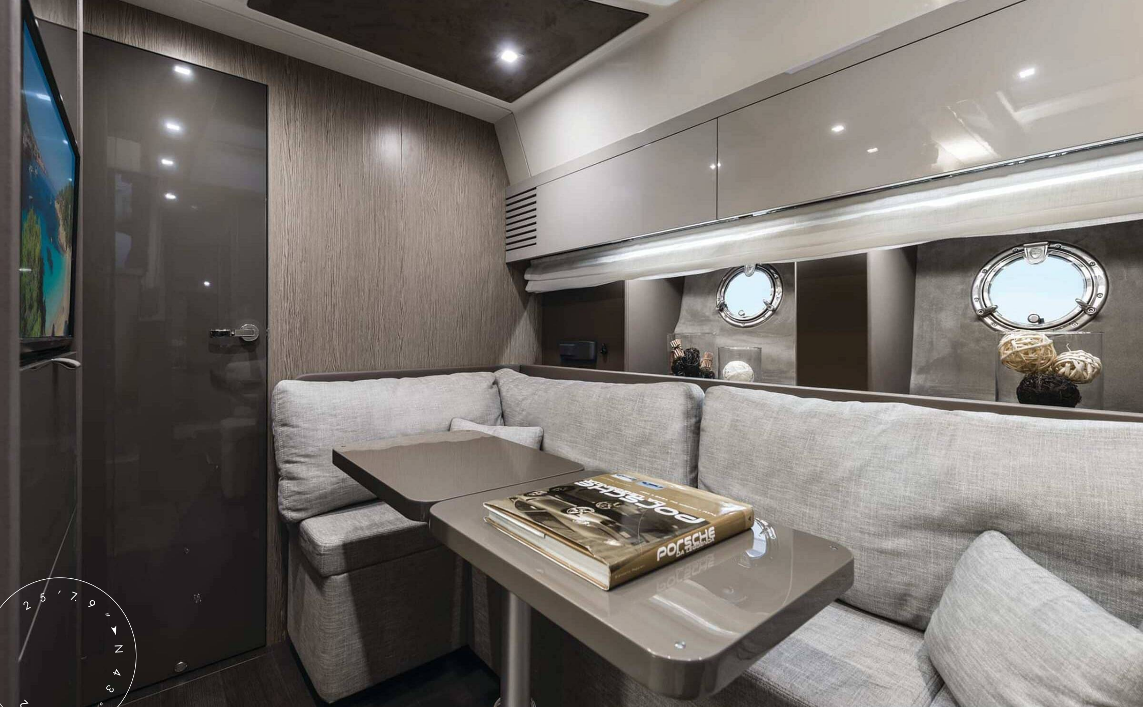
LOWER DECK LOBBY