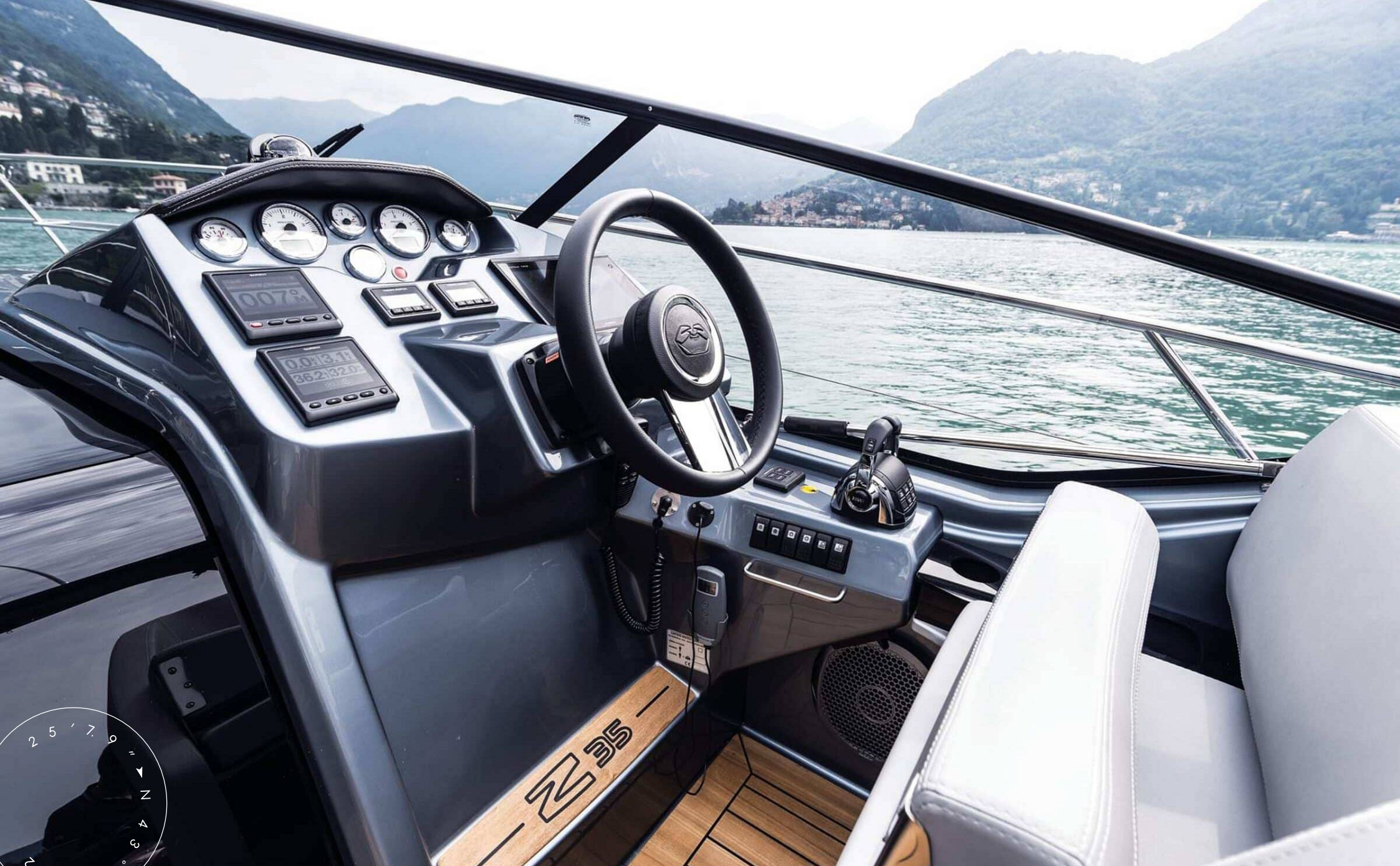
MAIN HELM STATION