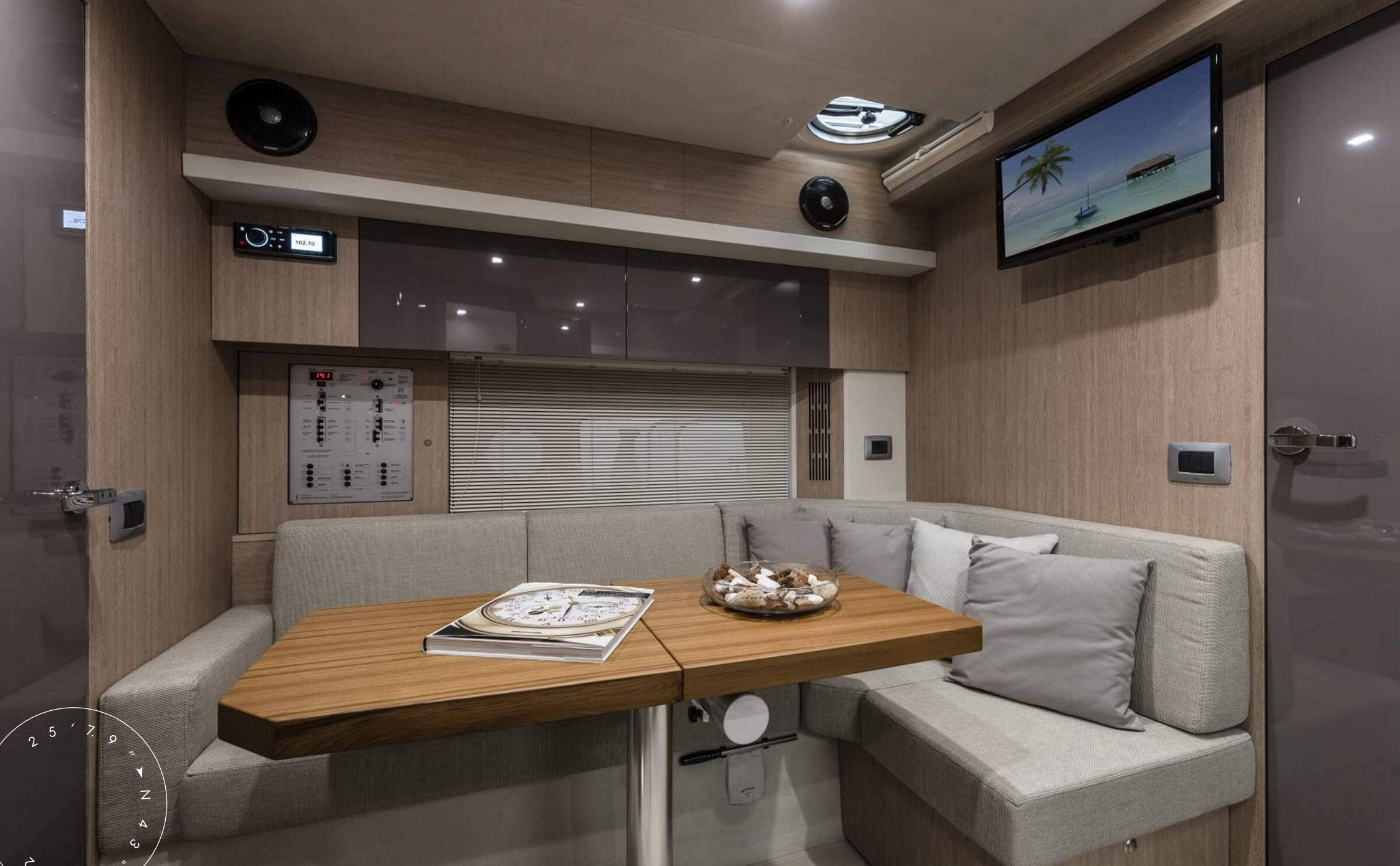
LOWER DECK LOBBY