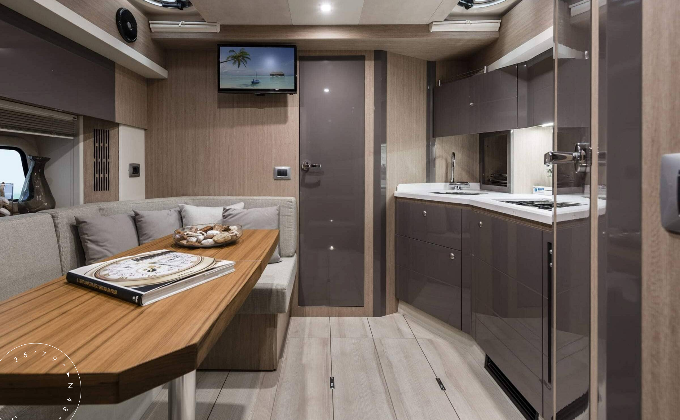
LOWER DECK LOBBY