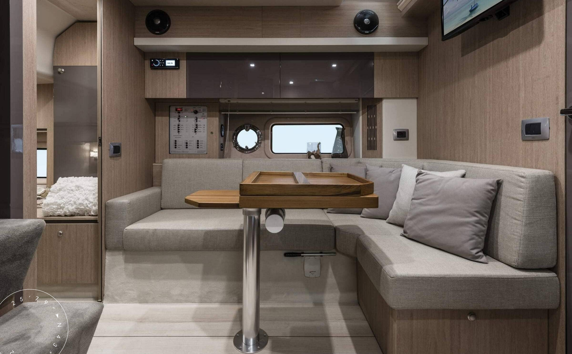
LOWER DECK LOBBY