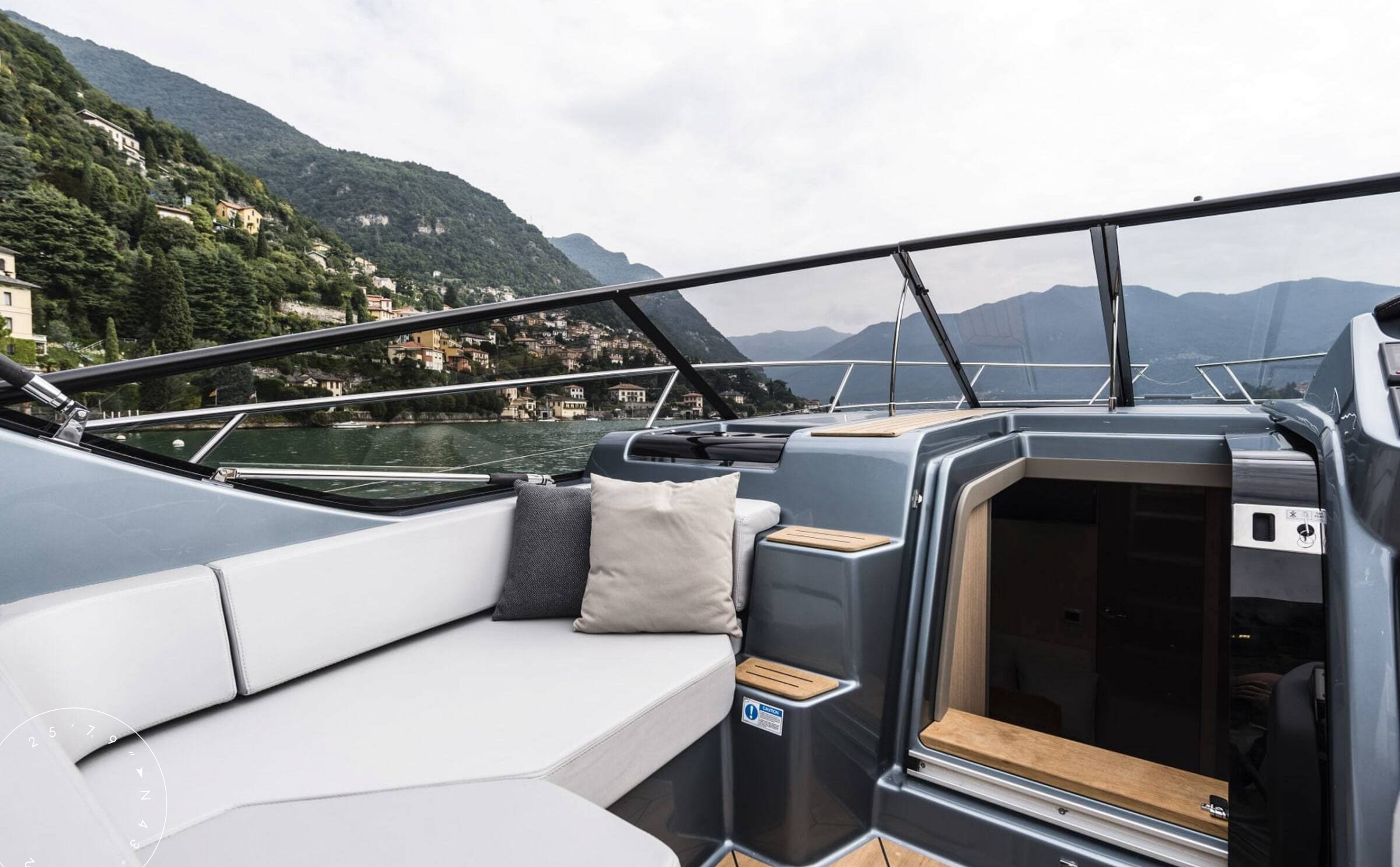
MAIN DECK LOUNGE AREA