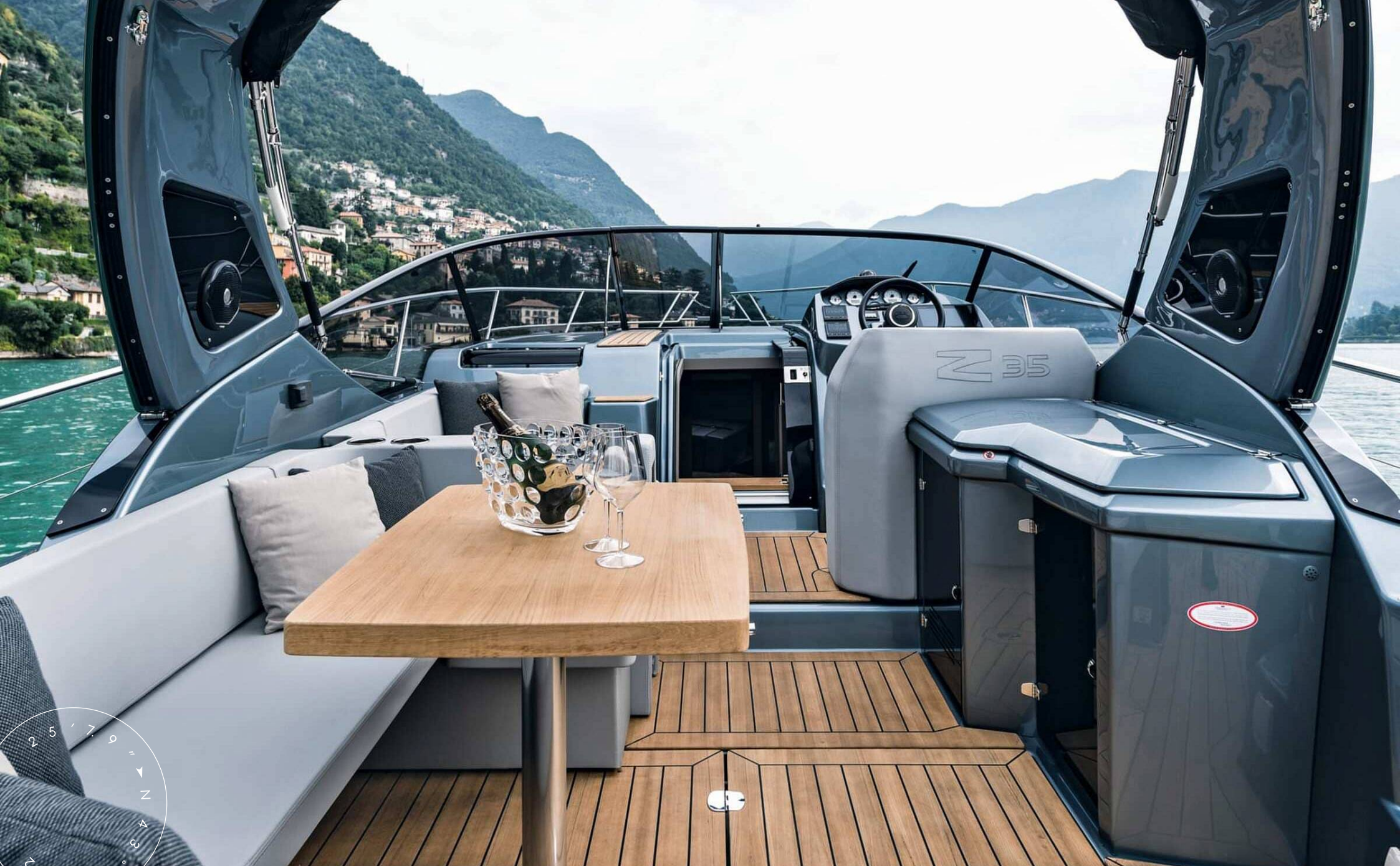
COCKPIT DINING AREA