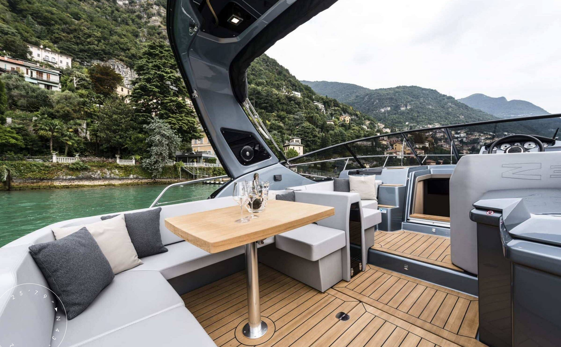
COCKPIT DINING AREA