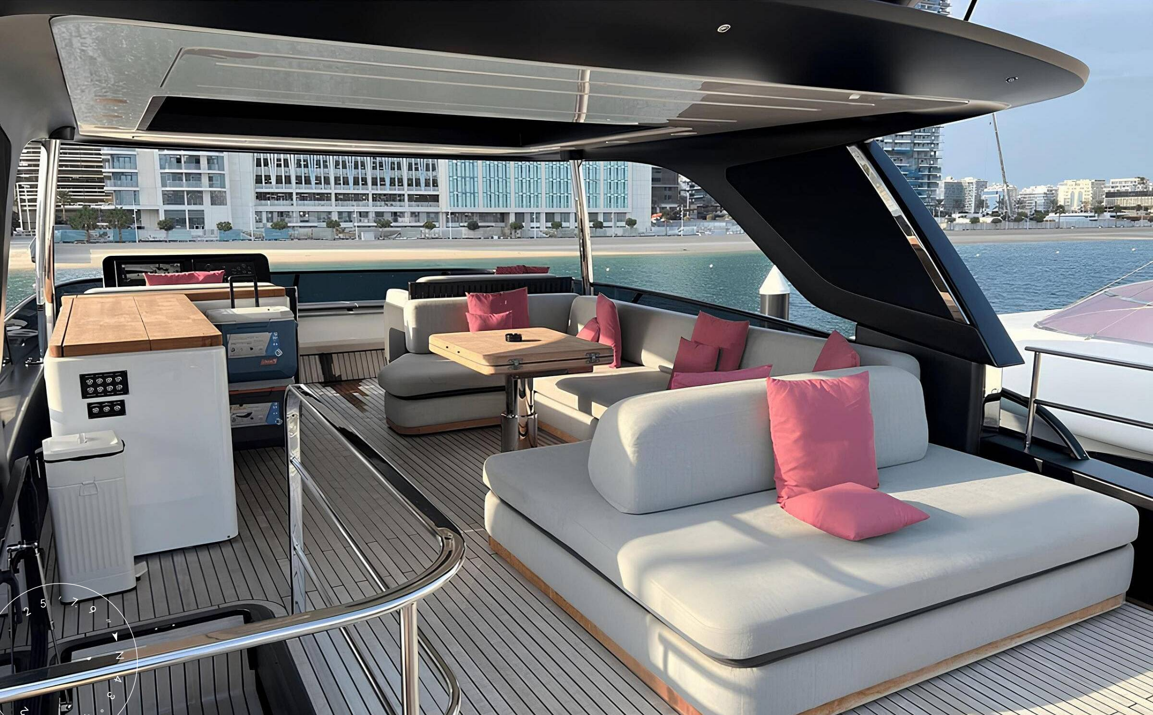
FLYBRIDGE LOUNGE AREA