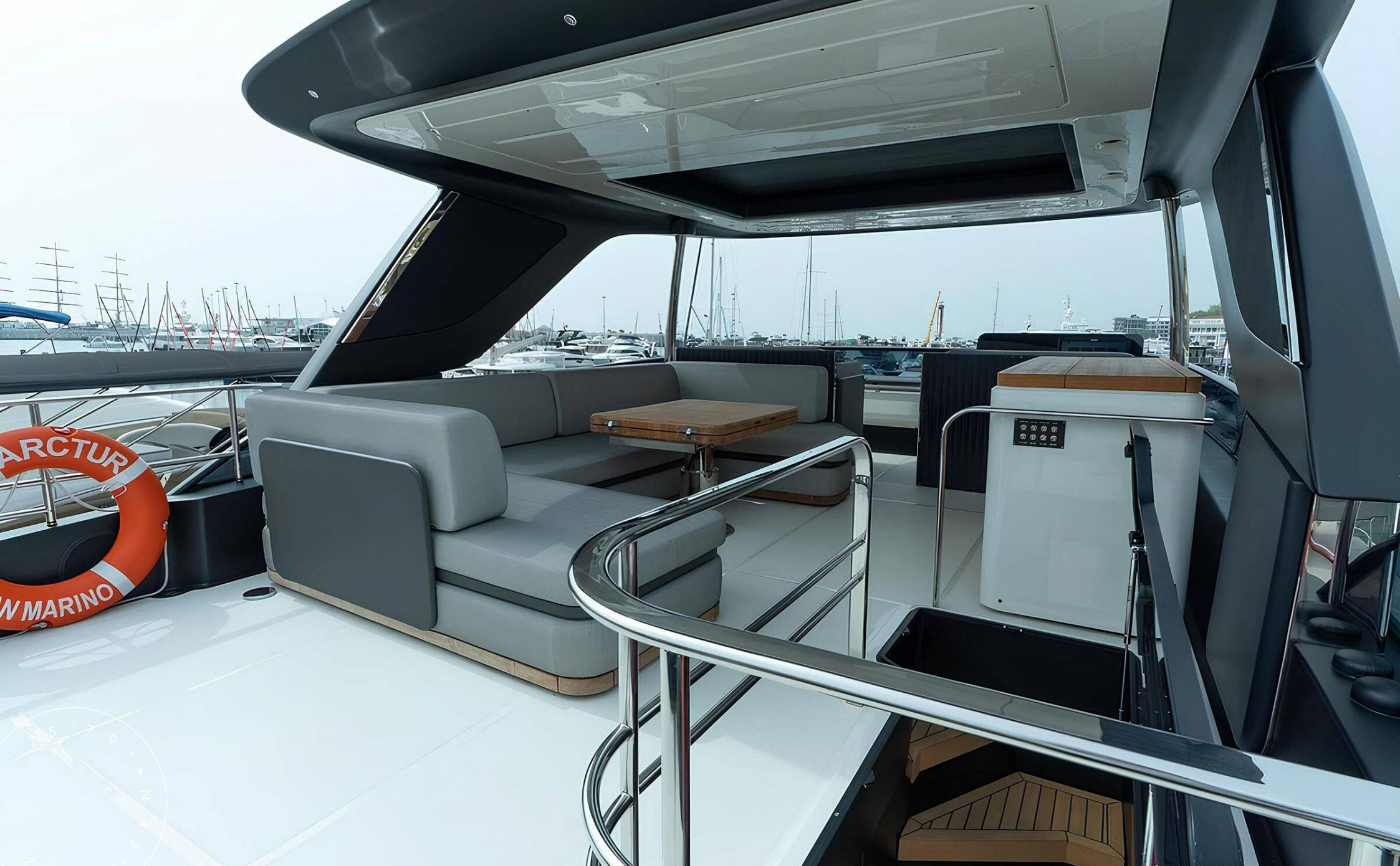
FLYBRIDGE LOUNGE AREA