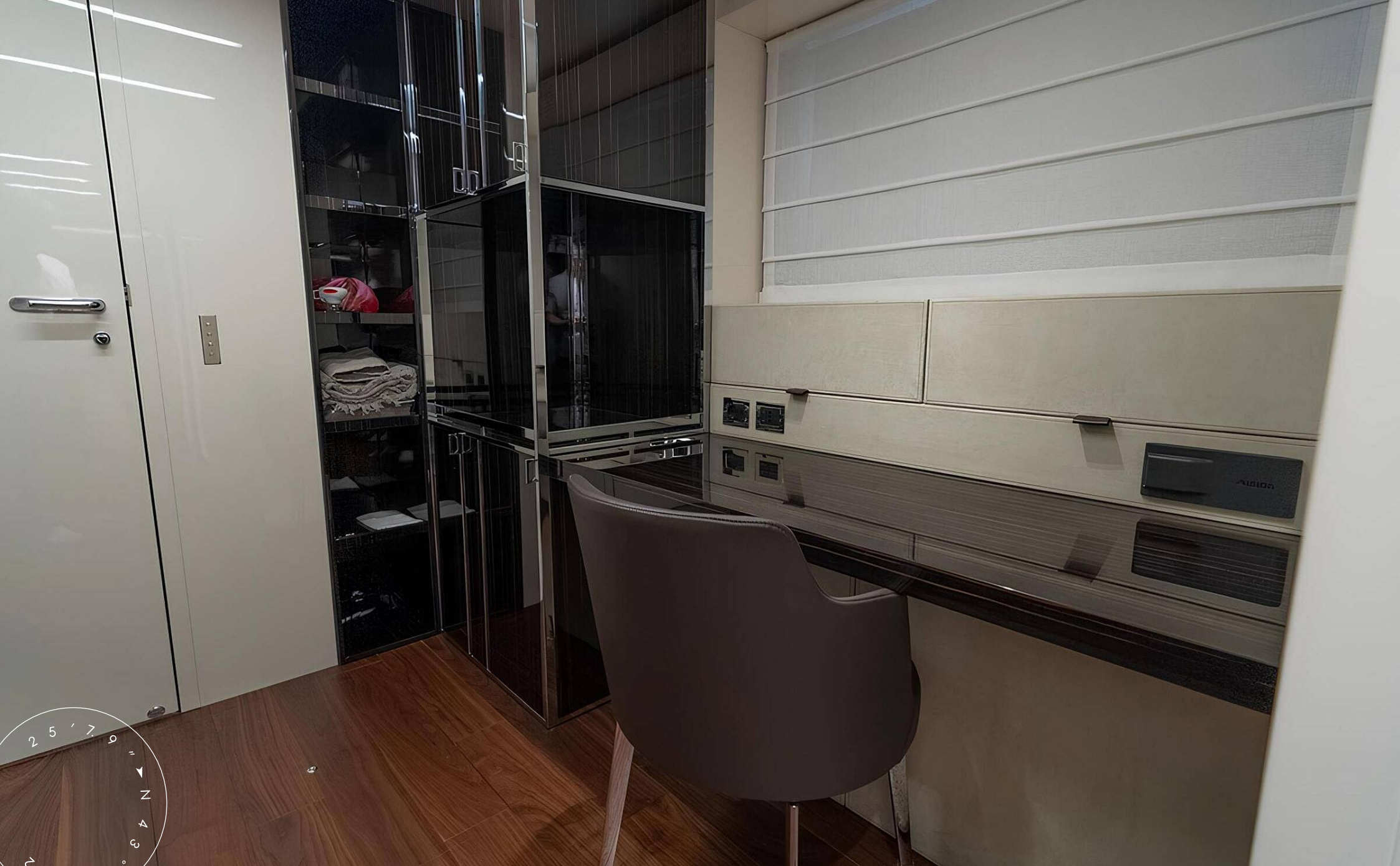
OFFICE IN THE MASTER CABIN