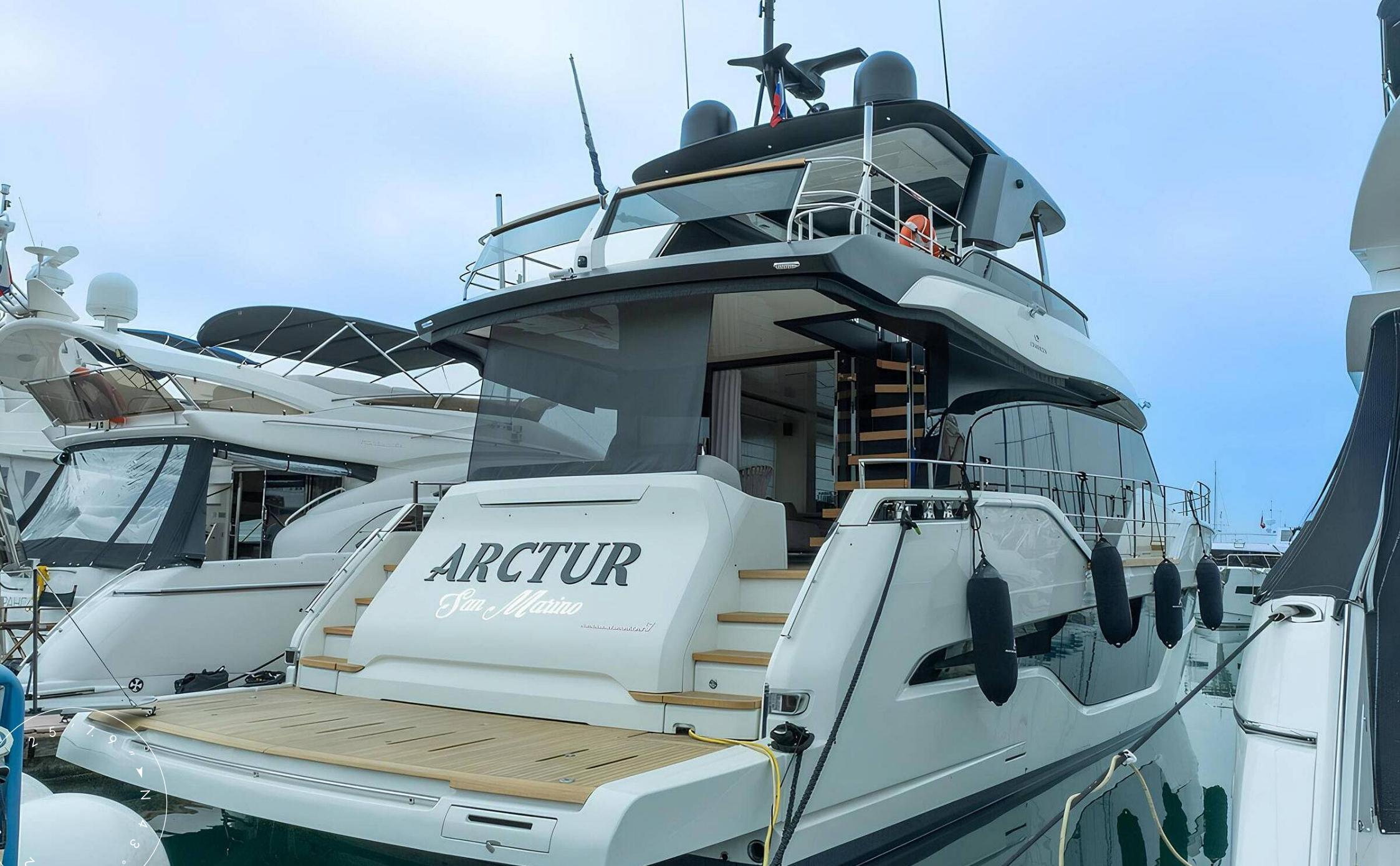
EXTERIOR SESSANTASETTE 67 2022 MY ARKTUR