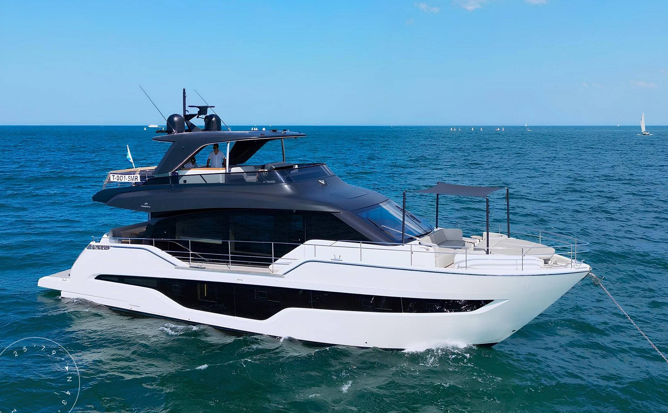
EXTERIOR CRANCHI SESSANTASETTE 67 2023 MY AMY