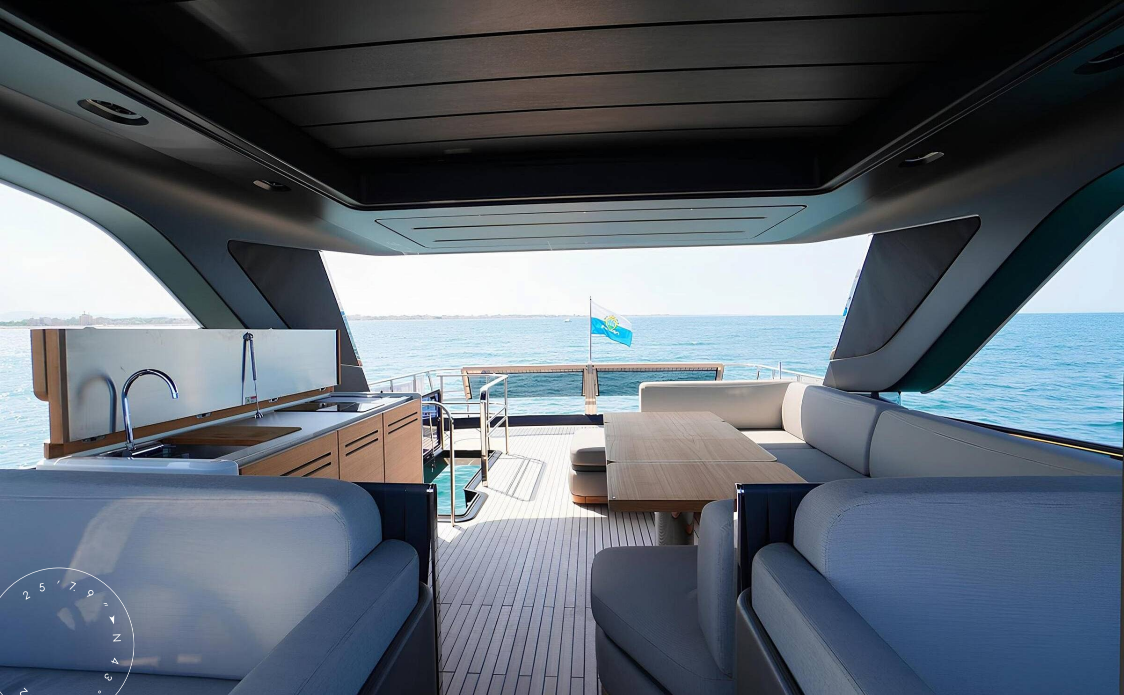
FLYBRIDGE LOUNGE AREA