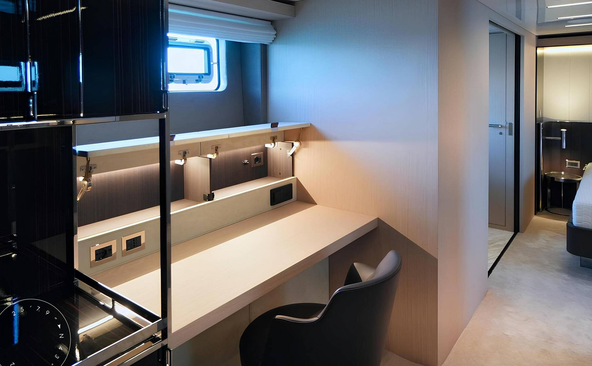
MAKE-UP TABLE IN MASTER CABIN