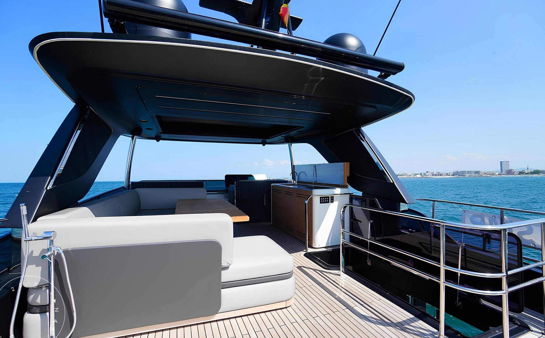
FLYBRIDGE LOUNGE AREA