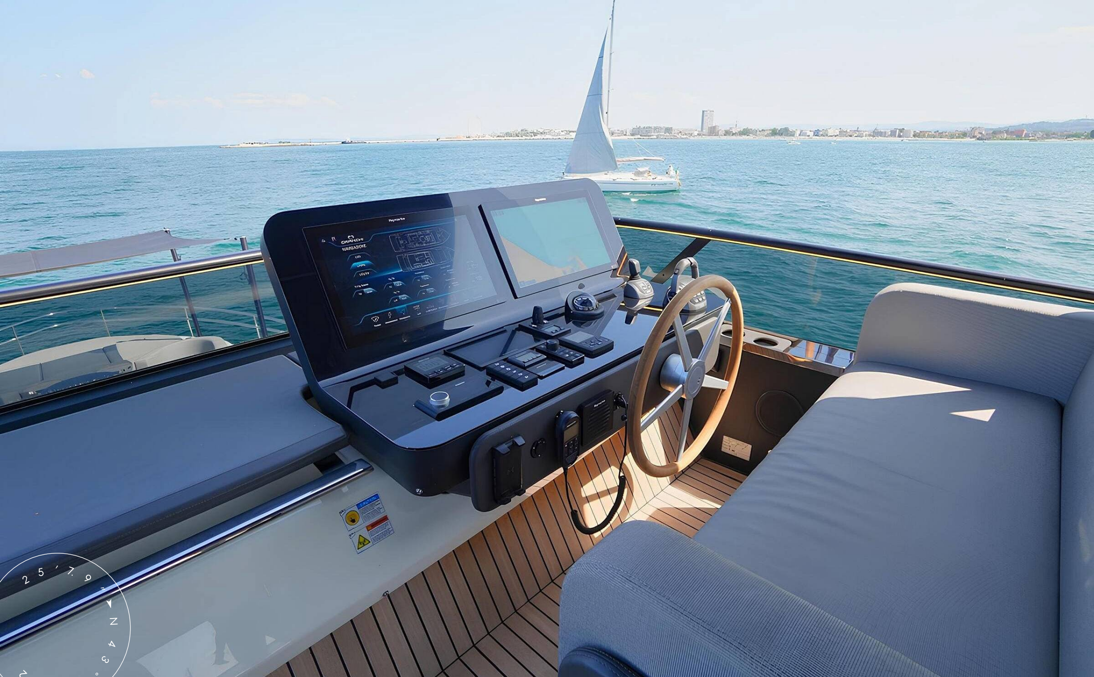
SECOND HELM STATION