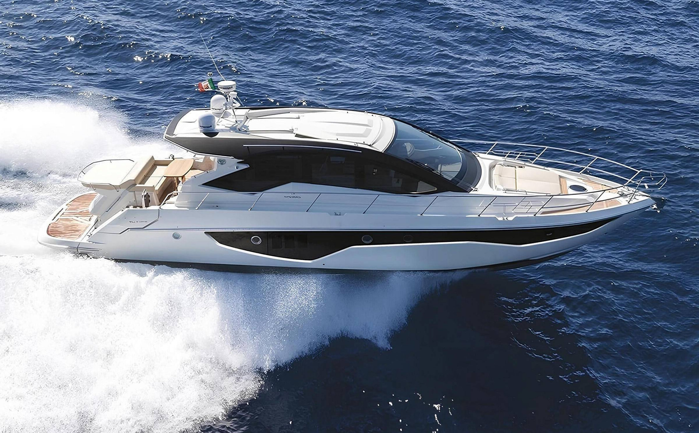
EXTERIOR CRANCHI 60 HT 2018 MY SARAH