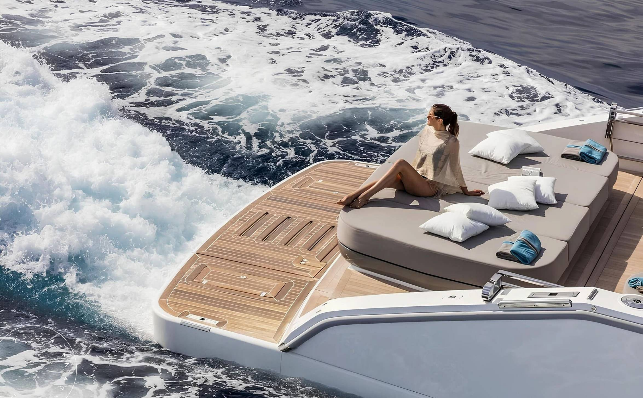
AFT MAIN DECK LOUNGE AREA