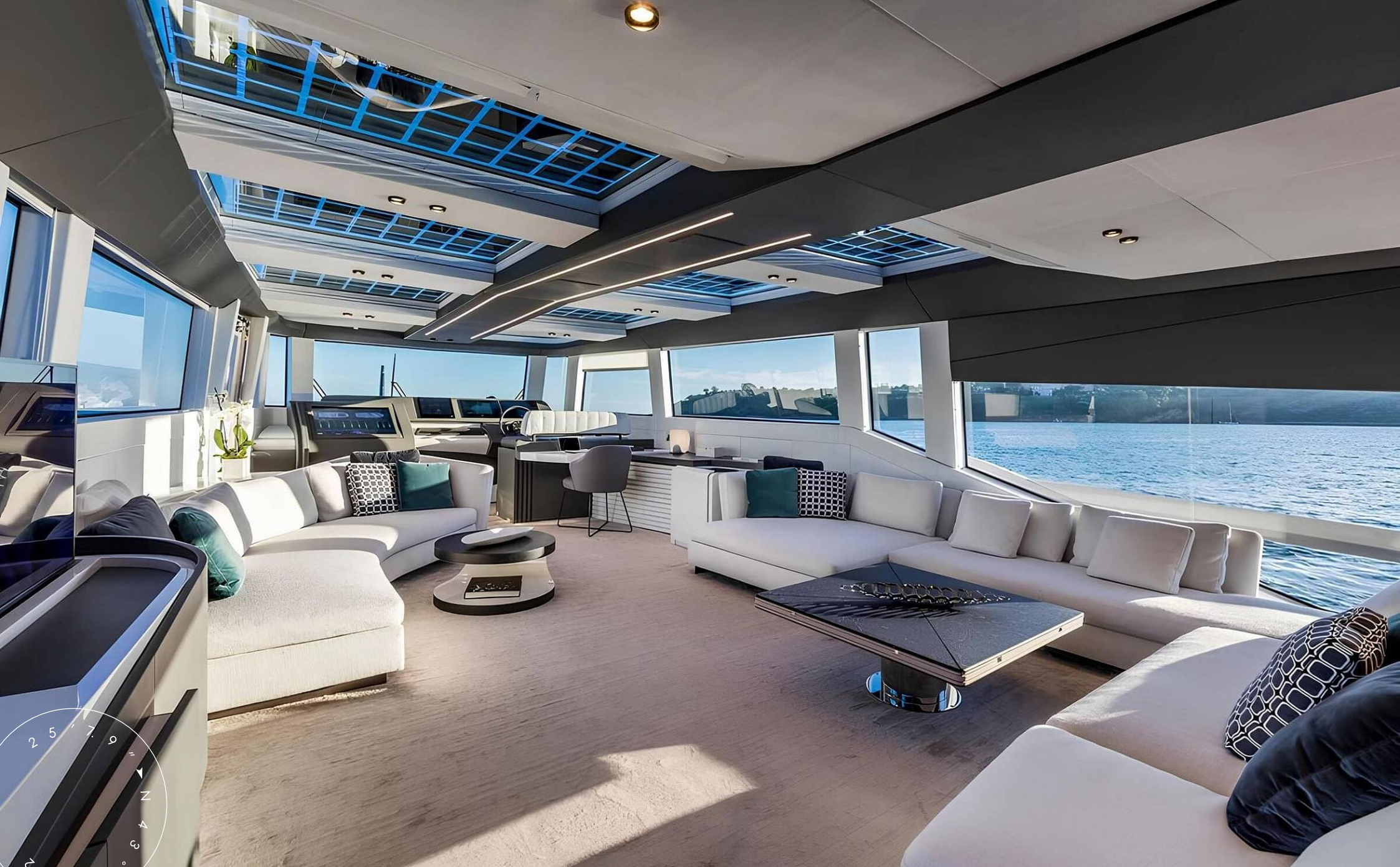
MAIN SALON LOUNGE AREA