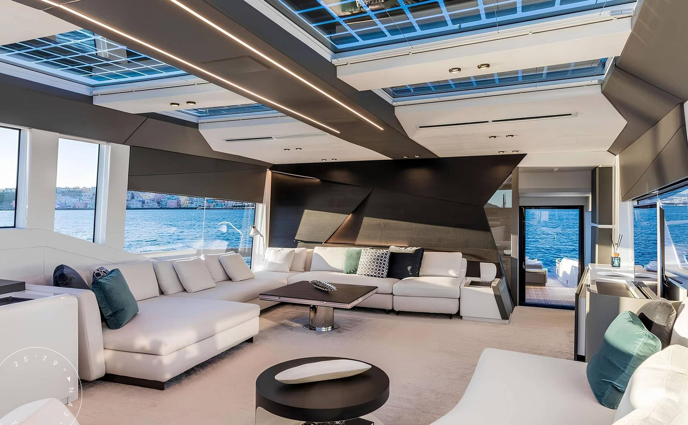
MAIN SALON LOUNGE AREA