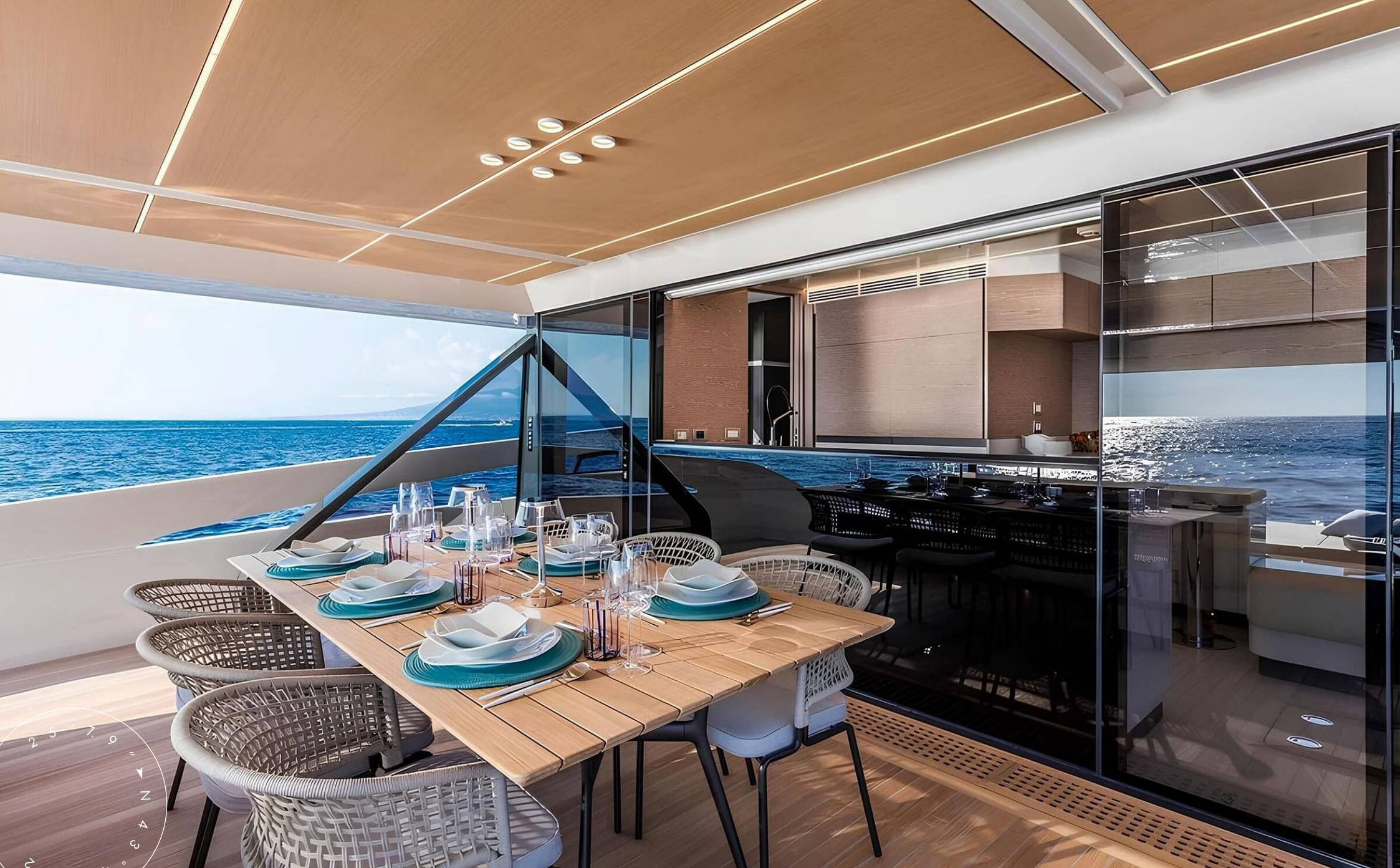
AFT MAIN DECK DINING AREA