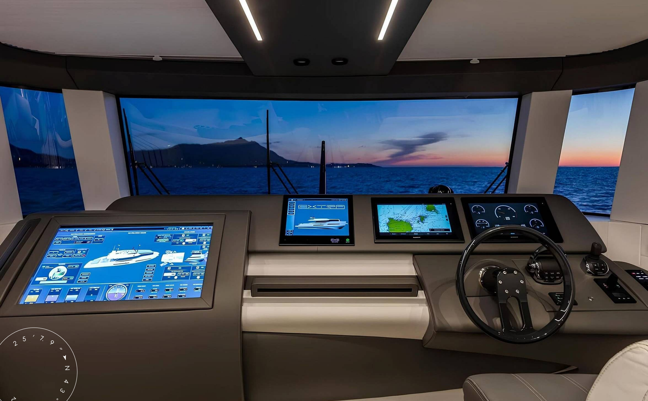
MAIN HELM STATION