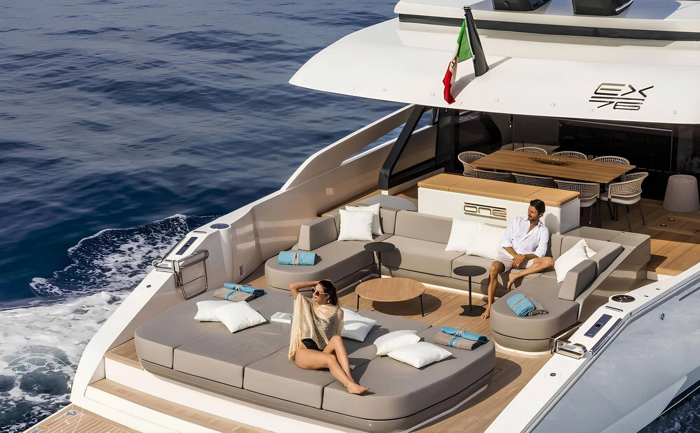
AFT MAIN DECK LOUNGE AREA