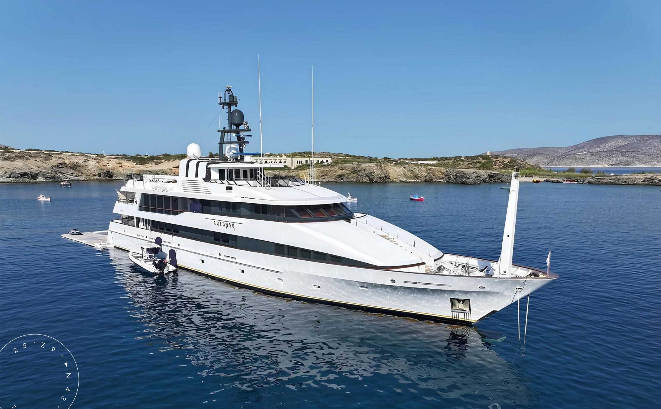
EXTERIOR FEADSHIP 52M 1995 MY PEGASUS