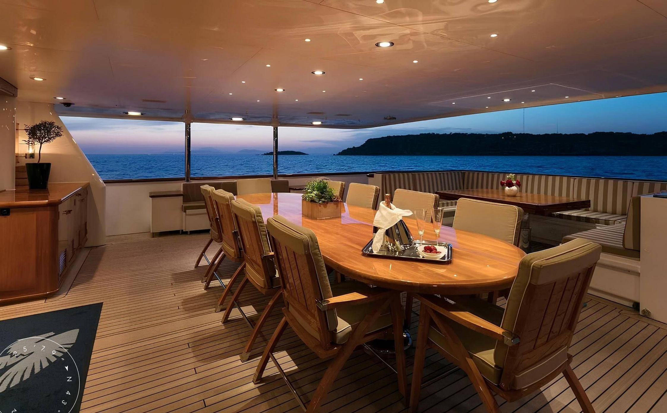
AFT MAIN DECK DINING AREA