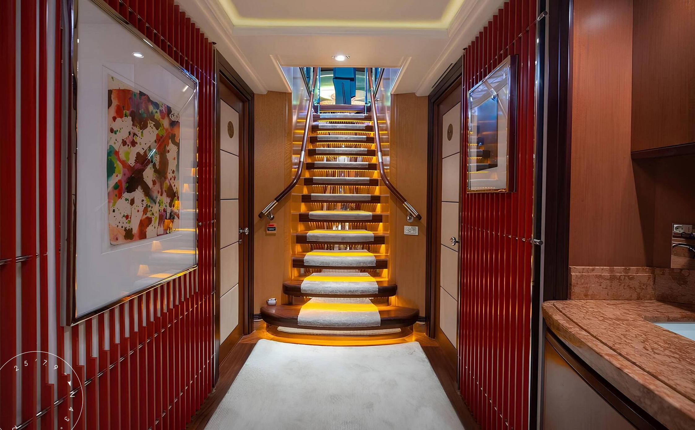
STAIRS FROM MD TO LD