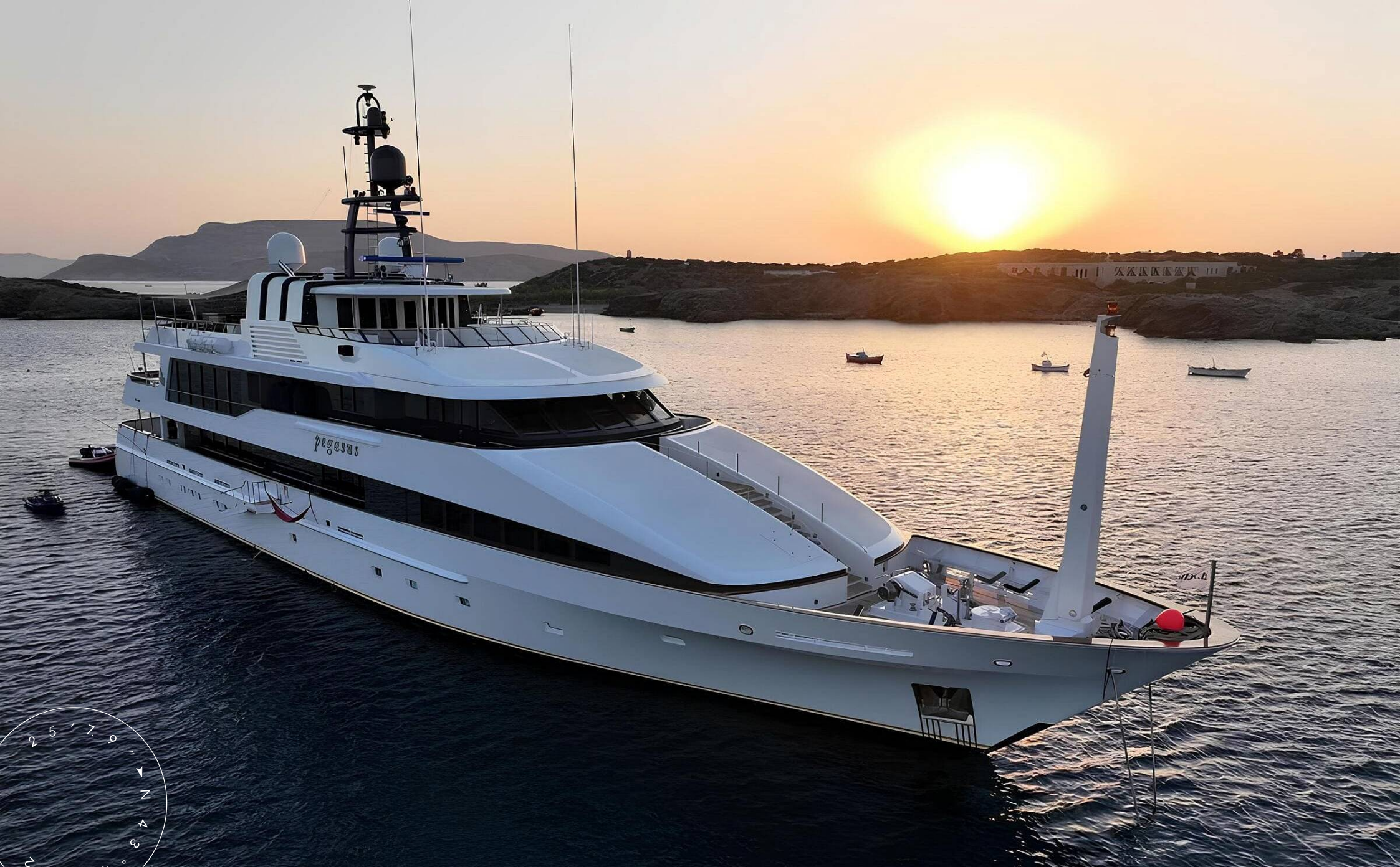
EXTERIOR FEADSHIP 52M 1995 MY PEGASUS