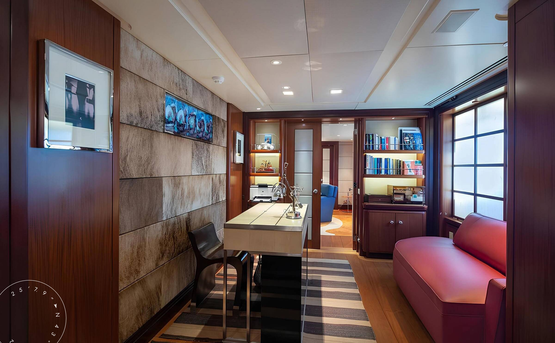
OFFICE IN THE MASTER CABIN