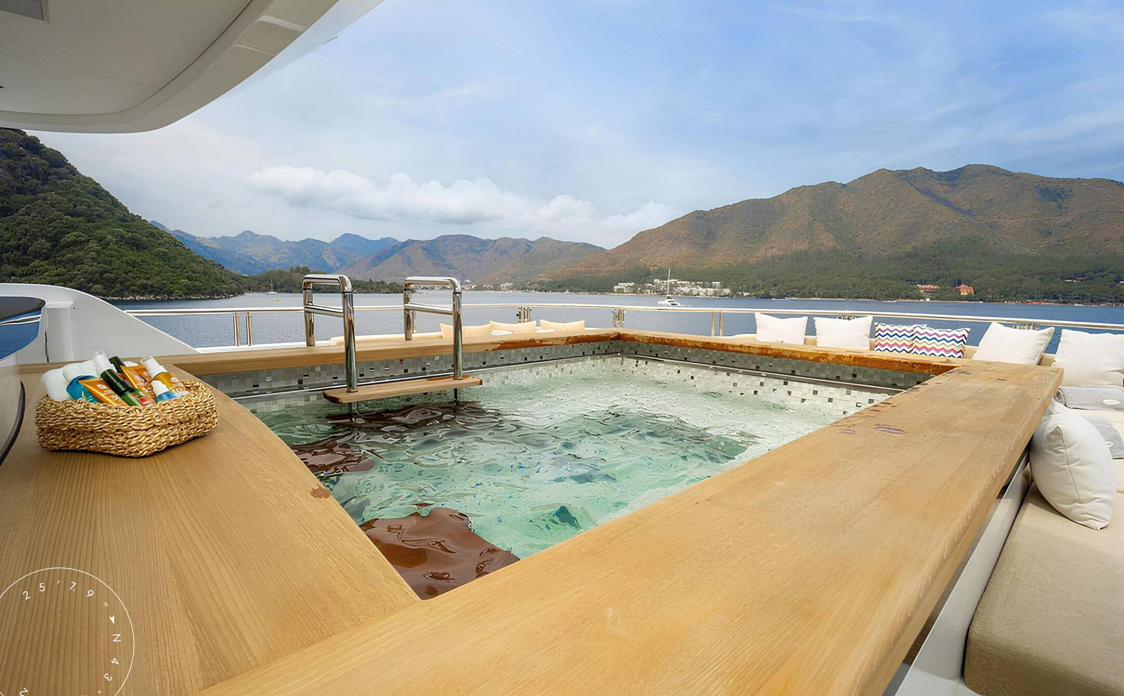
SUNDECK SWIMMING POOL