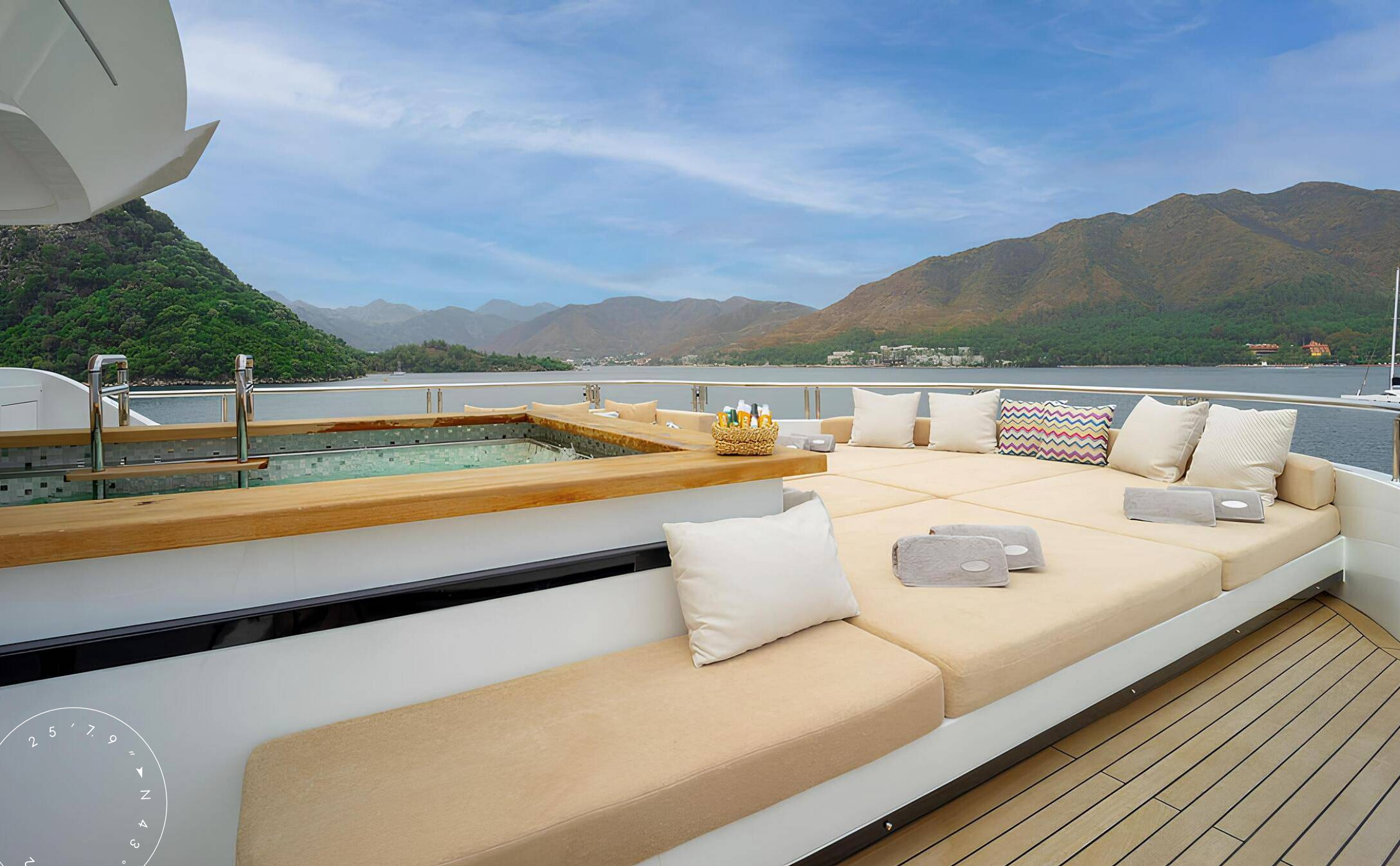
SUNDECK LOUNGE AREA