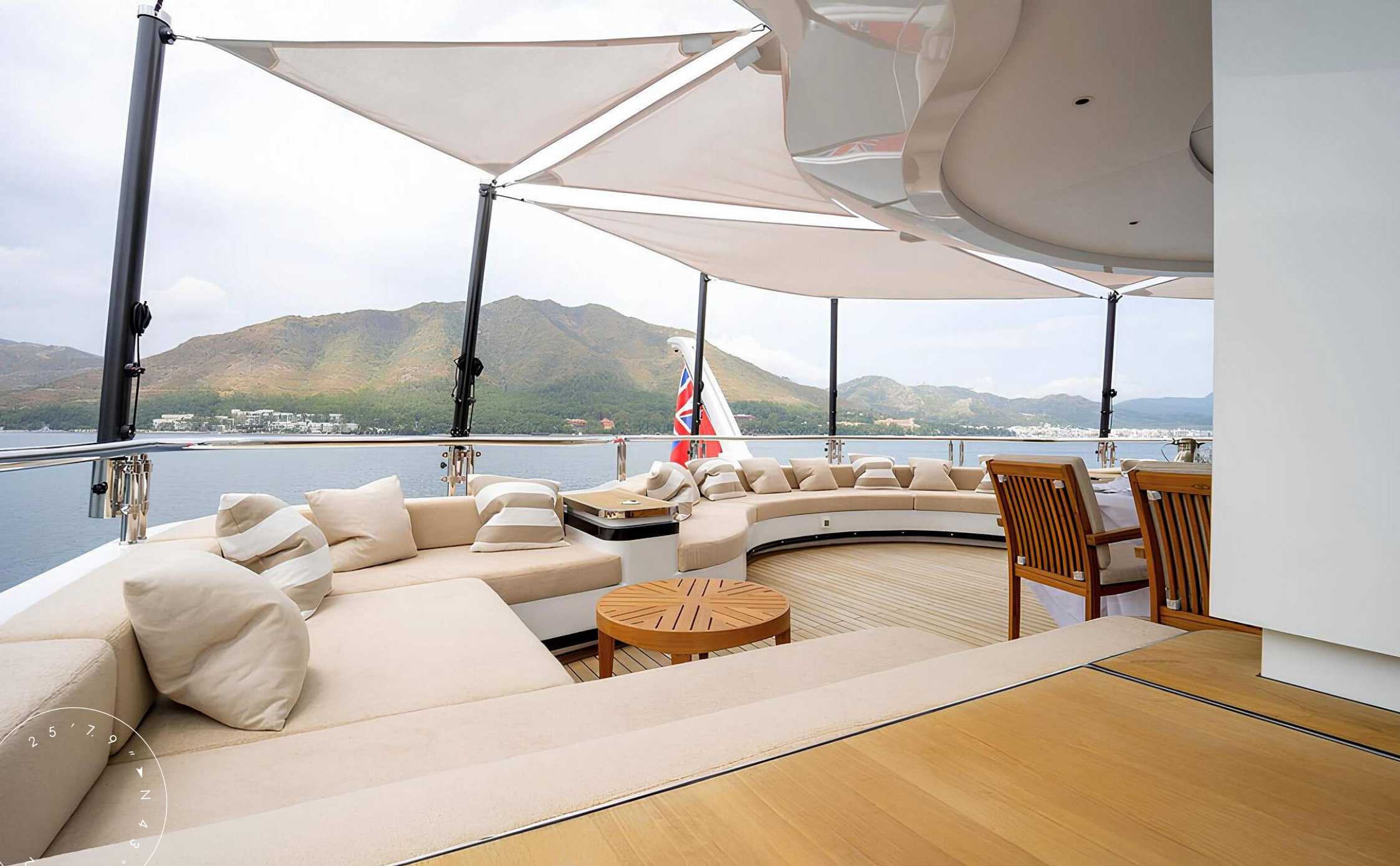
AFT UPPER DECK LOUNGE AREA