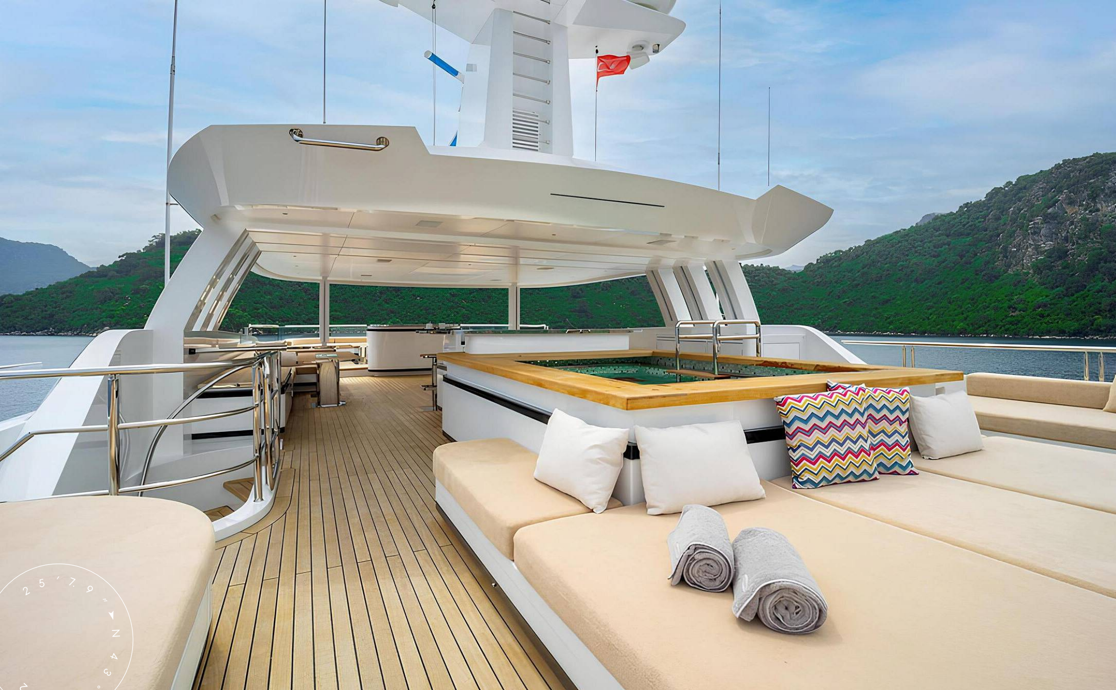
SUNDECK LOUNGE AREA