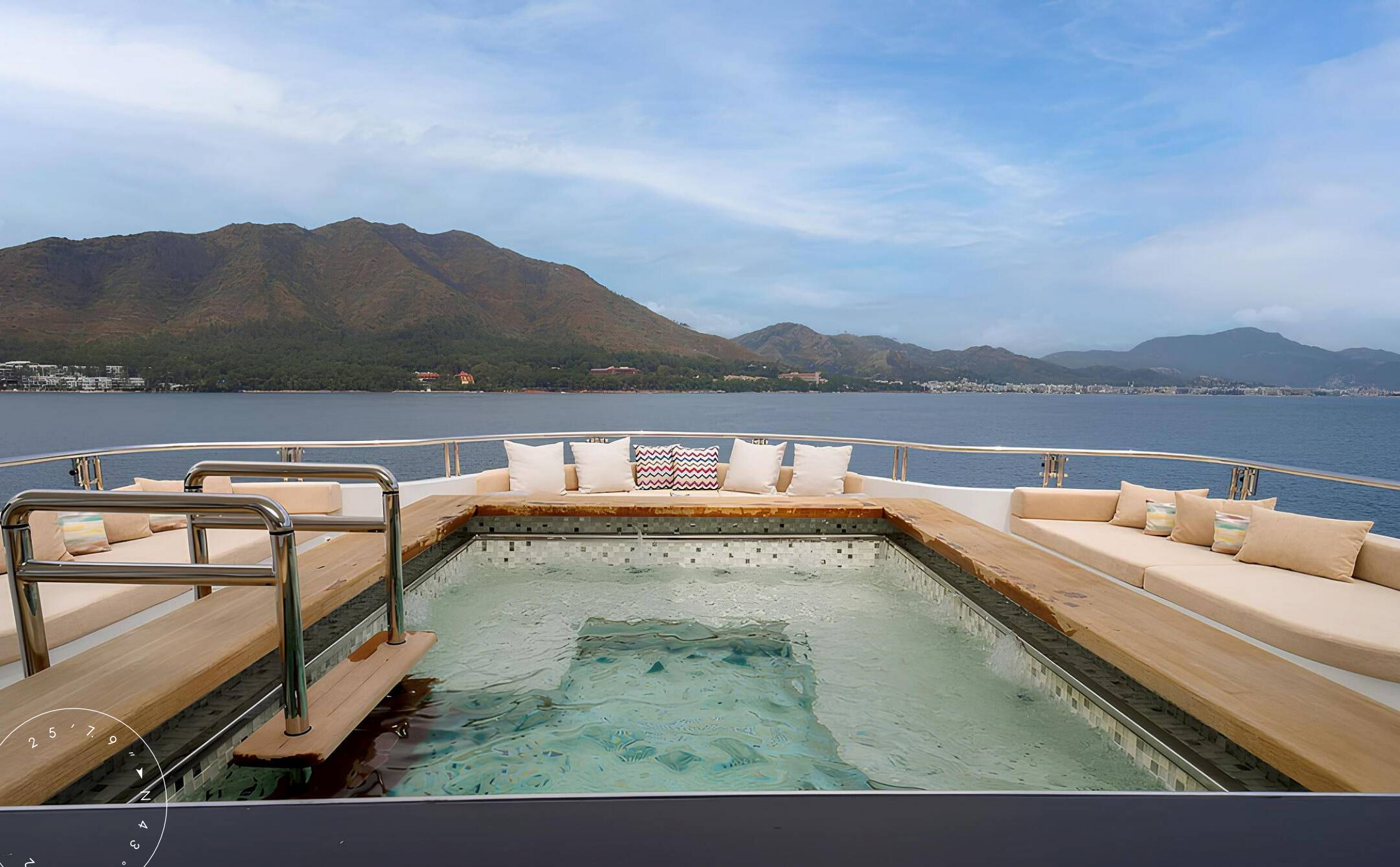
SUNDECK SWIMMING POOL