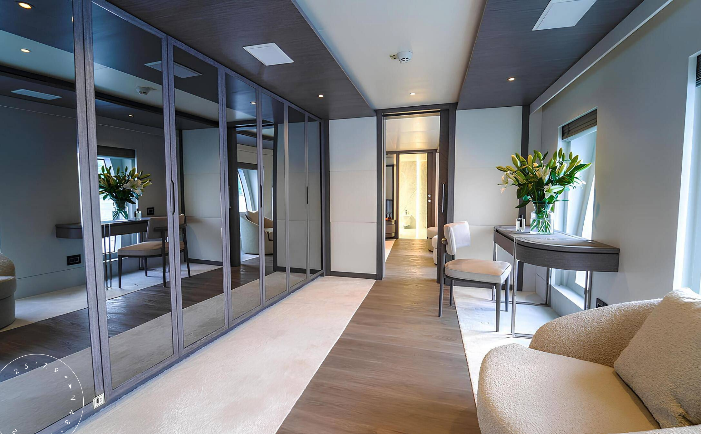
OFFICE IN THE MASTER CABIN