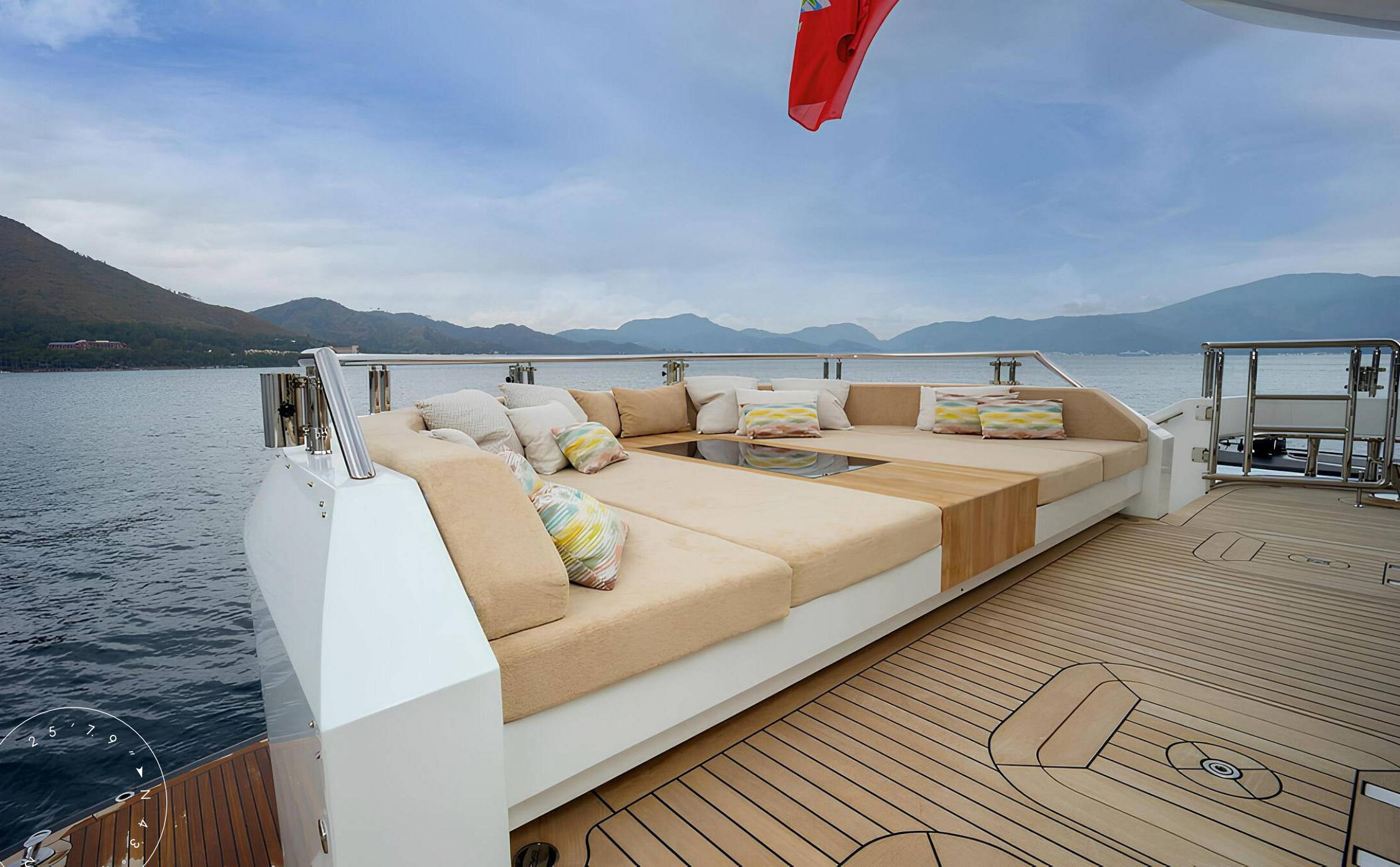
AFT MAIN DECK LOUNGE AREA