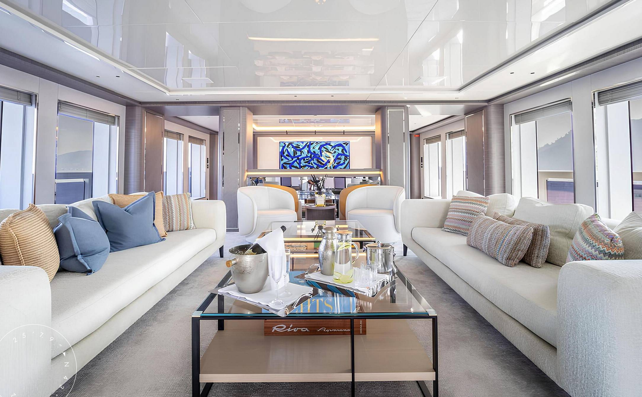
MAIN SALON LOUNGE AREA