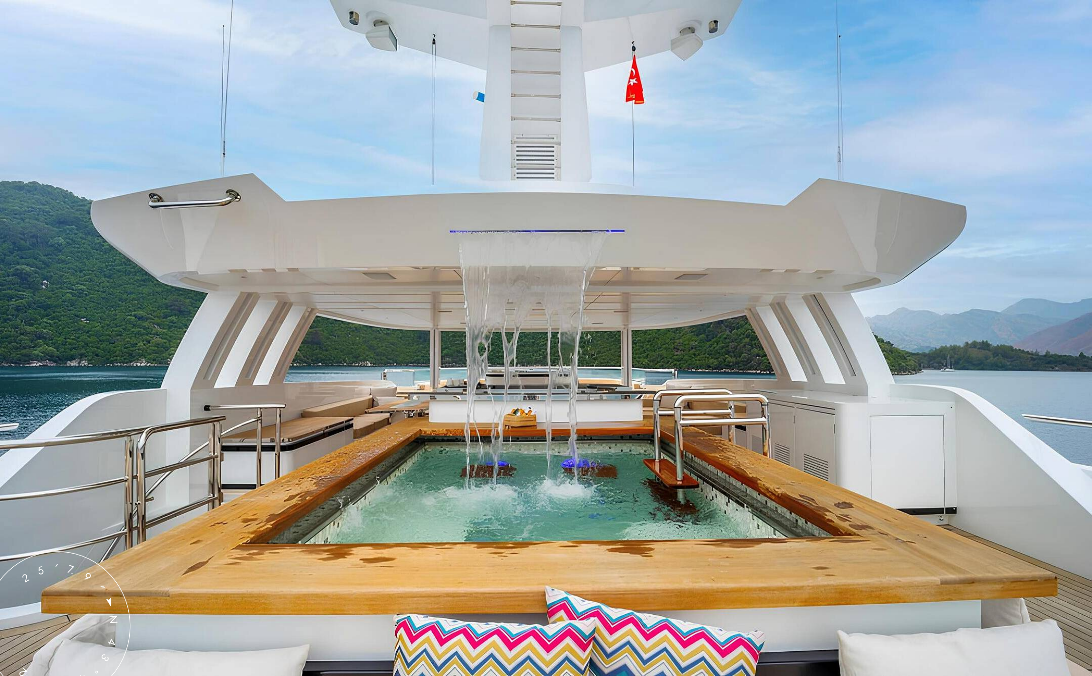
SUNDECK SWIMMING POOL