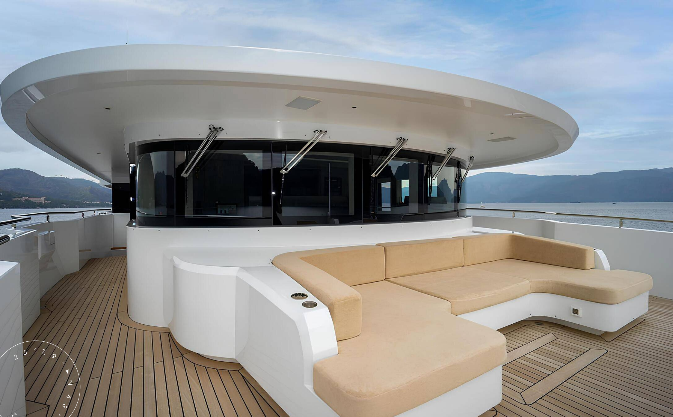
BOW LOUNGE AREA