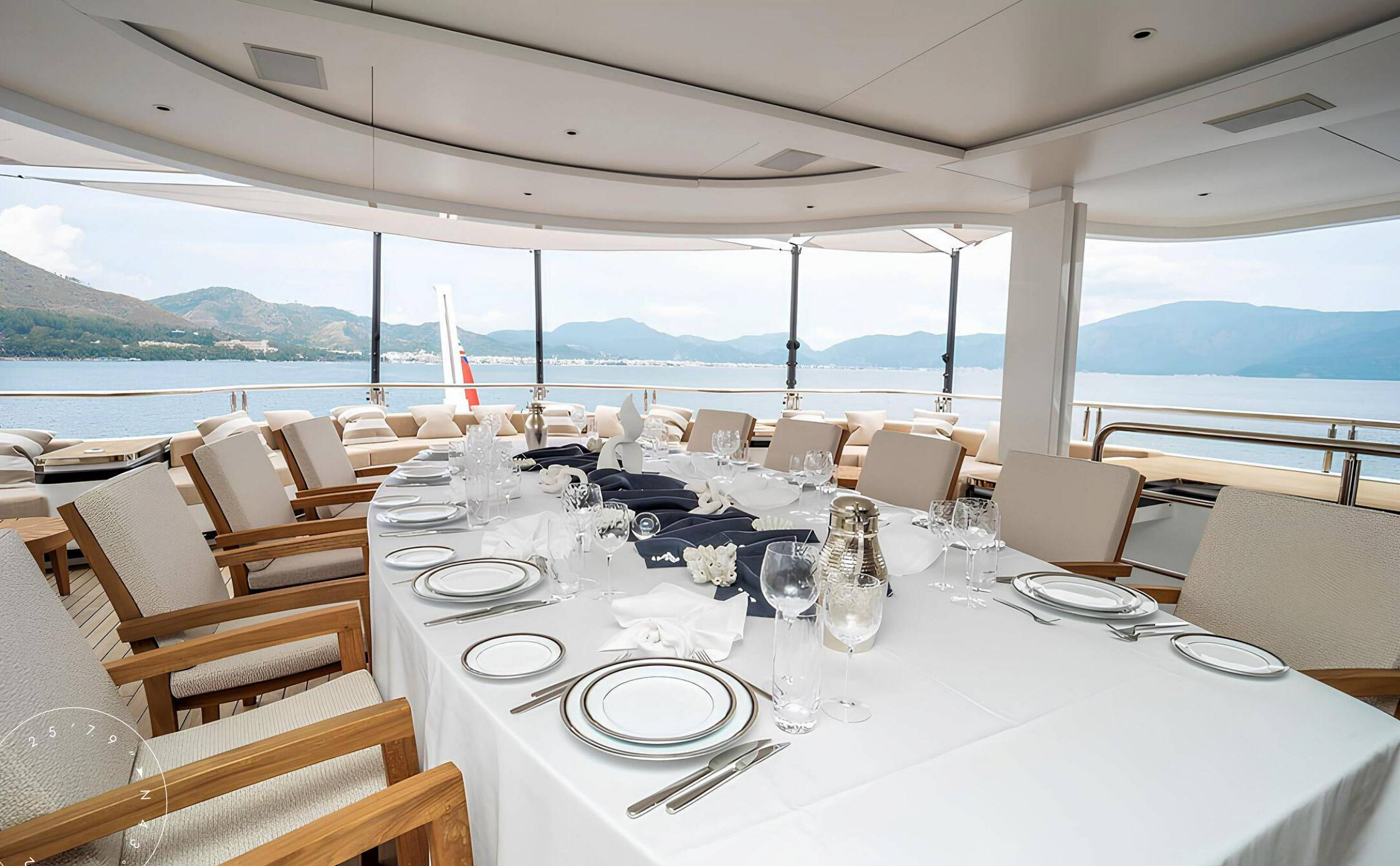
AFT UPPER DECK DINING AREA