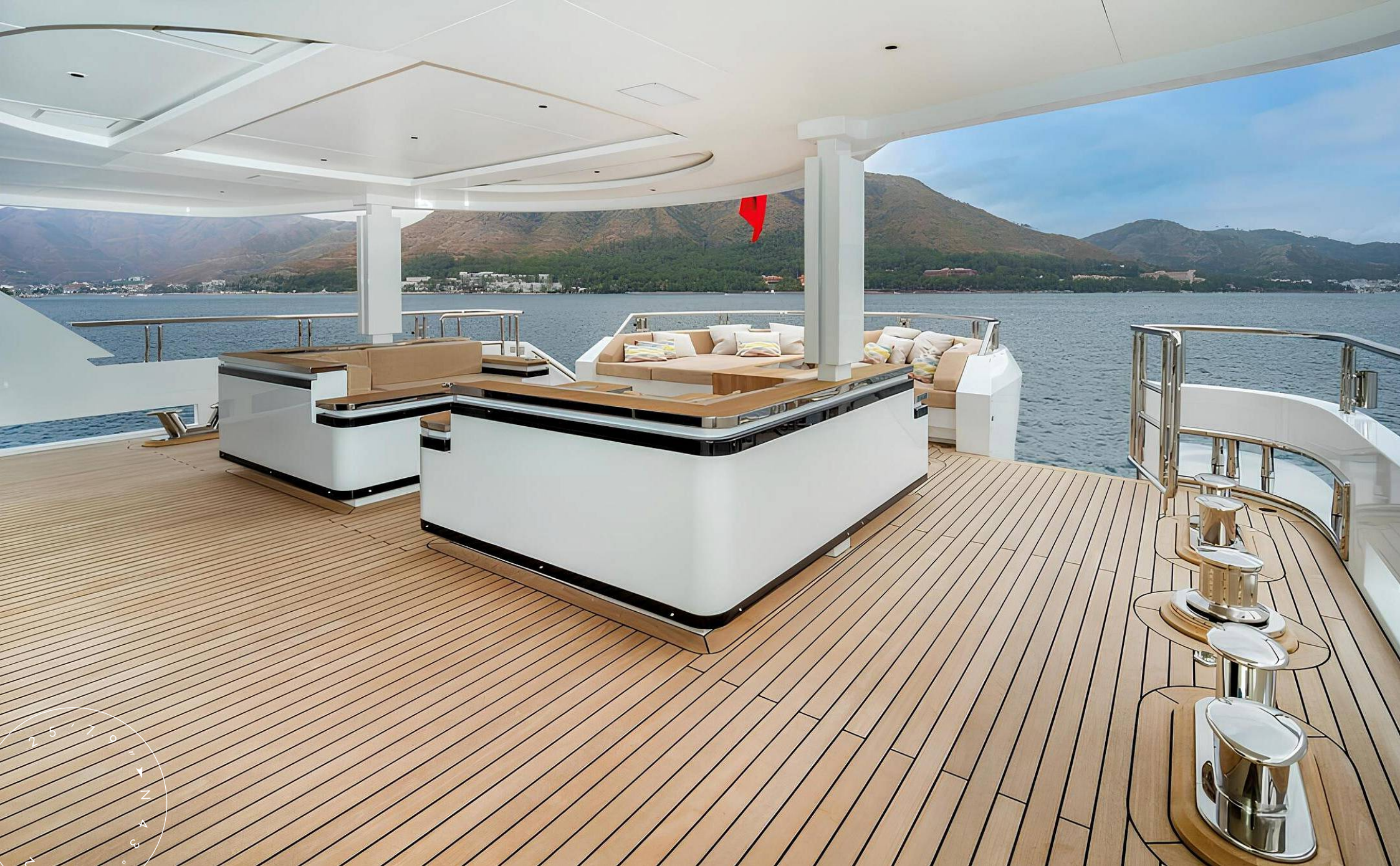
AFT MAIN DECK LOUNGE AREA