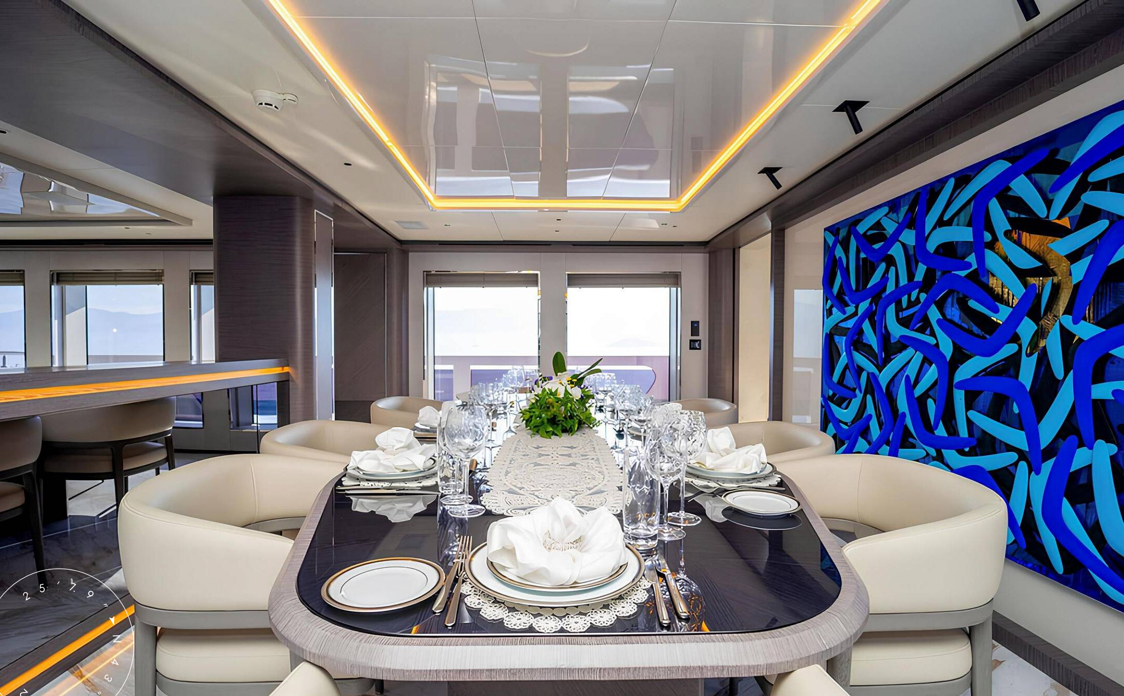
MAIN SALON DINING AREA