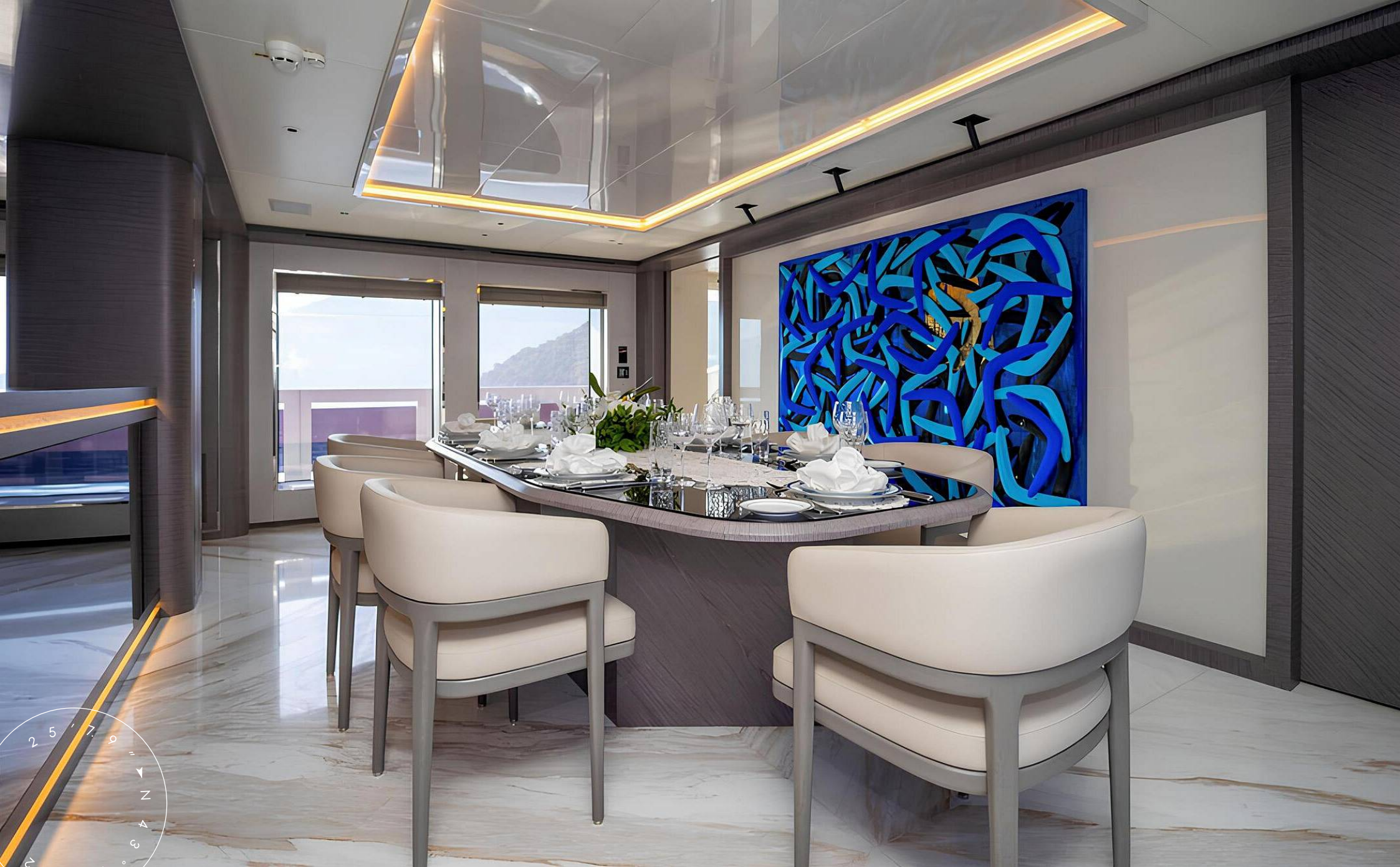
MAIN SALON DINING AREA