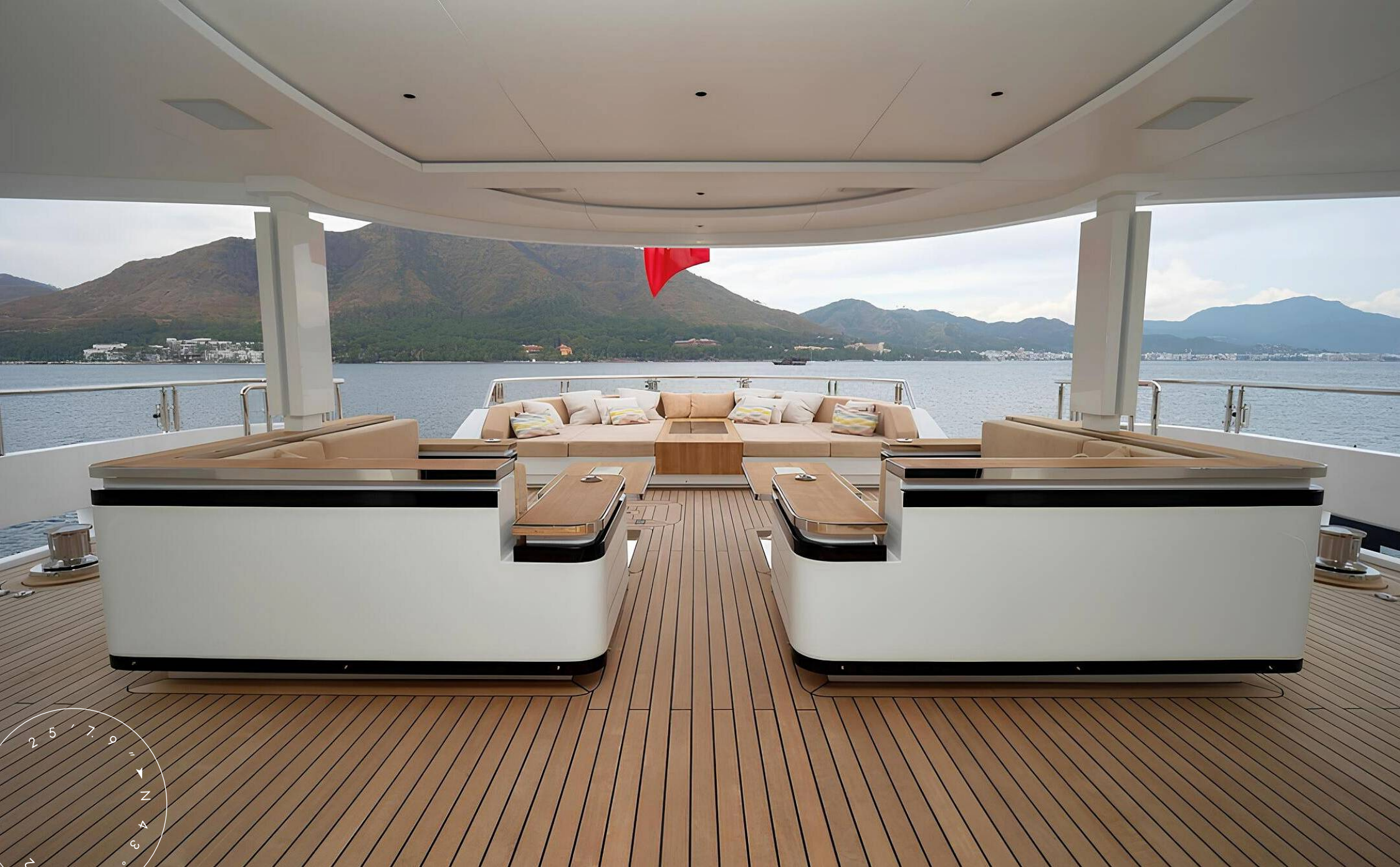
AFT MAIN DECK LOUNGE AREA