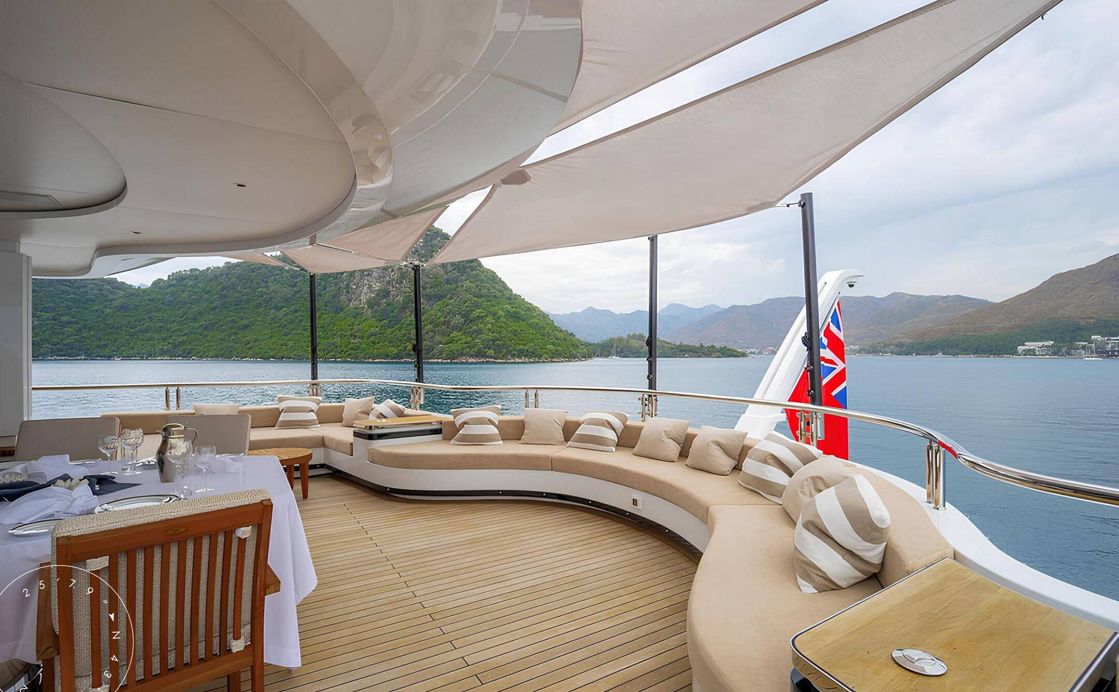
AFT UPPER DECK LOUNGE AREA