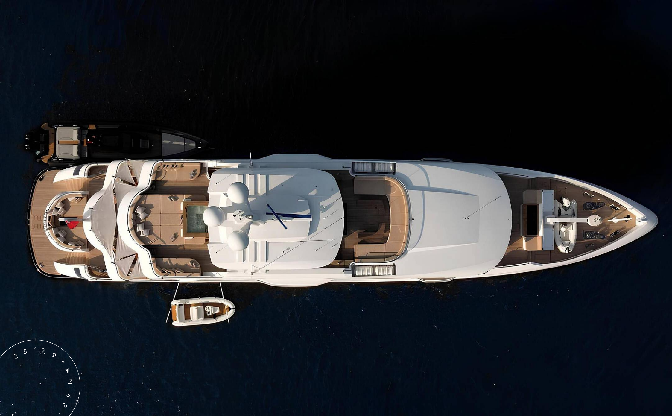
EXTERIOR CMB YACHTS 47M 2022 MY FORTUNA