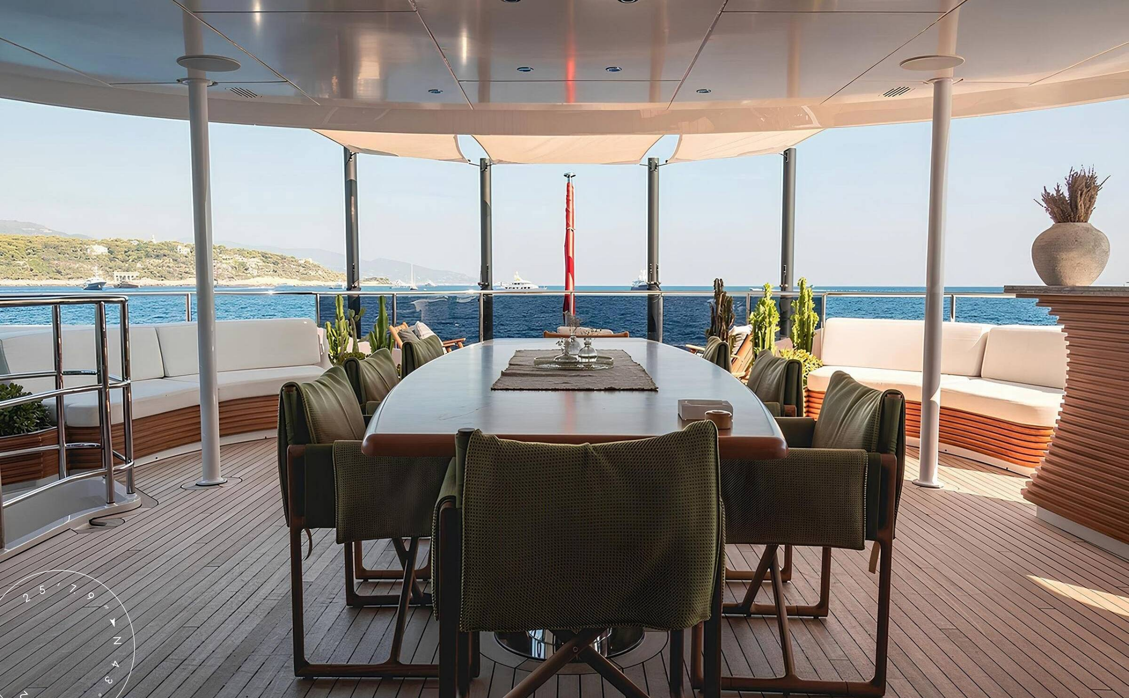
AFT UPPER DECK DINING AREA