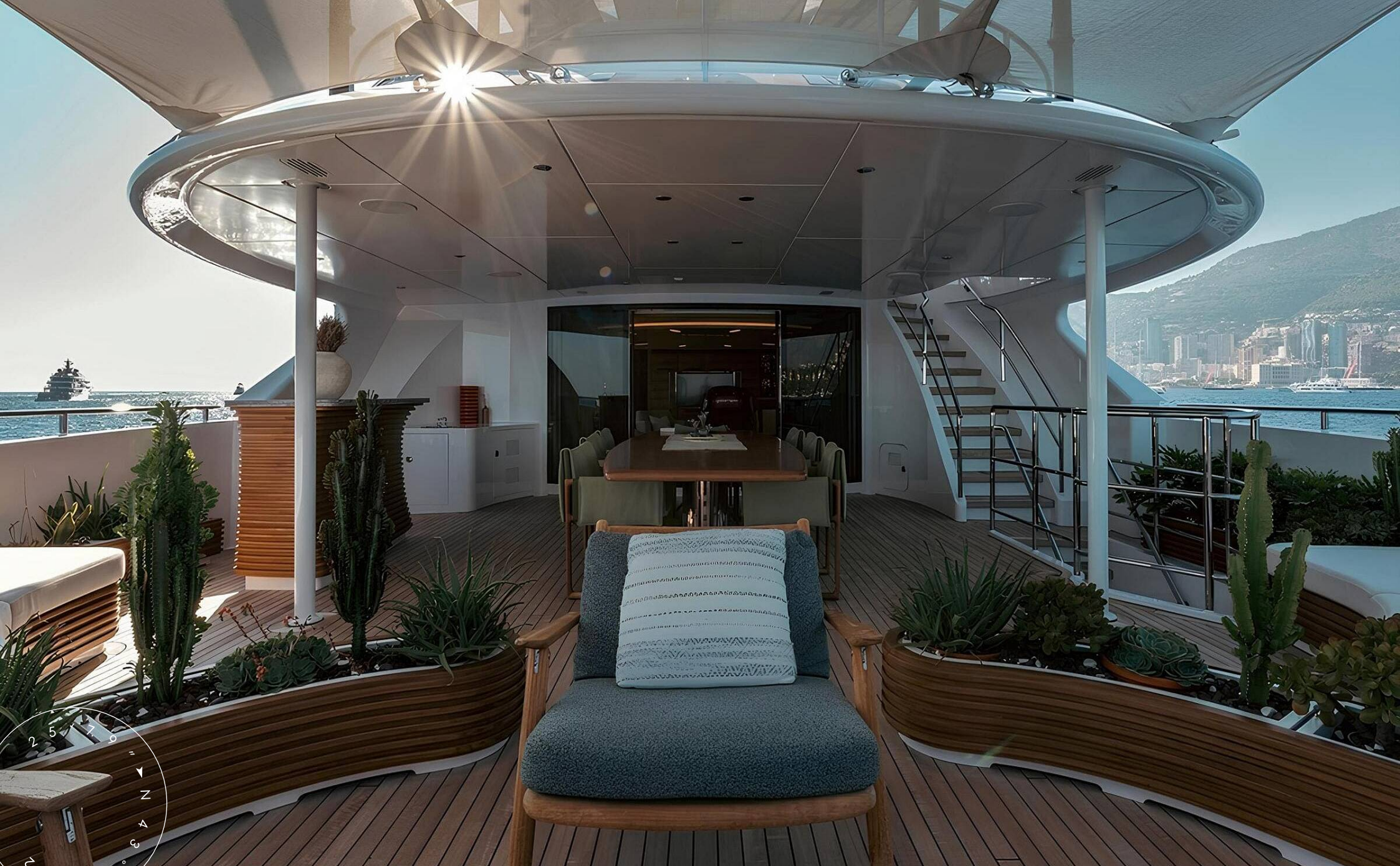
AFT UPPER DECK DINING AREA