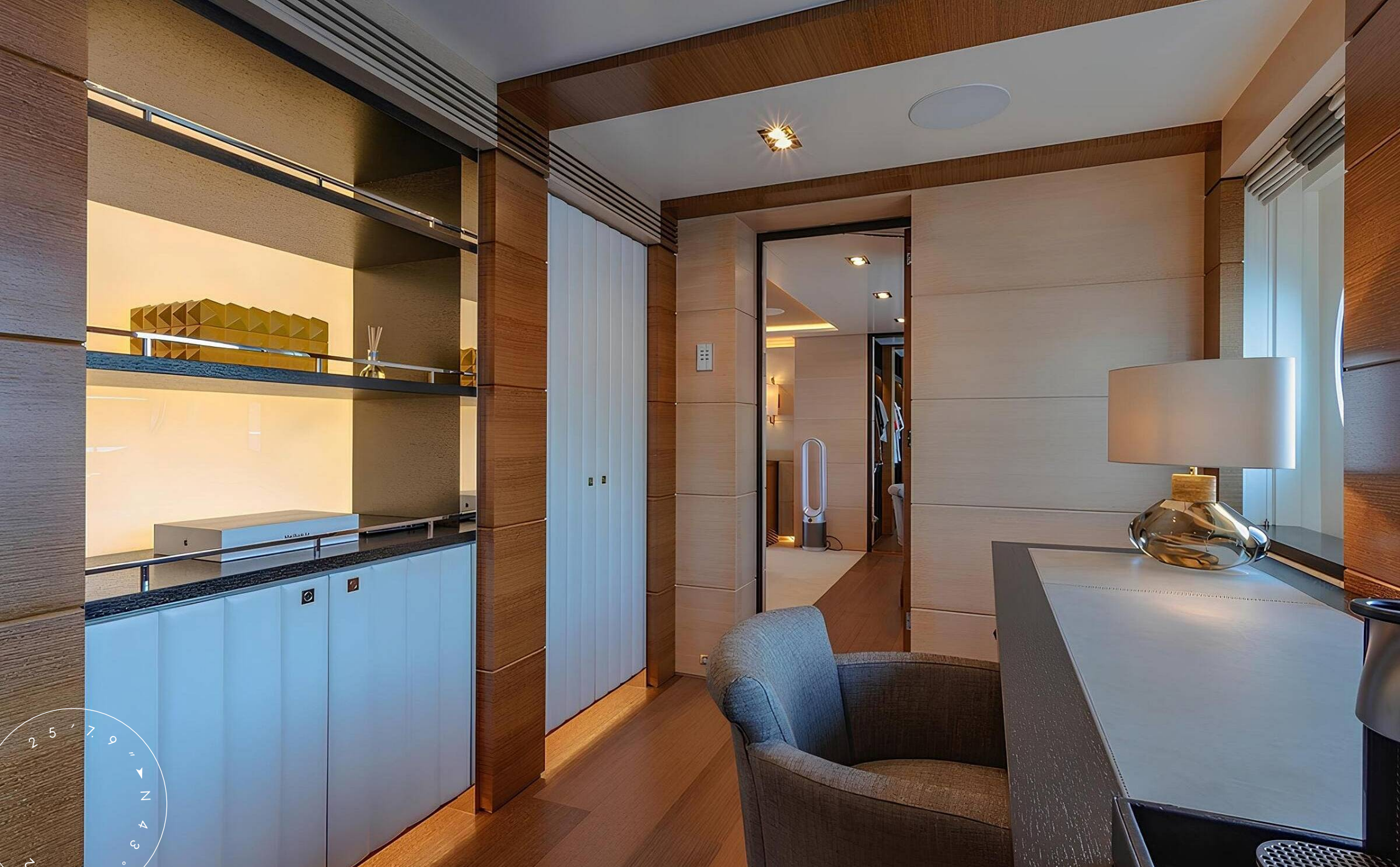
OFFICE IN THE MASTER CABIN