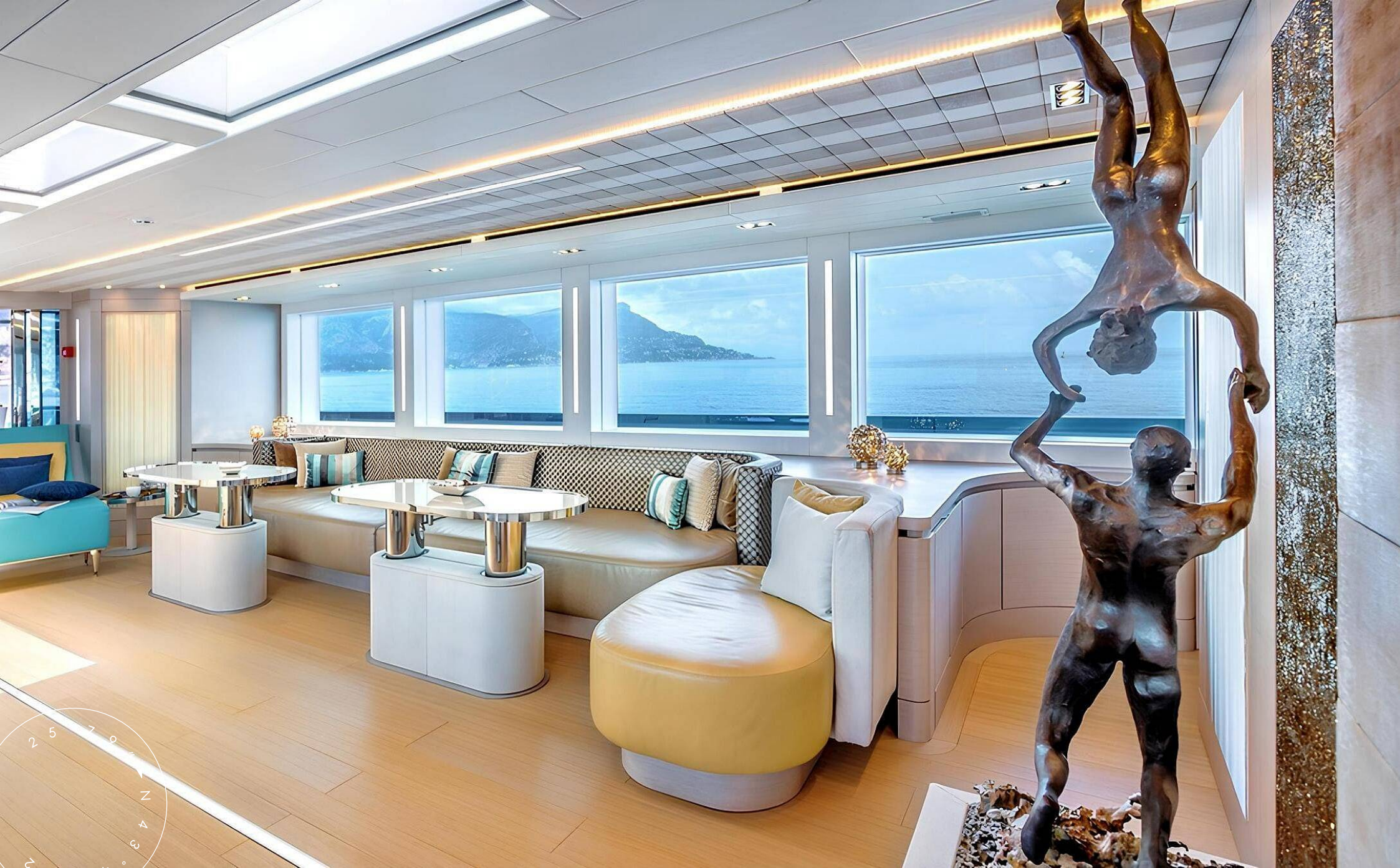
MAIN SALON LOUNGE AREA