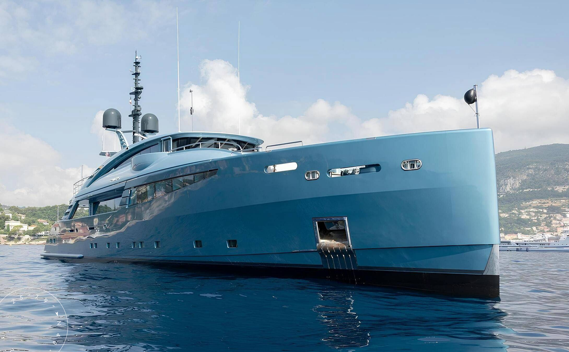
EXTERIOR ISA 43M 2014 MY QUEEN ALLA