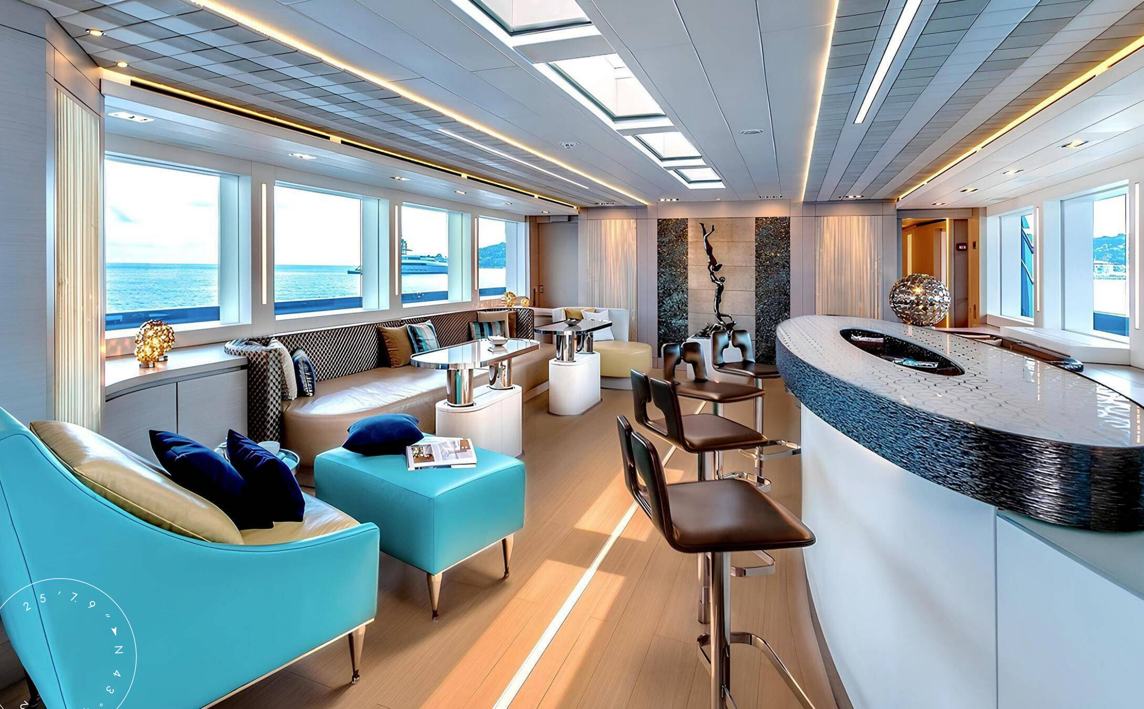
UPPER DECK SALOON