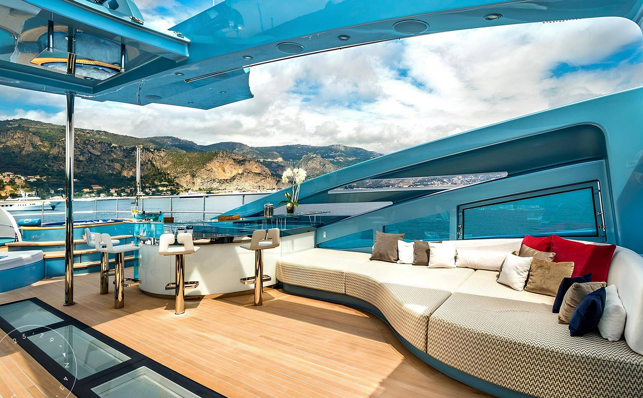
AFT UPPER DECK LOUNGE AREA