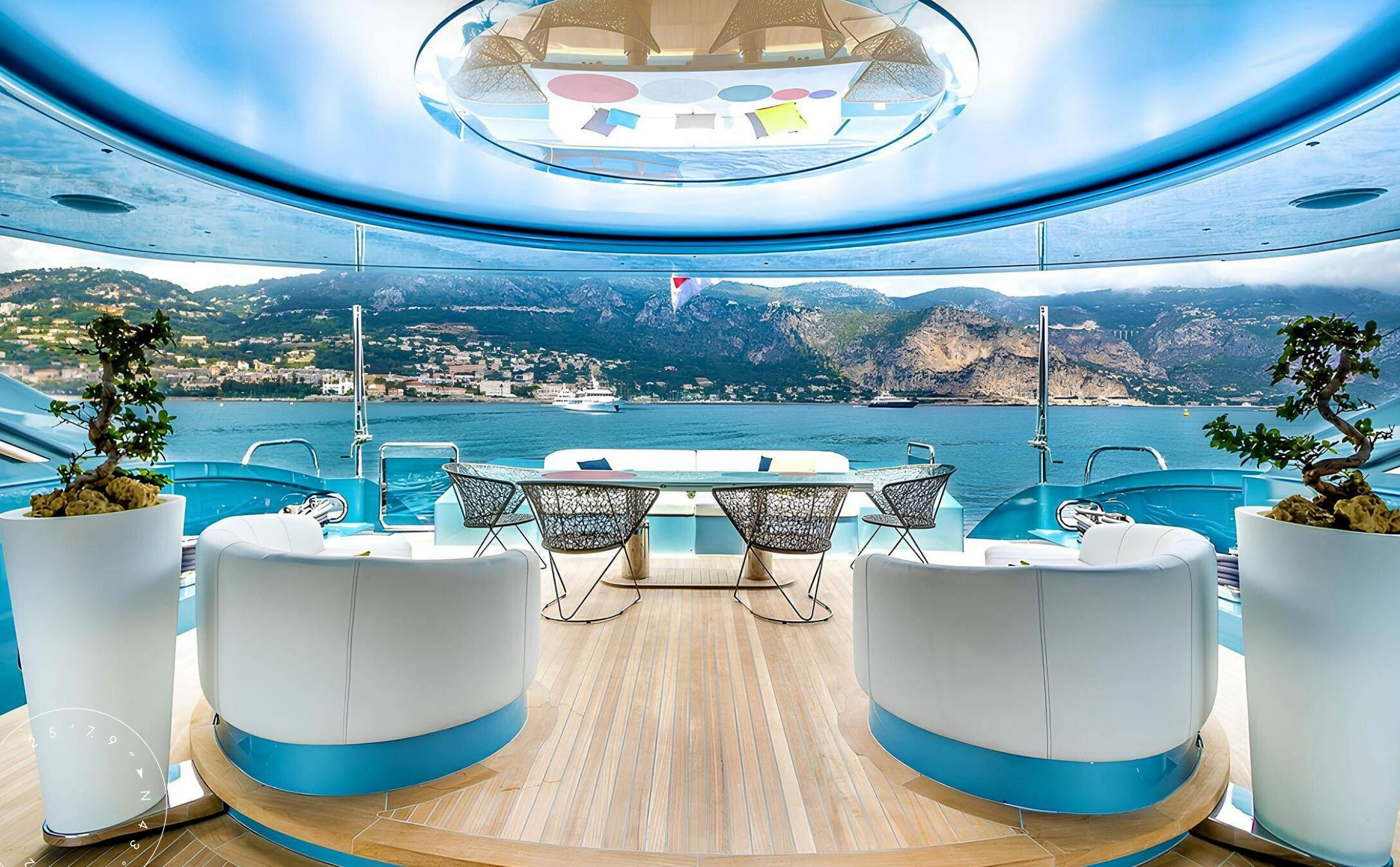
AFT MAIN DECK DINING AREA