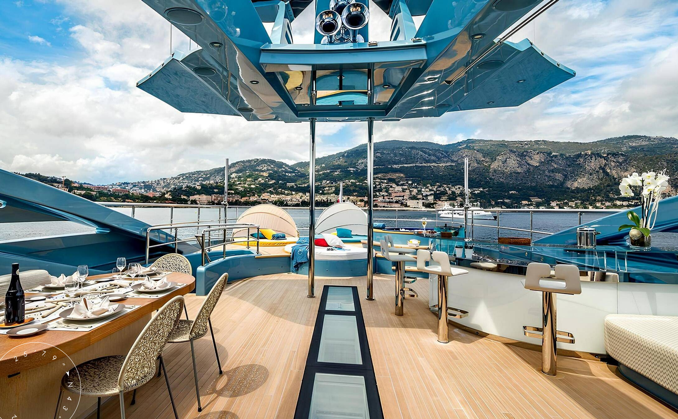
AFT UPPER DECK LOUNGE AREA