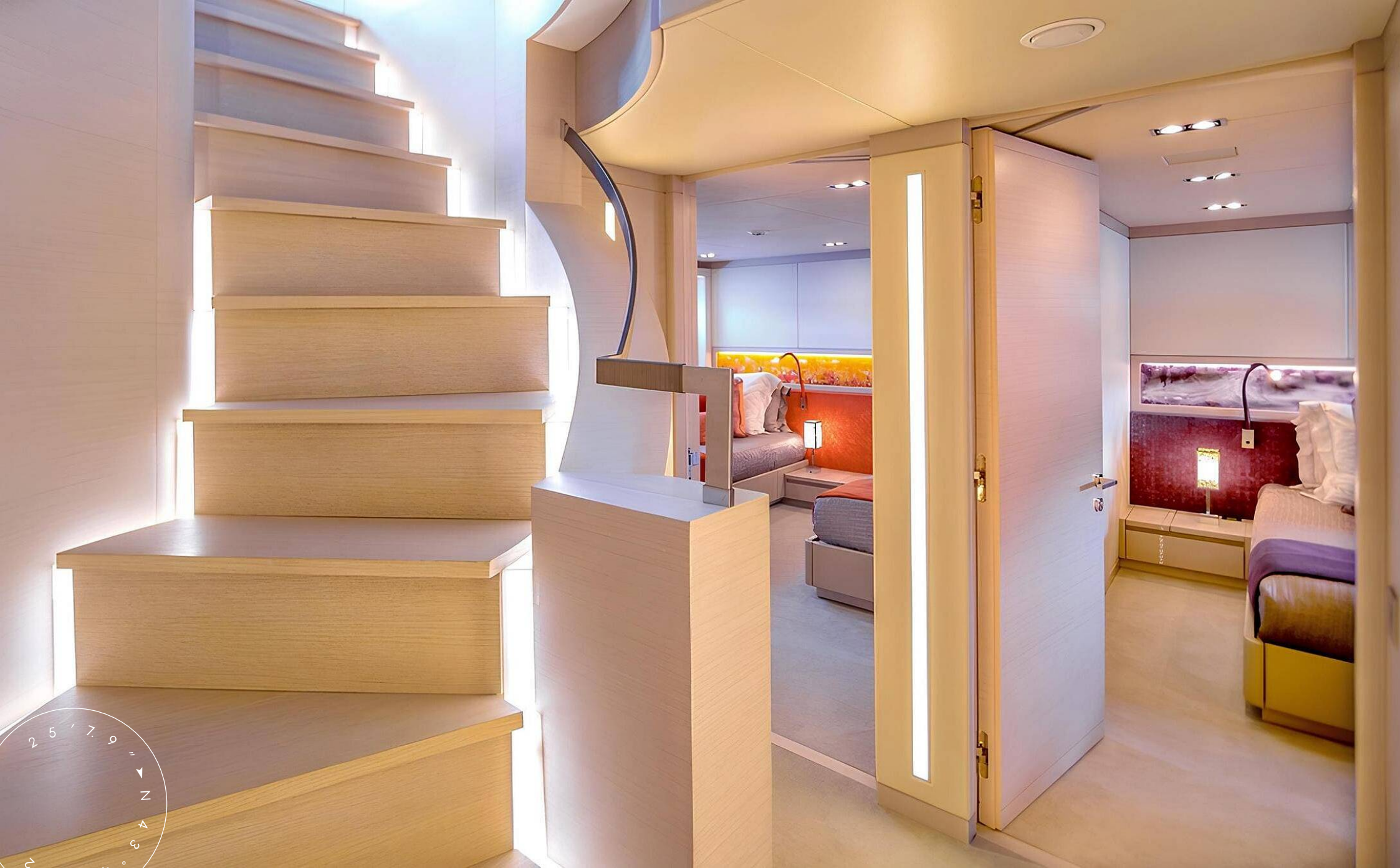
STAIRS FROM MD TO LD