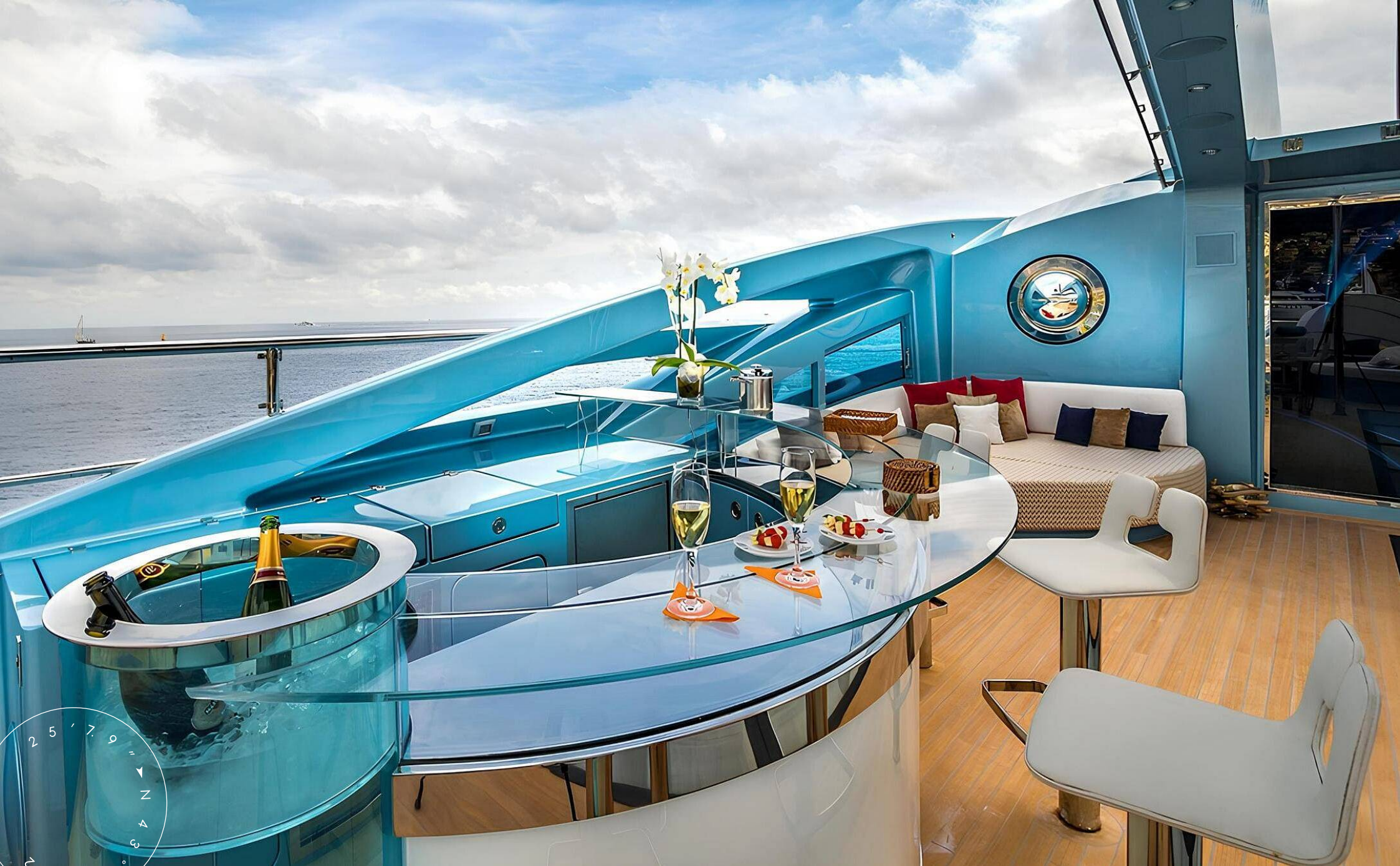
AFT UPPER DECK BAR