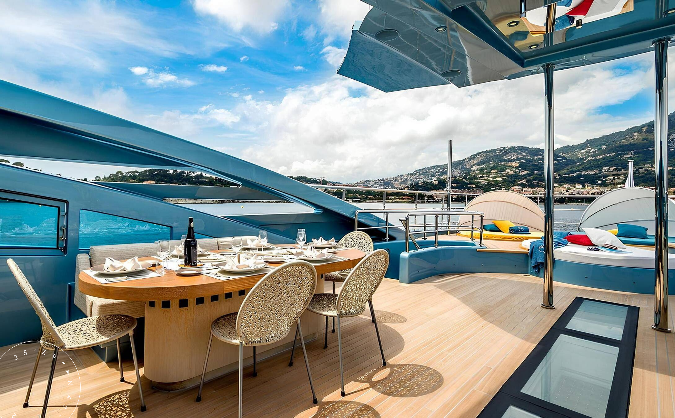
AFT UPPER DECK DINING AREA