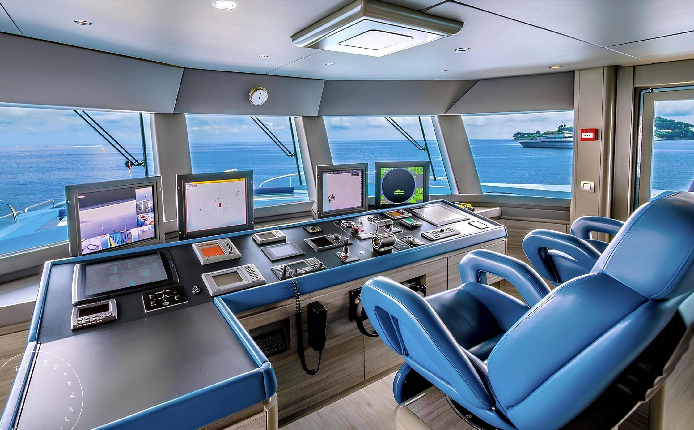
MAIN HELM STATION