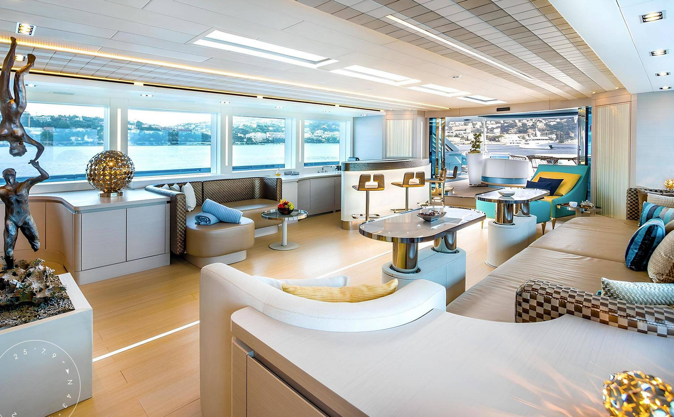
MAIN SALON LOUNGE AREA