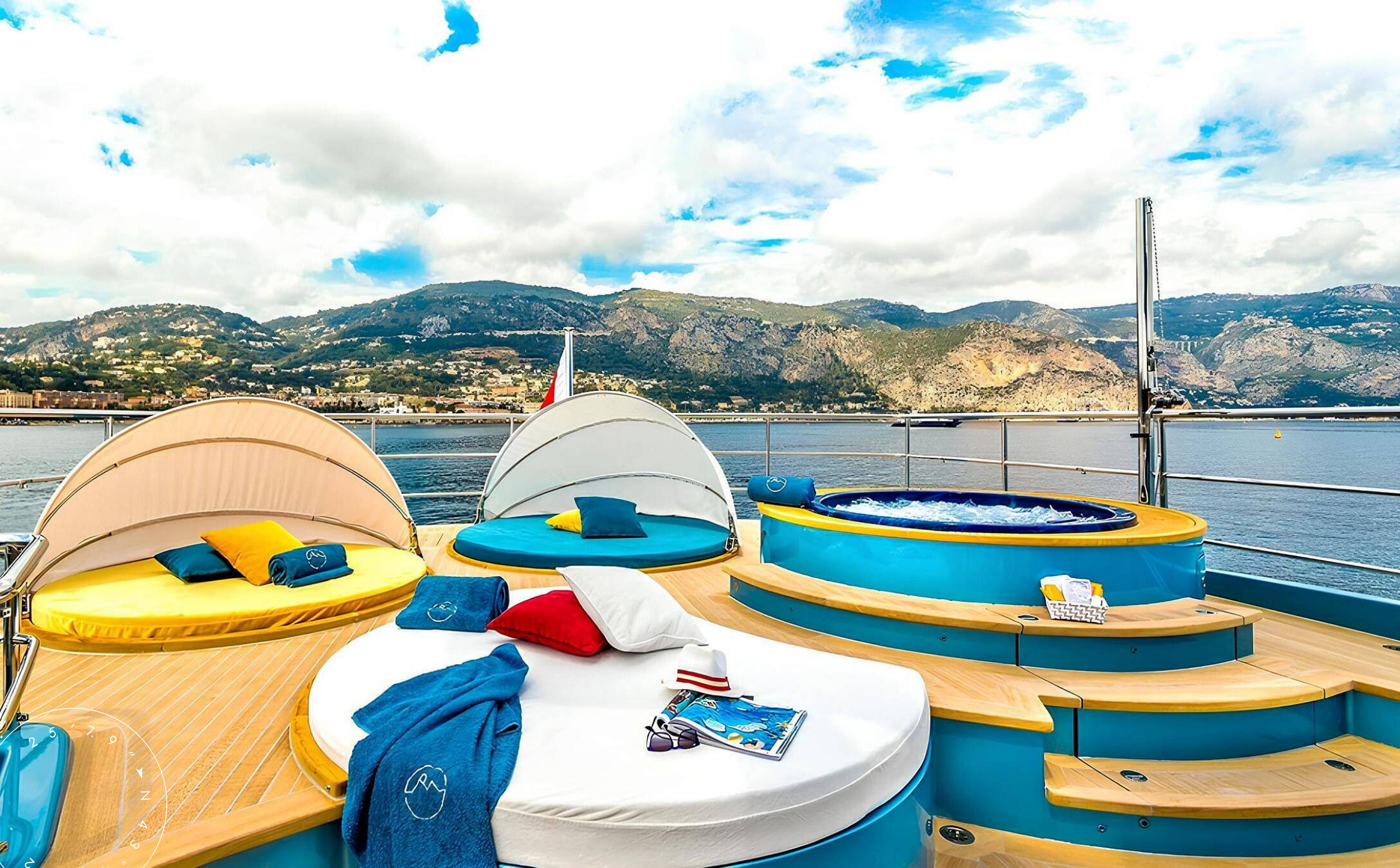
AFT UPPER DECK LOUNGE AREA