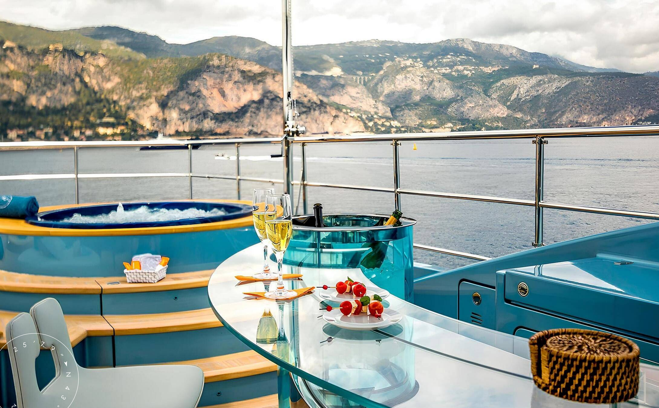
AFT UPPER DECK LOUNGE AREA