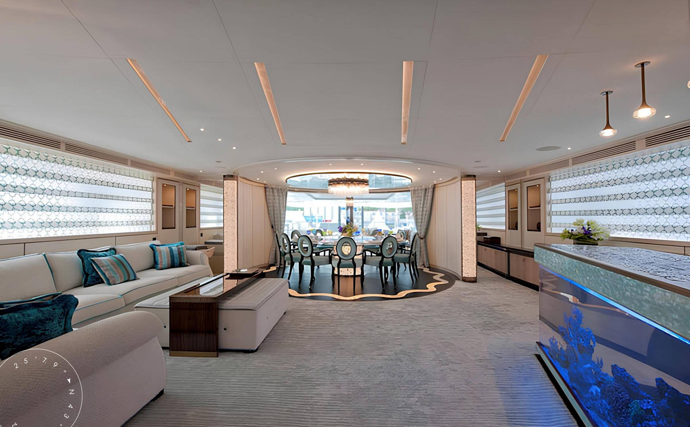
MAIN SALON LOUNGE AREA