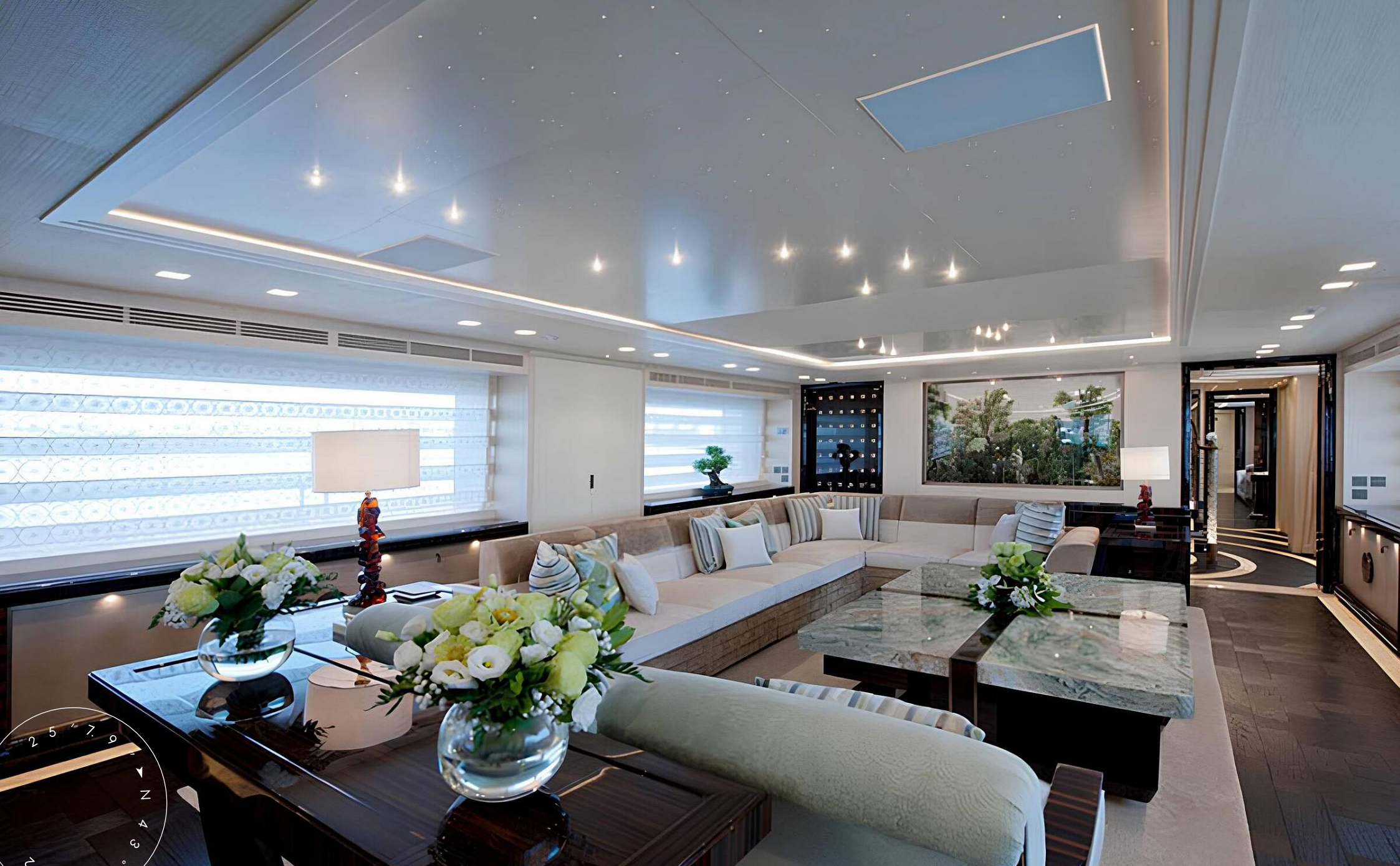
UPPER DECK SALOON