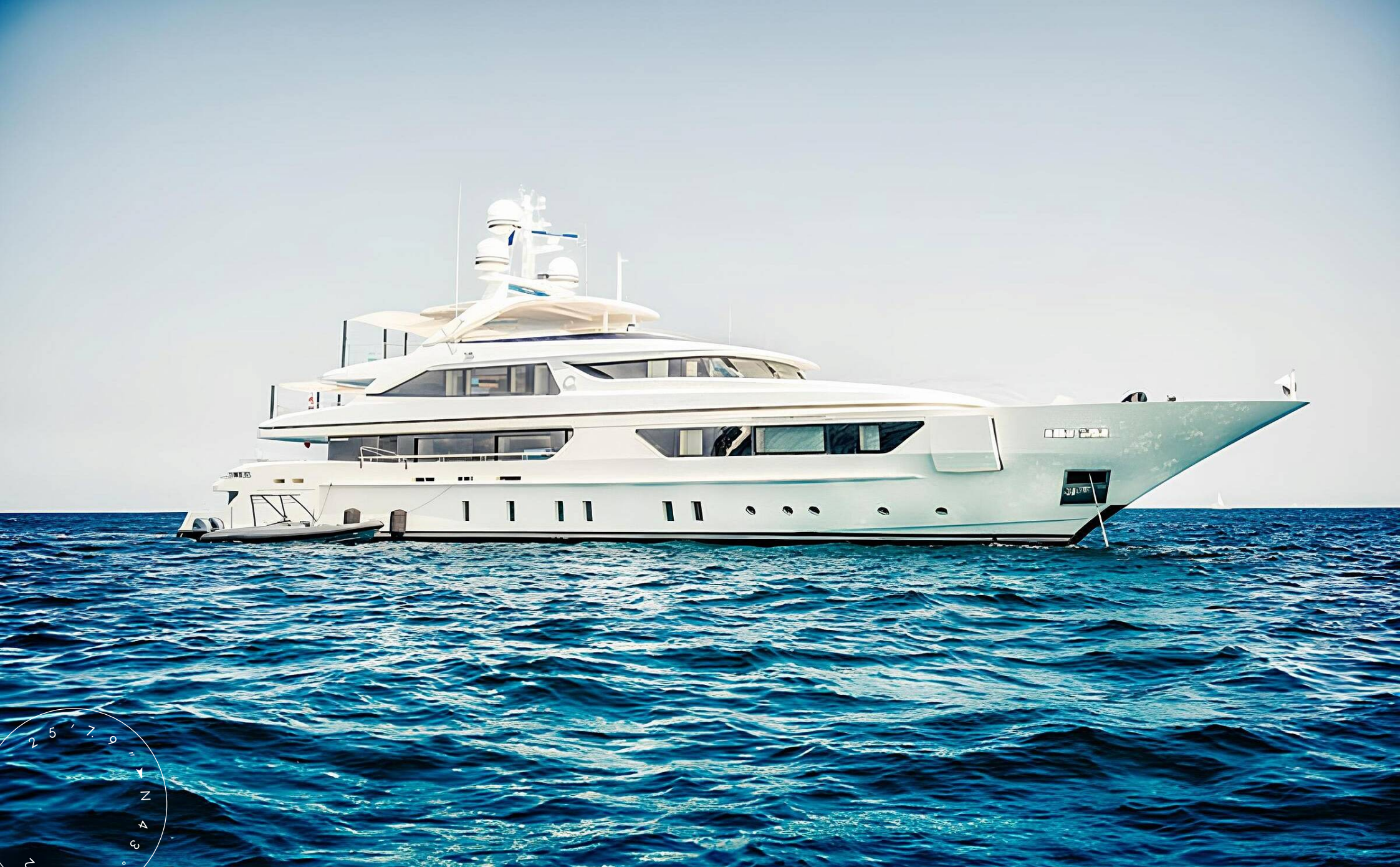
EXTERIOR SANLORENZO SL46 2015 MY SCORPION