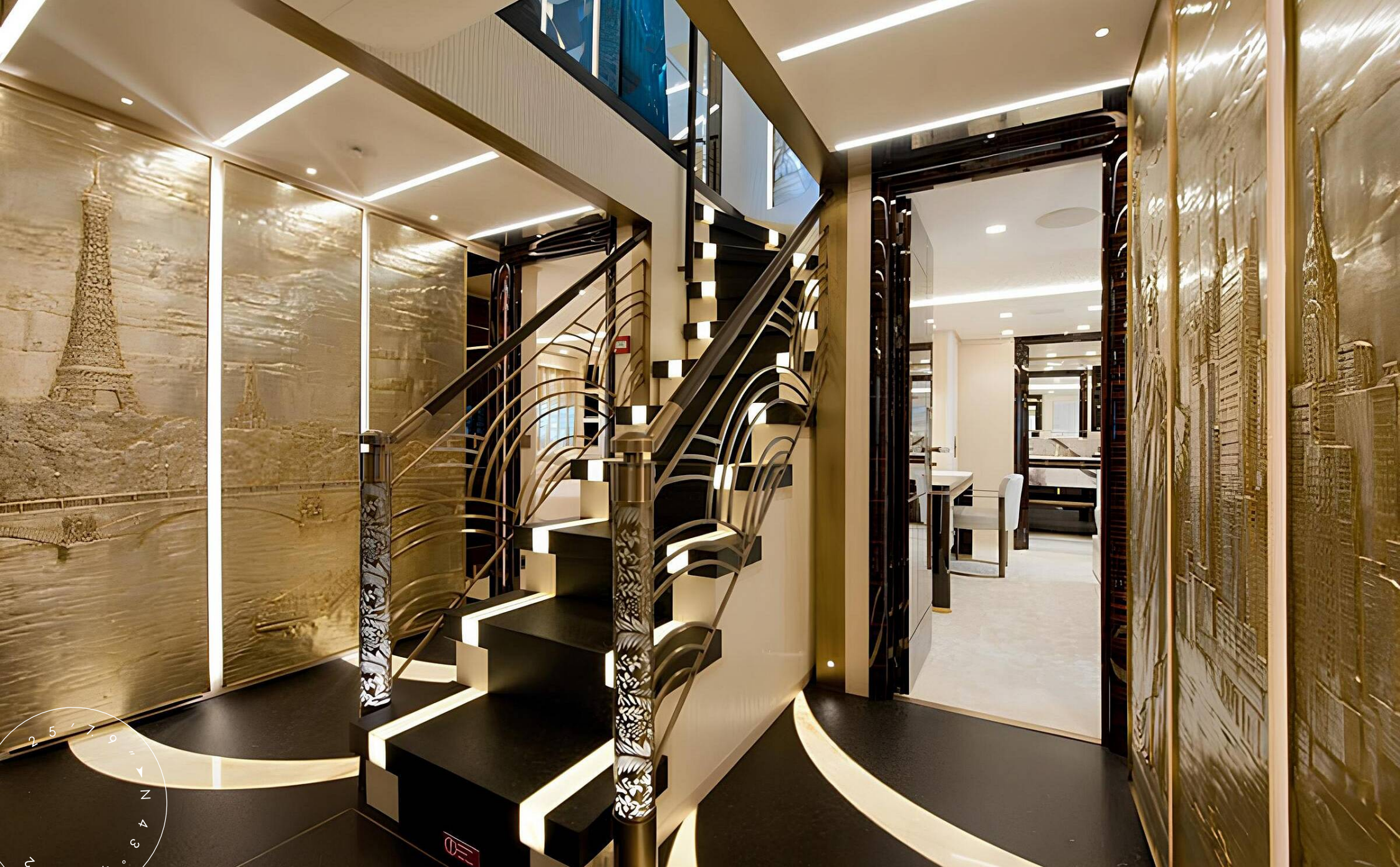
STAIRS FROM MD TO LD