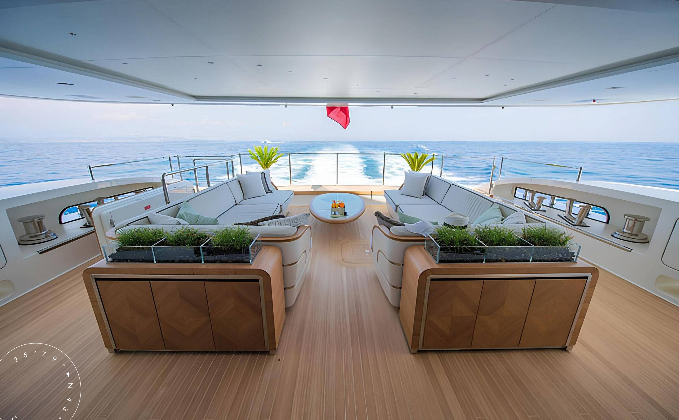
AFT MAIN DECK LOUNGE AREA