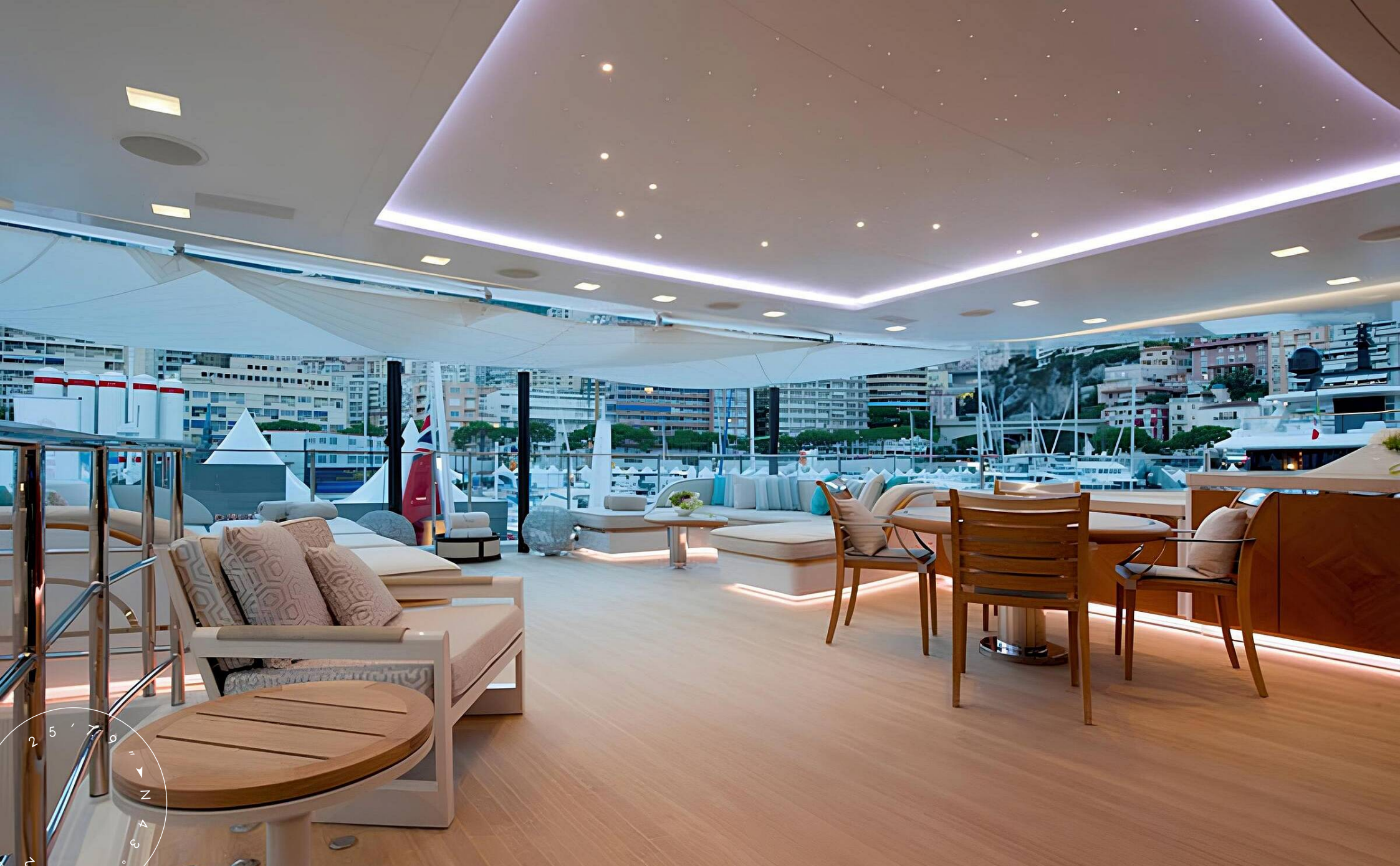
AFT UPPER DECK LOUNGE AREA