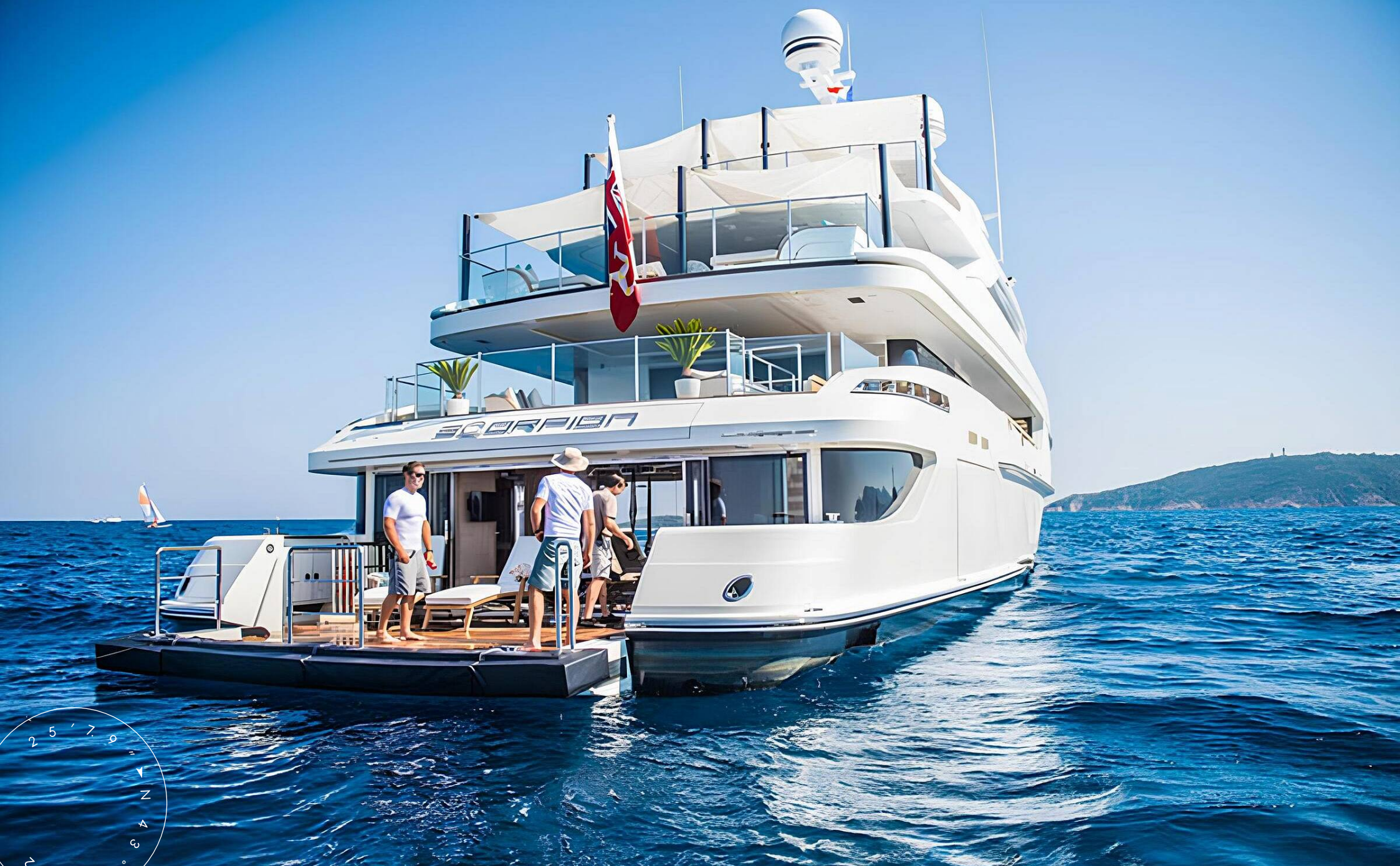
EXTERIOR SANLORENZO SL46 2015 MY SCORPION