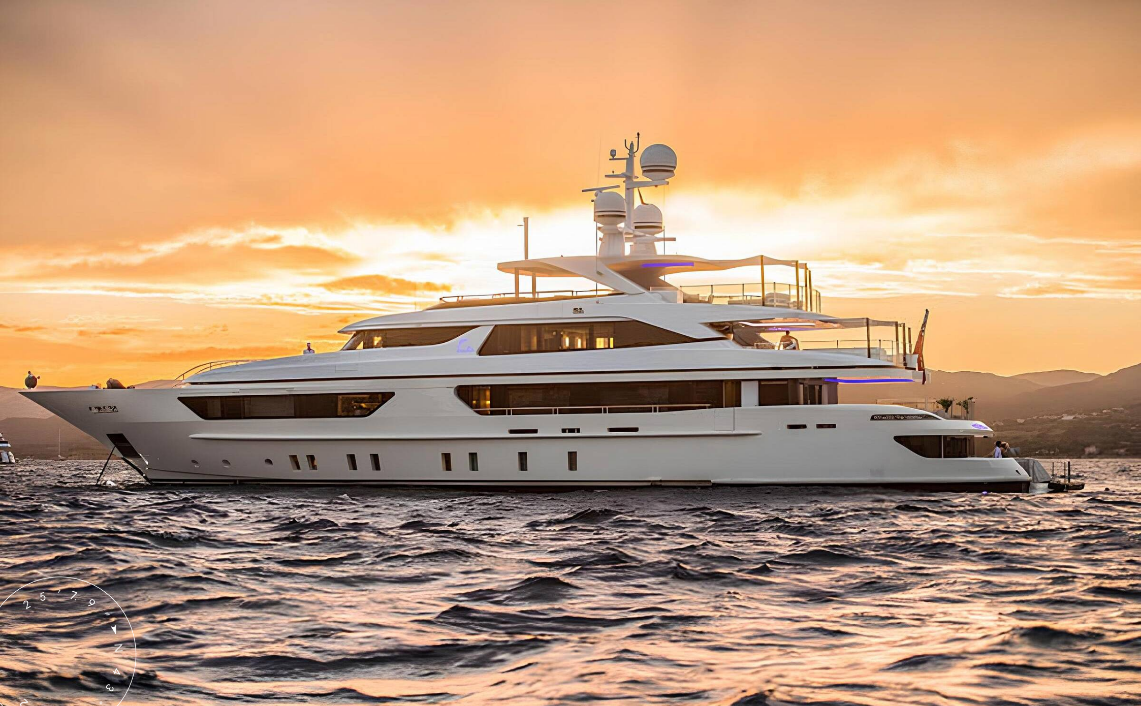
EXTERIOR SANLORENZO SL46 2015 MY SCORPION