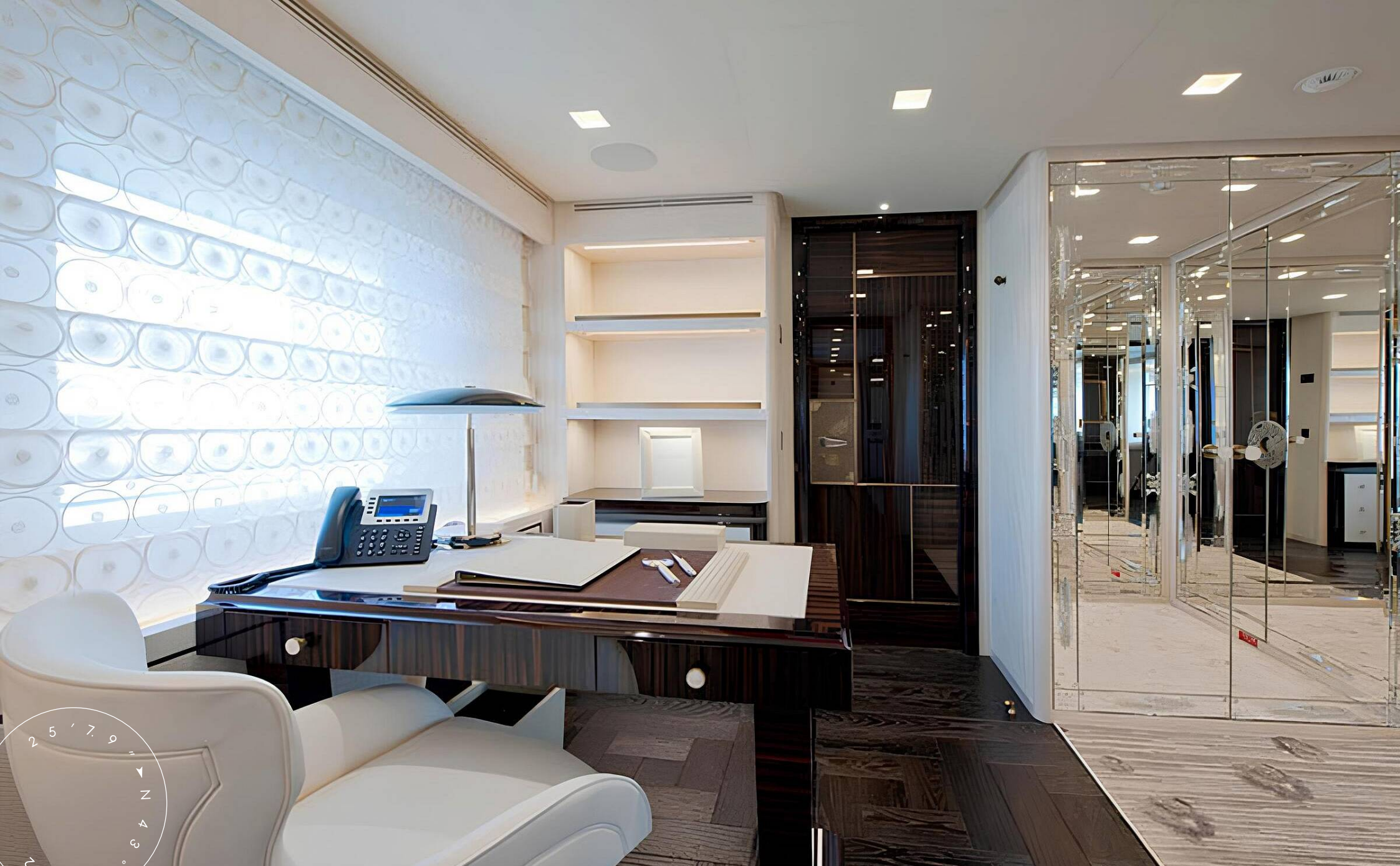
OFFICE IN THE MASTER CABIN