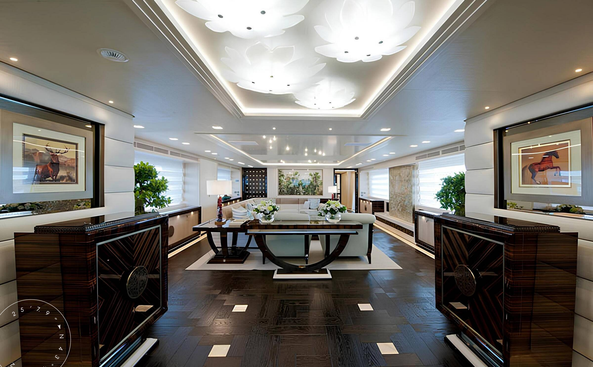
UPPER DECK SALOON