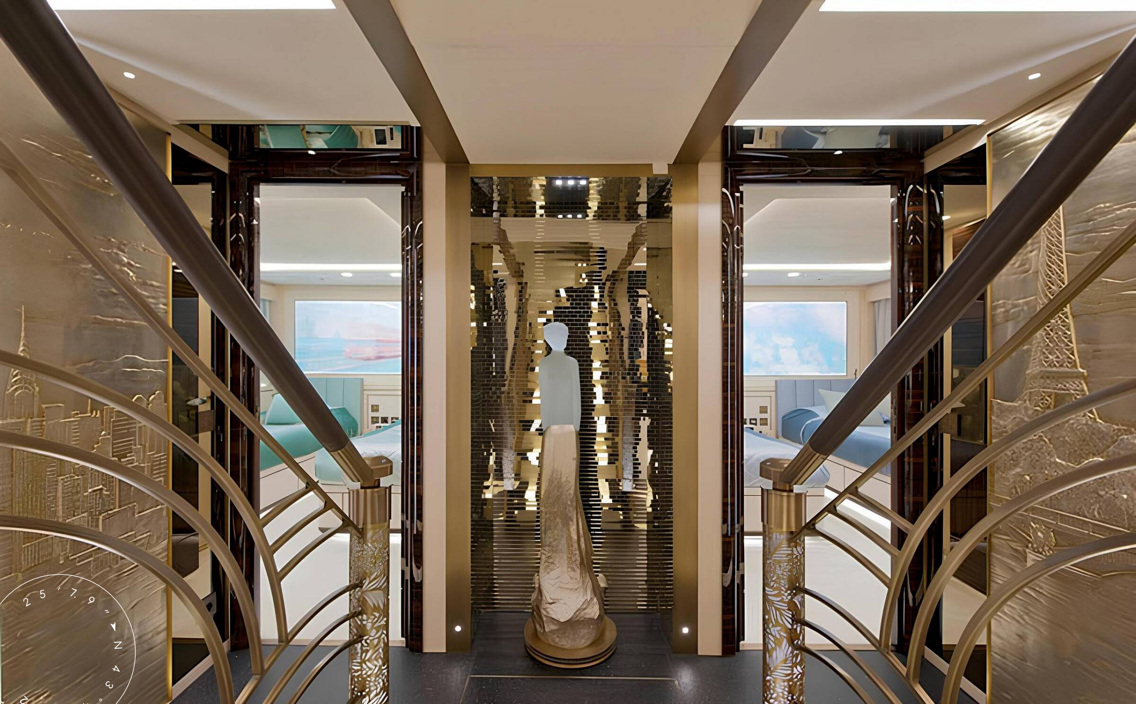
LOWER DECK LOBBY