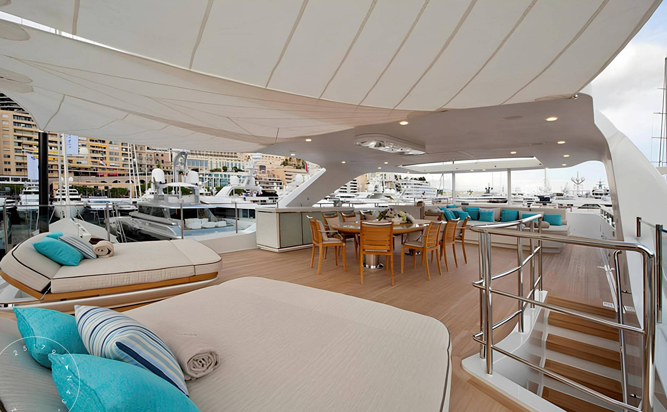
SUNDECK LOUNGE AREA