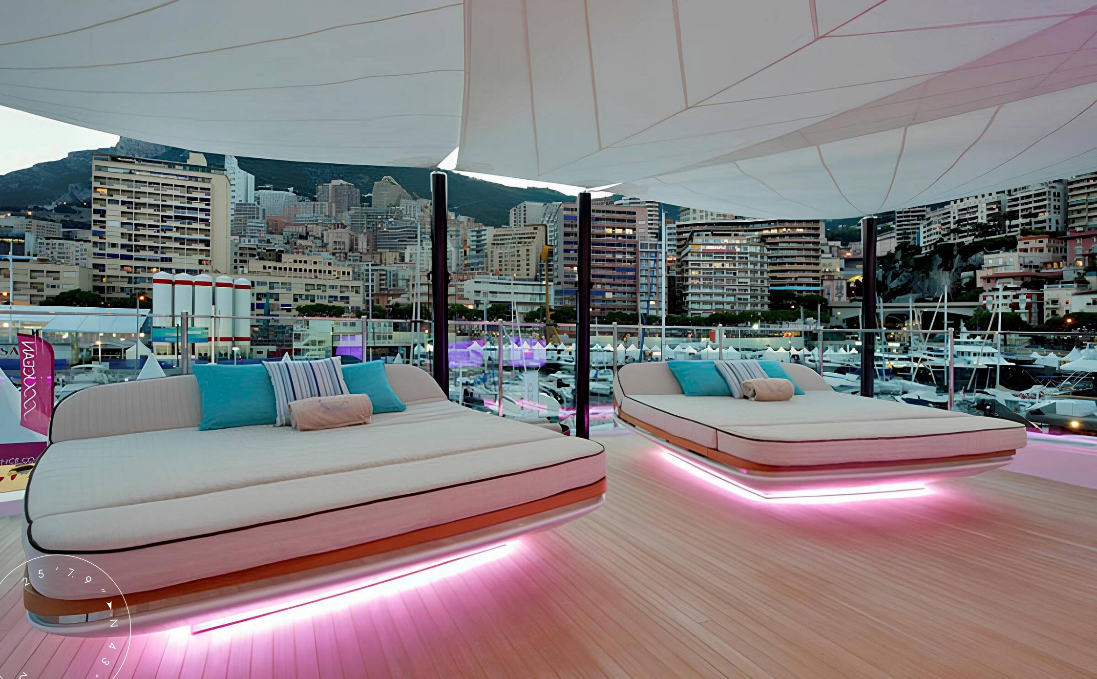
SUNDECK AFT SUNBATHING AREA