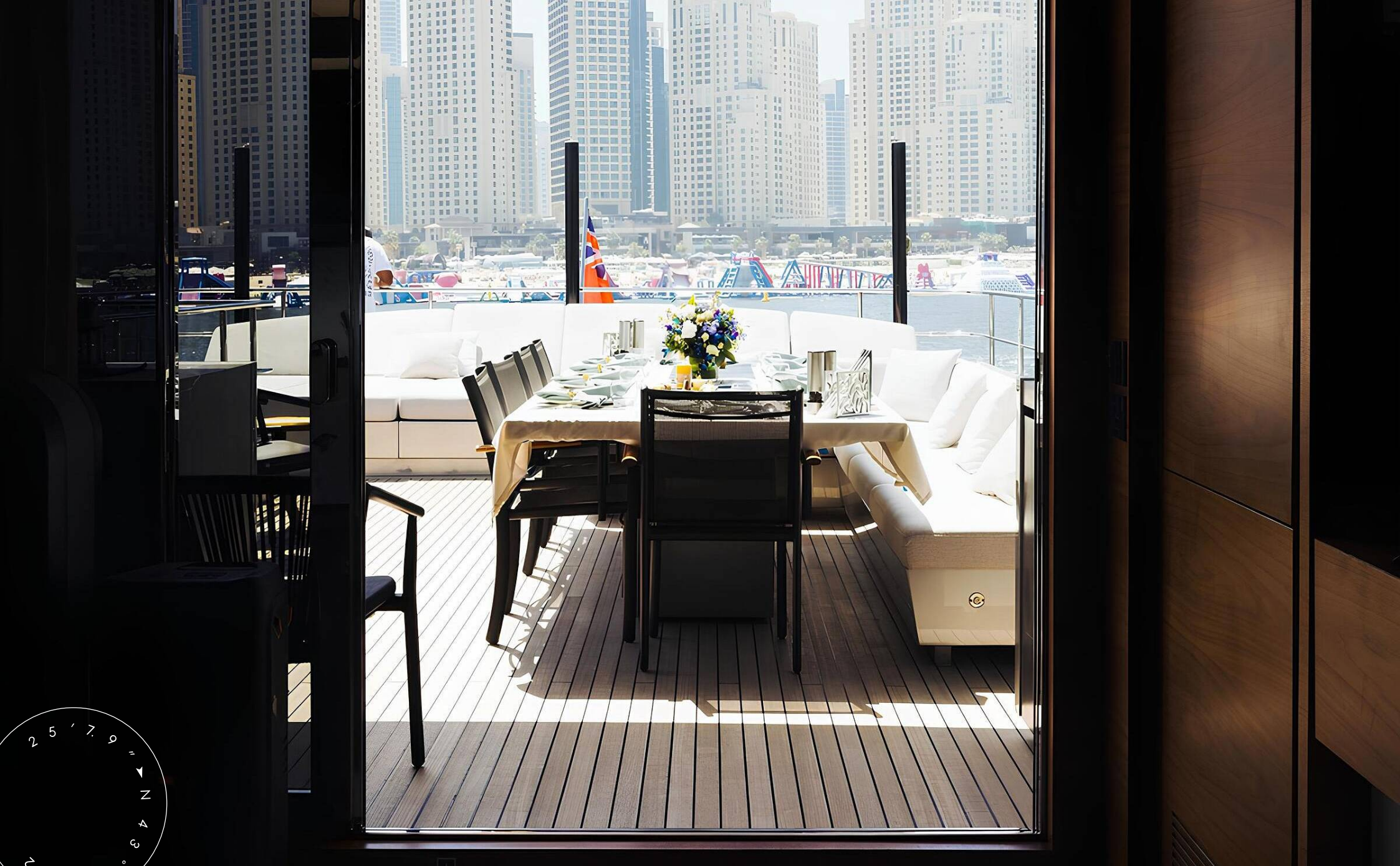
AFT UPPER DECK DINING AREA