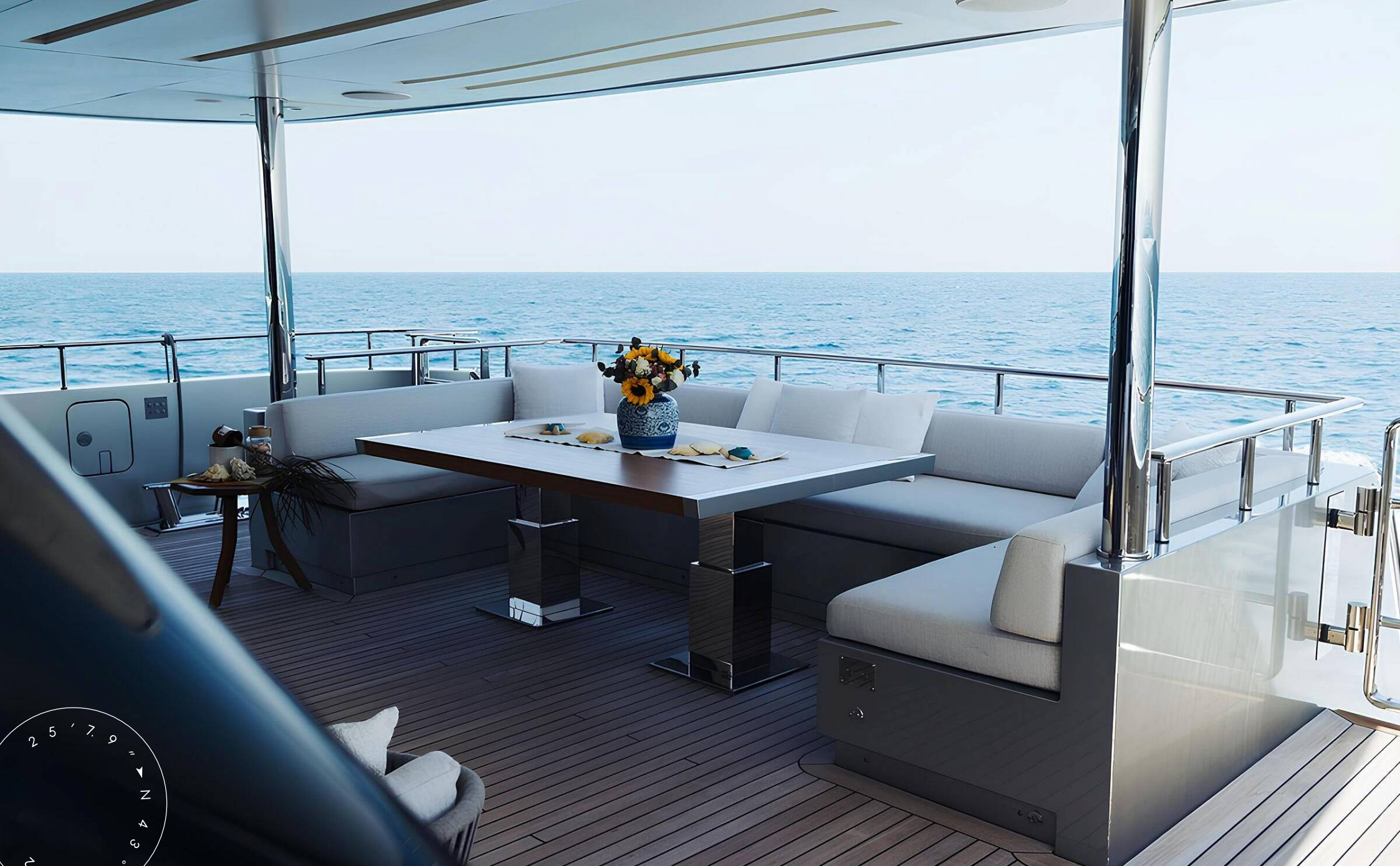
AFT MAIN DECK DINING AREA