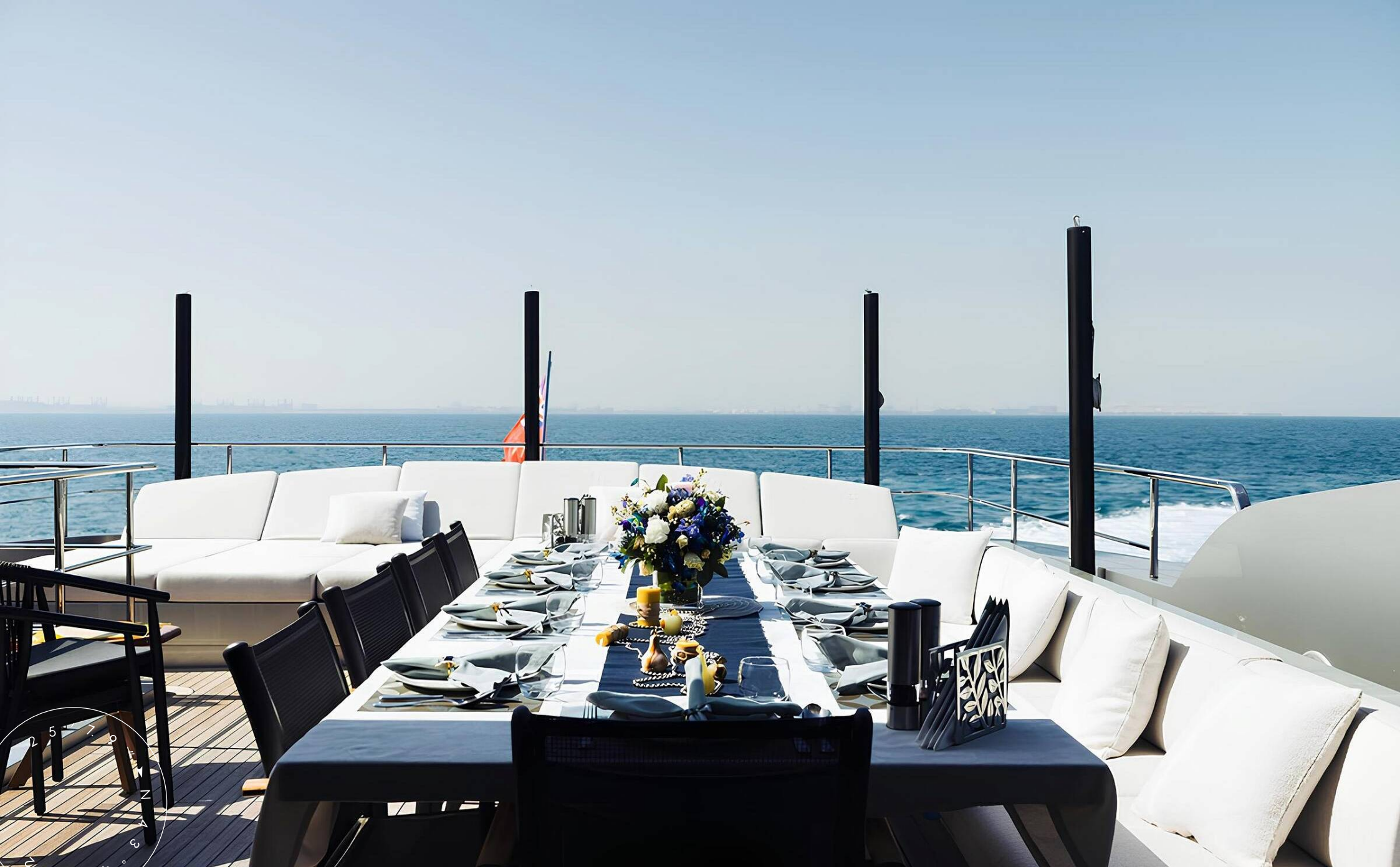
AFT UPPER DECK DINING AREA