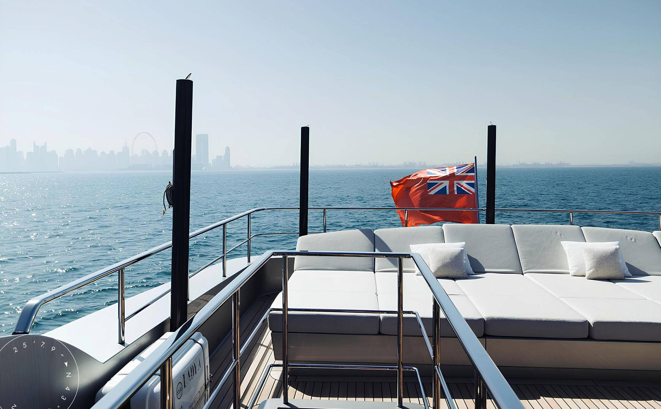
UPPER DECK AFT SUNBATHING AREA