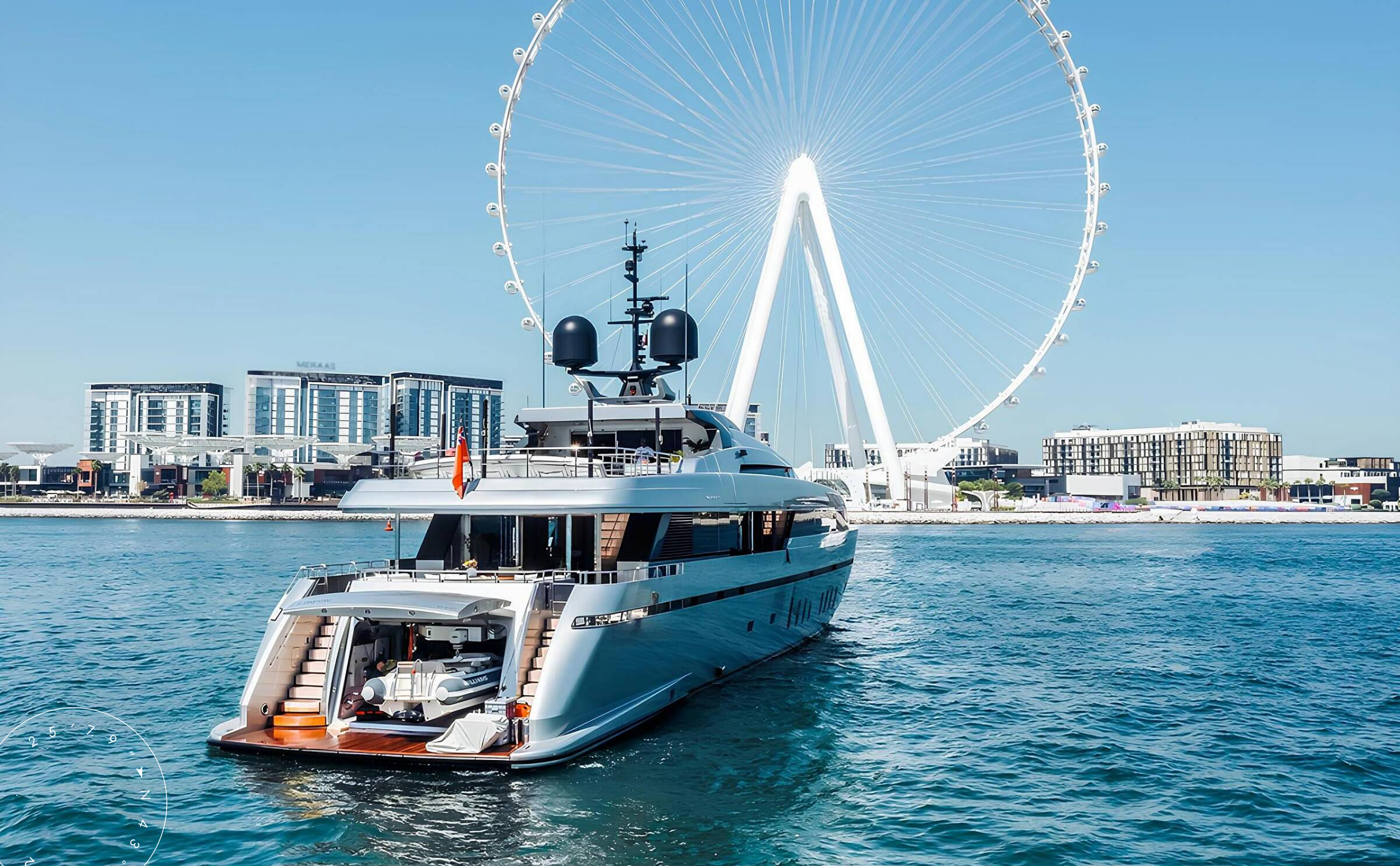
EXTERIOR SANLORENZO 40 ALLOY 2018 MY LADY A