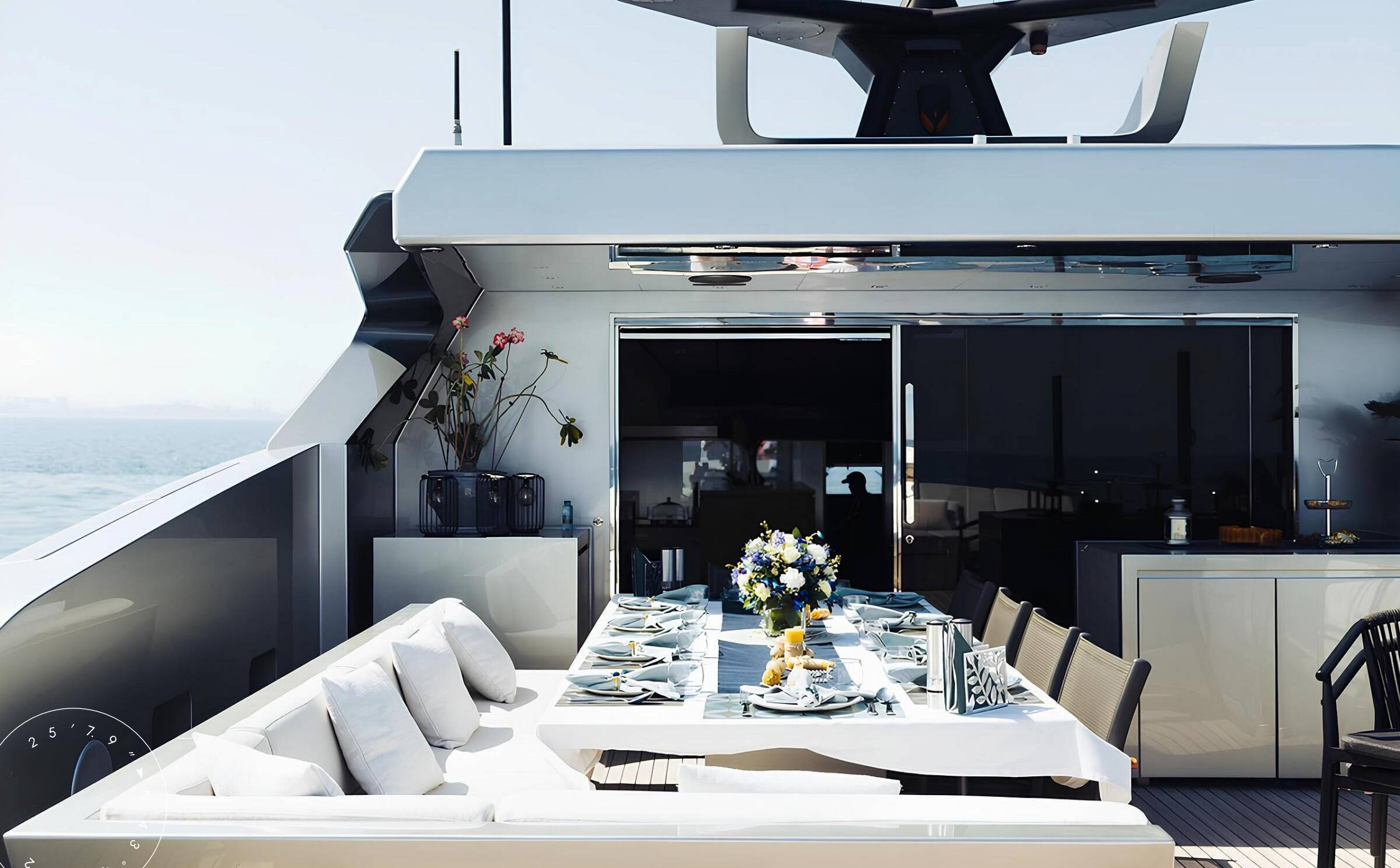
AFT UPPER DECK DINING AREA