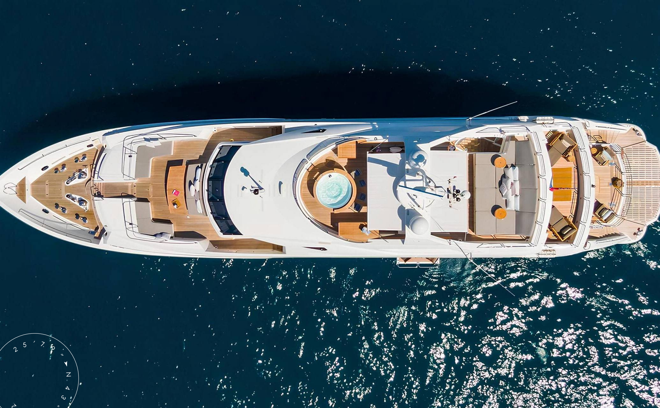
EXTERIOR SUNSEEKER 131 2014 MY DESEO