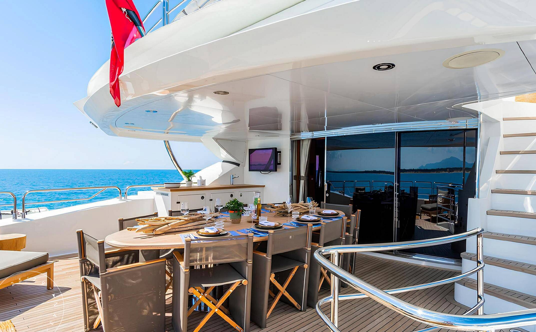
AFT UPPER DECK DINING AREA