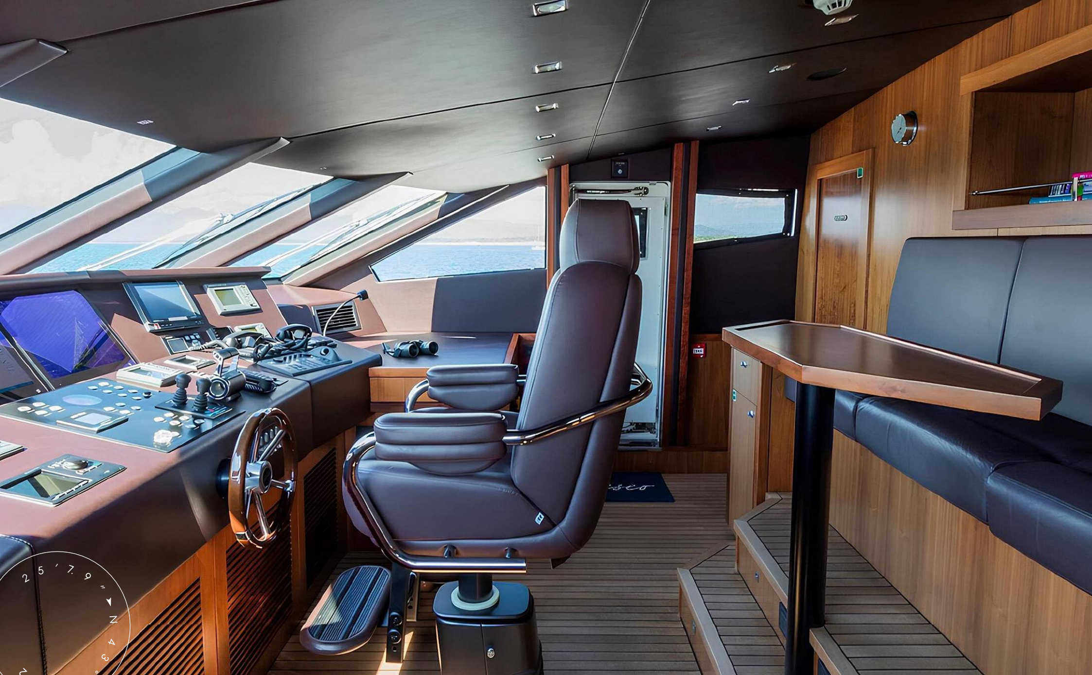
MAIN HELM STATION