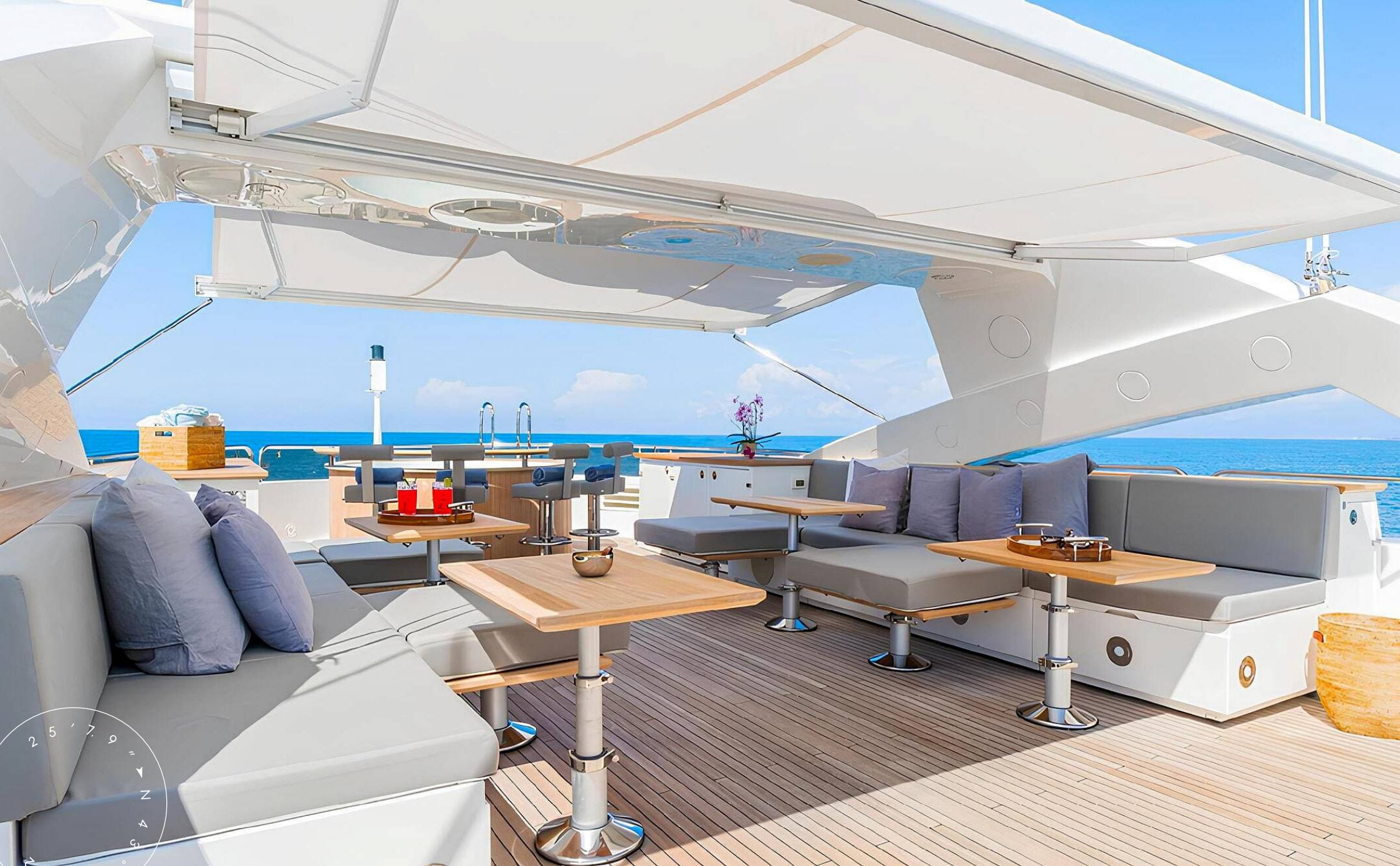
SUNDECK DINING AREA