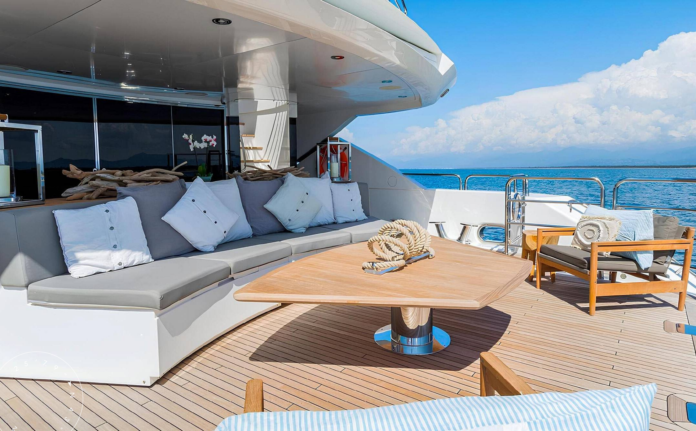
AFT MAIN DECK LOUNGE AREA