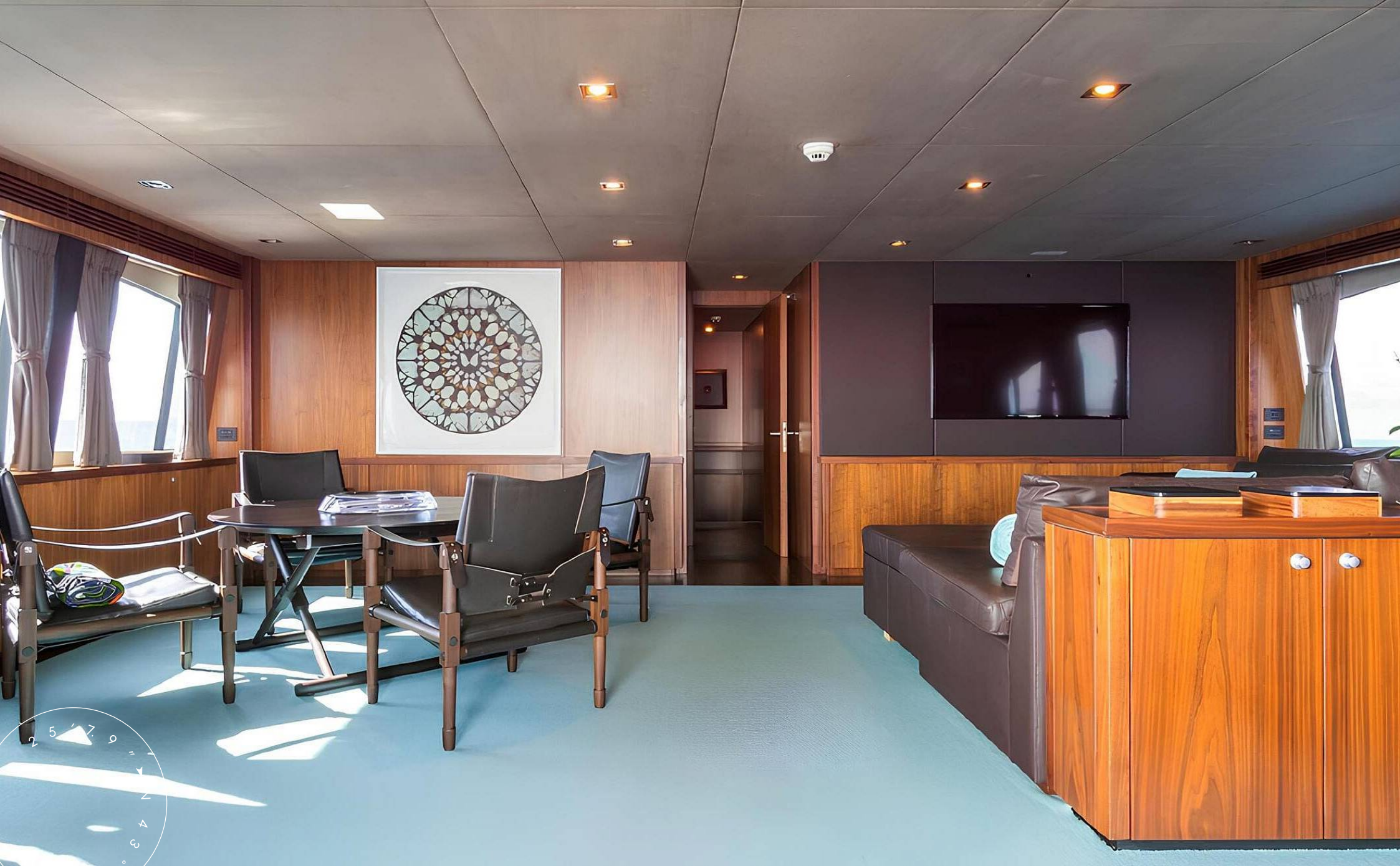
UPPER DECK SALOON