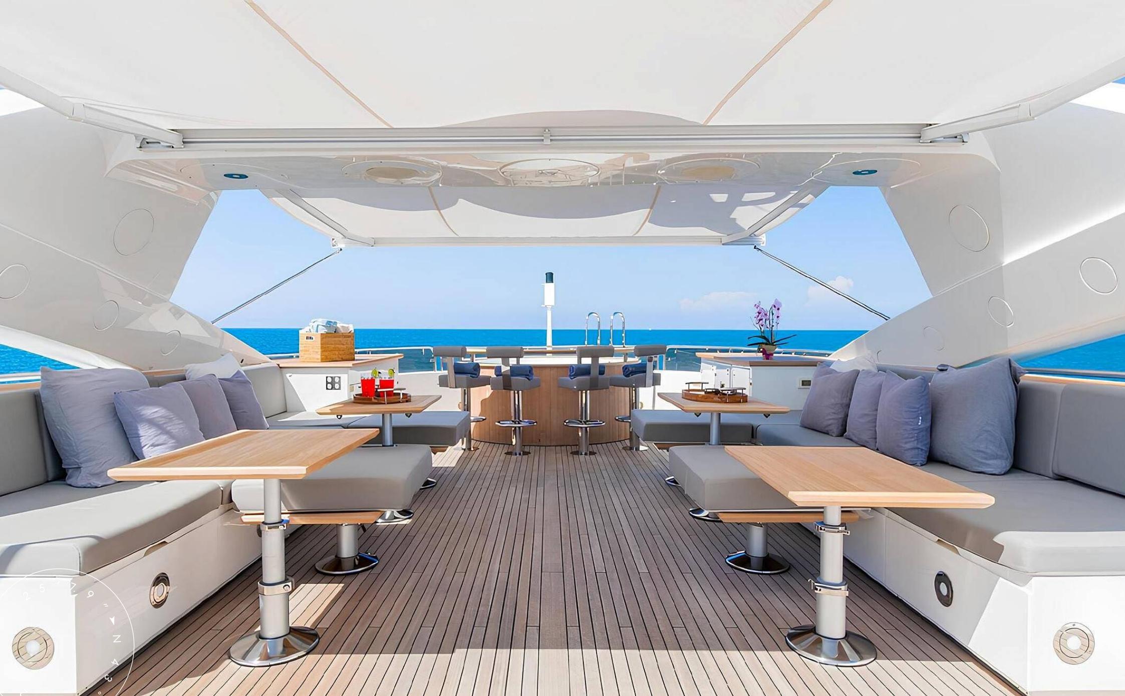
SUNDECK DINING AREA