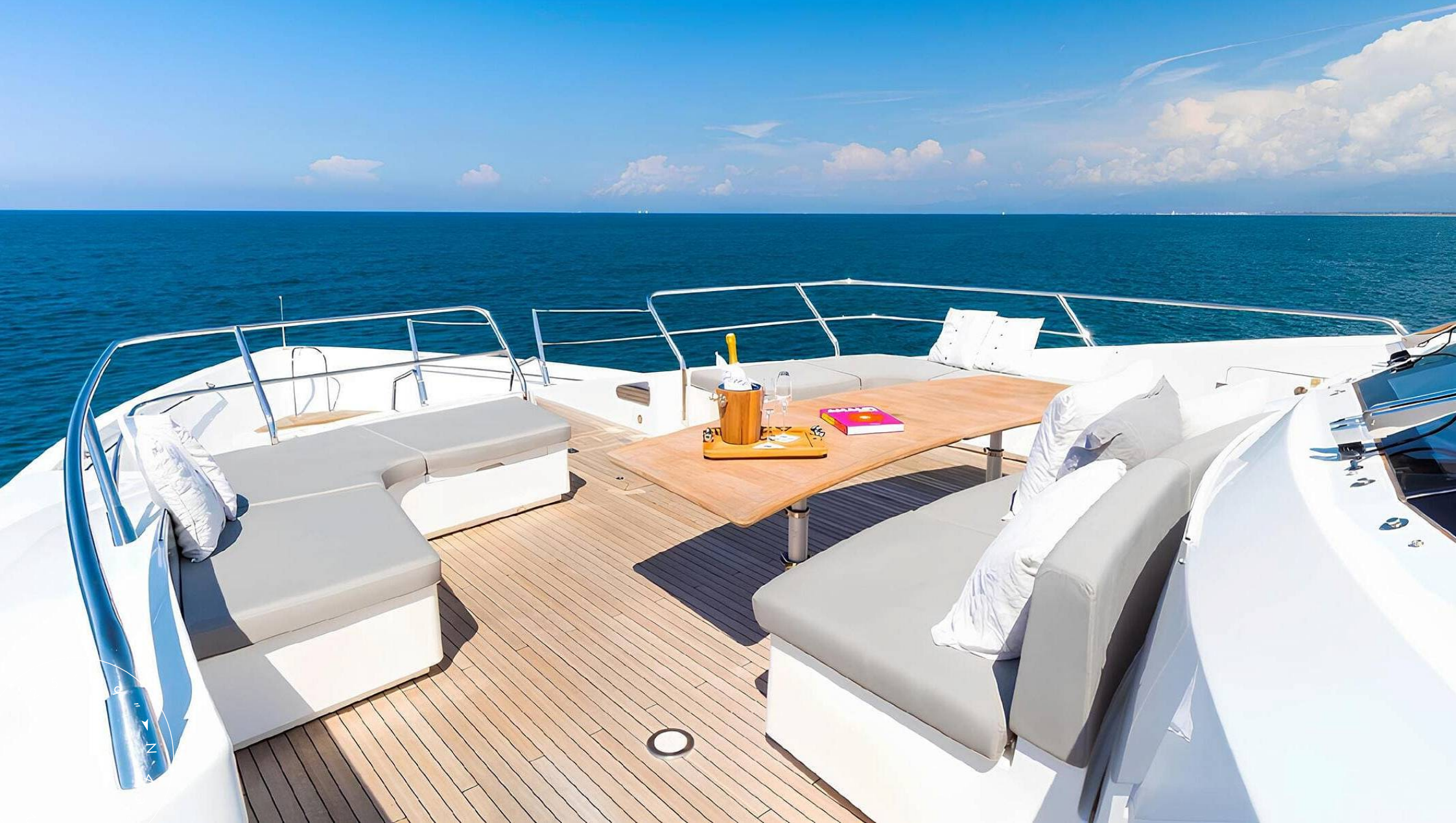
BOW LOUNGE AREA