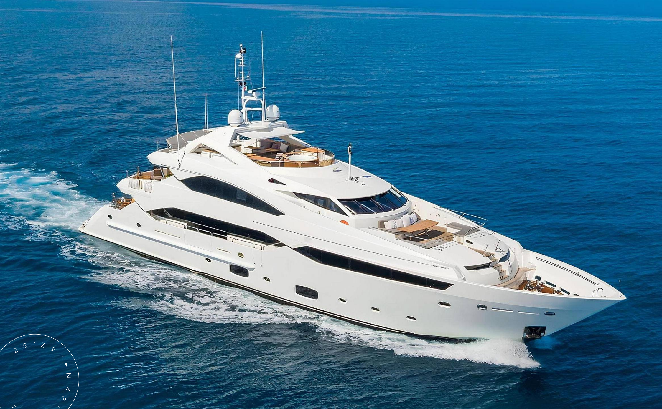
EXTERIOR SUNSEEKER 131 2014 MY DESEO