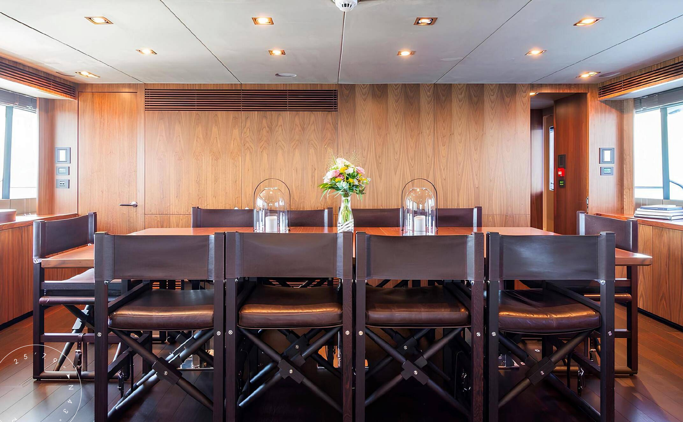
MAIN SALON DINING AREA