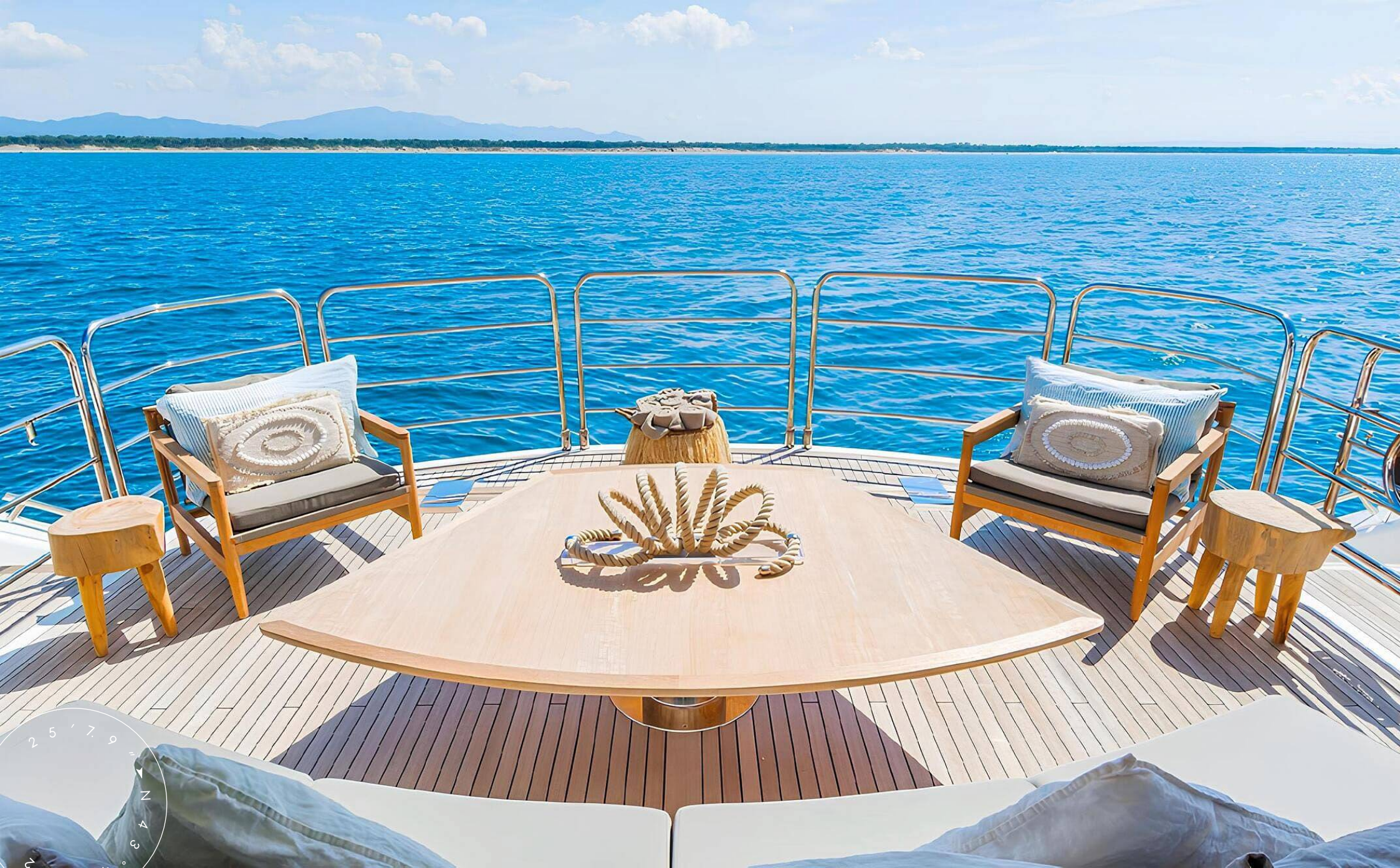
AFT MAIN DECK LOUNGE AREA