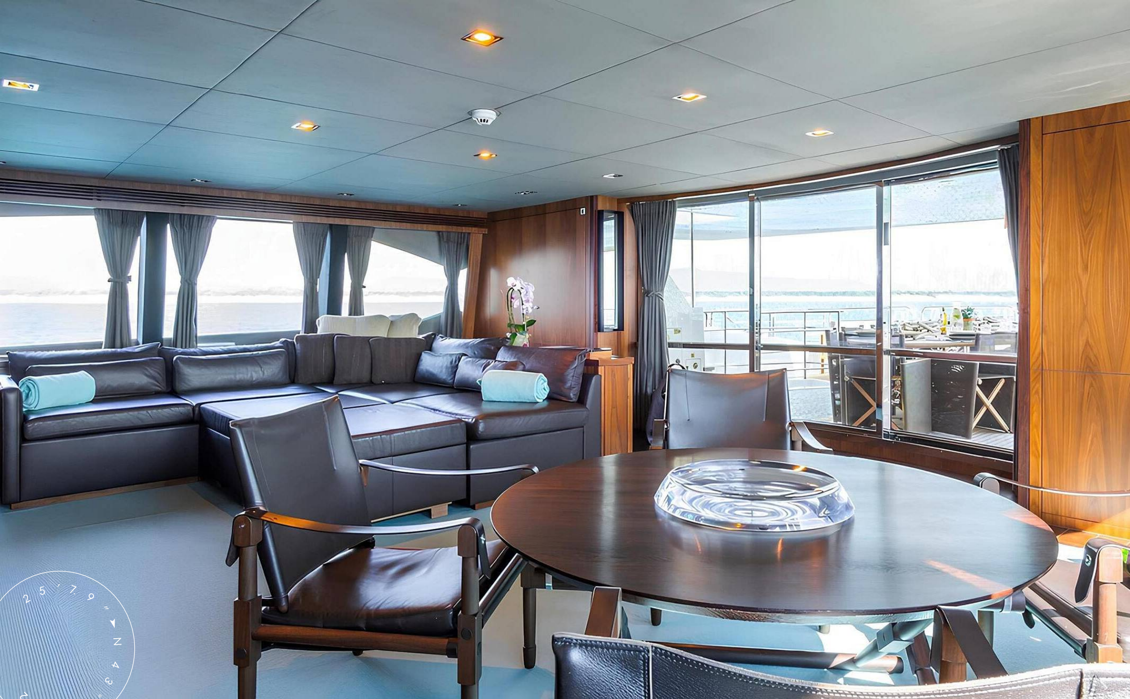
UPPER DECK SALOON