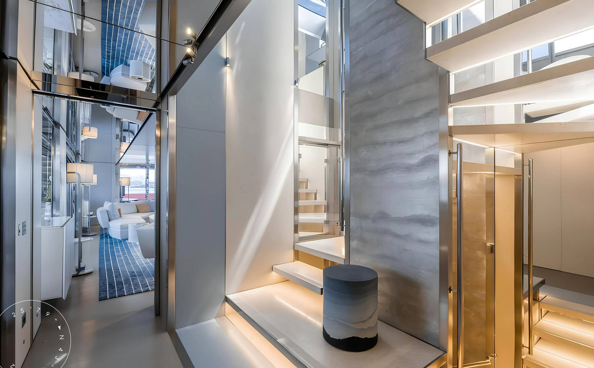
MAIN SALON LOBBY