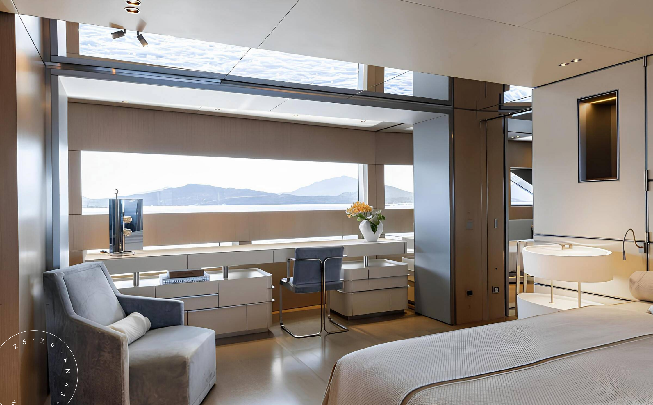
MAKE-UP TABLE IN MASTER CABIN