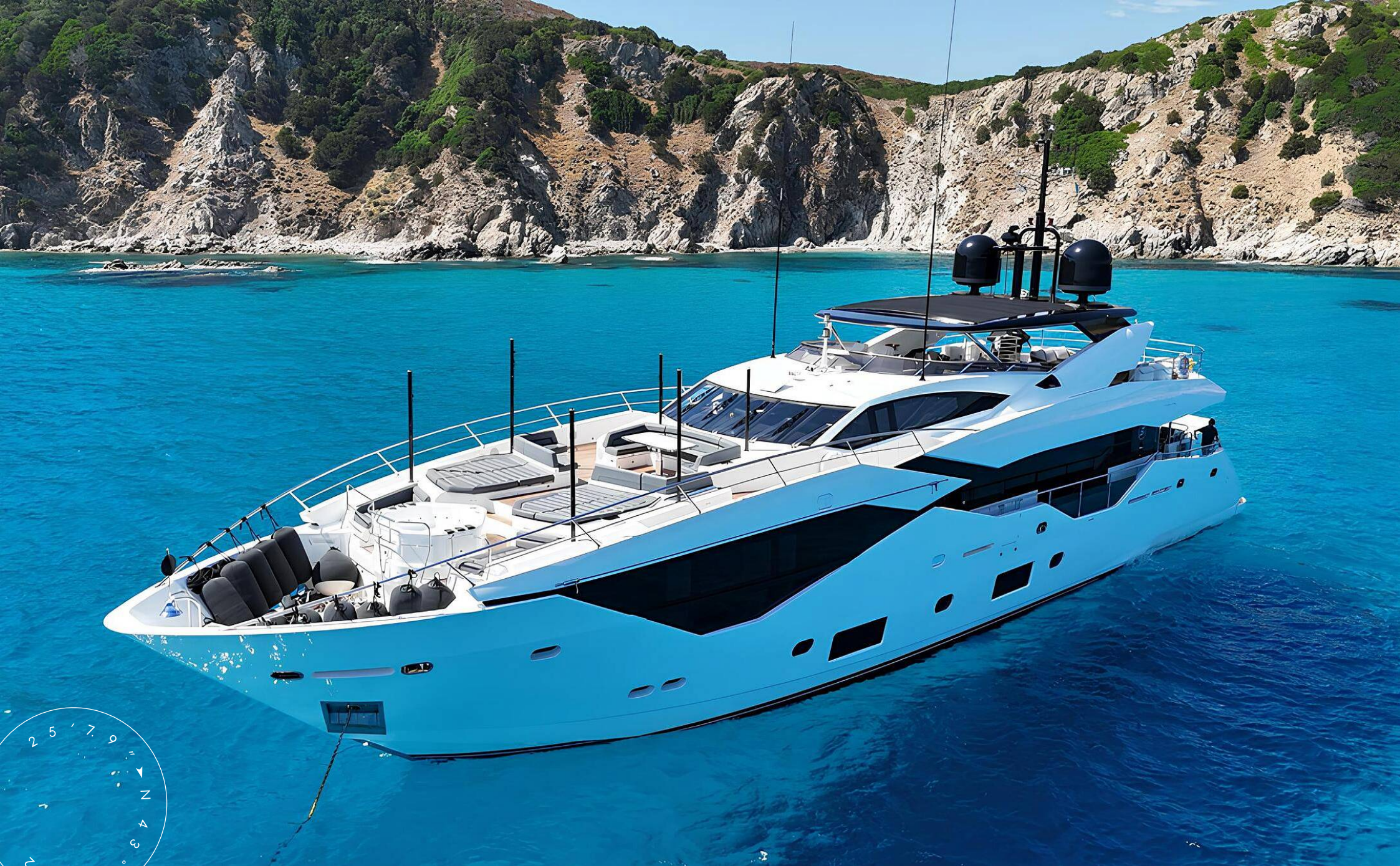
EXTERIOR SUNSEEKER 116 YACHT 2016 MY SURVIVOR 2