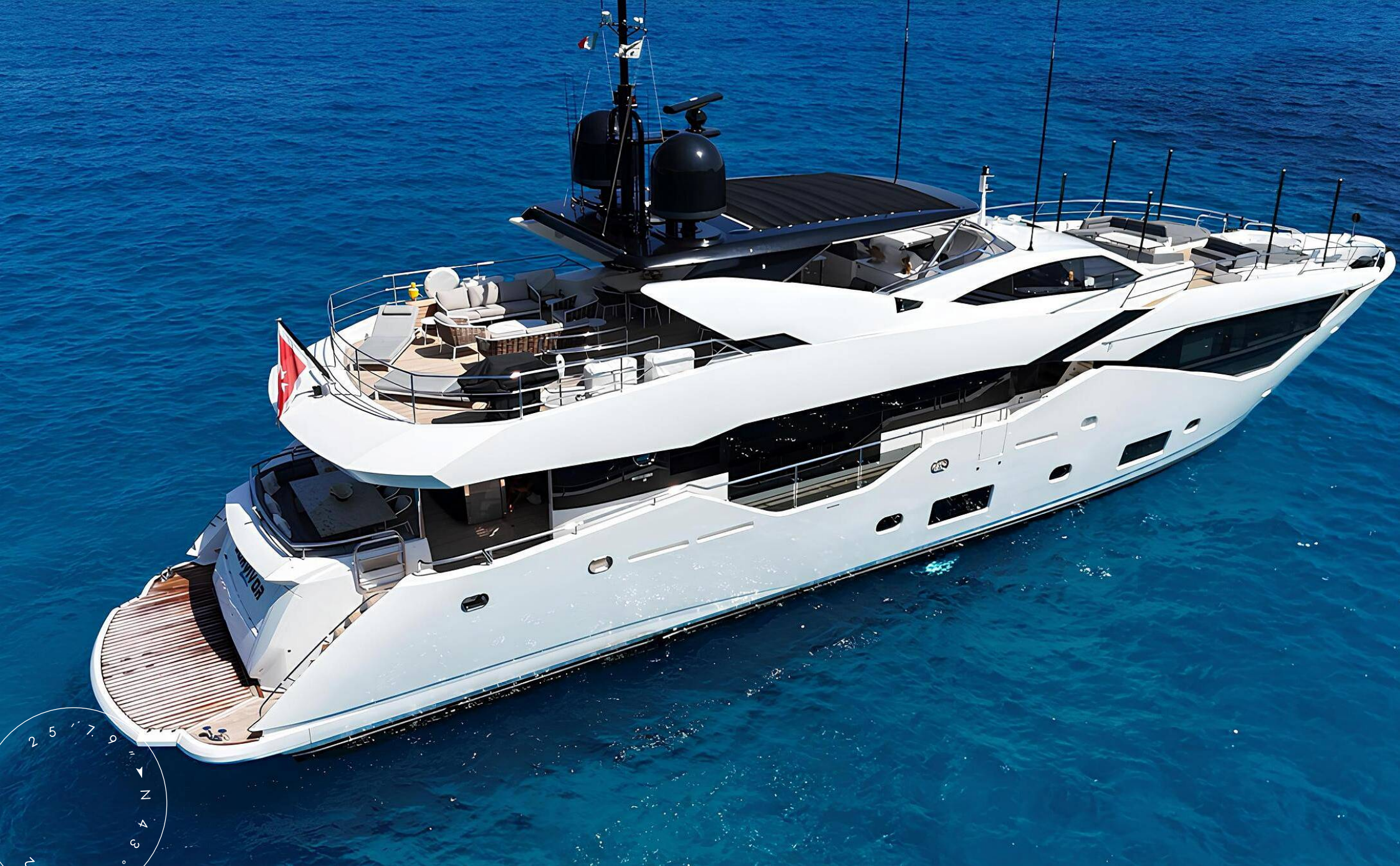
EXTERIOR SUNSEEKER 116 YACHT 2016 MY SURVIVOR 2