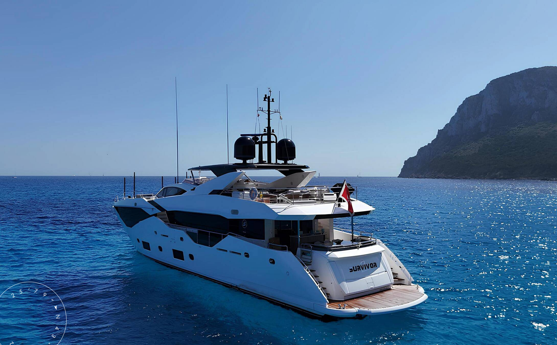
EXTERIOR SUNSEEKER 116 YACHT 2016 MY SURVIVOR 2