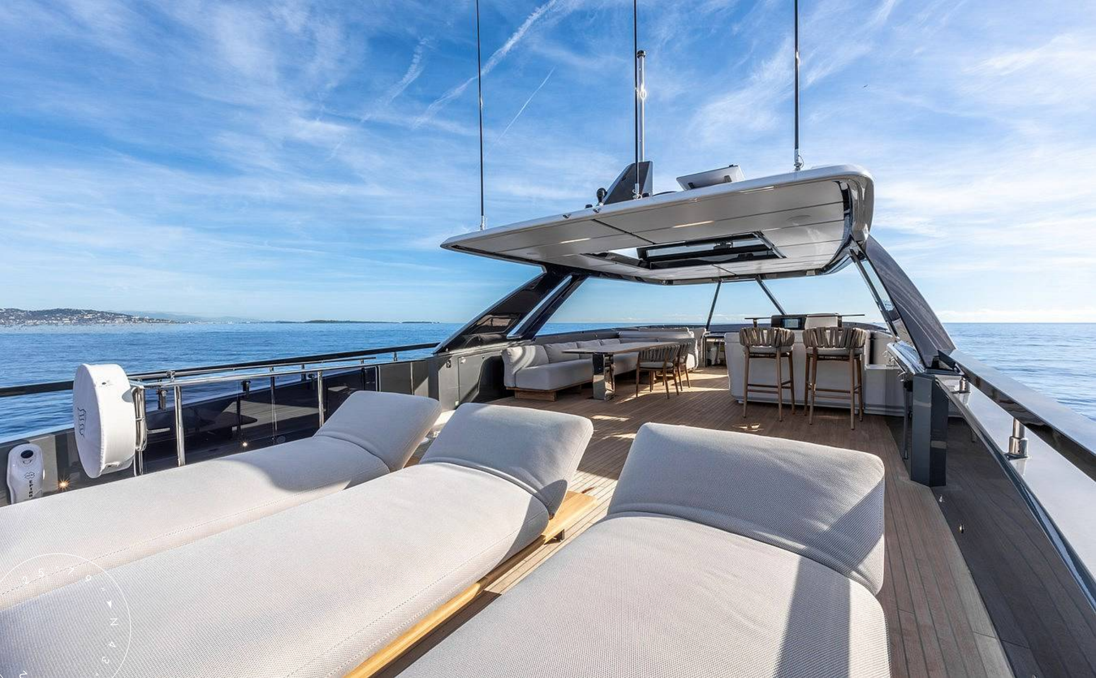
FLYBRIDGE AFT SUNBATHING AREA