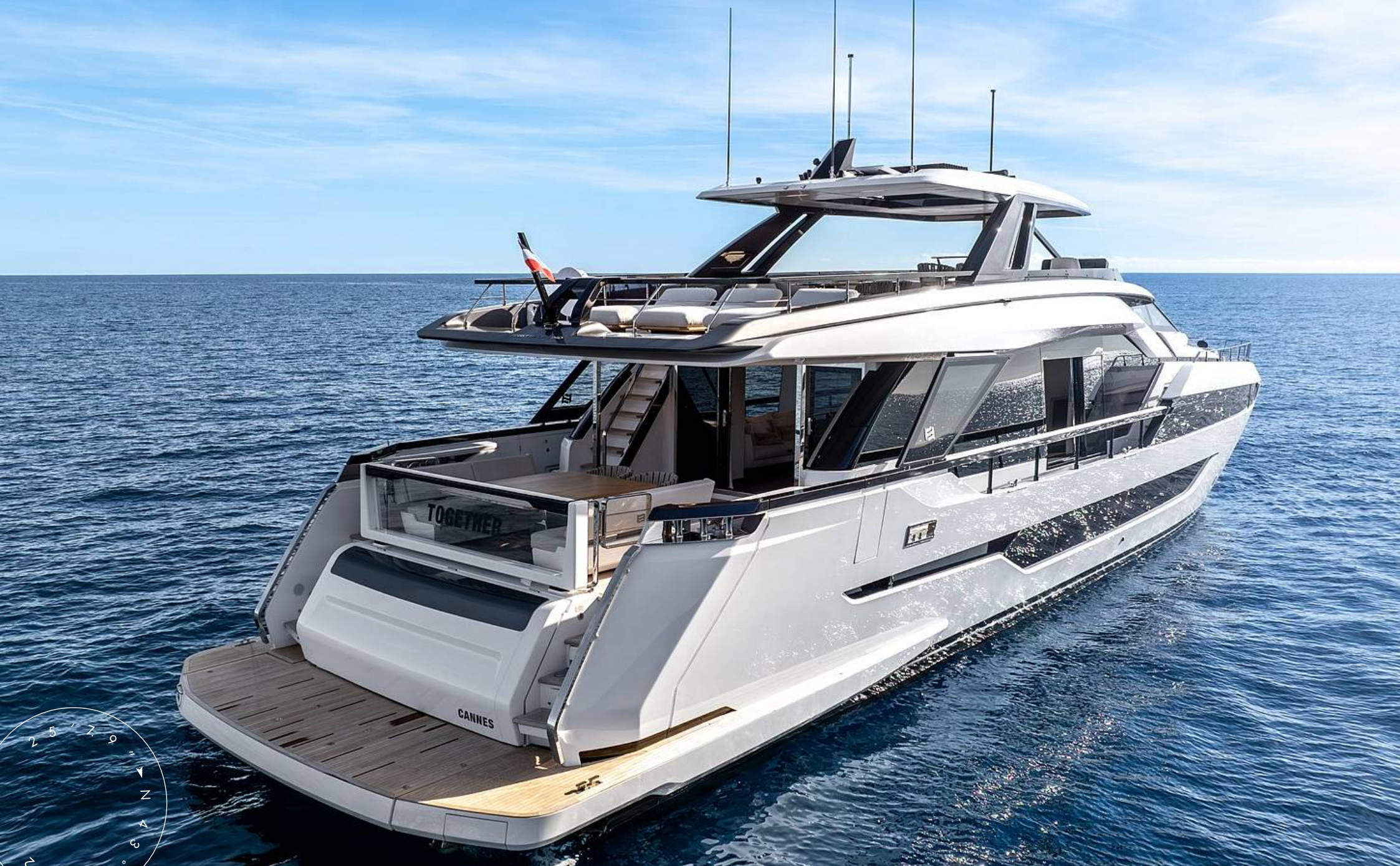
EXTERIOR FERRETTI 940 2025 MY TOGETHER