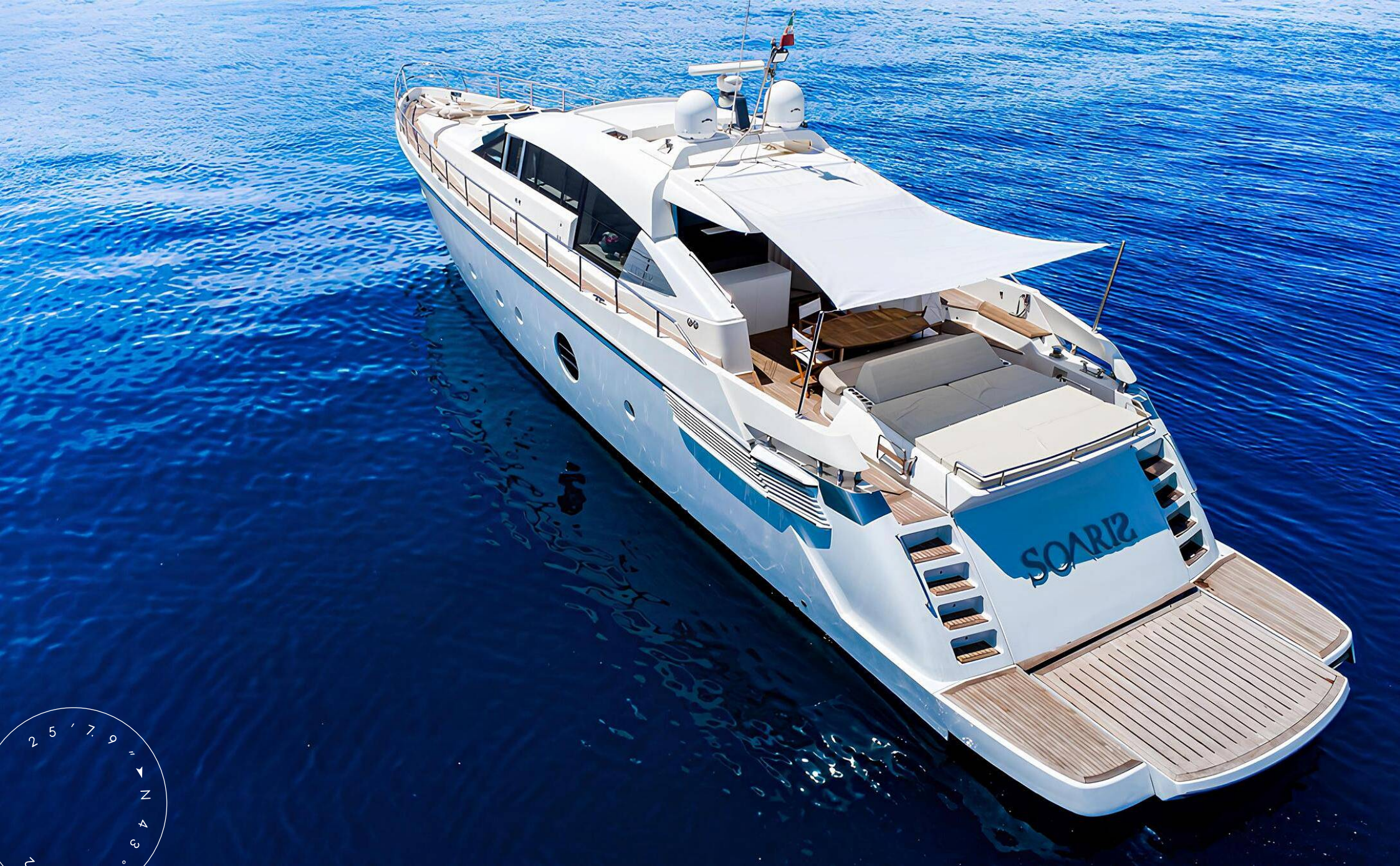
EXTERIOR AICON 85 OPEN 2009 MY SOARIS