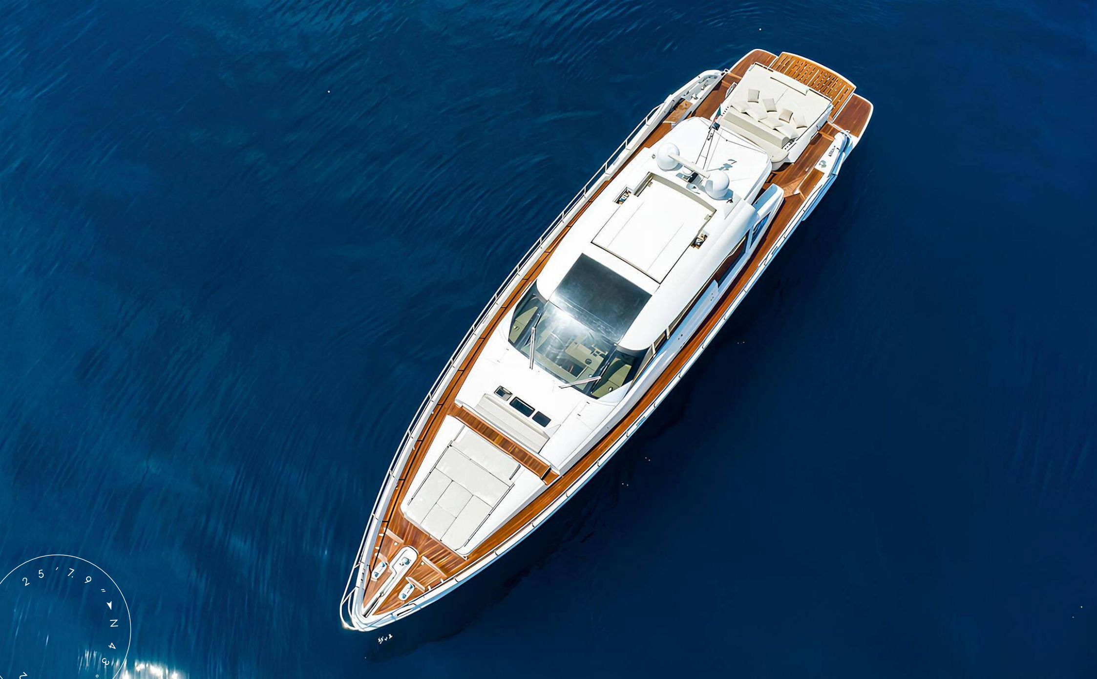
EXTERIOR AICON 85 OPEN 2009 MY SOARIS