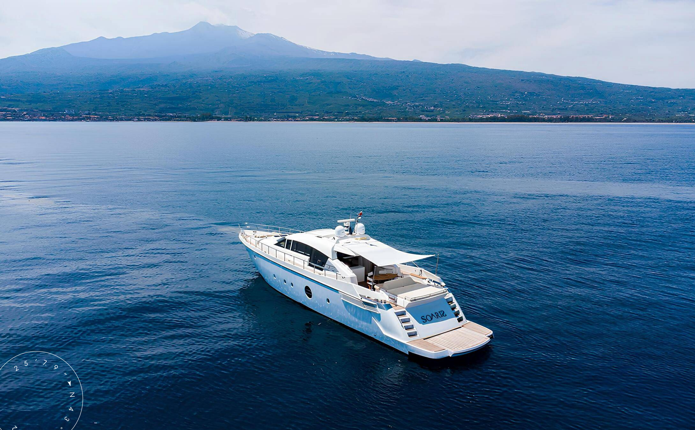
EXTERIOR AICON 85 OPEN 2009 MY SOARIS