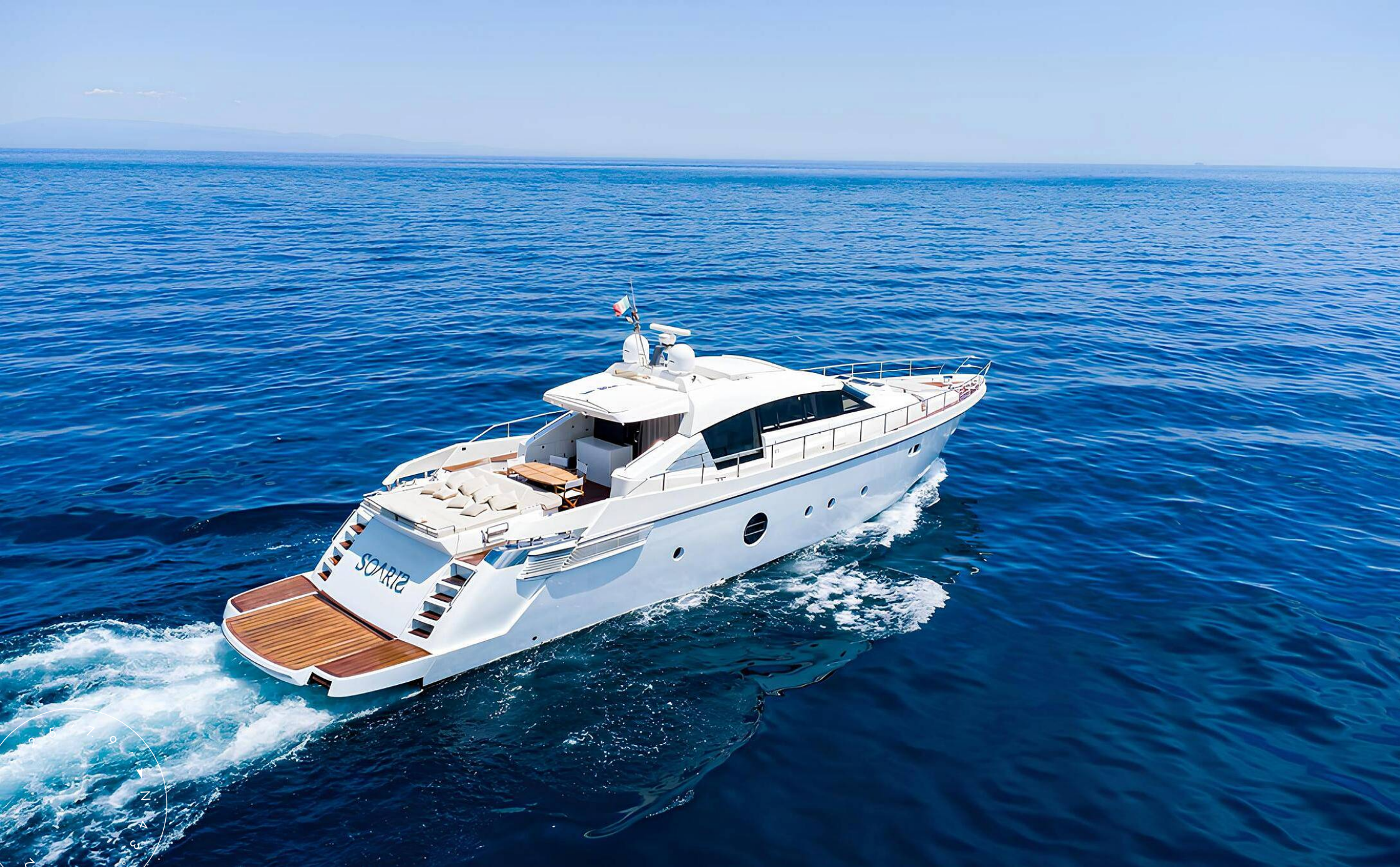
EXTERIOR AICON 85 OPEN 2009 MY SOARIS