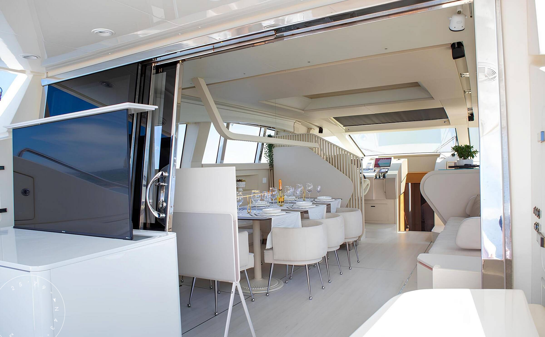
ENTRANCE TO THE MAIN SALON