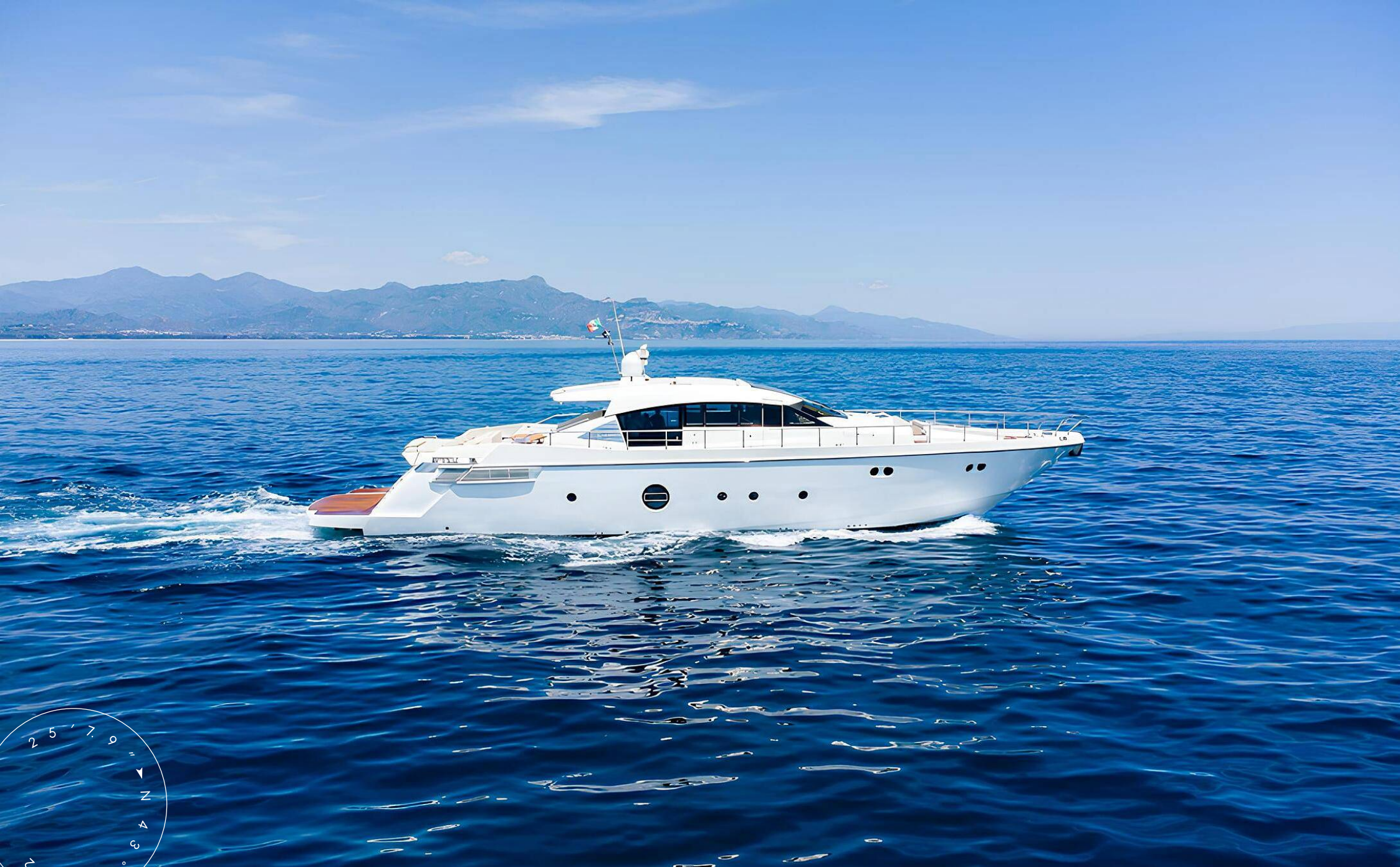
EXTERIOR AICON 85 OPEN 2009 MY SOARIS