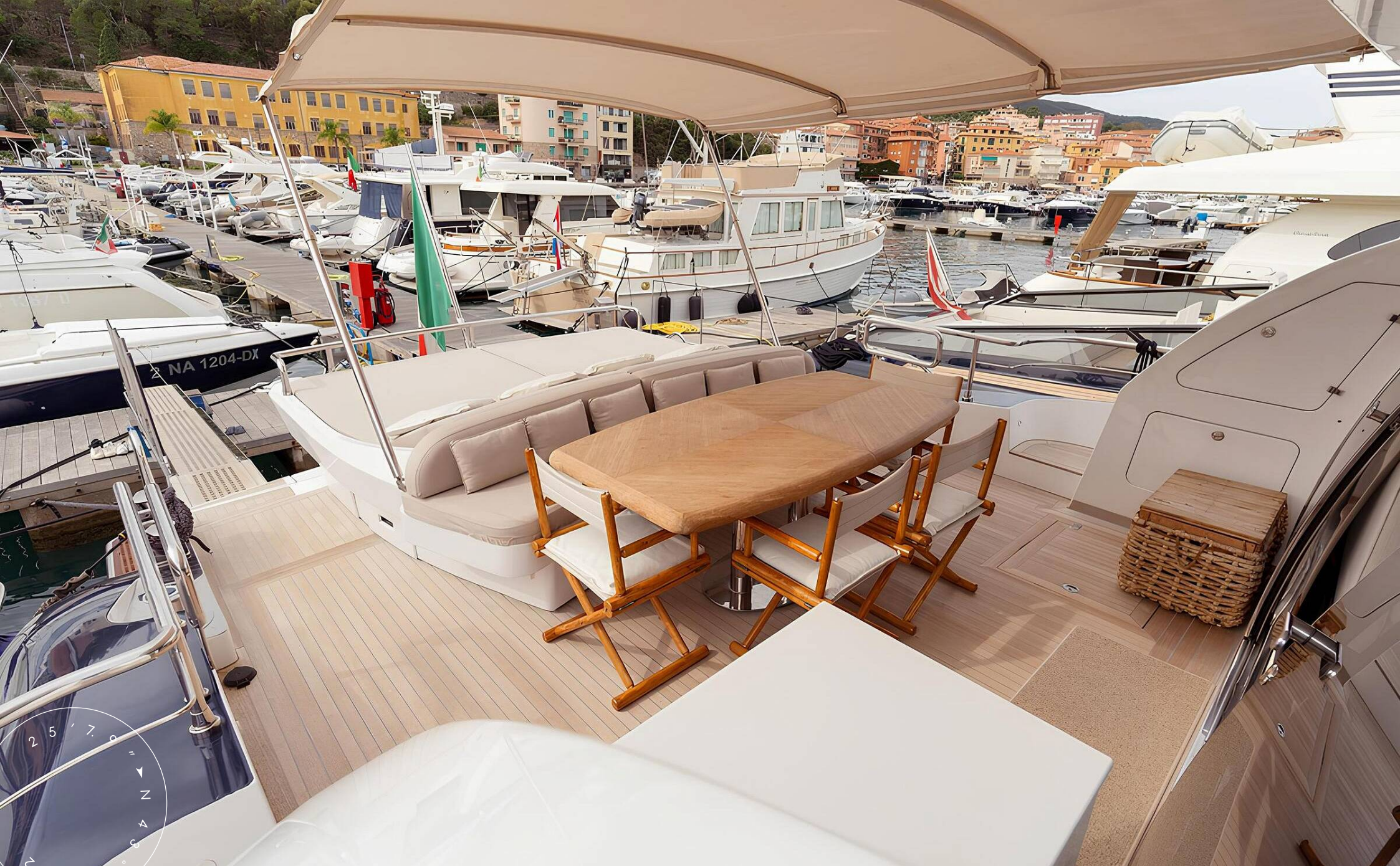
COCKPIT SEATING AREA