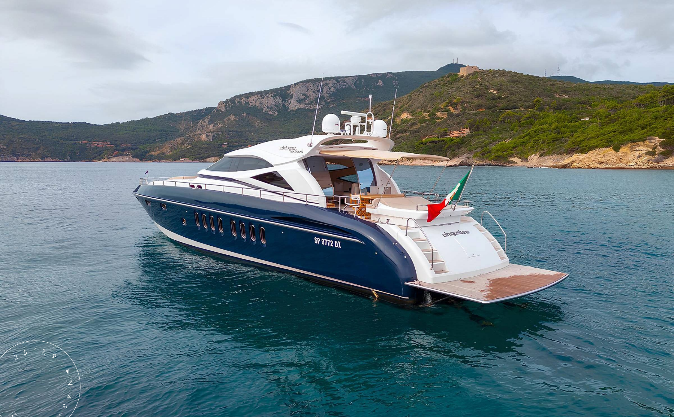
EXTERIOR ALALUNGA 85X SPORT 2005 MY CINQUE LUNE