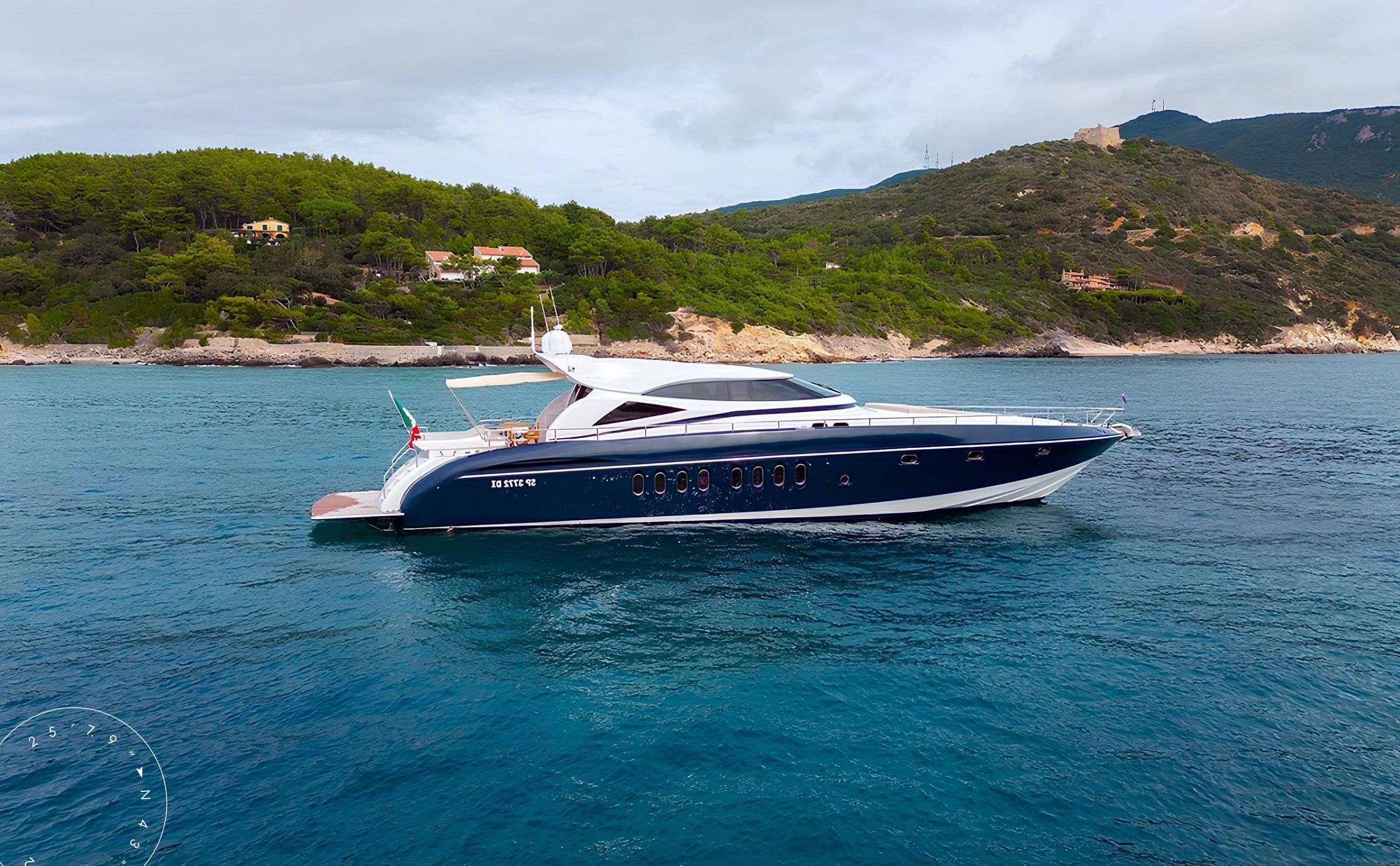
EXTERIOR ALALUNGA 85X SPORT 2005 MY CINQUE LUNE