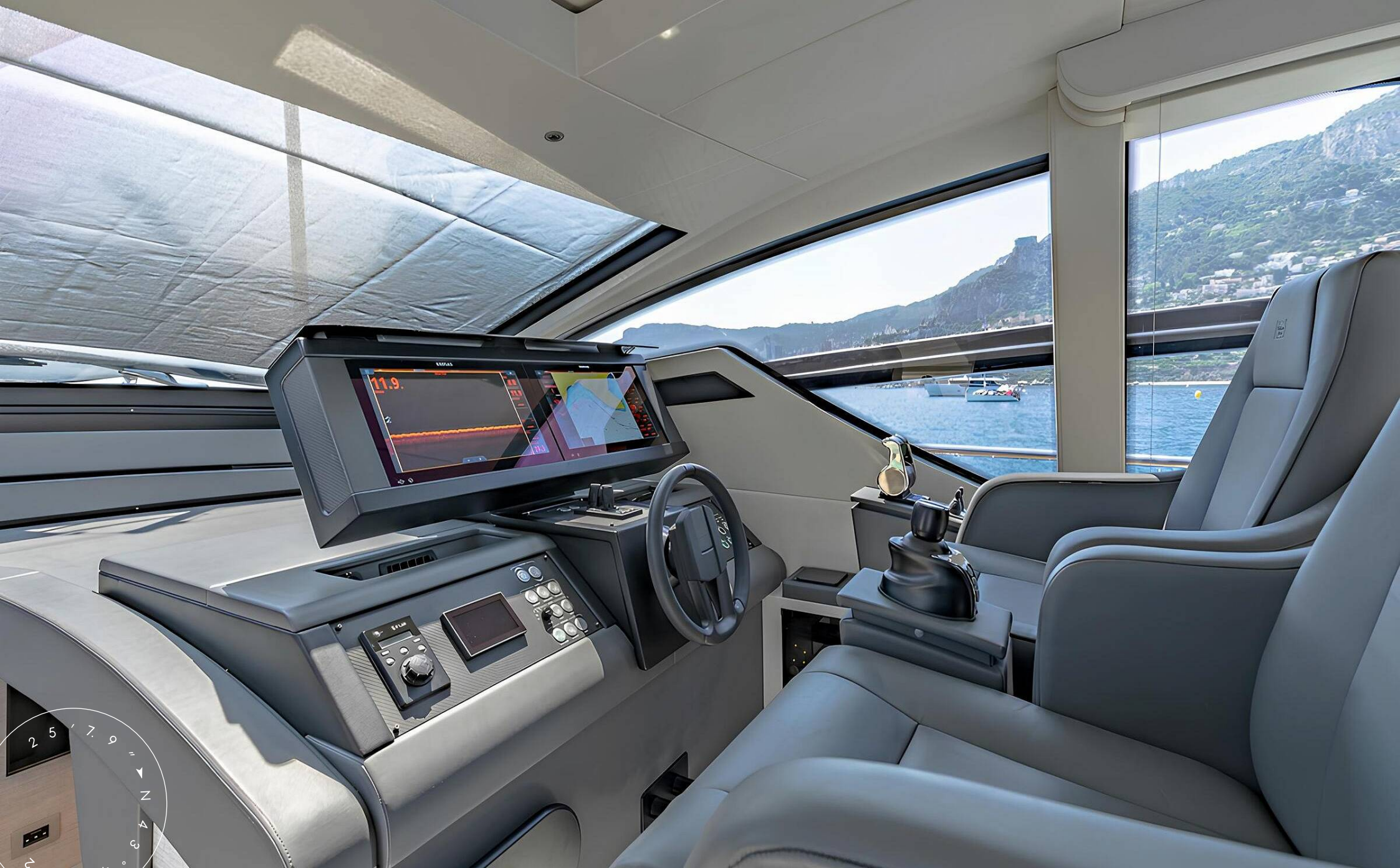
MAIN HELM STATION