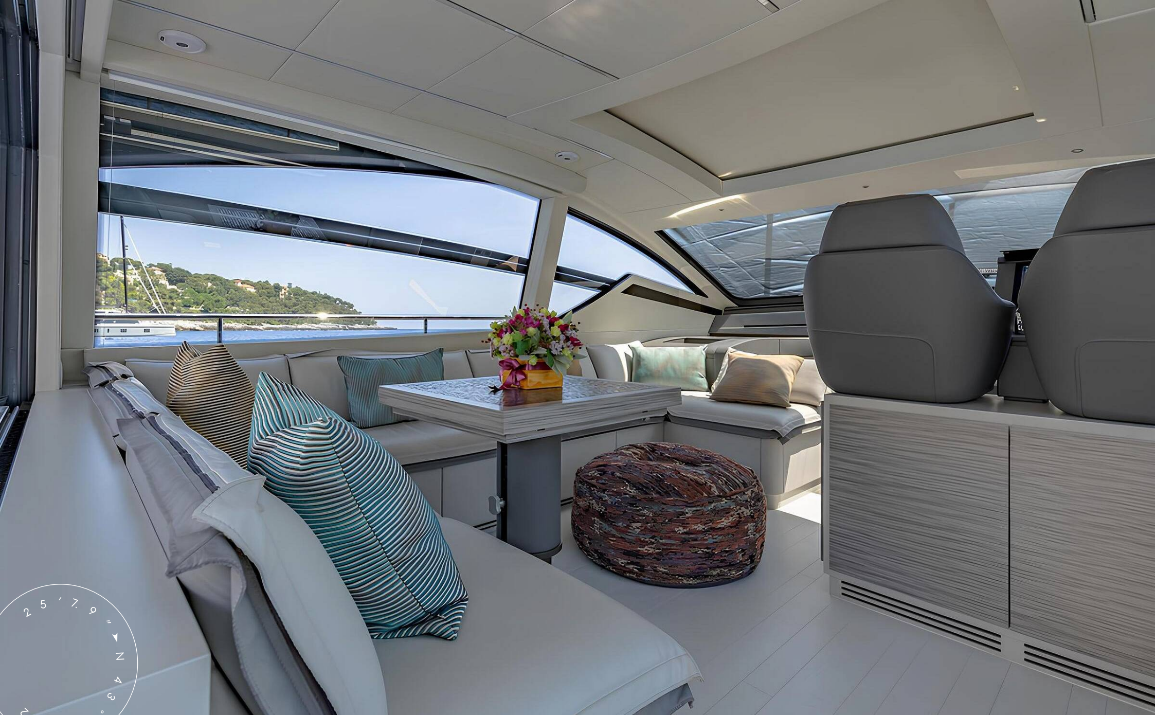
MAIN SALON DINING AREA