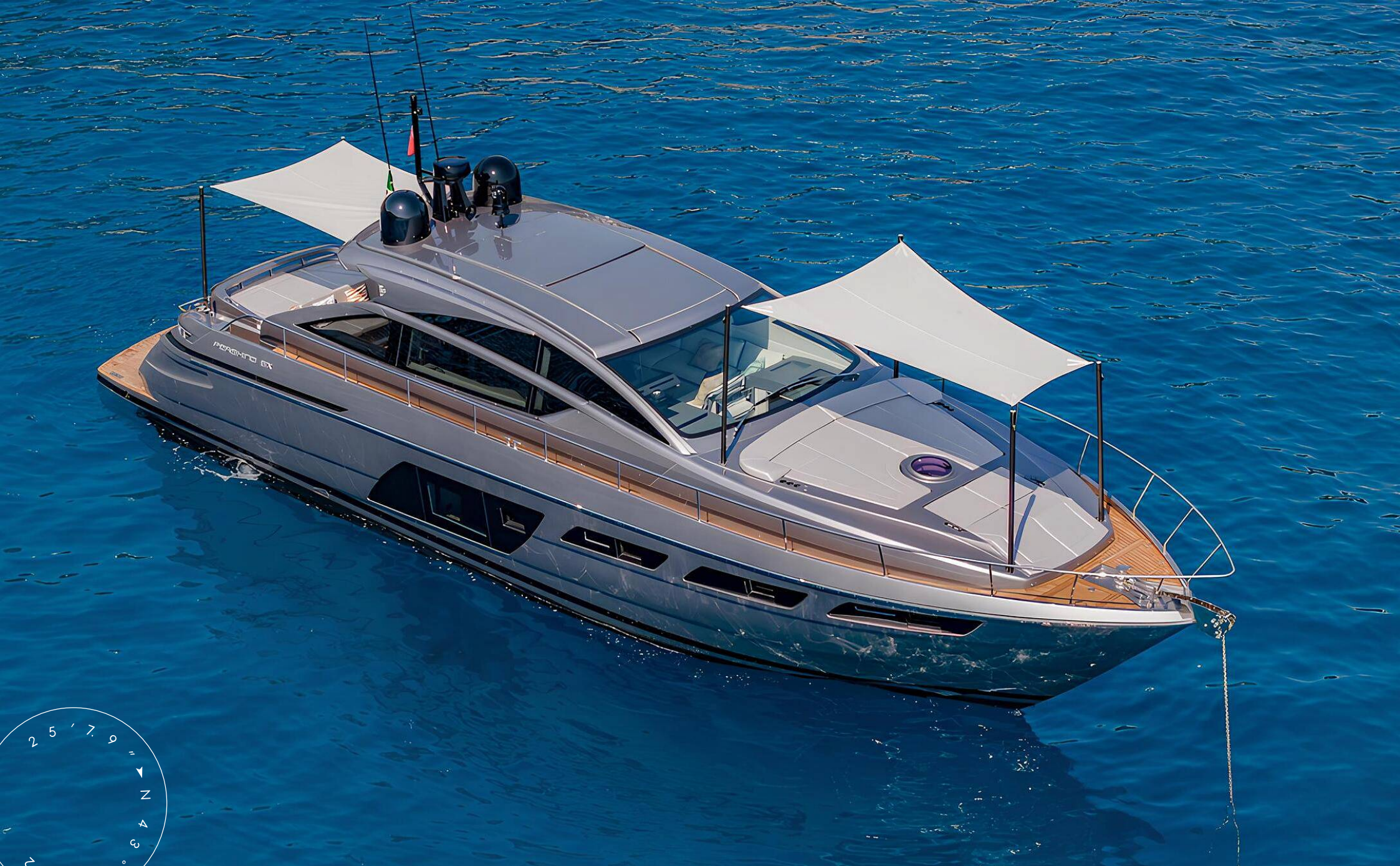
EXTERIOR PERSHING 6X 2023 MY SILVER MISSILE