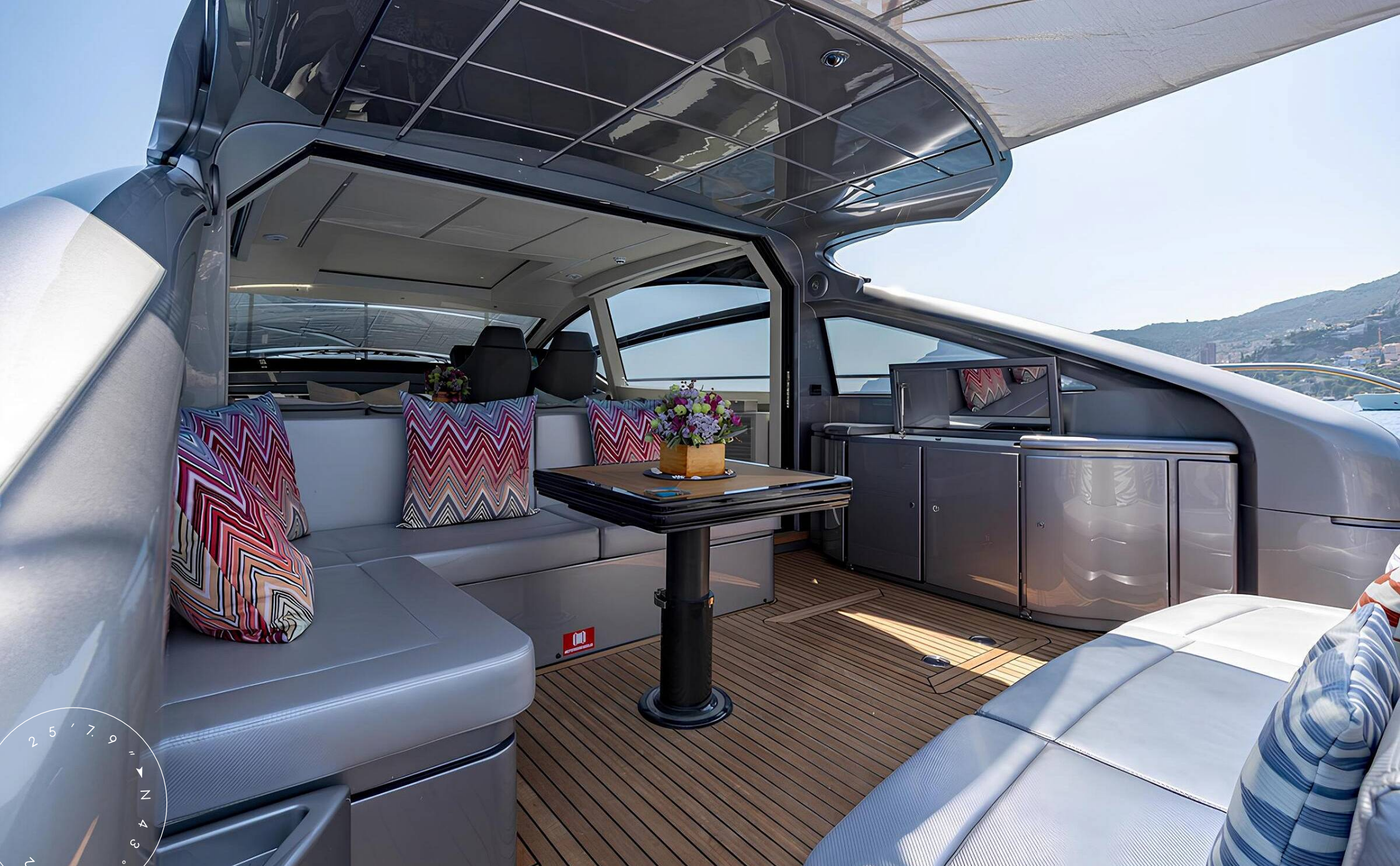
COCKPIT SEATING AREA