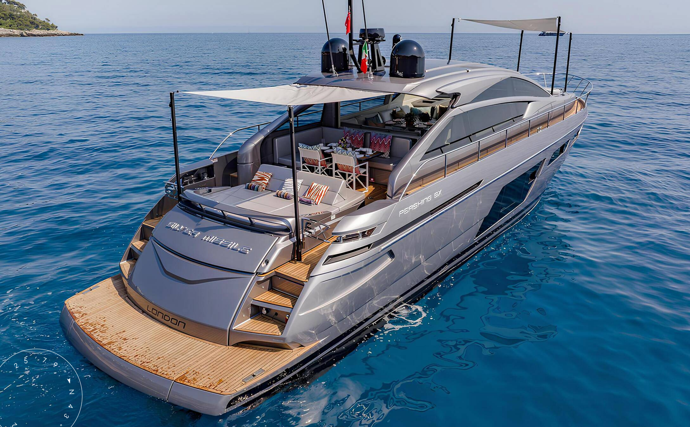
EXTERIOR PERSHING 6X 2023 MY SILVER MISSILE