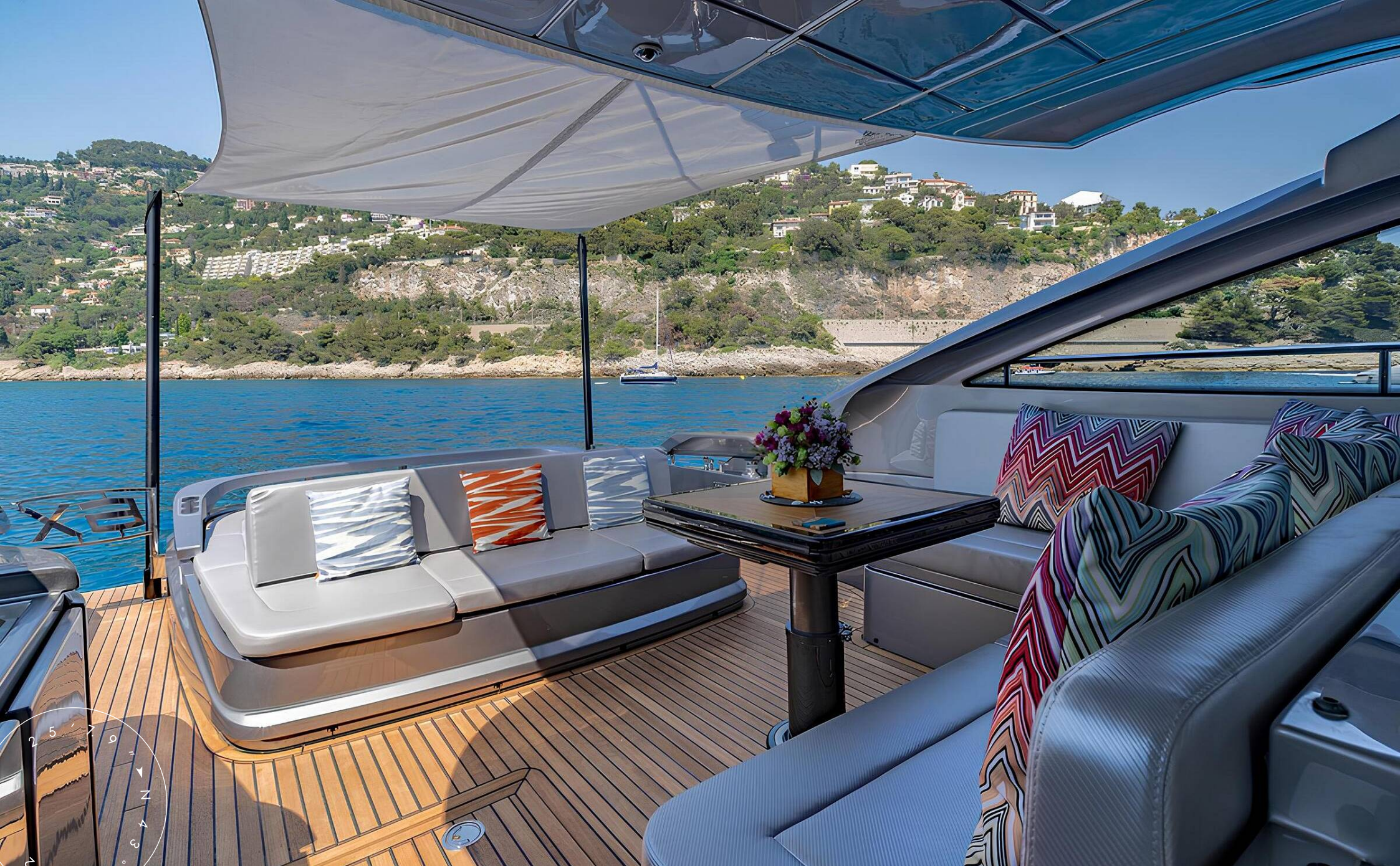
COCKPIT SEATING AREA