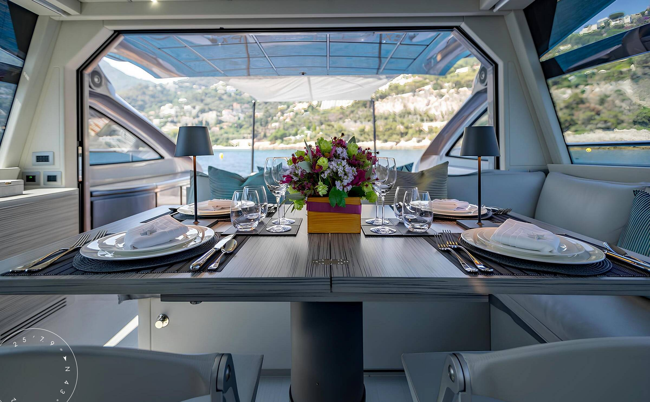
MAIN SALON DINING AREA