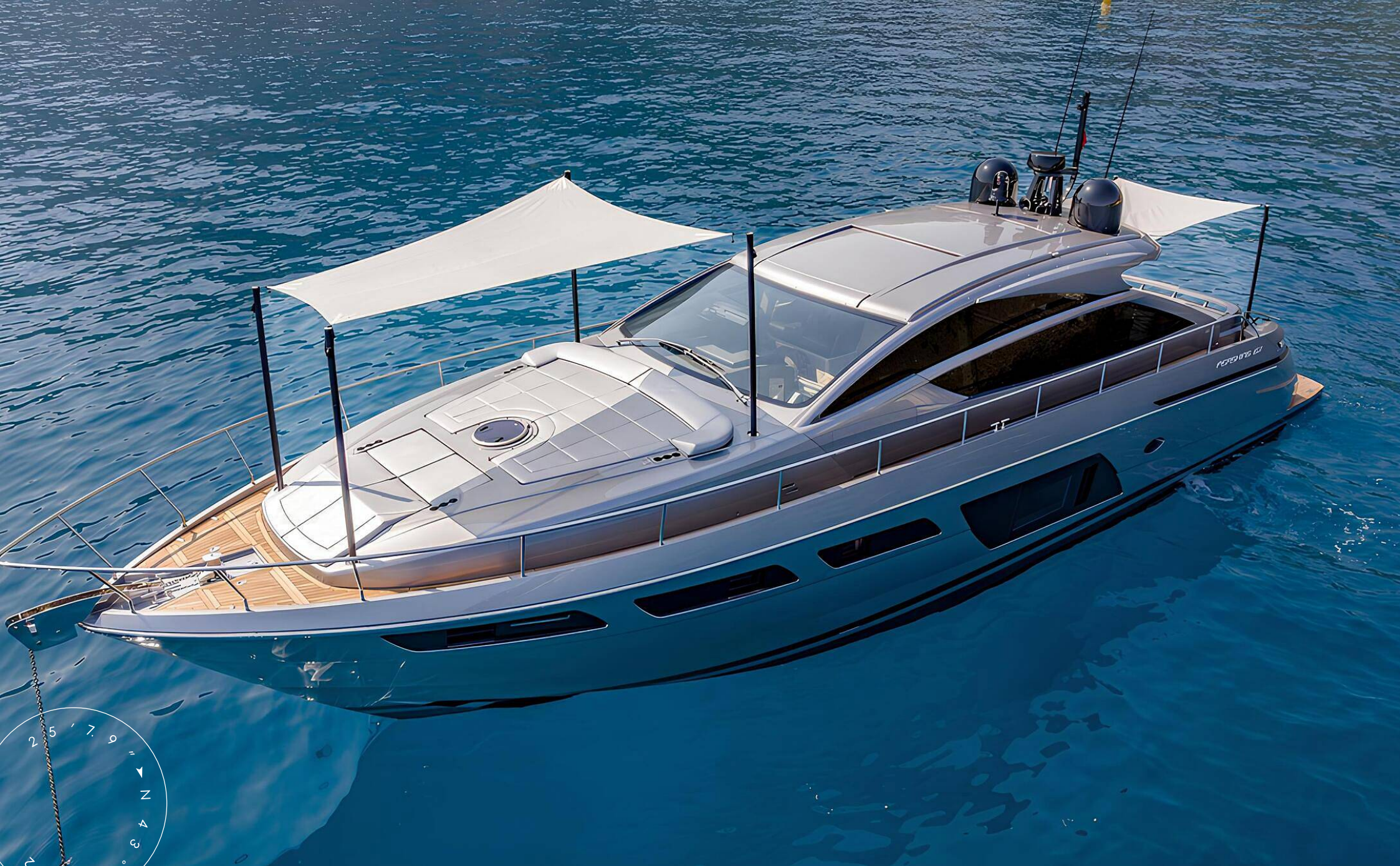
EXTERIOR PERSHING 6X 2023 MY SILVER MISSILE