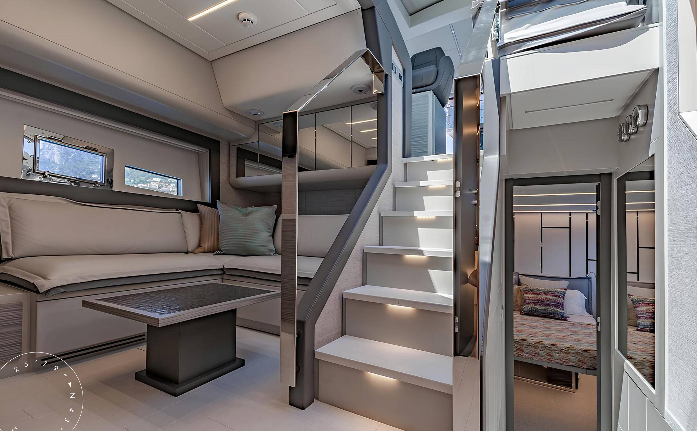
STAIRS FROM MD TO LD