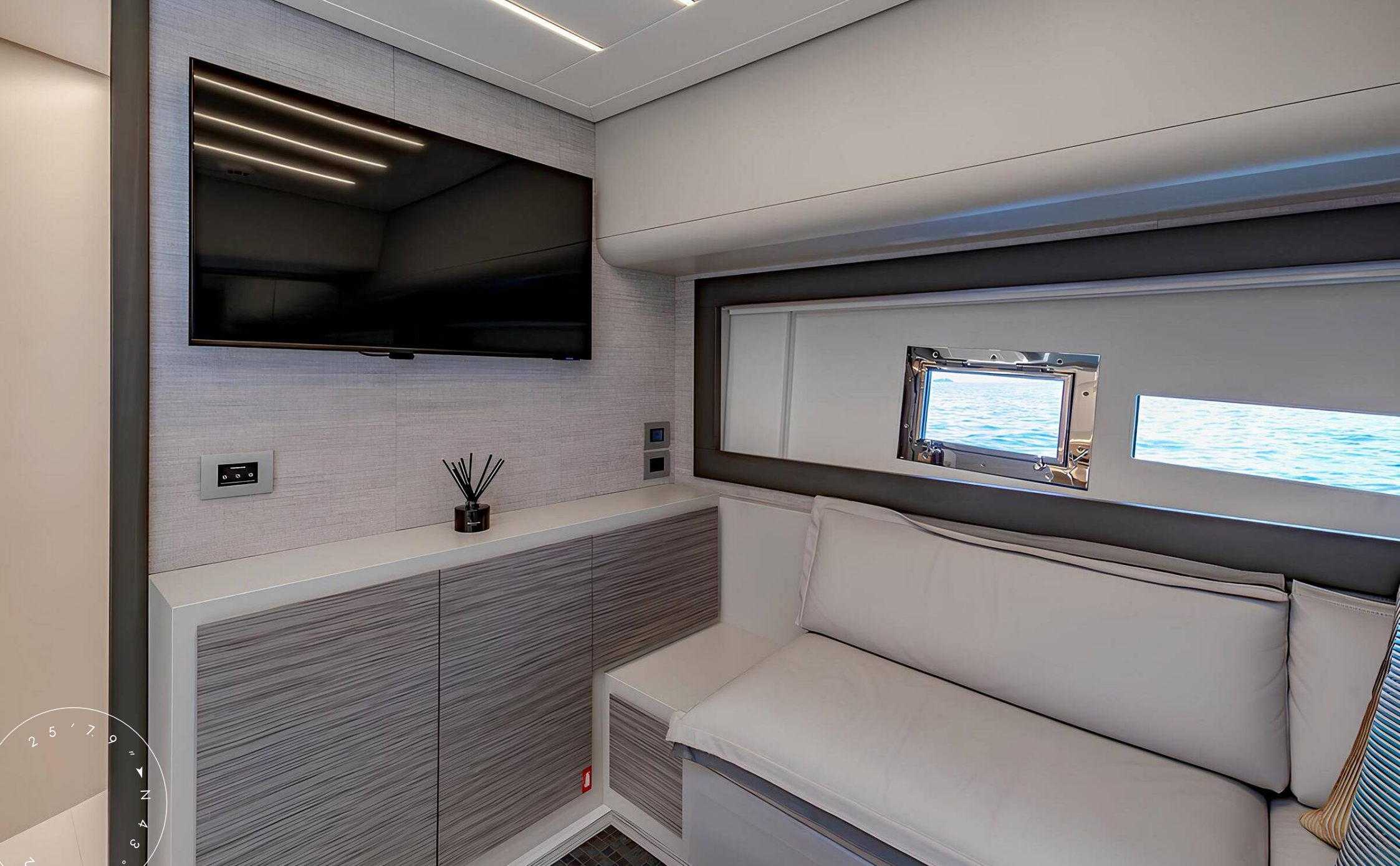
LOWER DECK LOBBY