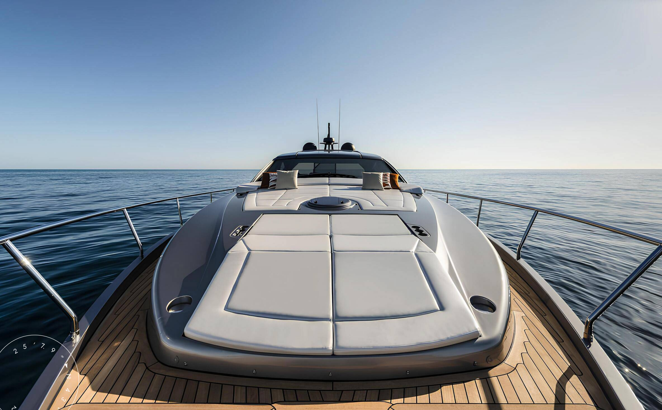
BOW SUNBATHING AREA