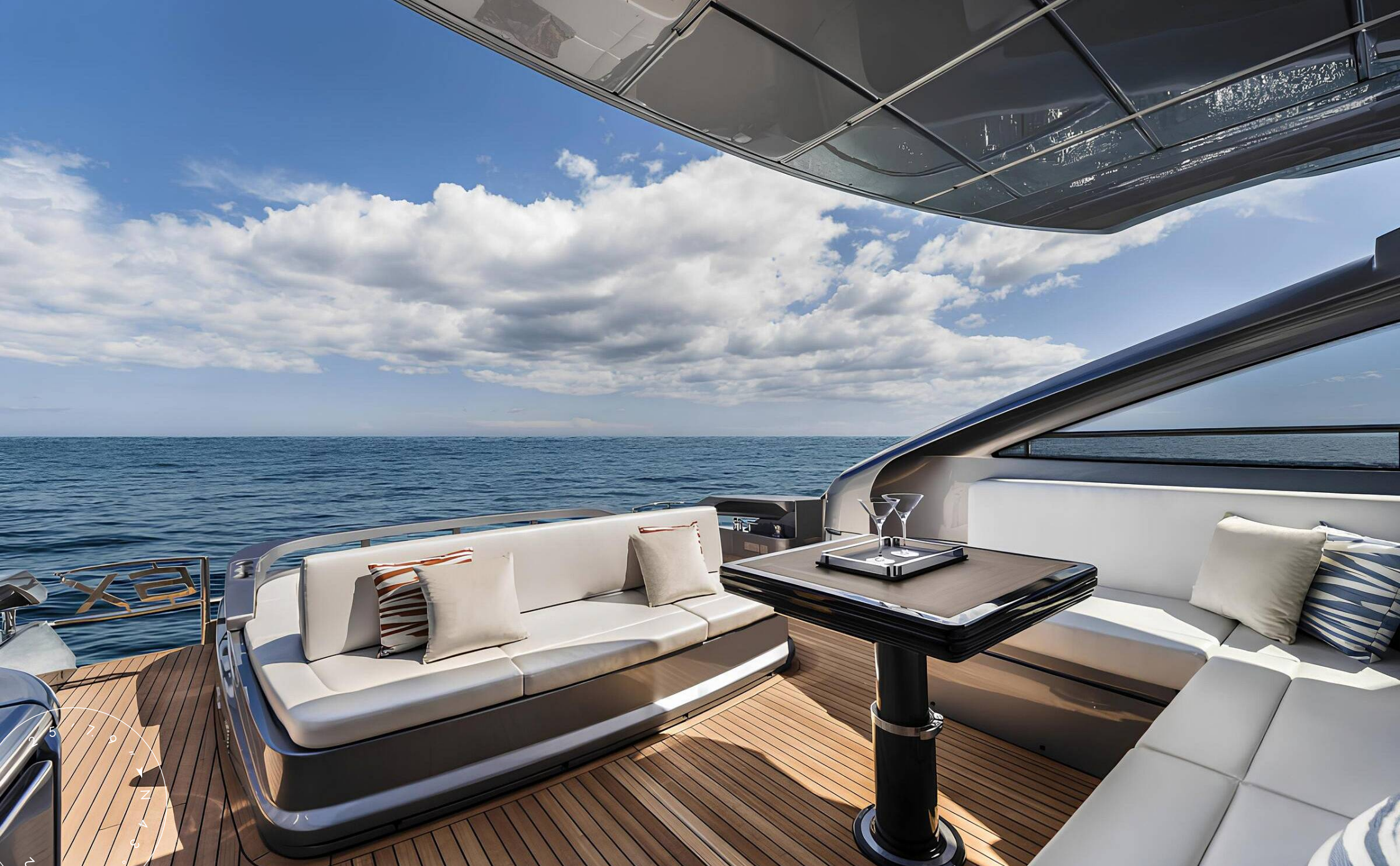
MAIN DECK LOUNGE AREA