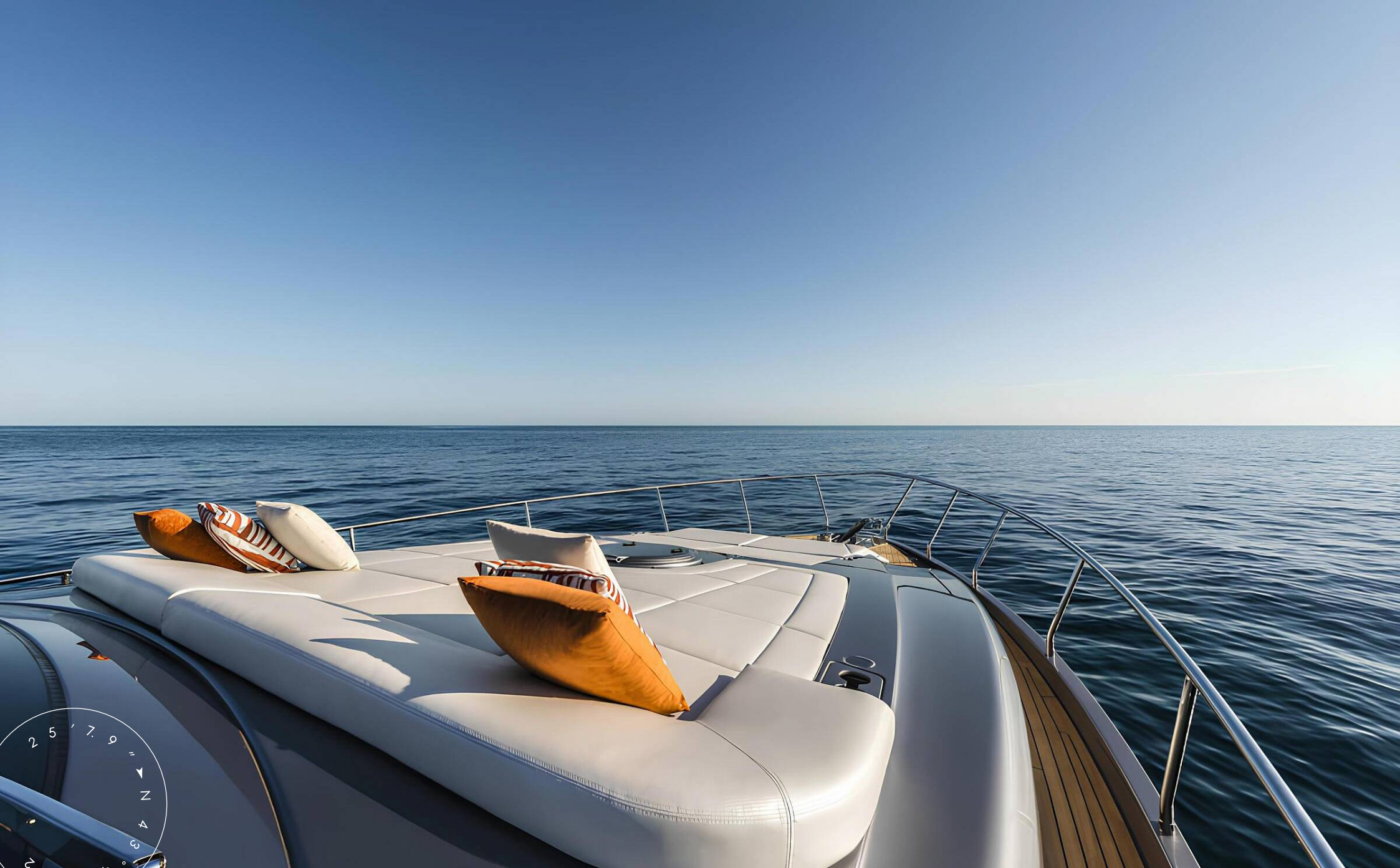
BOW SUNBATHING AREA