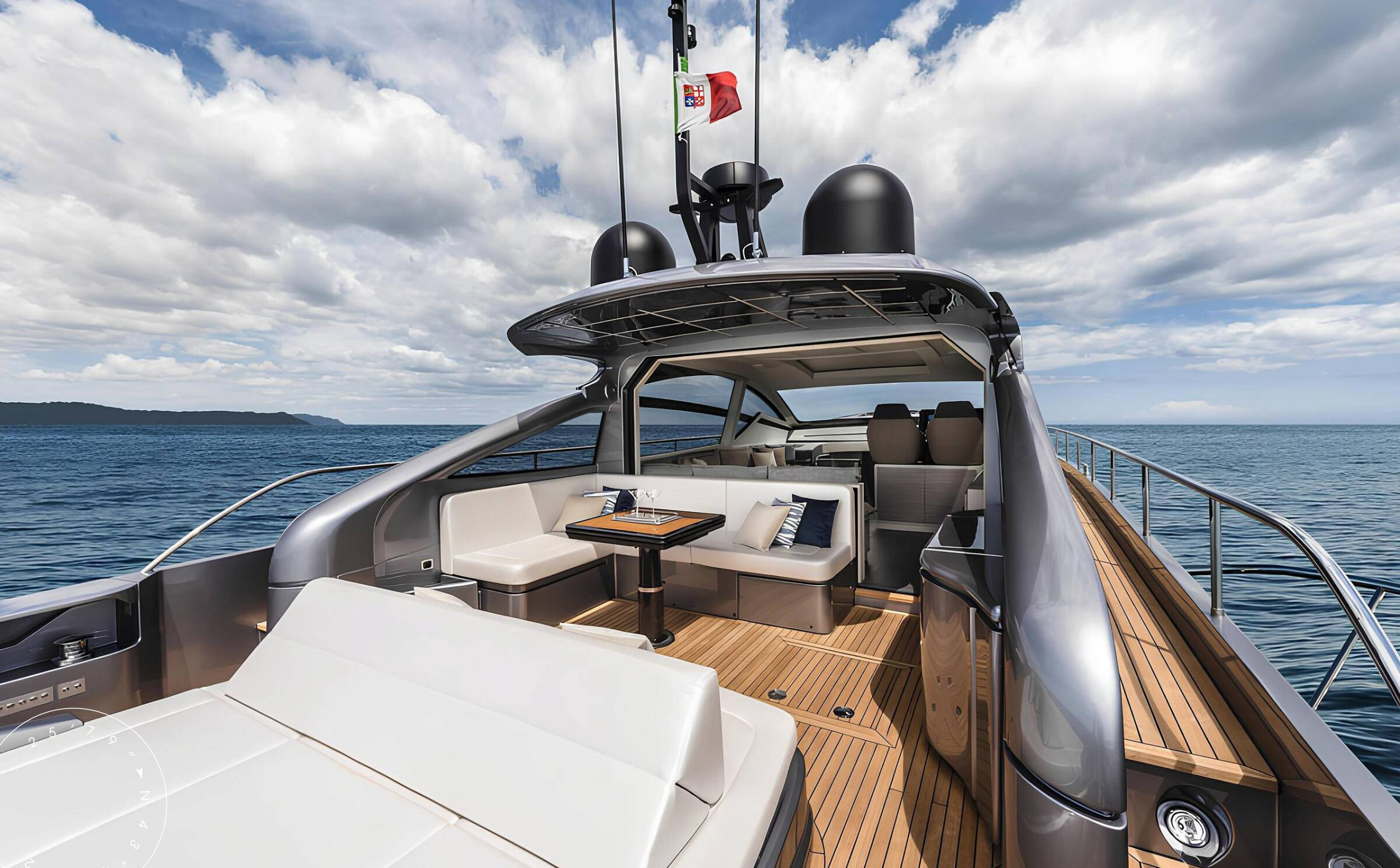
MAIN DECK LOUNGE AREA