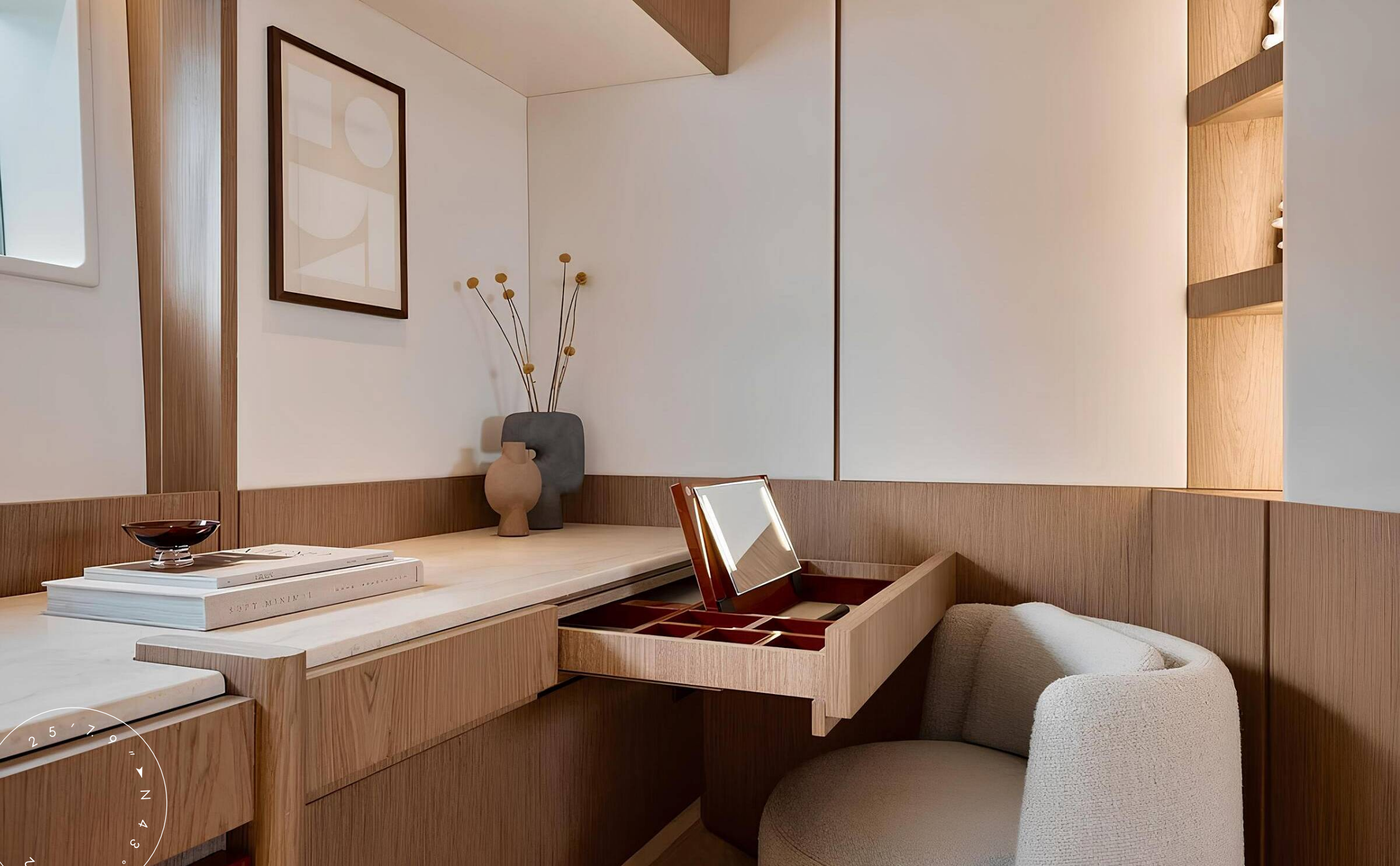
MAKE-UP TABLE IN MASTER CABIN