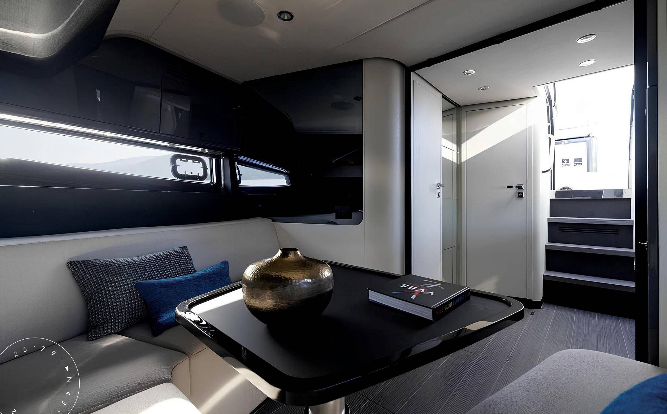
LOWER DECK DINING AREA