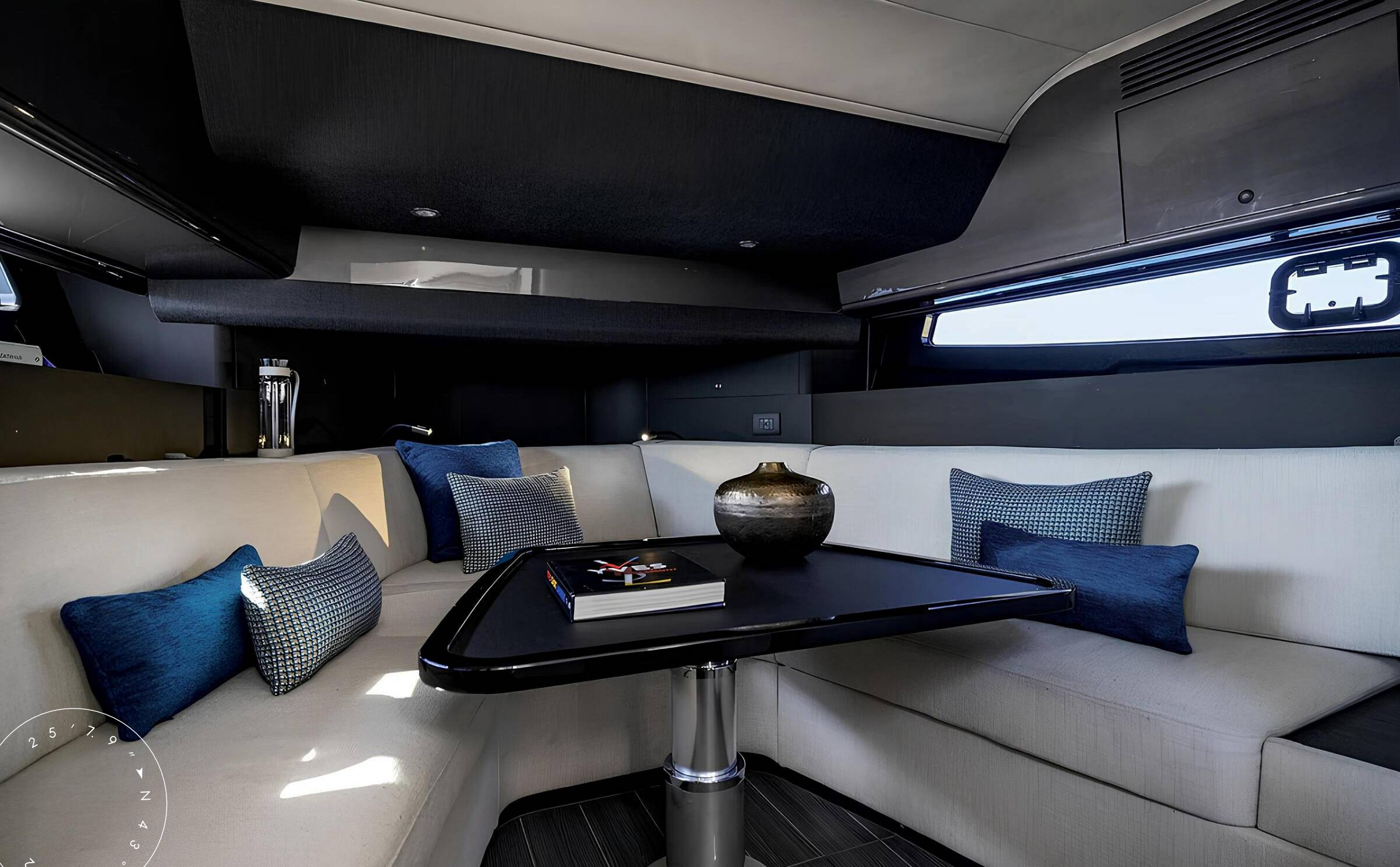
LOWER DECK DINING AREA