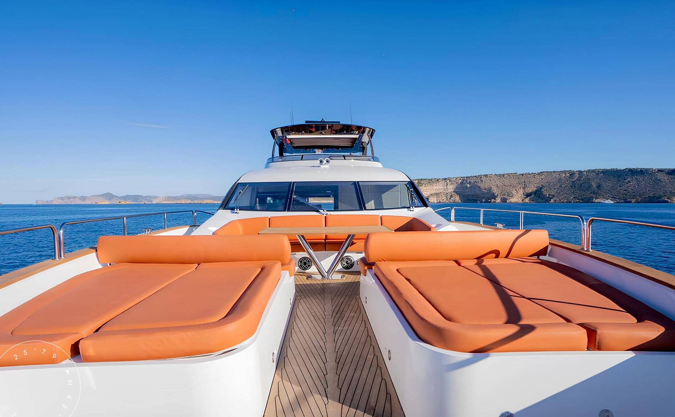
BOW SUNBATHING AREA