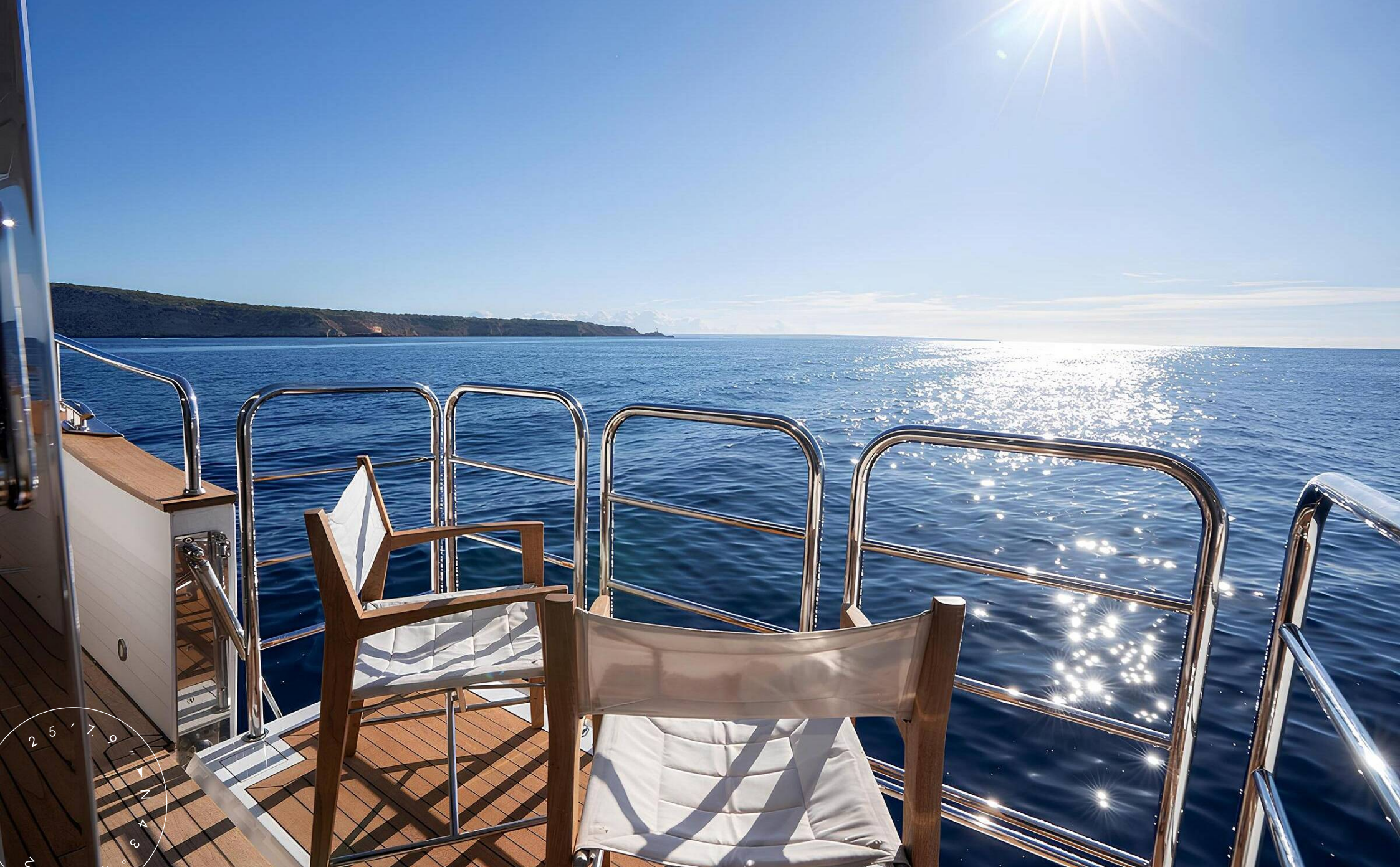
FOLDING STARBOARD BALCONY