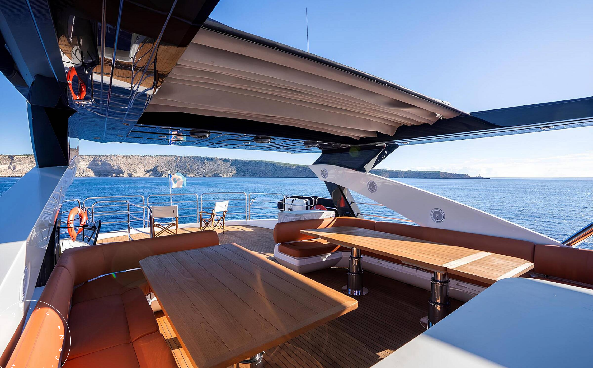
FLYBRIDGE DINING AREA