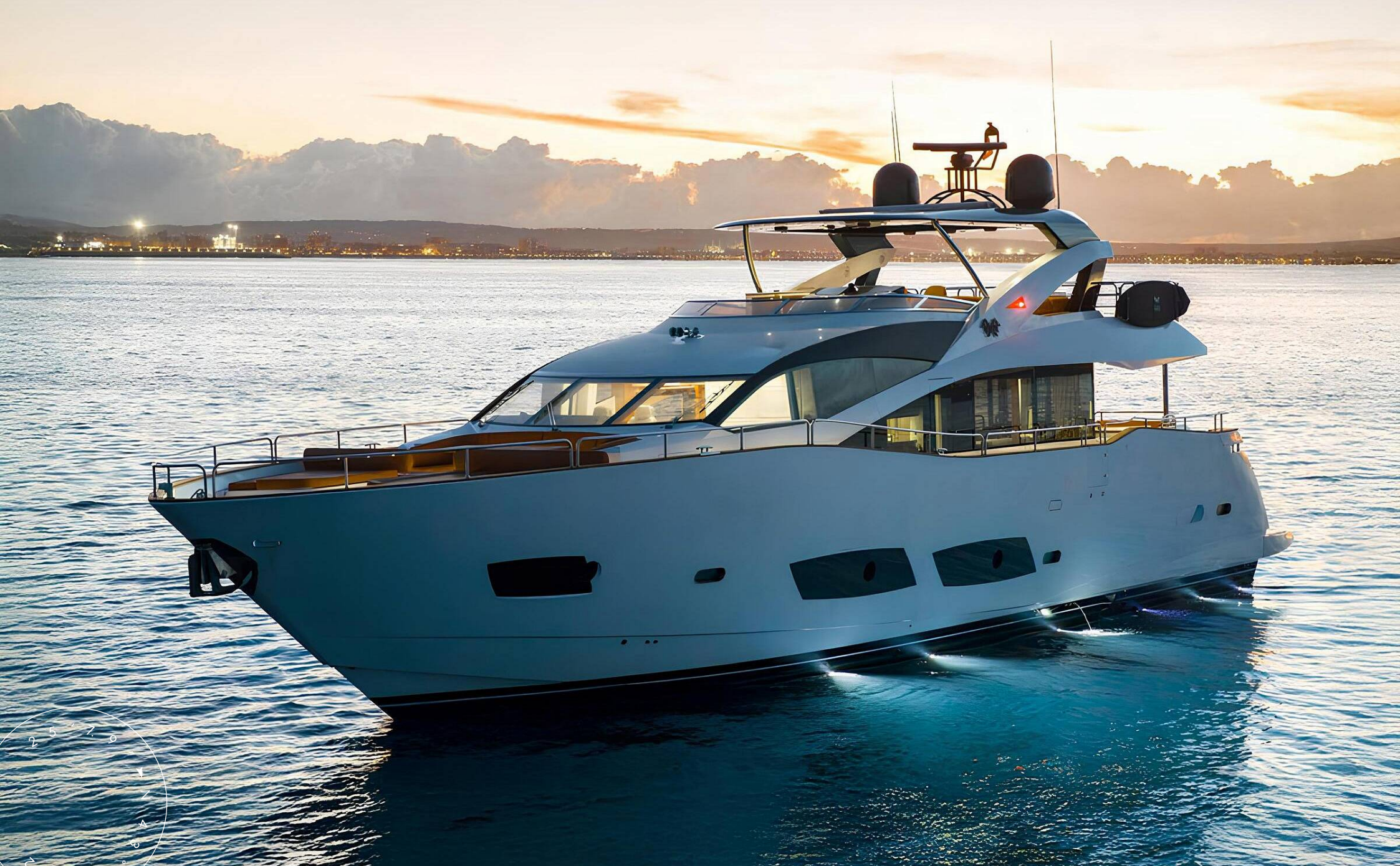
EXTERIOR SUNSEEKER 28 METRE YACHT 2015 MY RIII