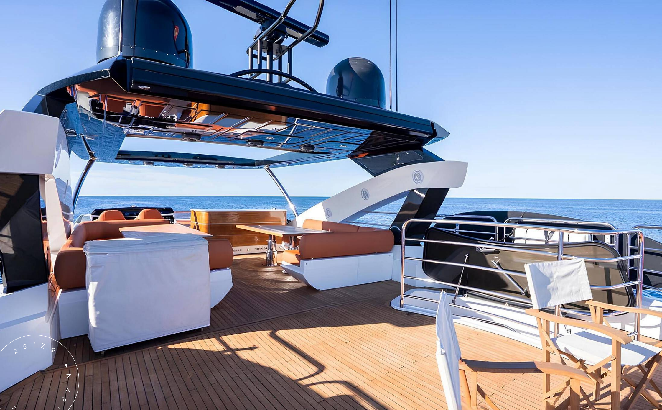
FLYBRIDGE LOUNGE AREA