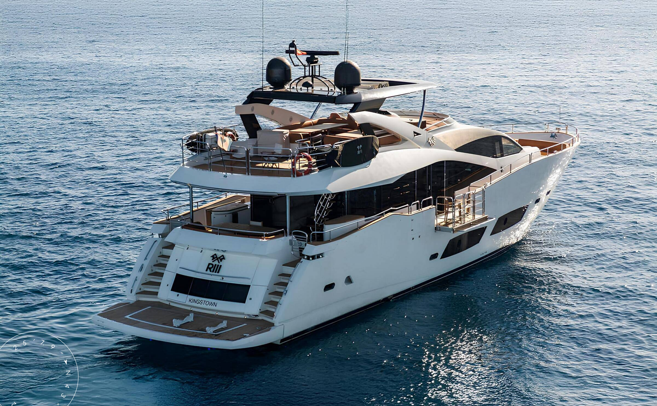
EXTERIOR SUNSEEKER 28 METRE YACHT 2015 MY RIII