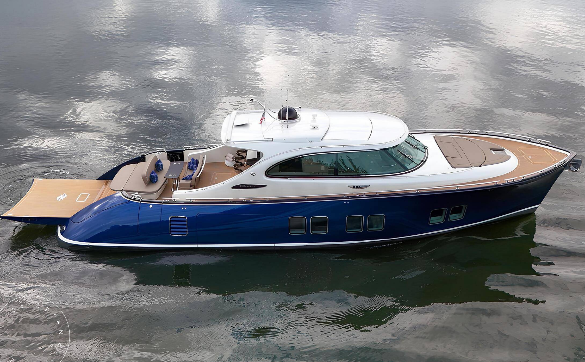
EXTERIOR ZEELANDER 72 2023 MY MADDAMC2