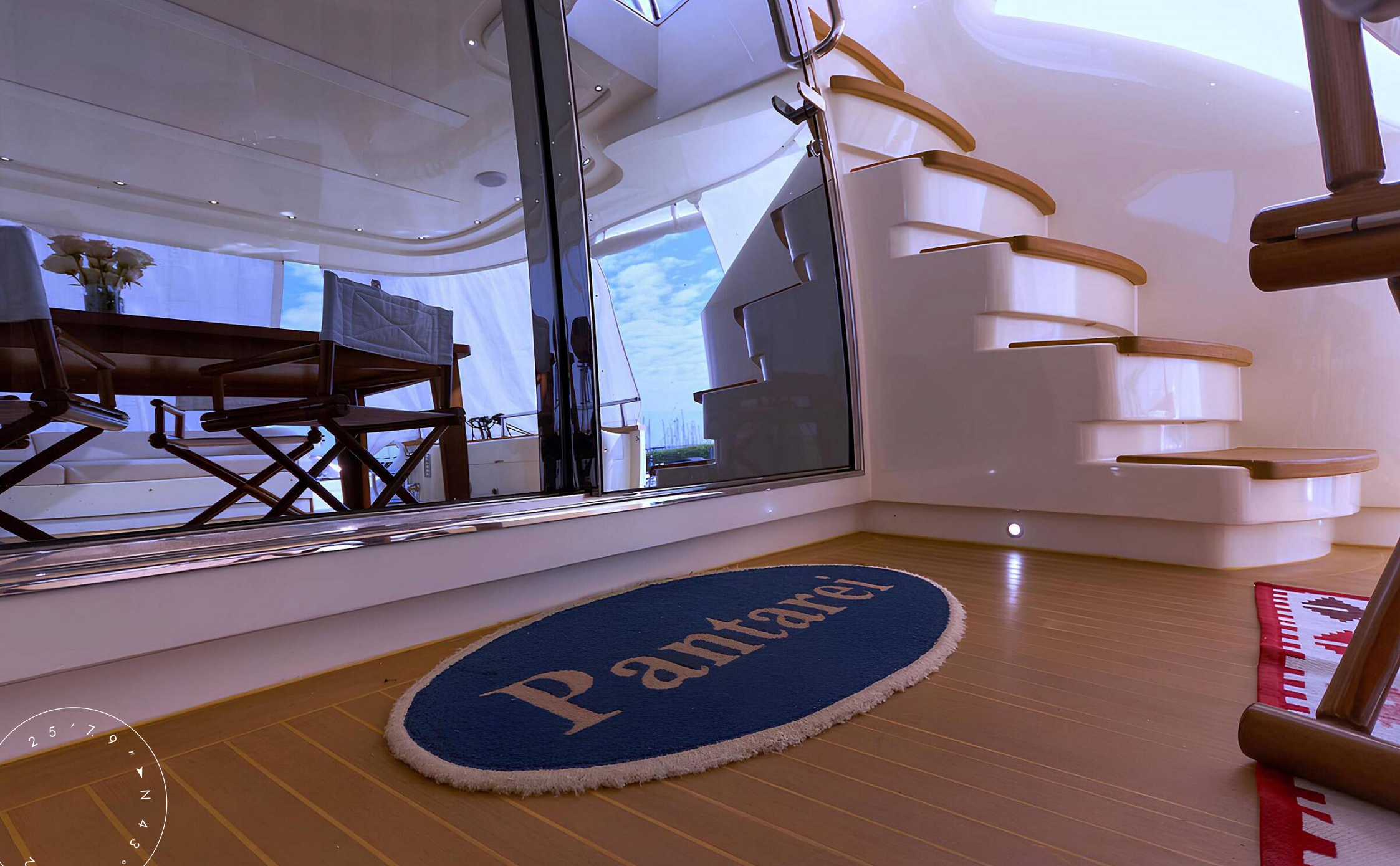
ENTRANCE TO THE MAIN SALON