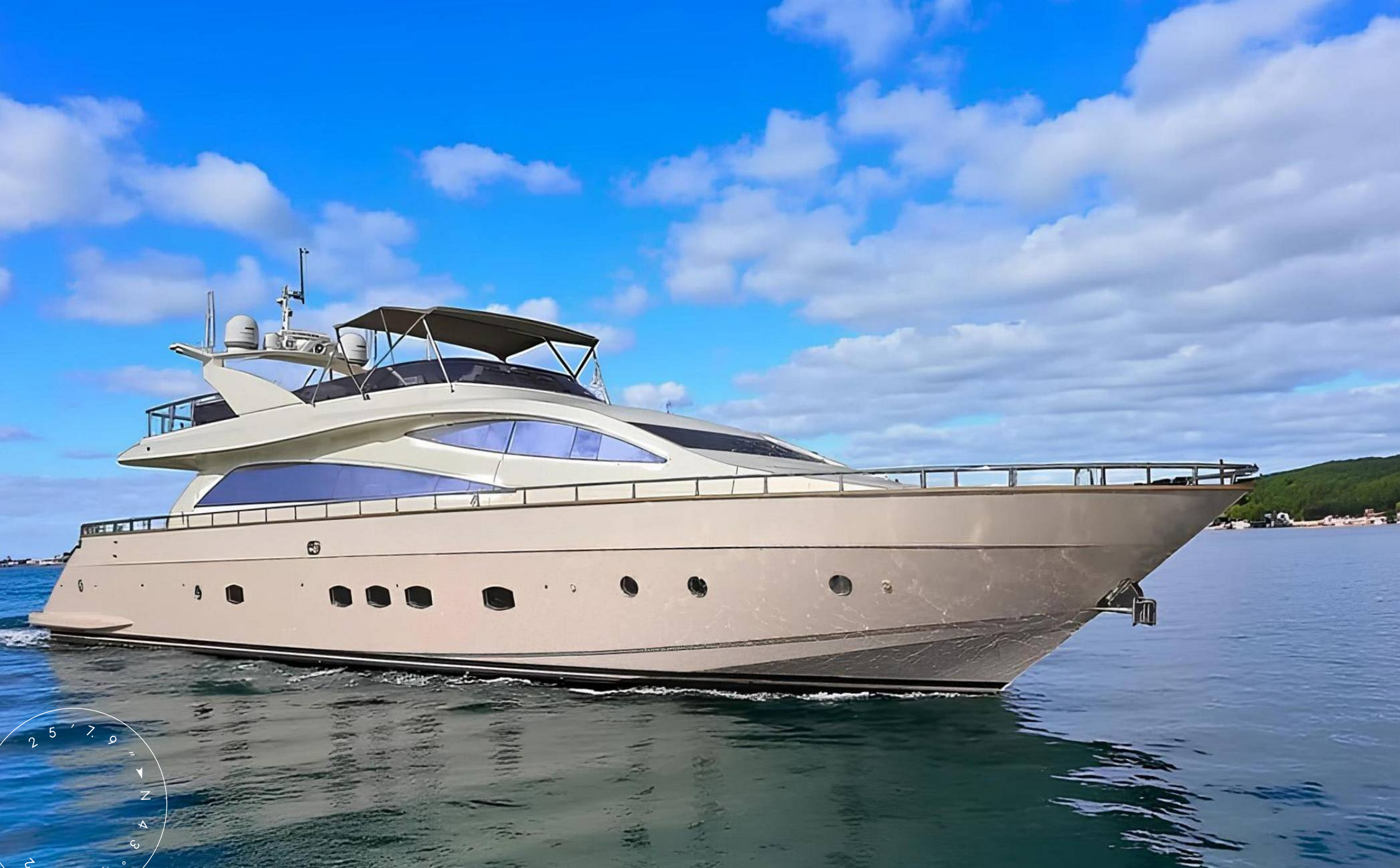
EXTERIOR AMER 92 2010 MY PANTAREI