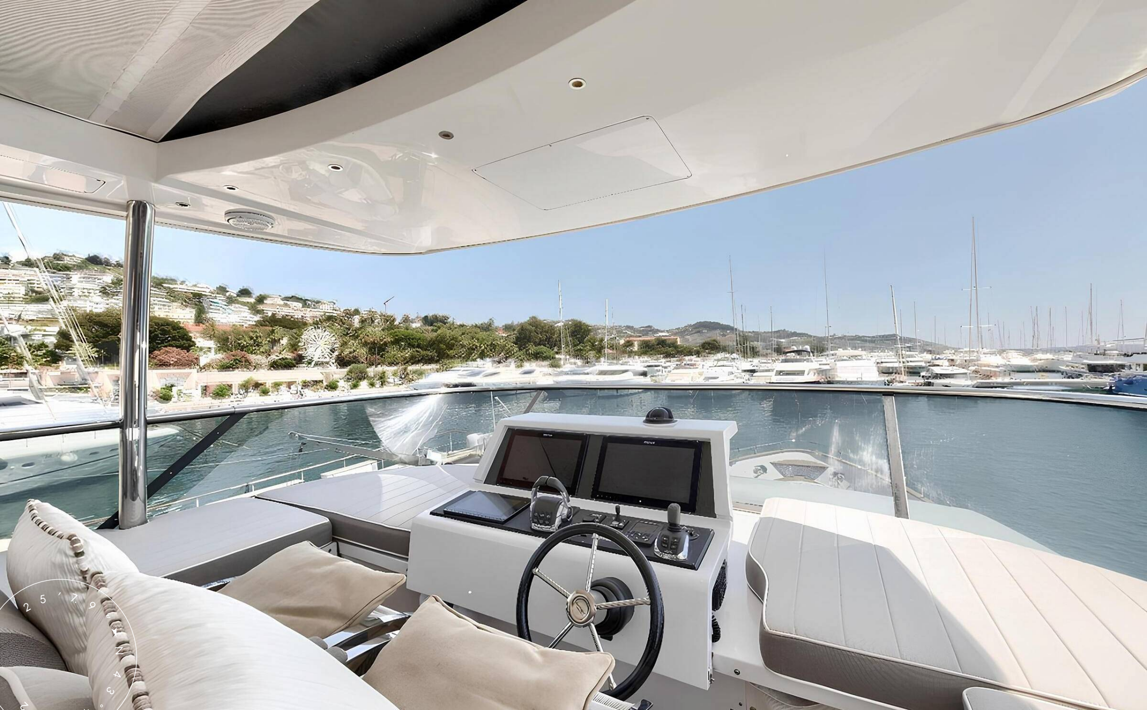
SECOND HELM STATION