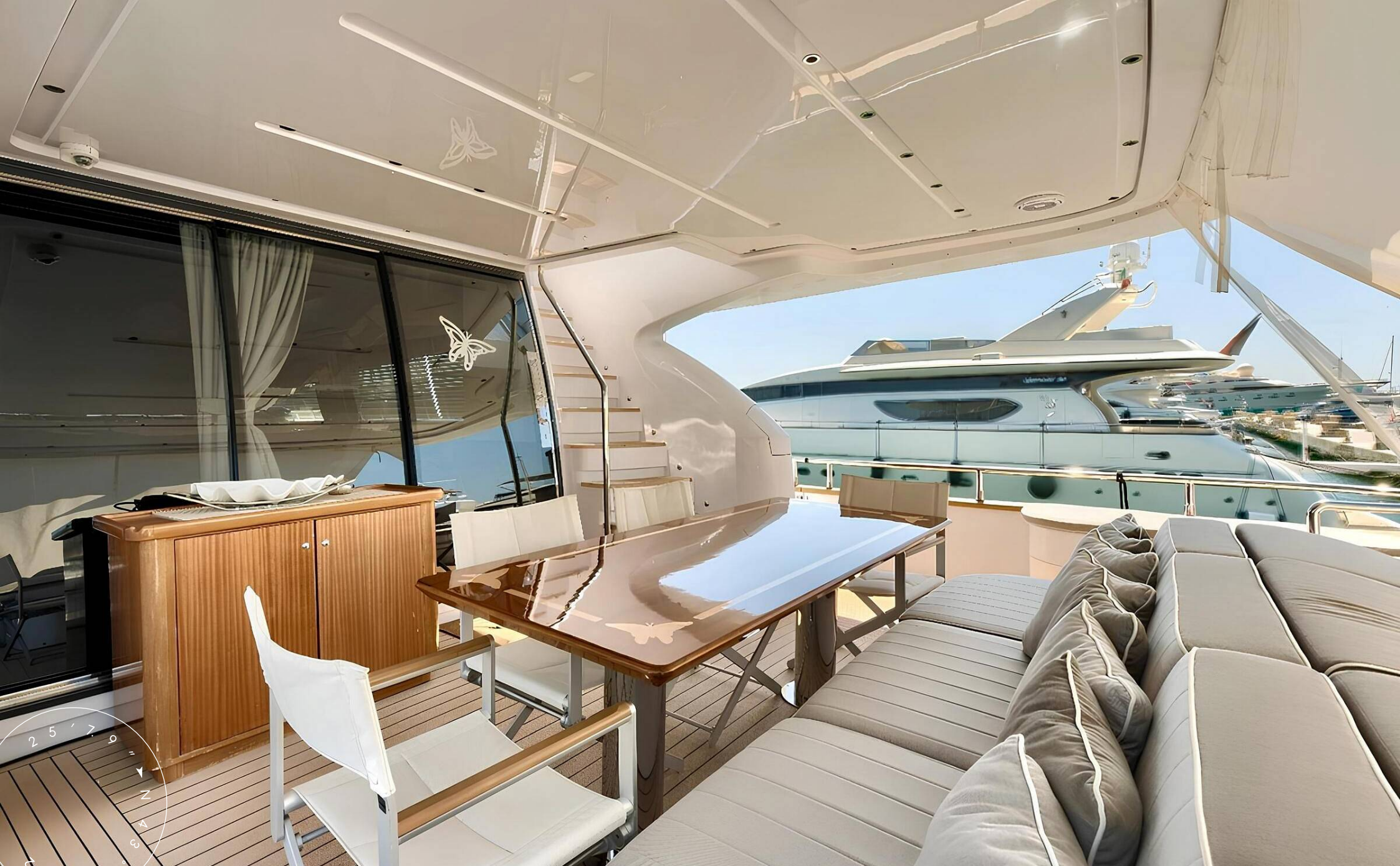
COCKPIT DINING AREA