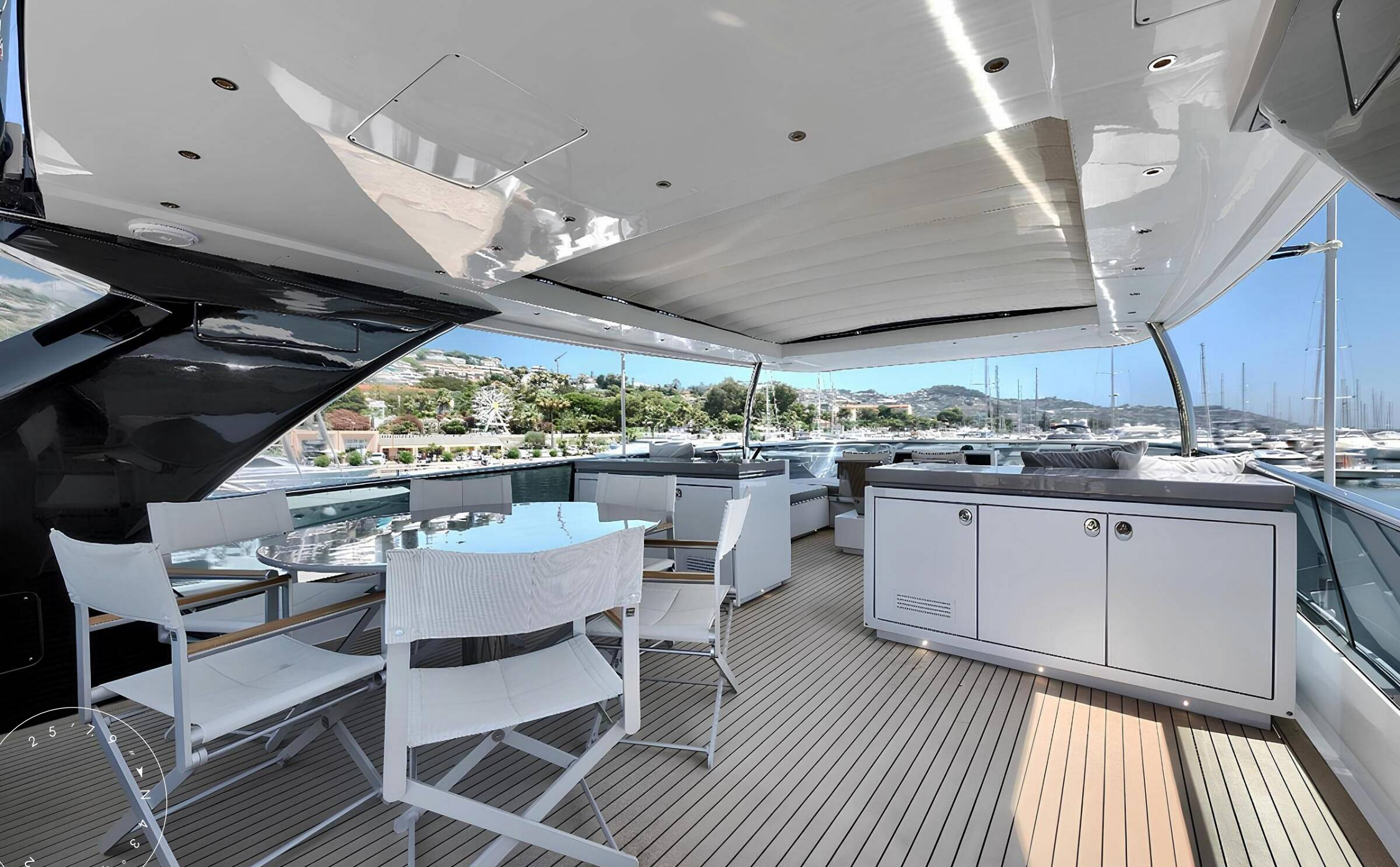
FLYBRIDGE DINING AREA