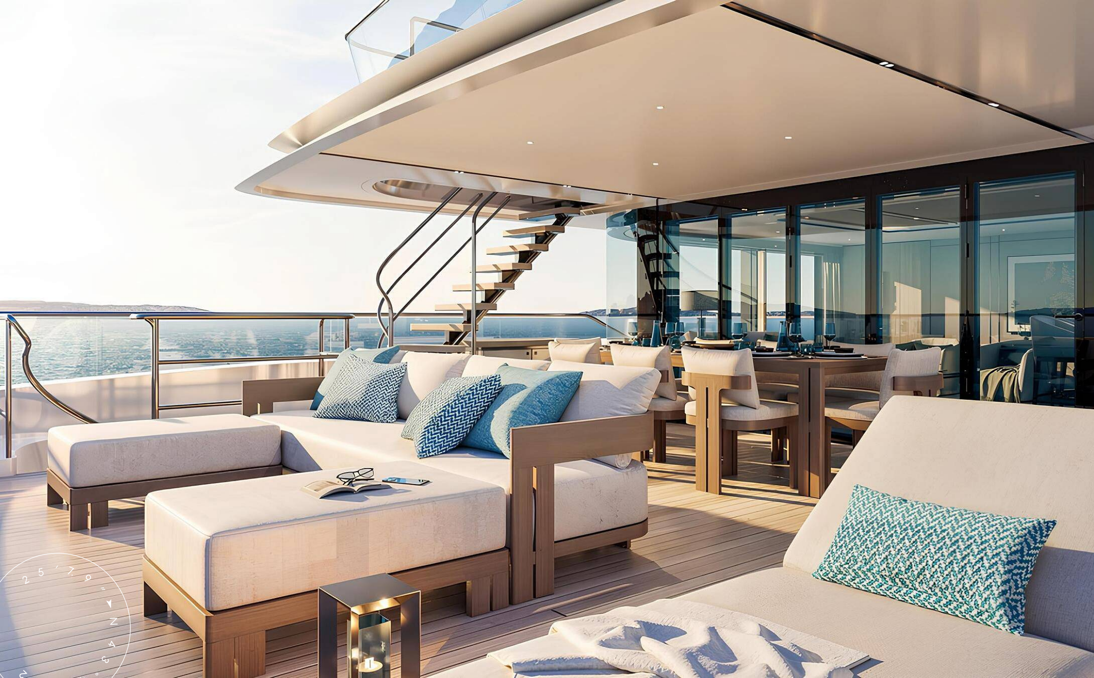
AFT UPPER DECK LOUNGE AREA