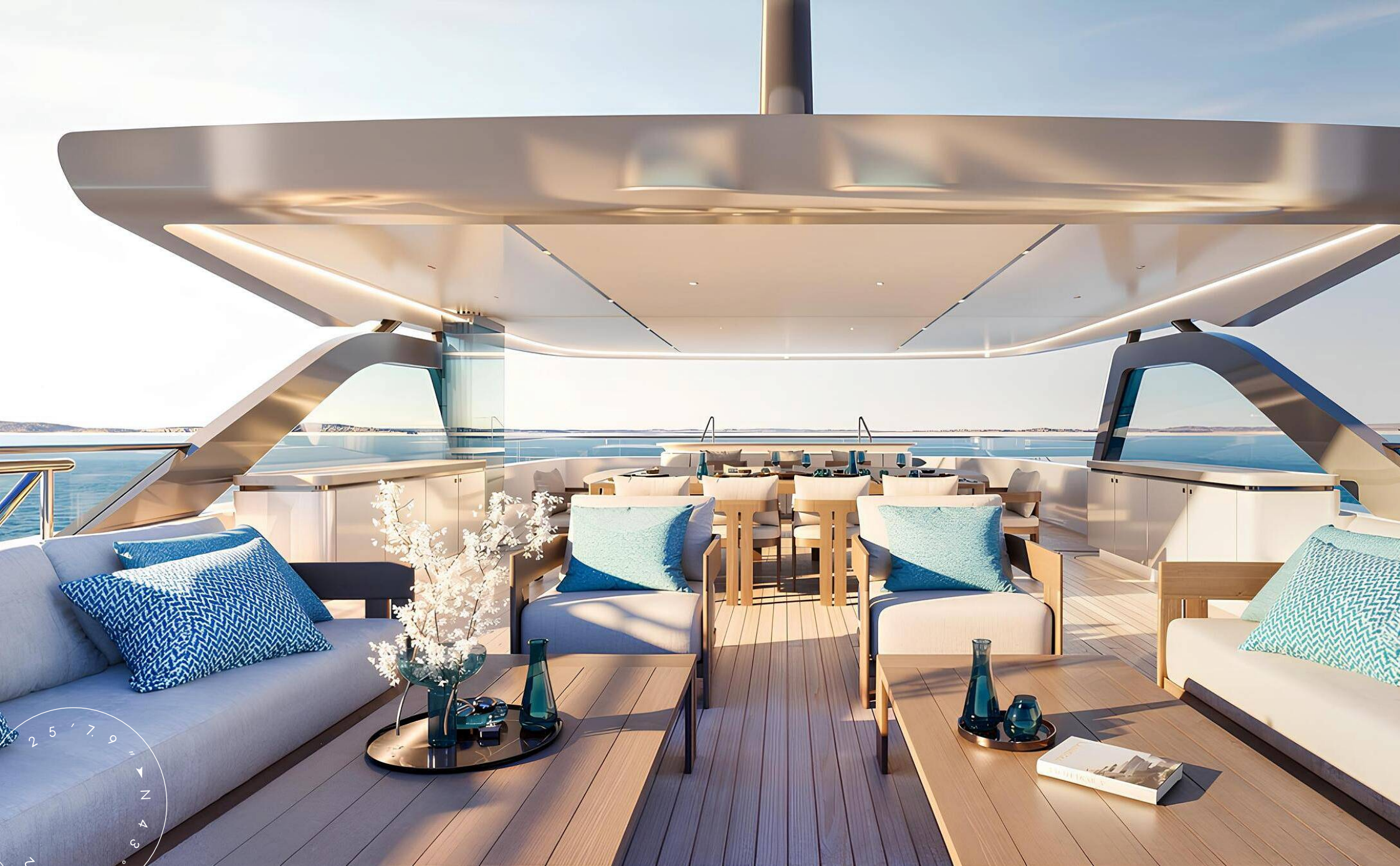
SUNDECK LOUNGE AREA