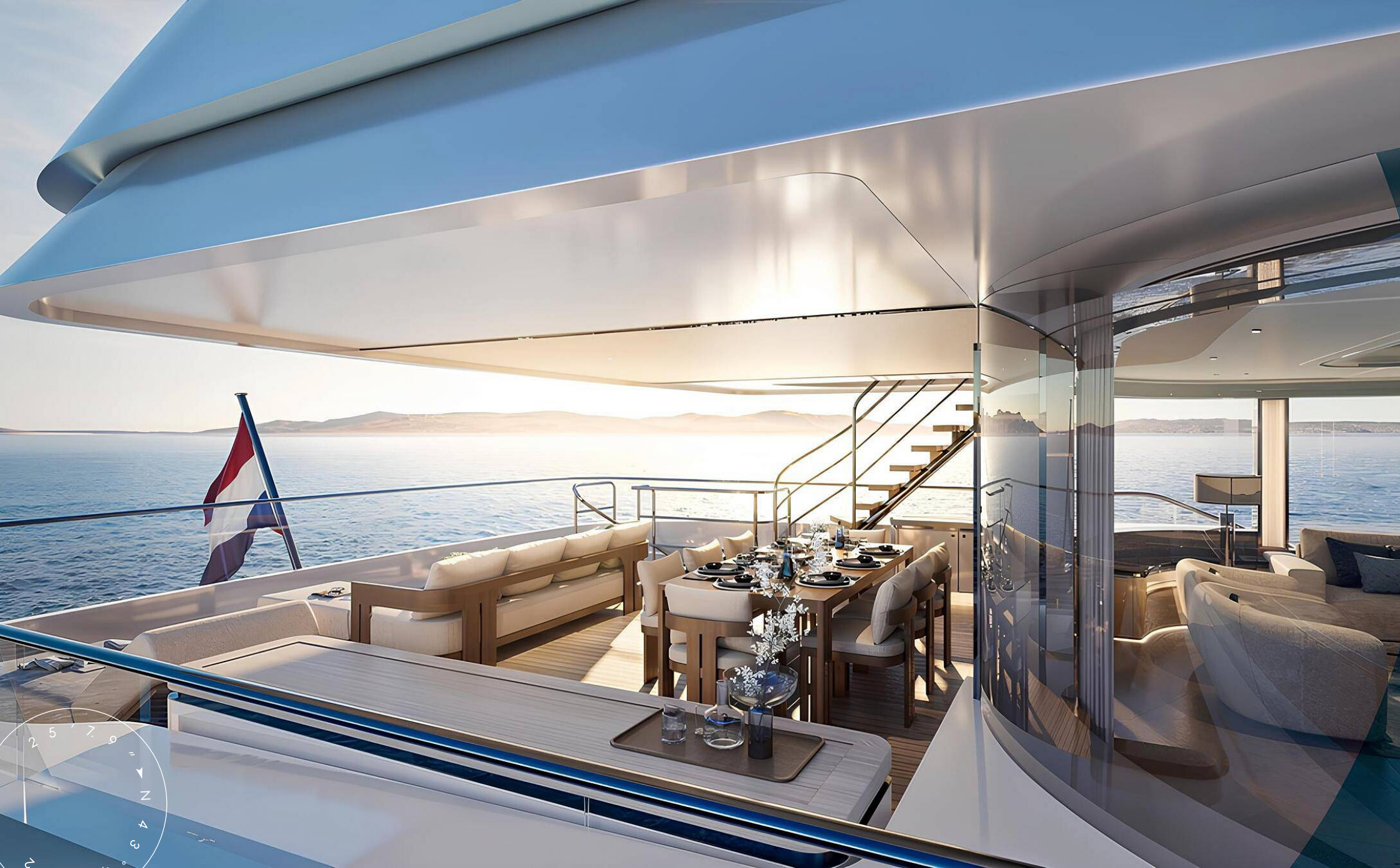
AFT UPPER DECK LOUNGE AREA