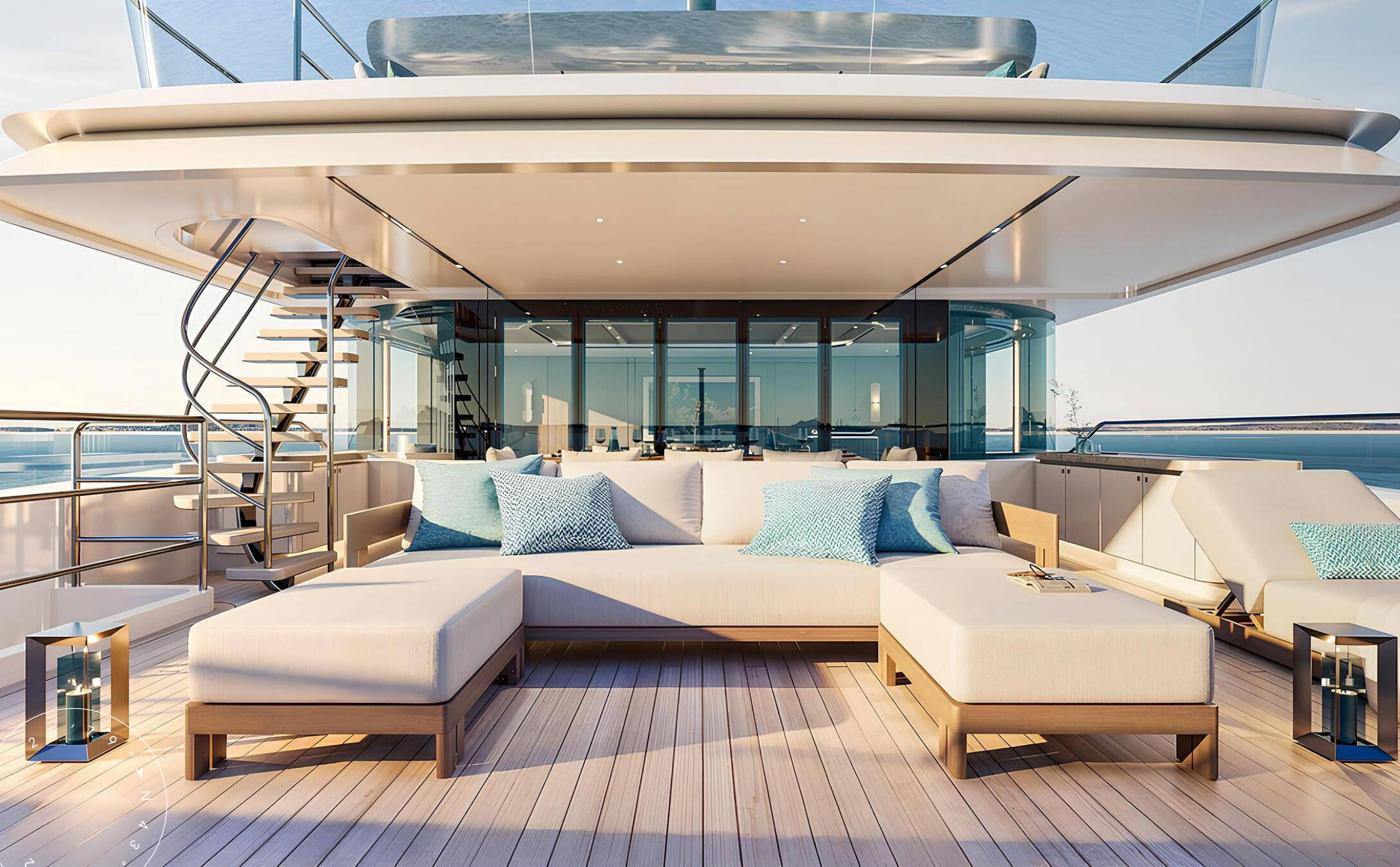
AFT UPPER DECK LOUNGE AREA