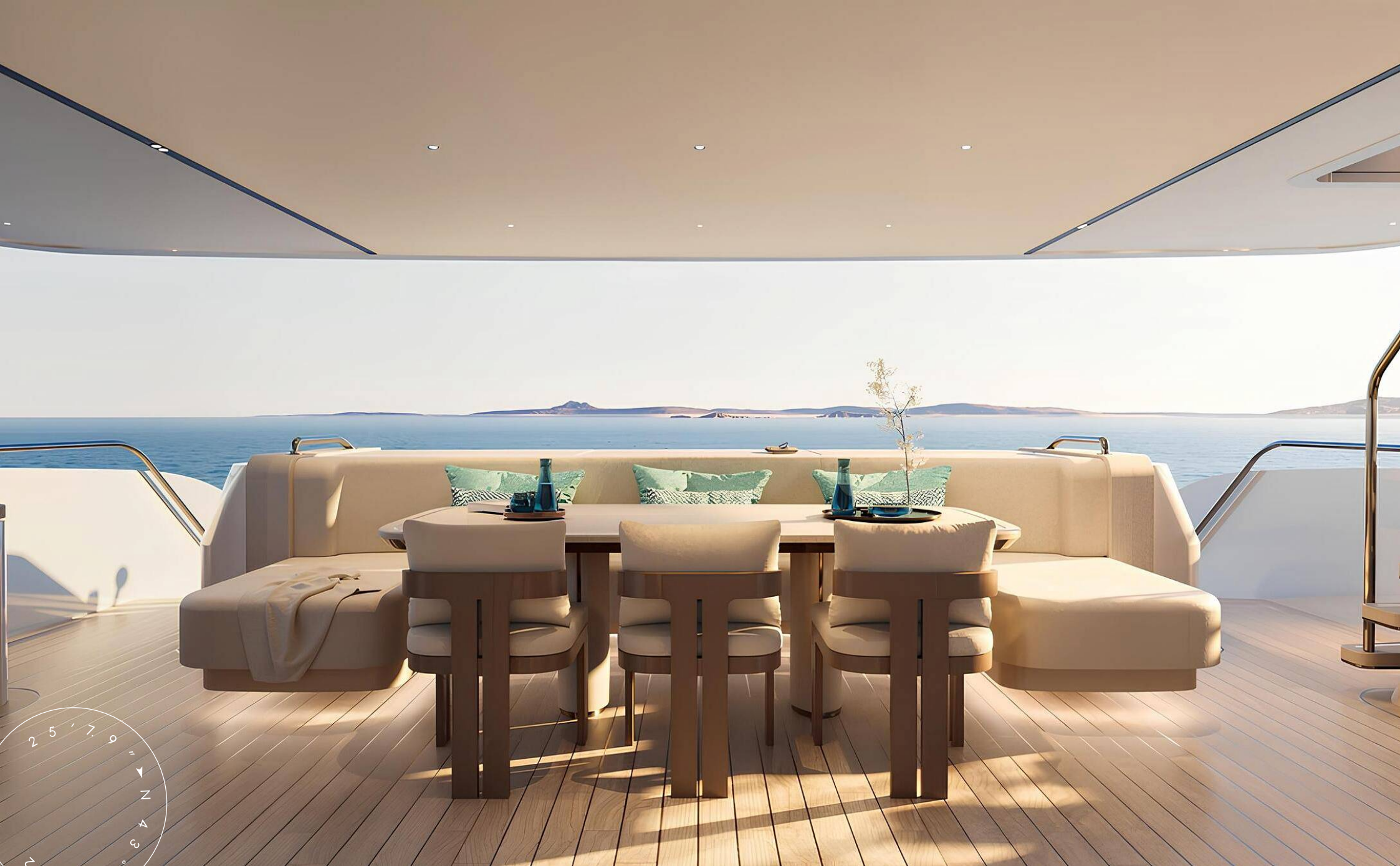
AFT MAIN DECK DINING AREA