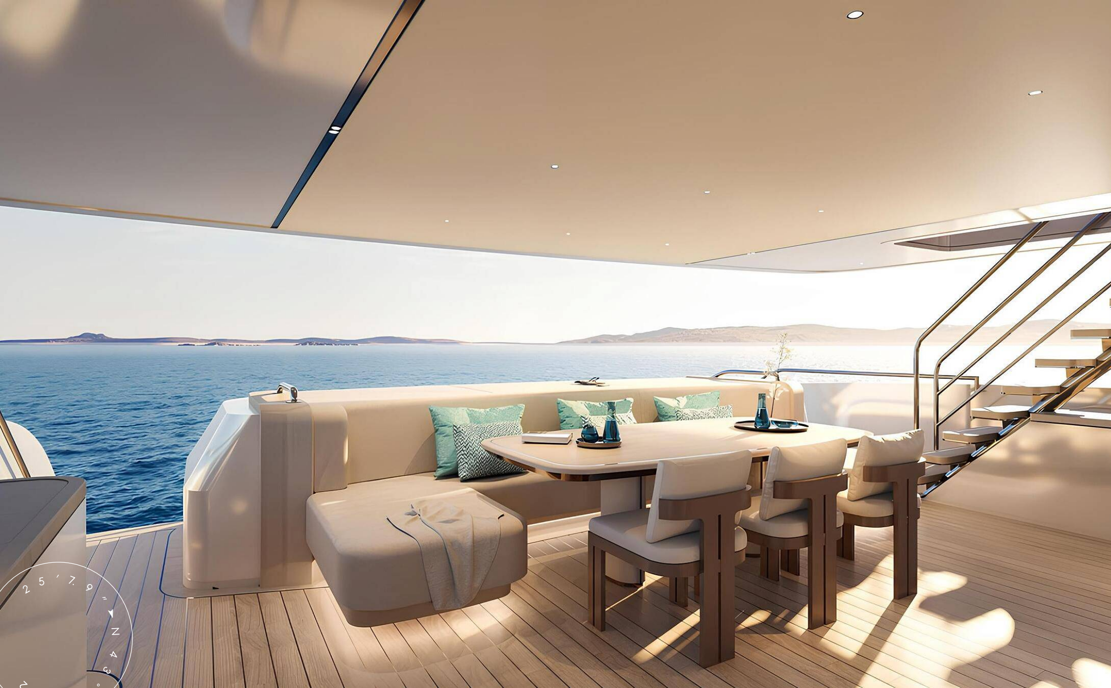
AFT MAIN DECK DINING AREA