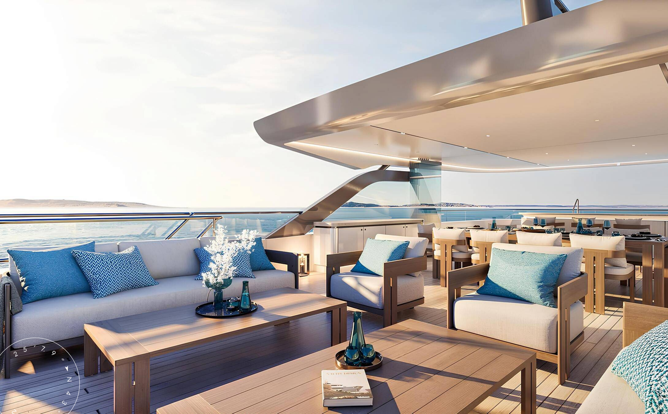
SUNDECK LOUNGE AREA