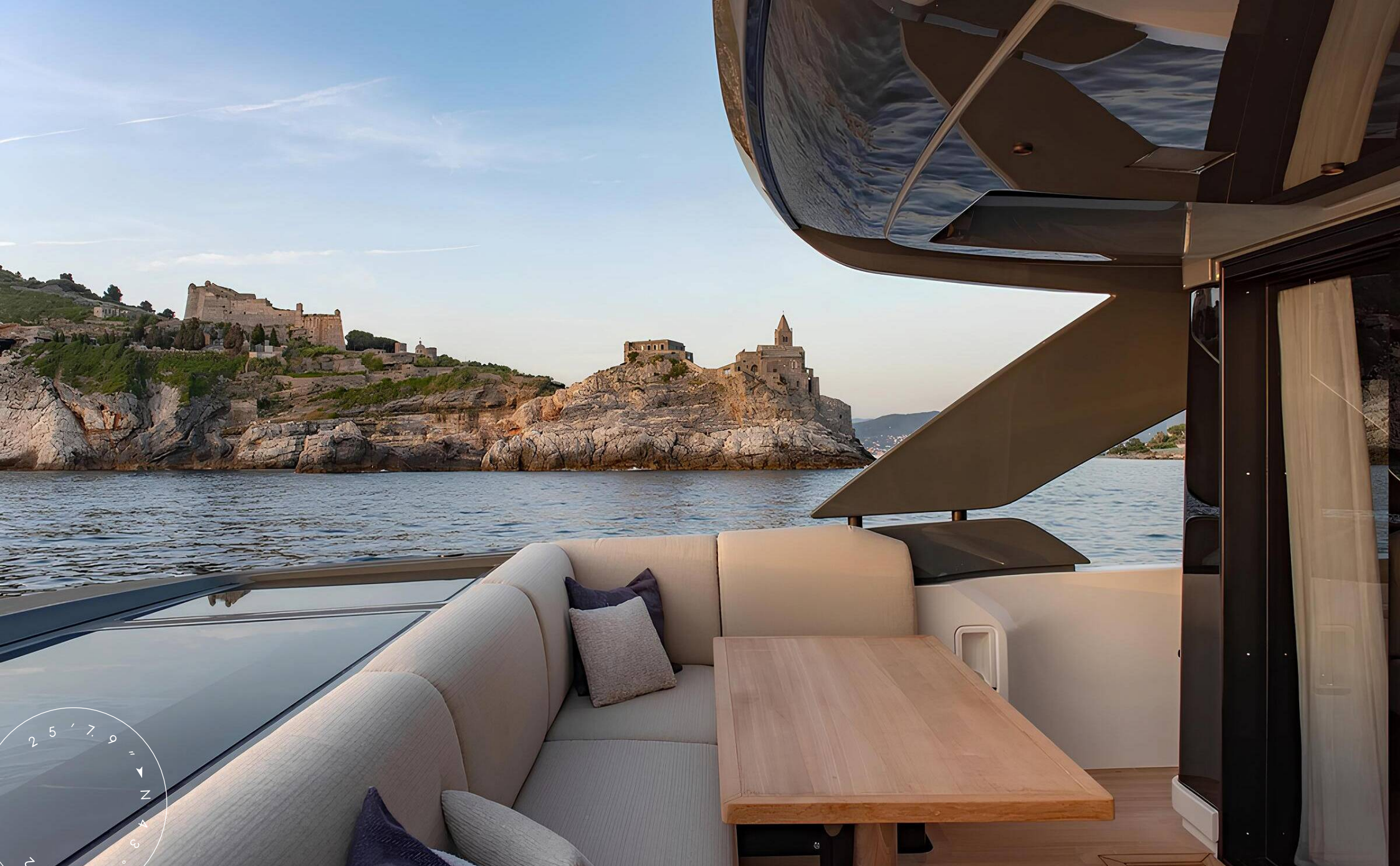
COCKPIT SEATING AREA