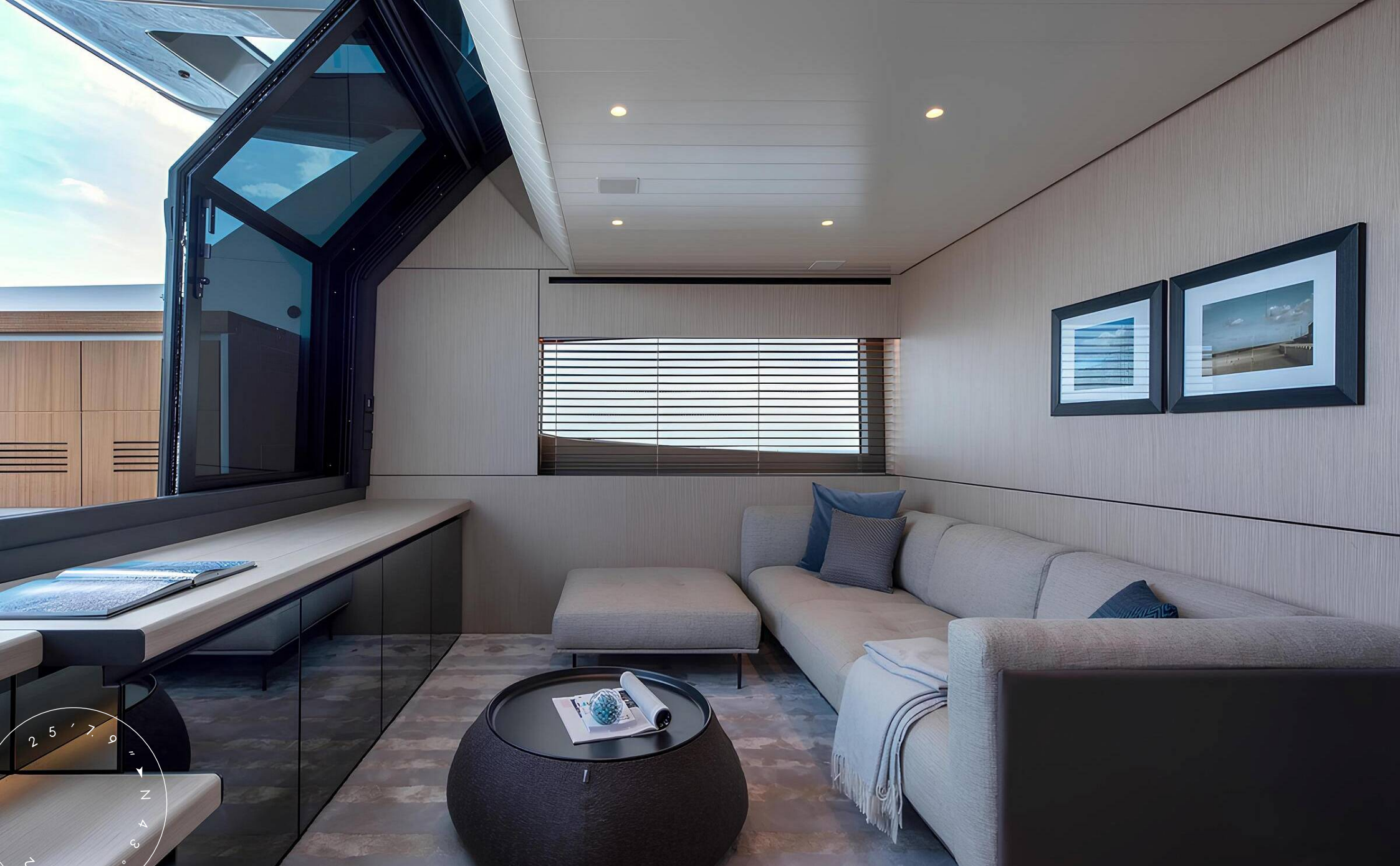
LOWER DECK LOBBY