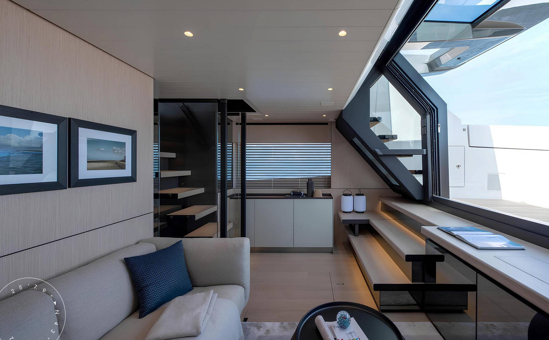
LOWER DECK LOBBY