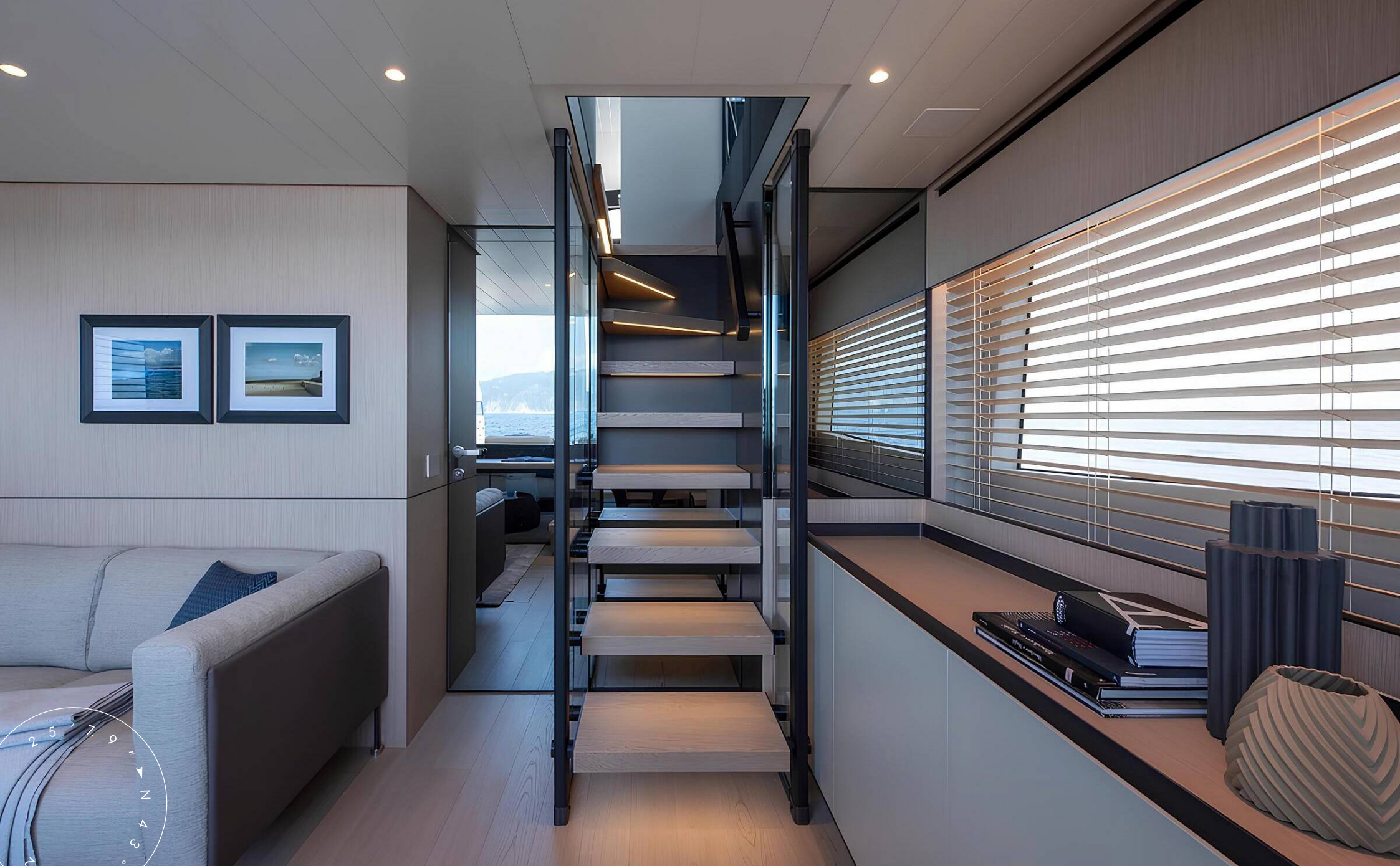
LOWER DECK LOBBY