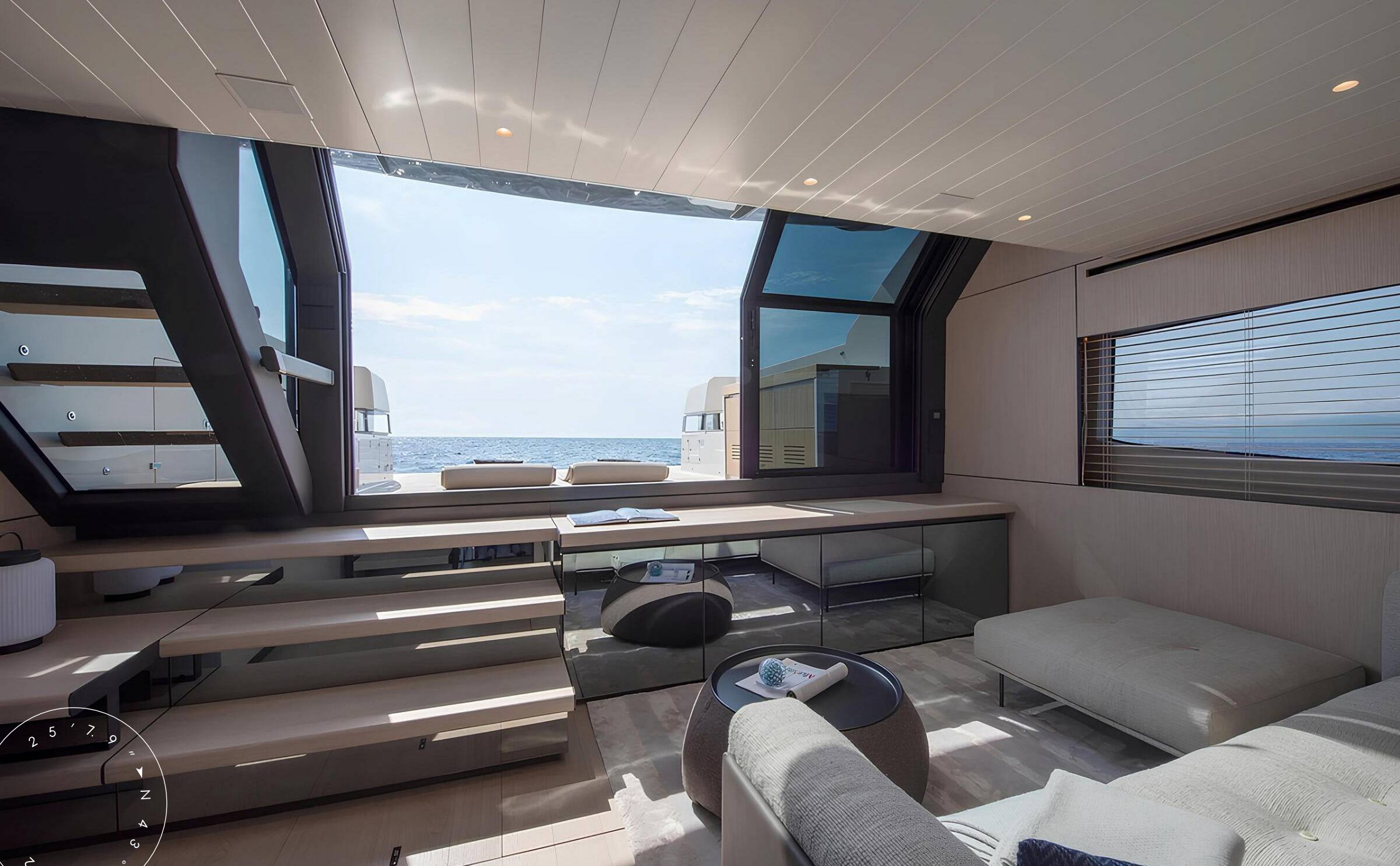
LOWER DECK LOBBY