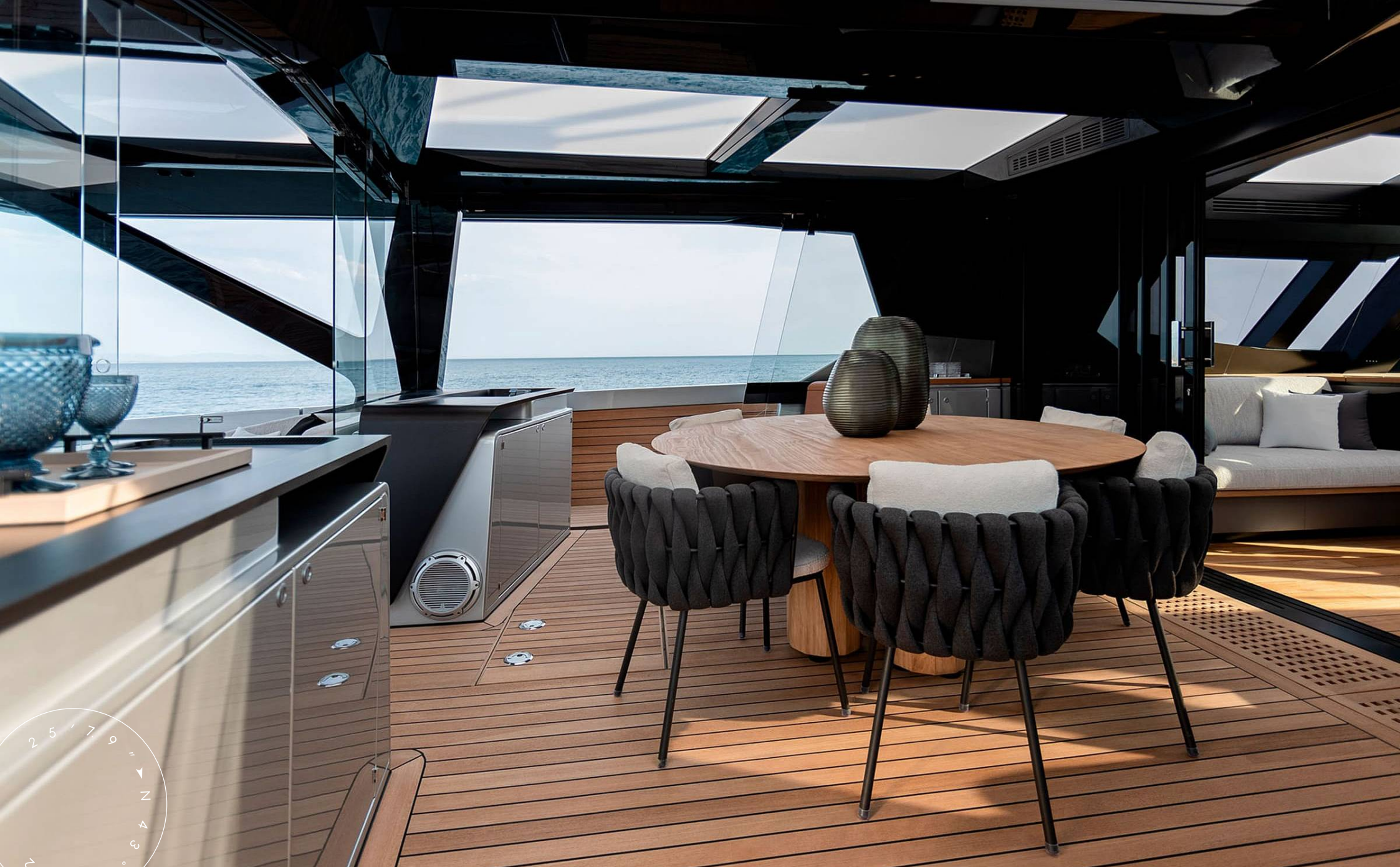
MAIN SALON DINING AREA