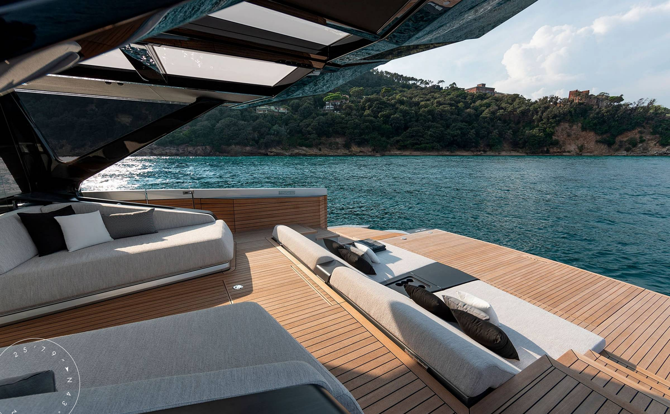
COCKPIT SEATING AREA