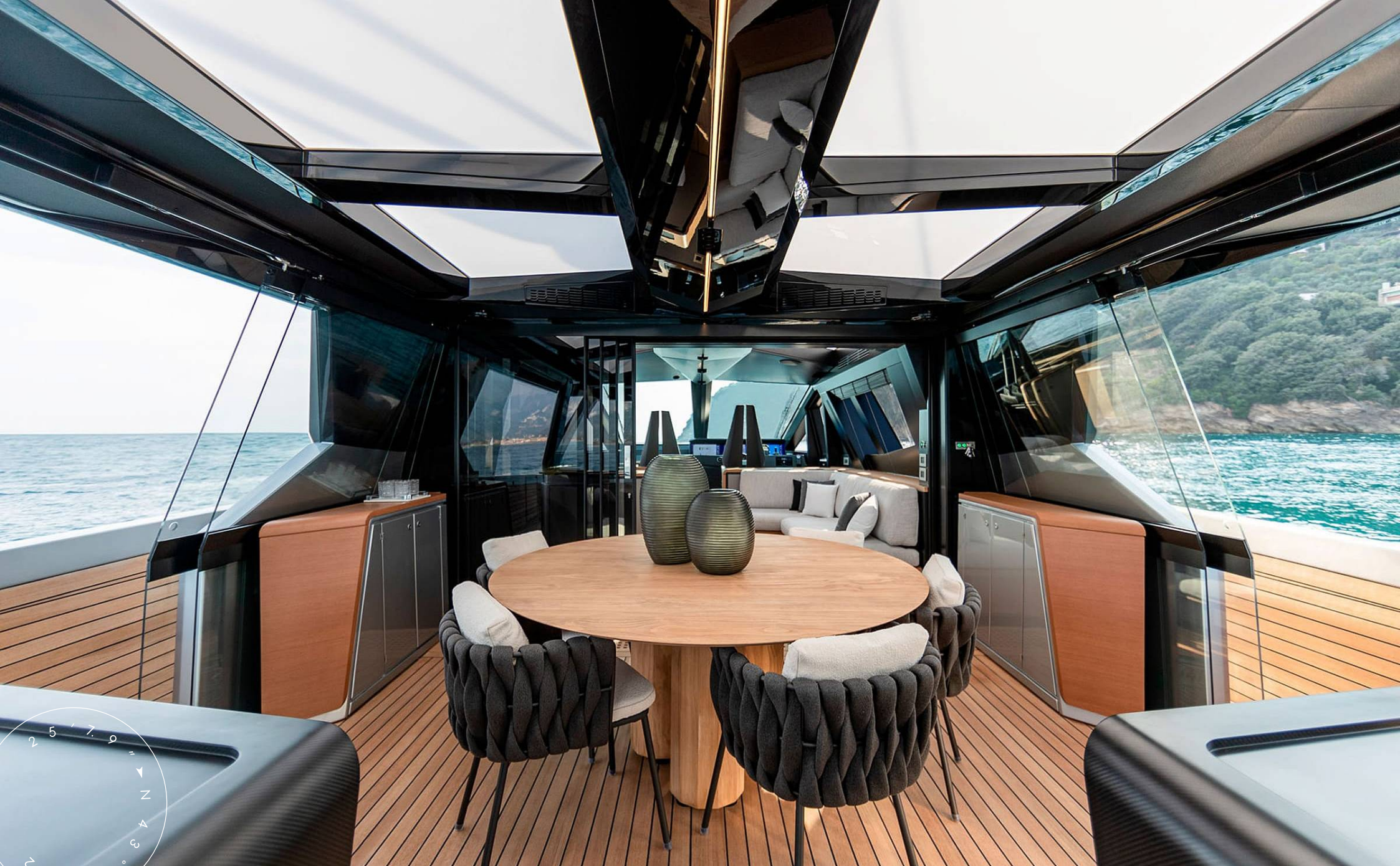
MAIN SALON DINING AREA