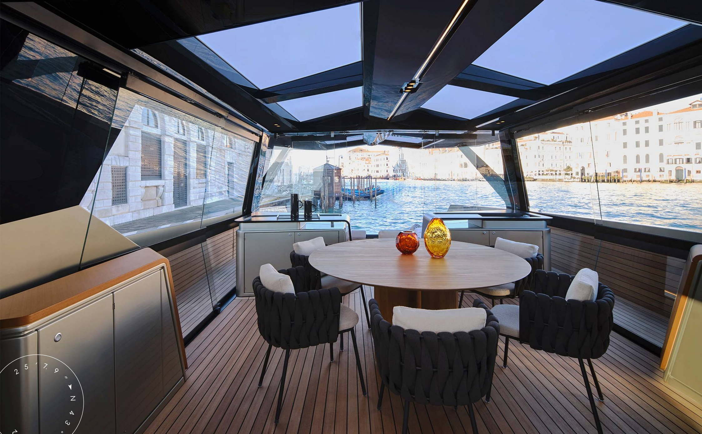
MAIN SALON DINING AREA