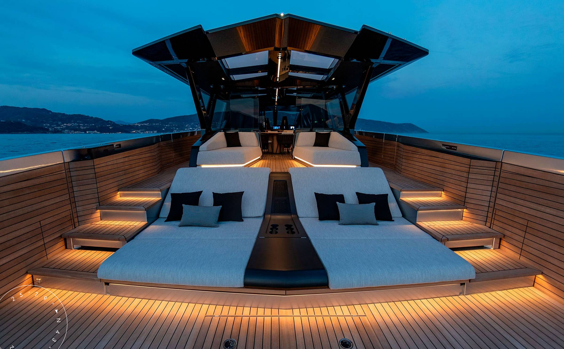
COCKPIT SEATING AREA