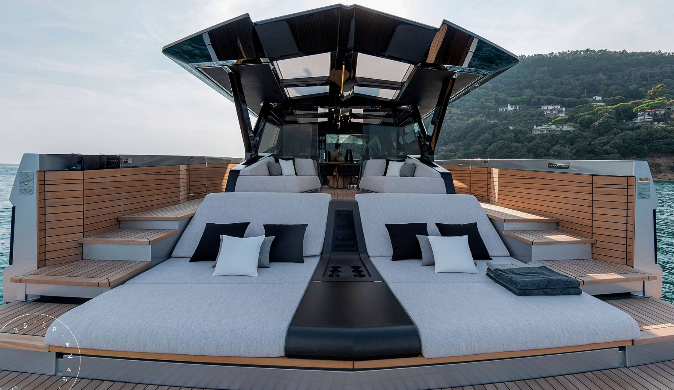
COCKPIT SEATING AREA