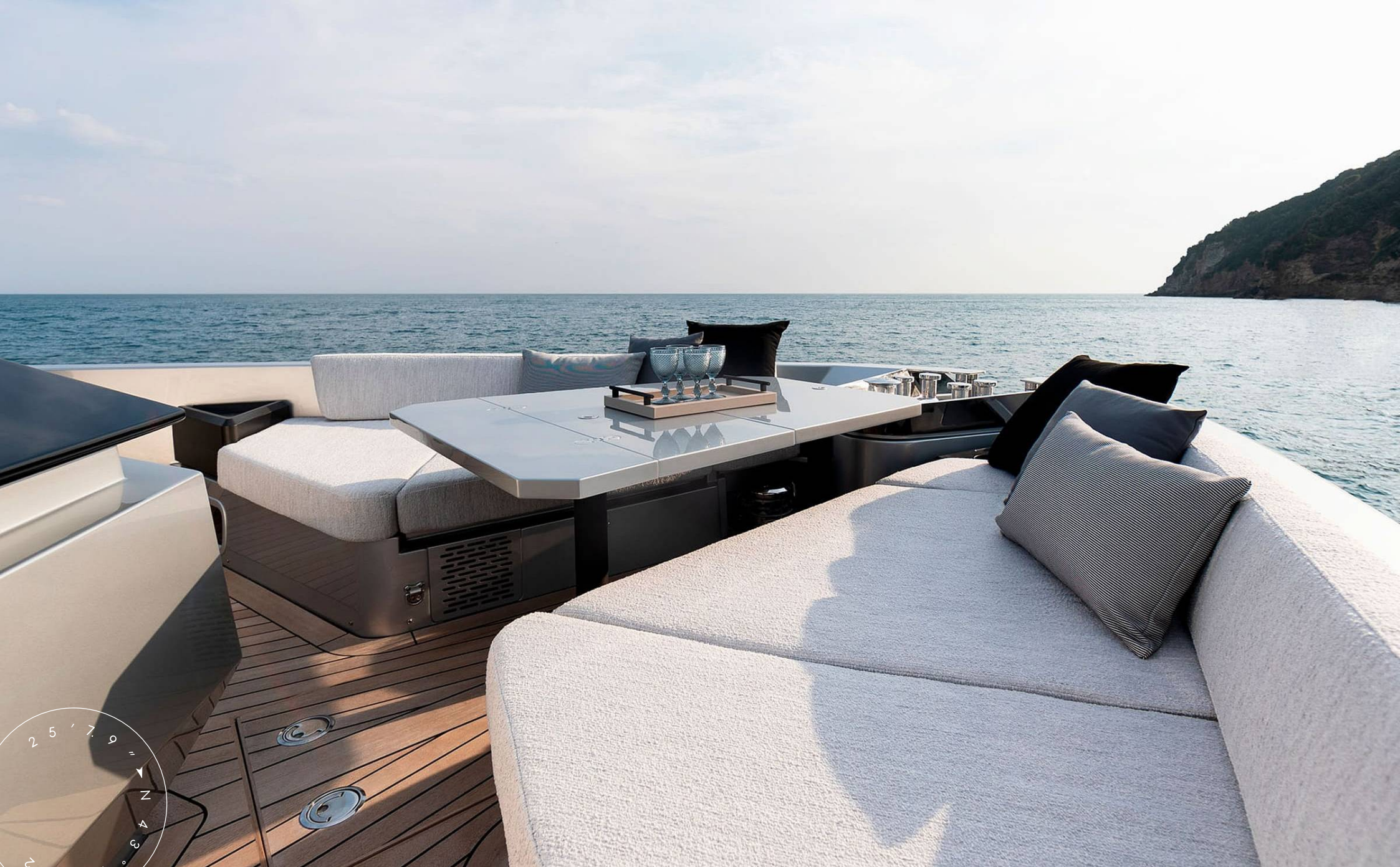
BOW LOUNGE AREA