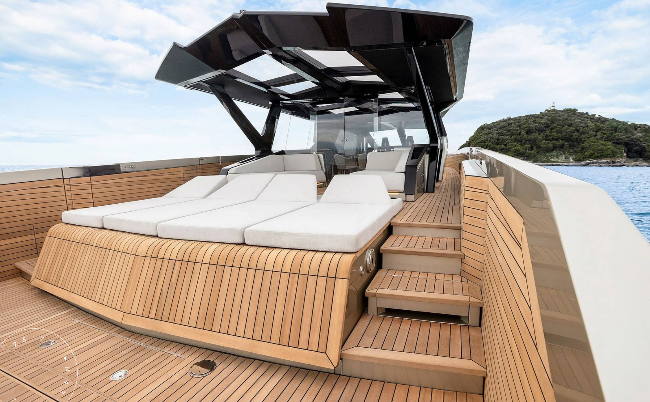
COCKPIT SEATING AREA