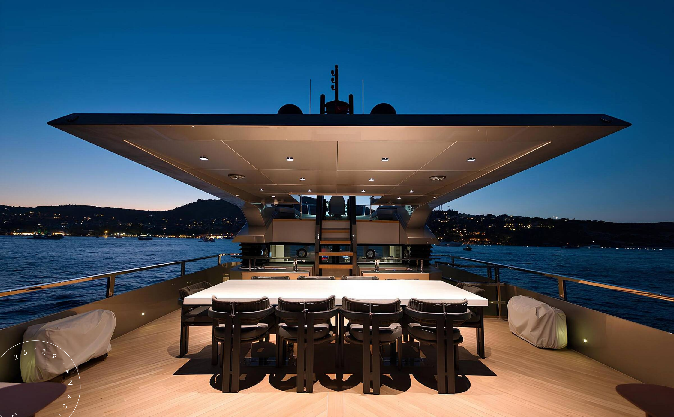
FLYBRIDGE DINING AREA