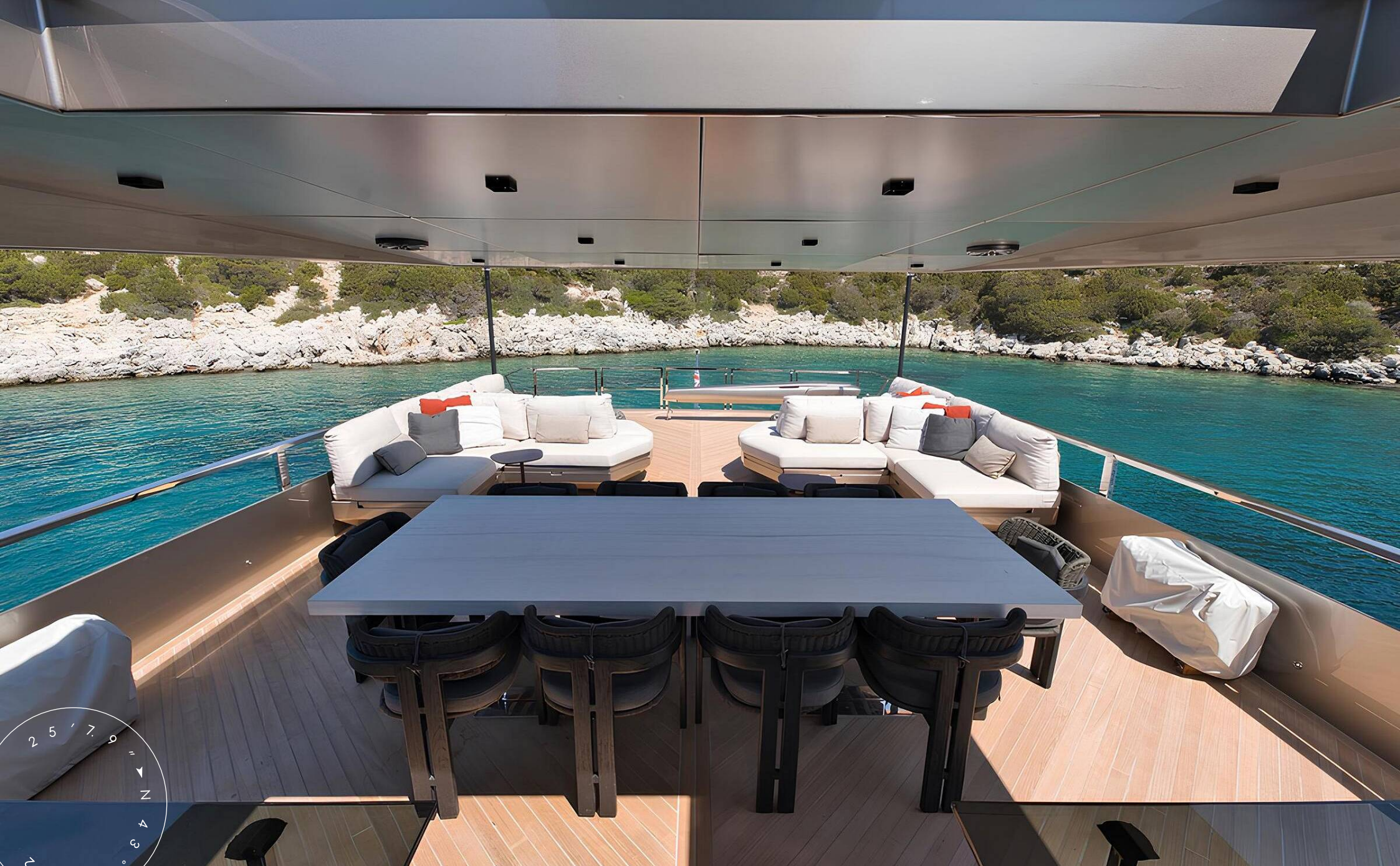
FLYBRIDGE DINING AREA