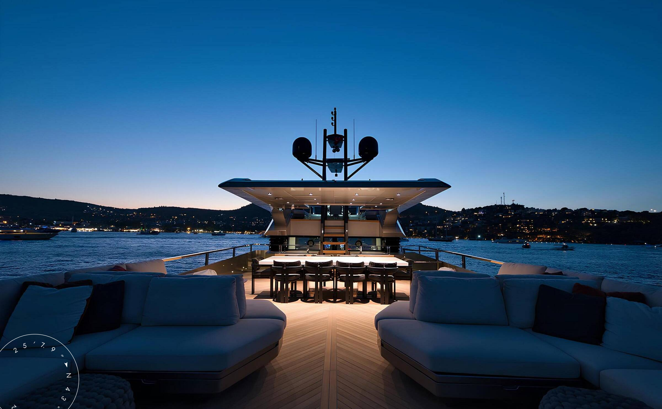
FLYBRIDGE LOUNGE AREA