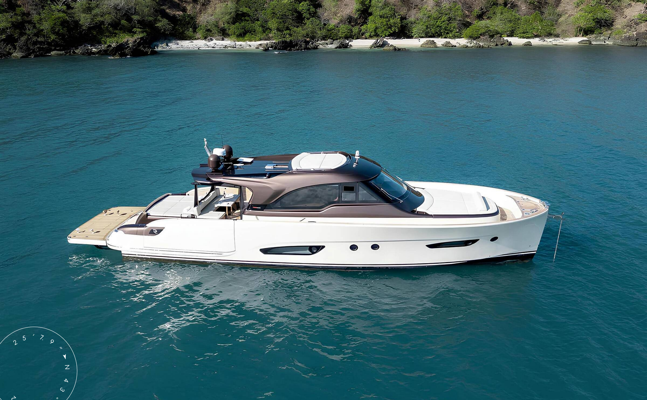
EXTERIOR SOLARIS POWER LOBSTER 57 2022