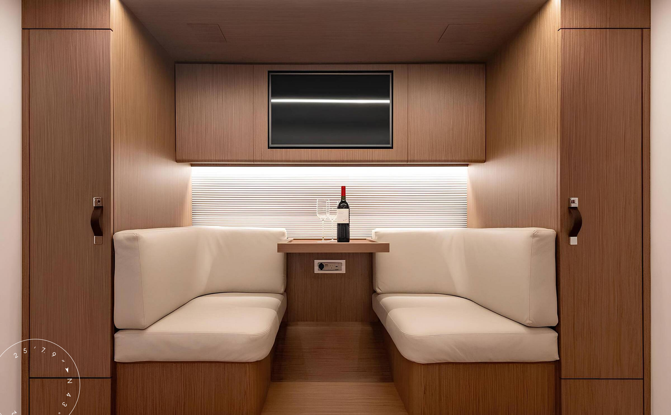
MASTER CABIN LOUNGE AREA