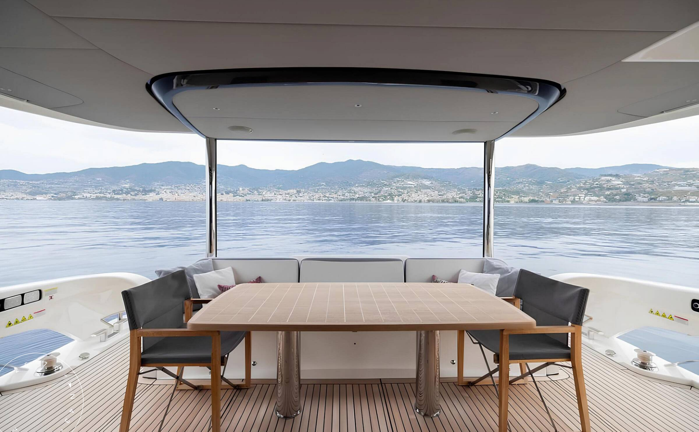
AFT MAIN DECK DINING AREA