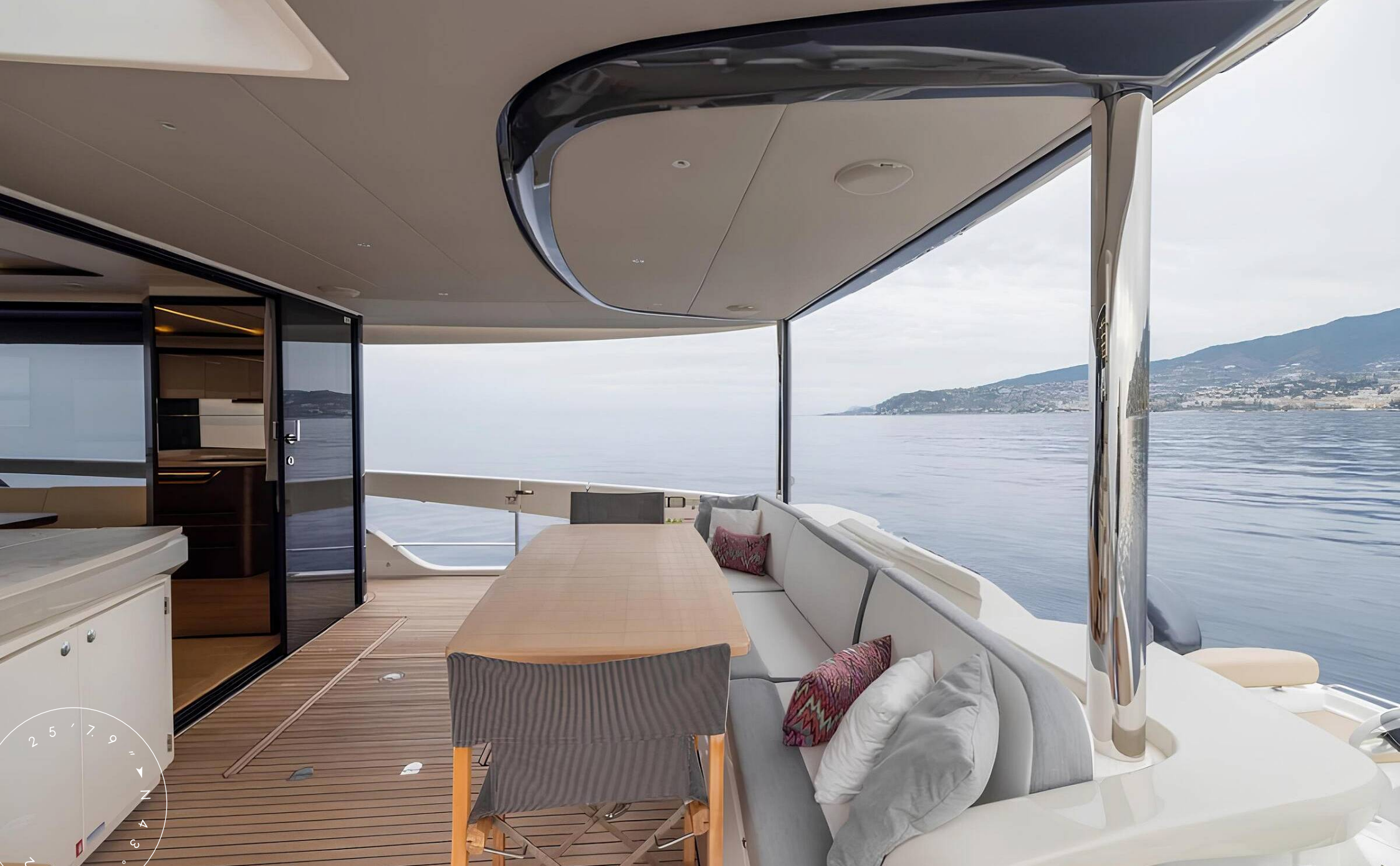
AFT MAIN DECK DINING AREA