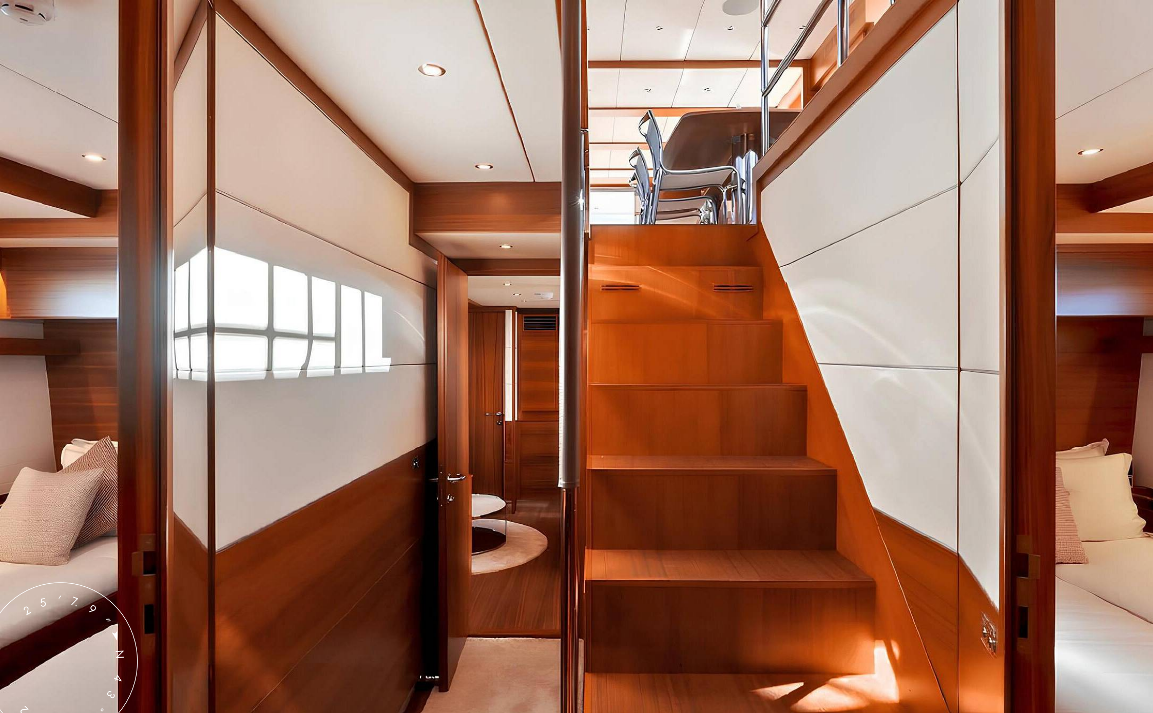
STAIRS FROM MD TO LD