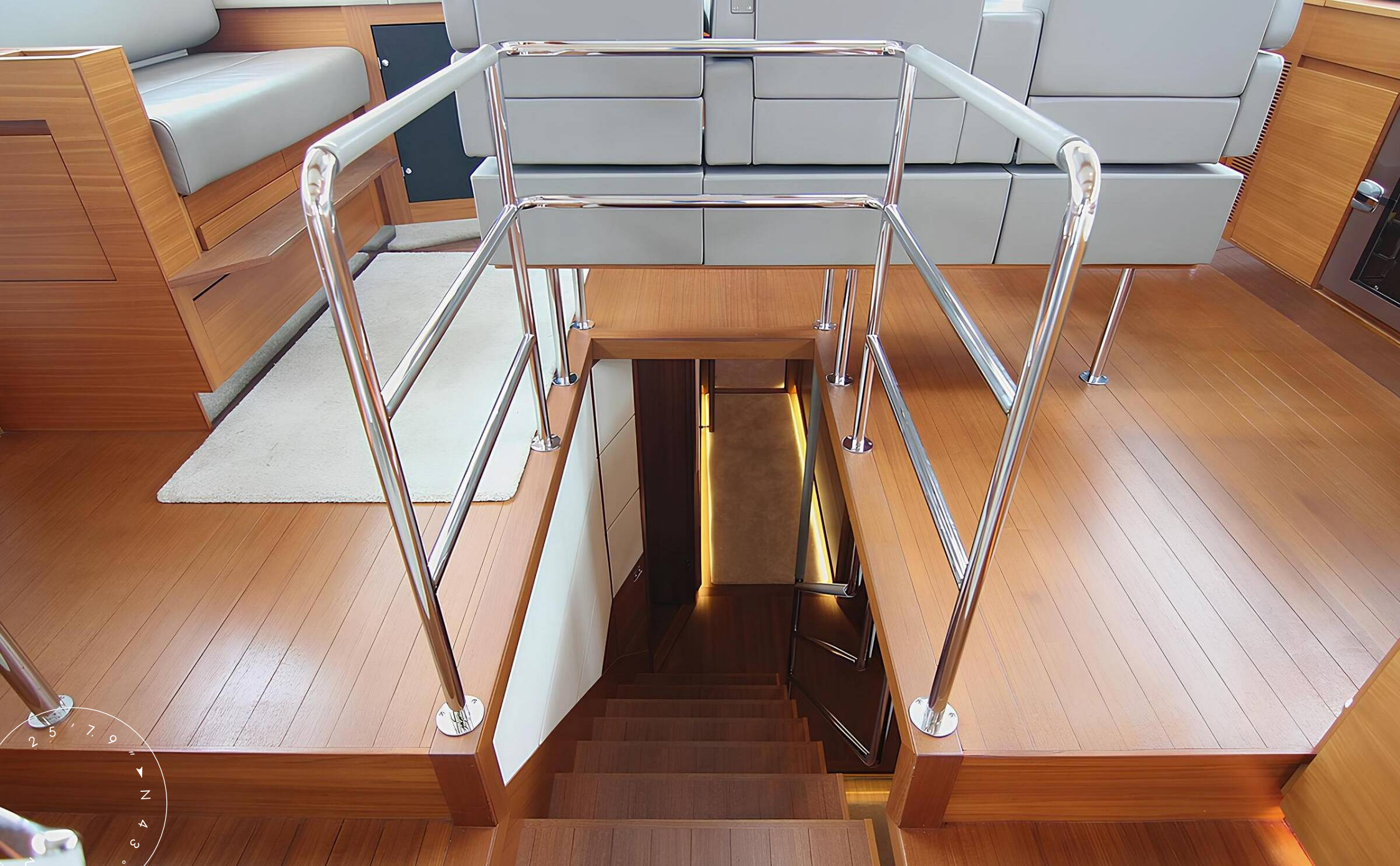
STAIRS FROM MD TO LD