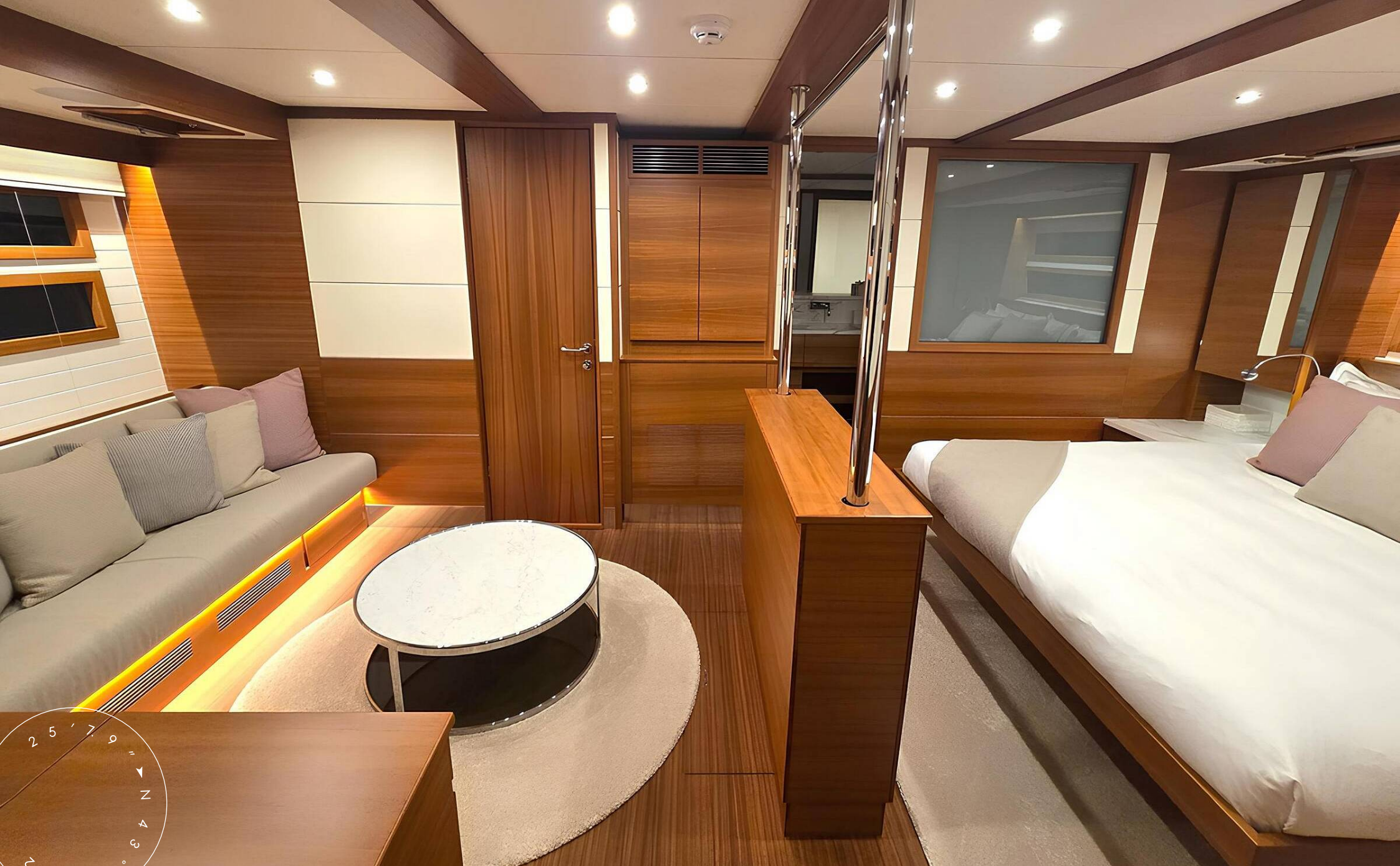
LOWER DECK LOBBY