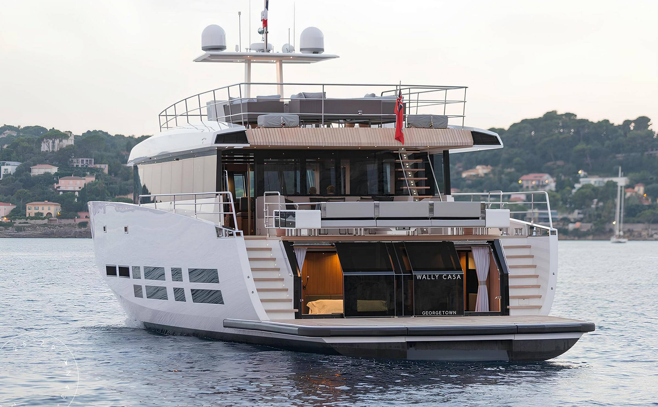
EXTERIOR WALLY 27M 2016 MY CASA