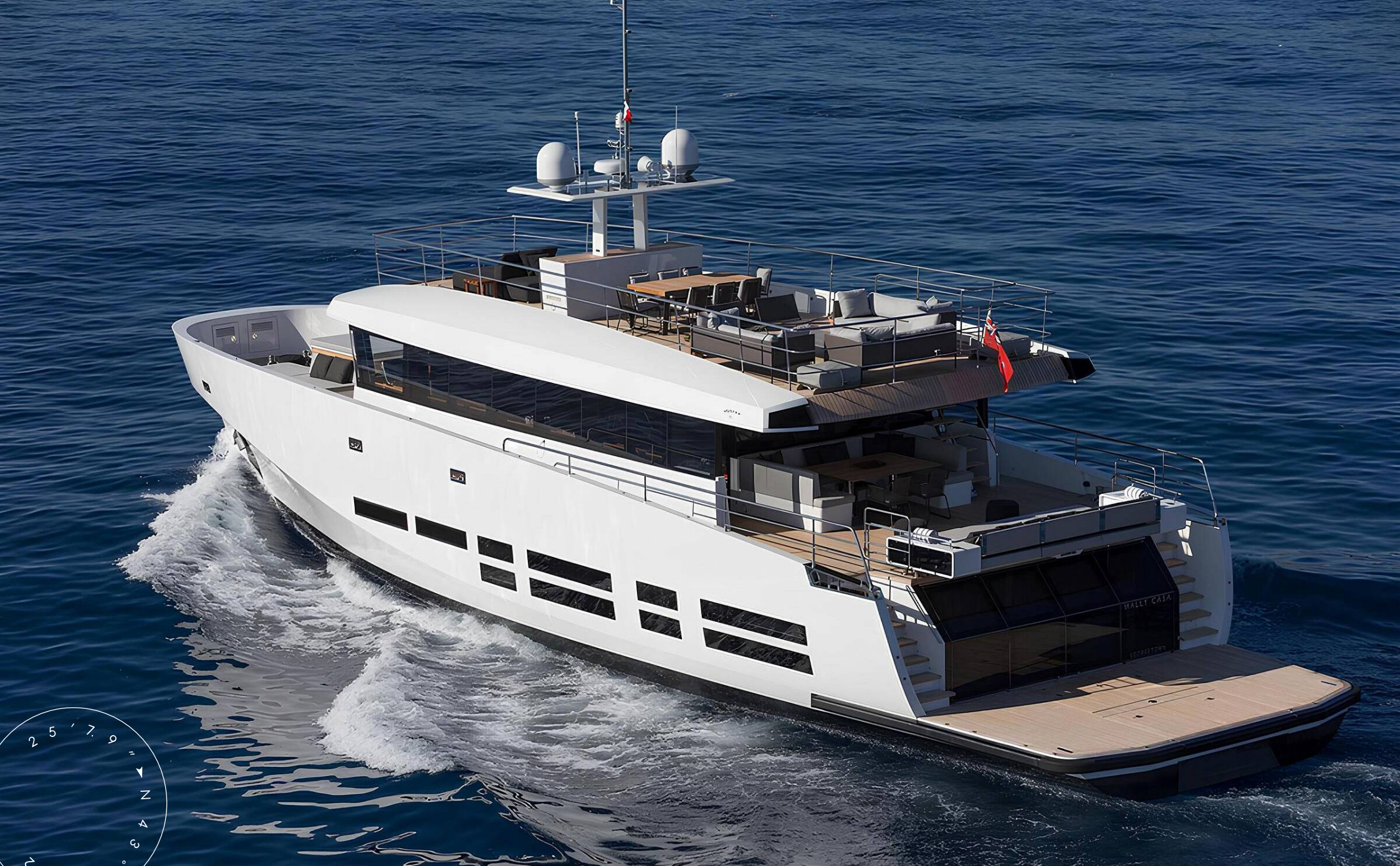
EXTERIOR WALLY 27M 2016 MY CASA