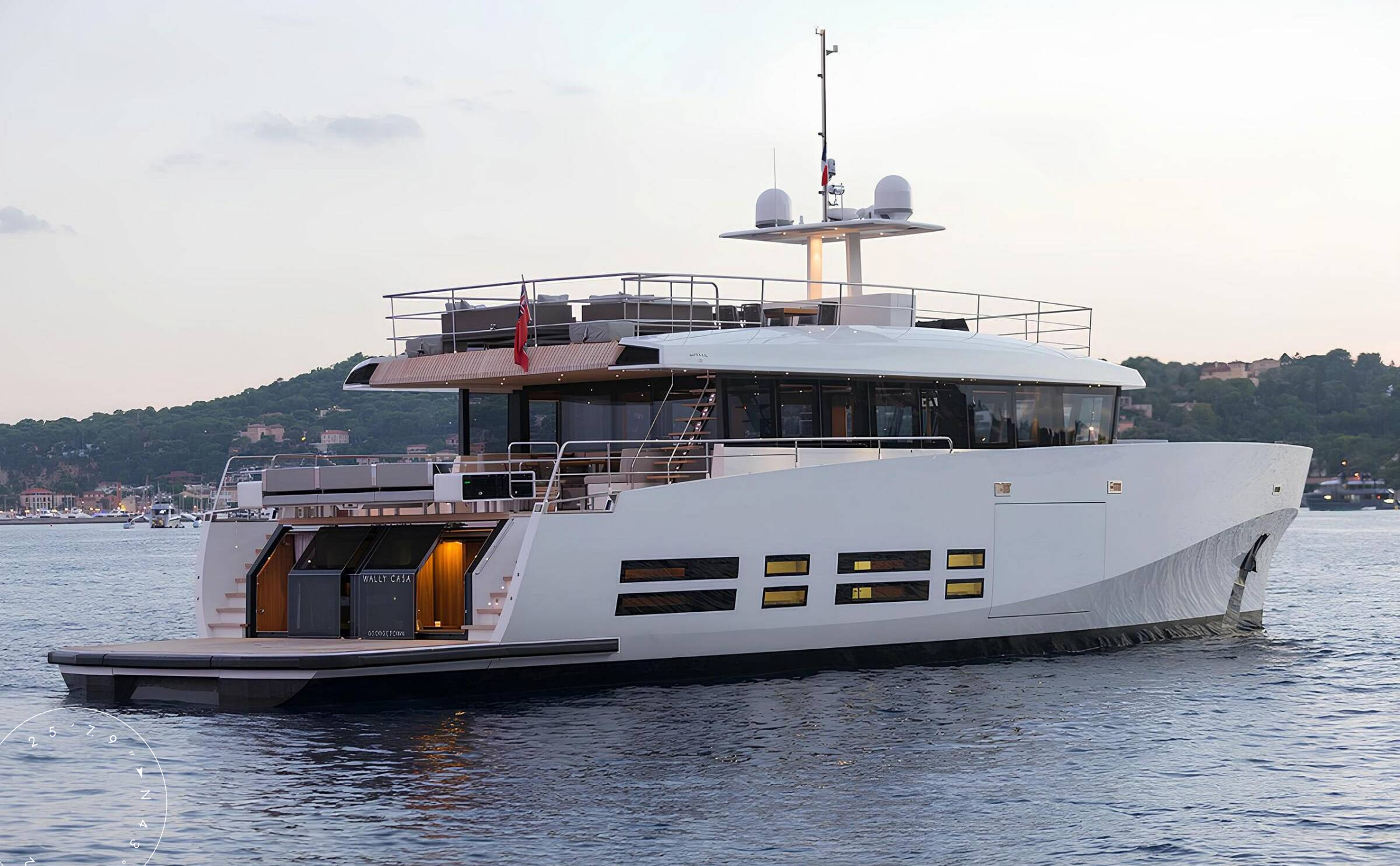
EXTERIOR WALLY 27M 2016 MY CASA