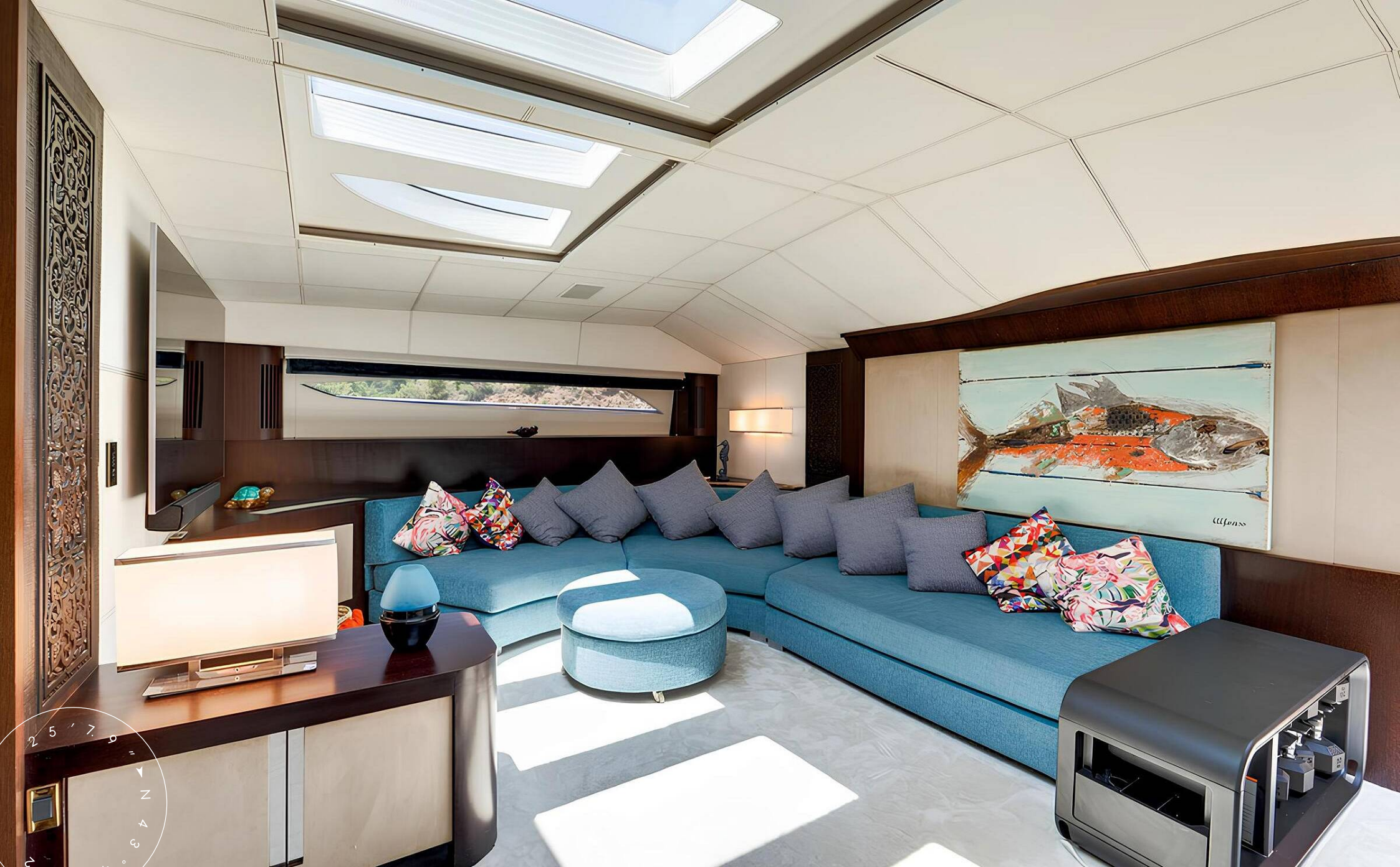
LOWER DECK LOBBY