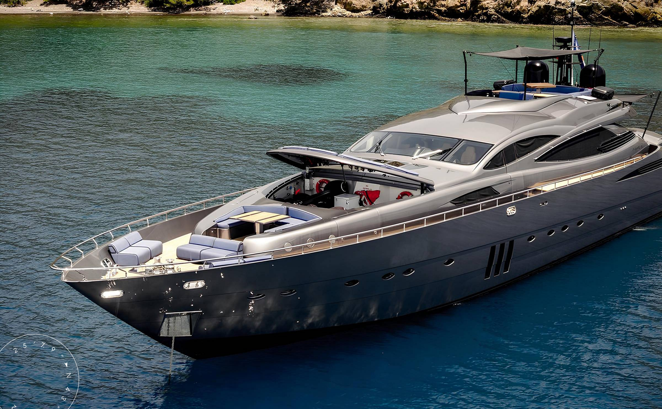
EXTERIOR PERSHING 115 2006 MY GINGER