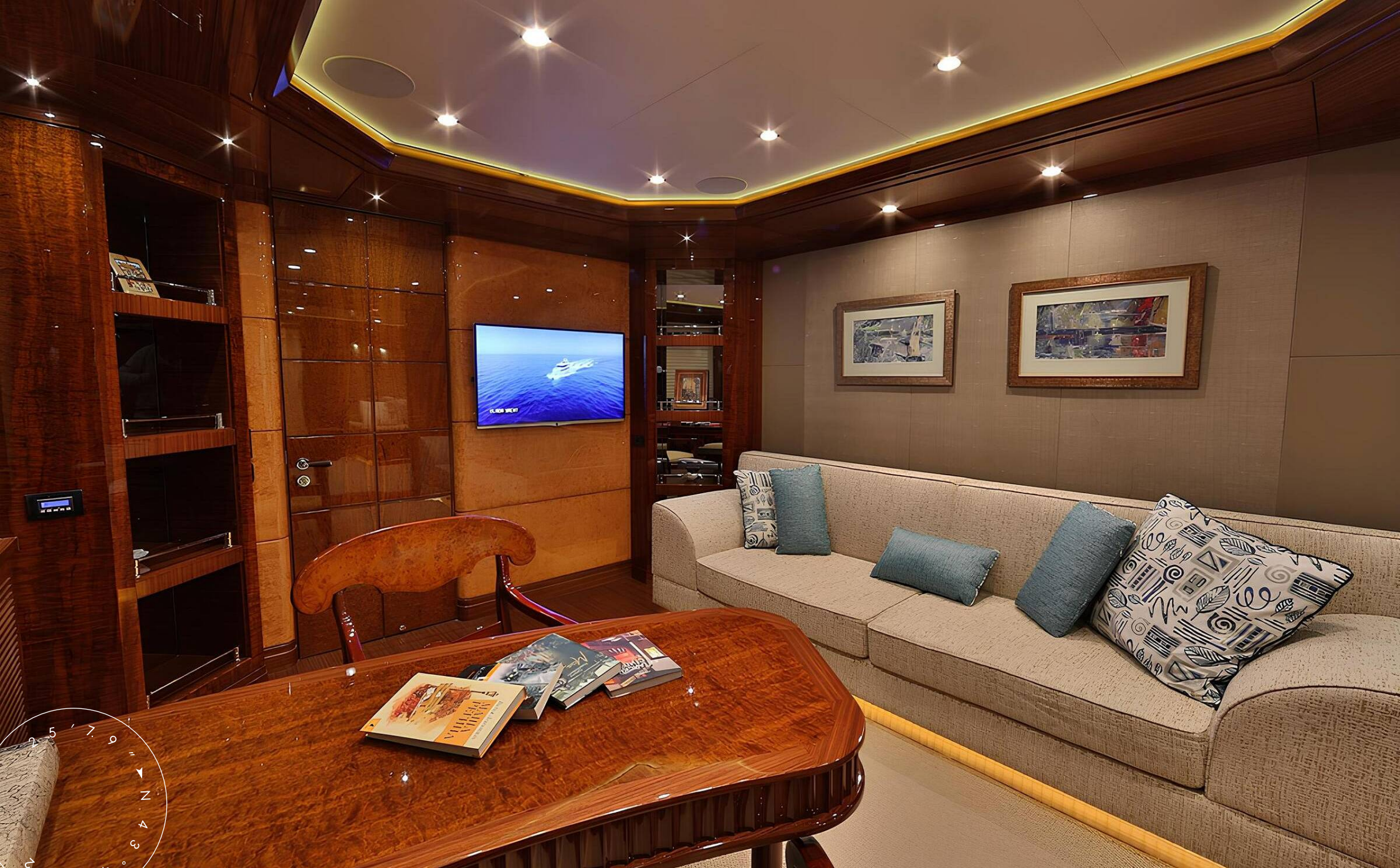
OFFICE IN THE MASTER CABIN