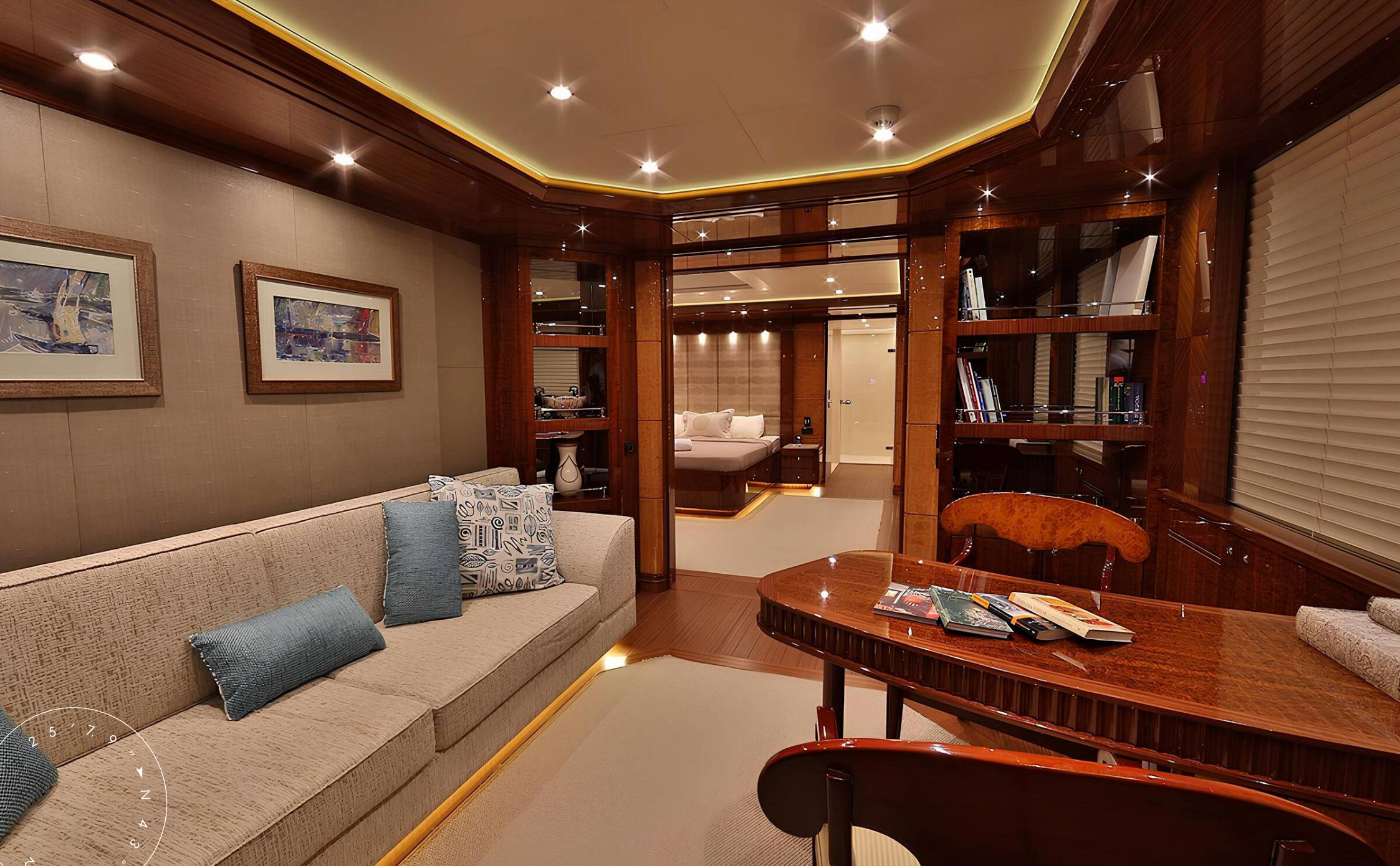
OFFICE IN THE MASTER CABIN