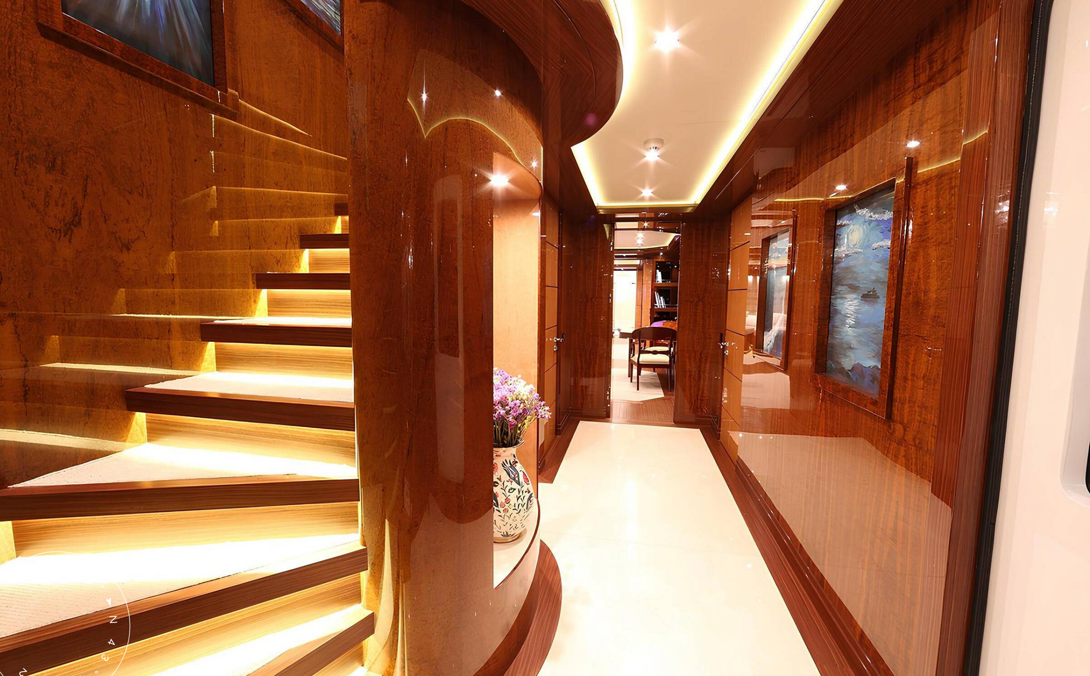
MAIN SALON LOBBY