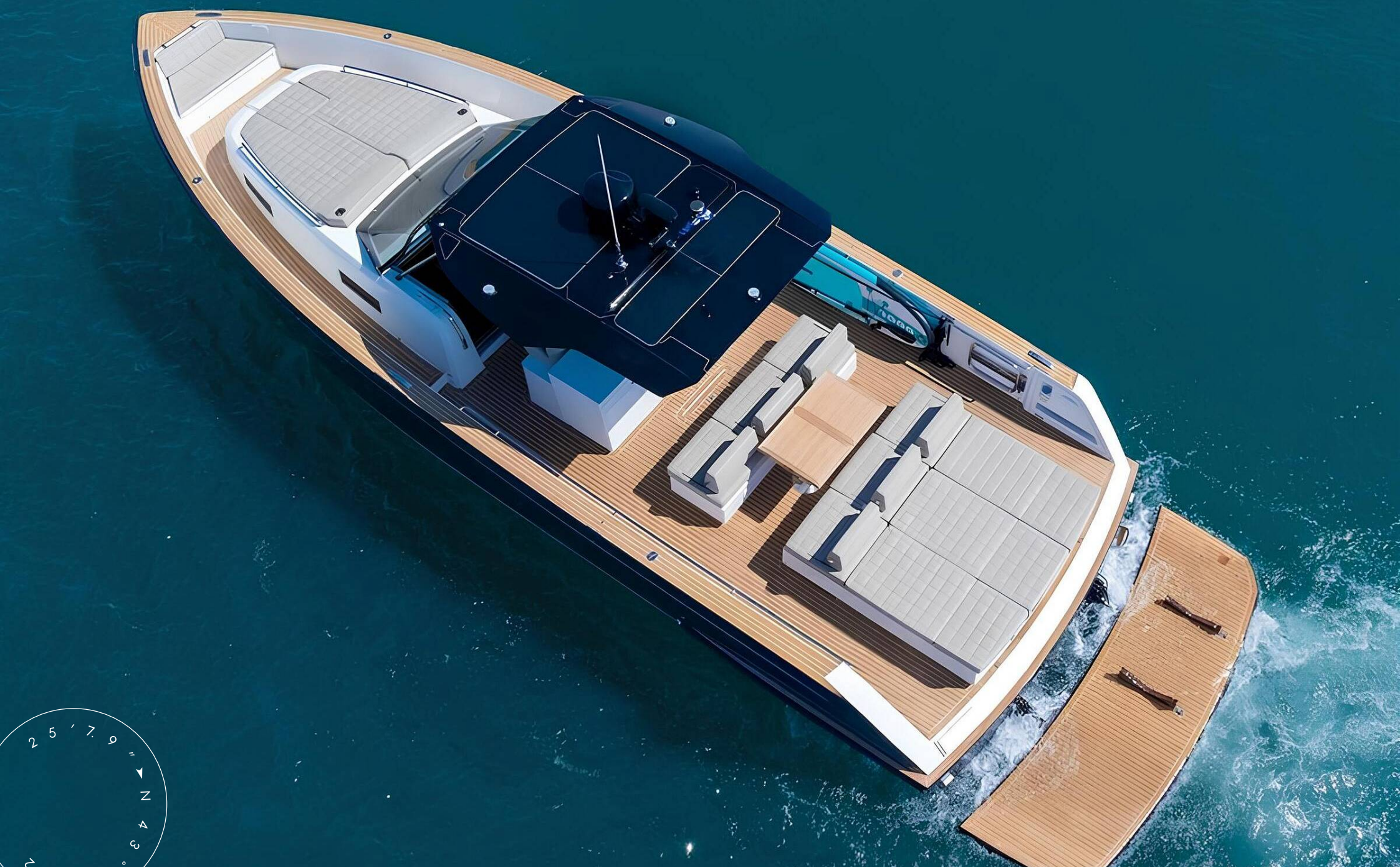
EXTERIOR PARDO P43 2021 MY FIZZY