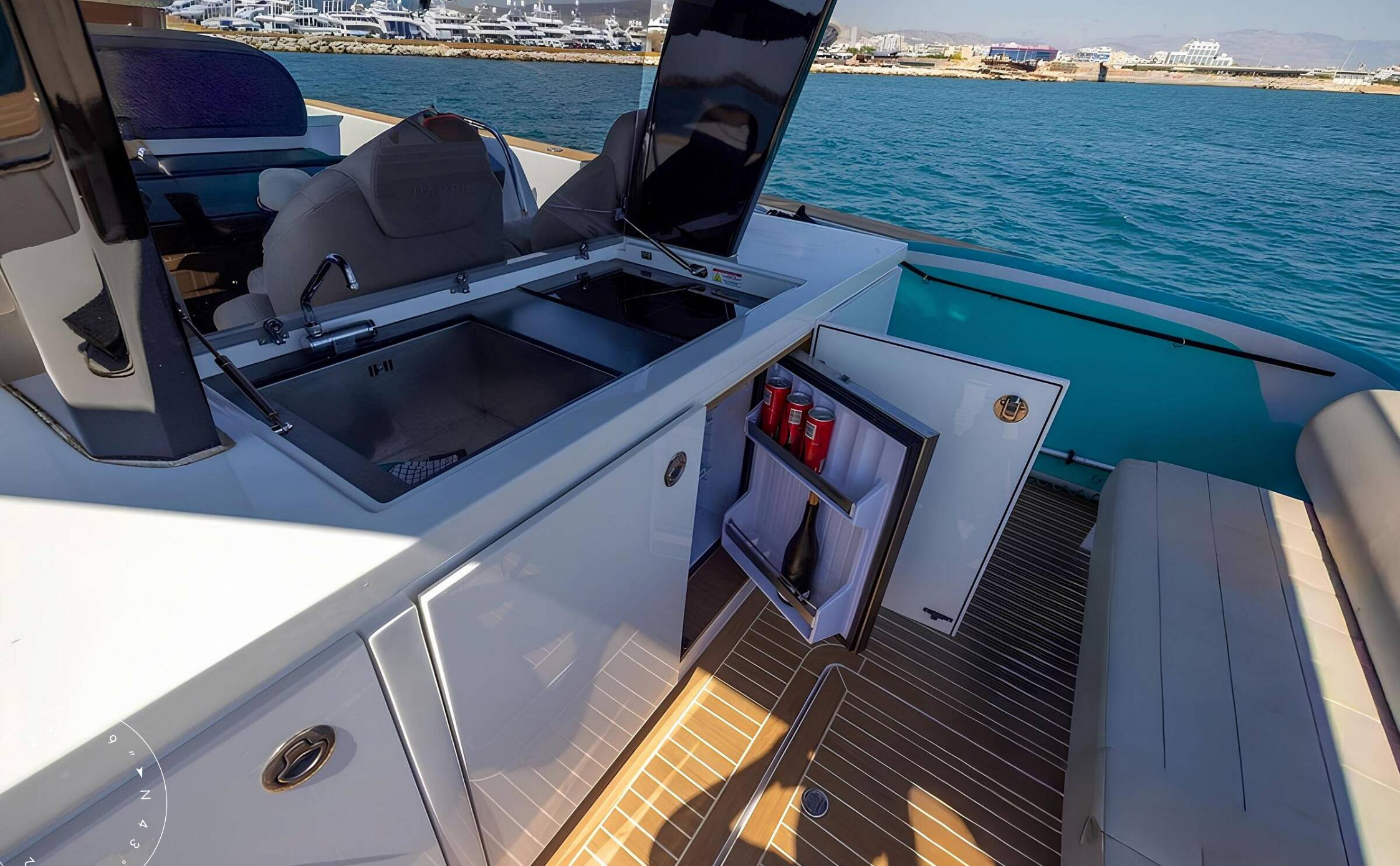
MAIN DECK GRILL