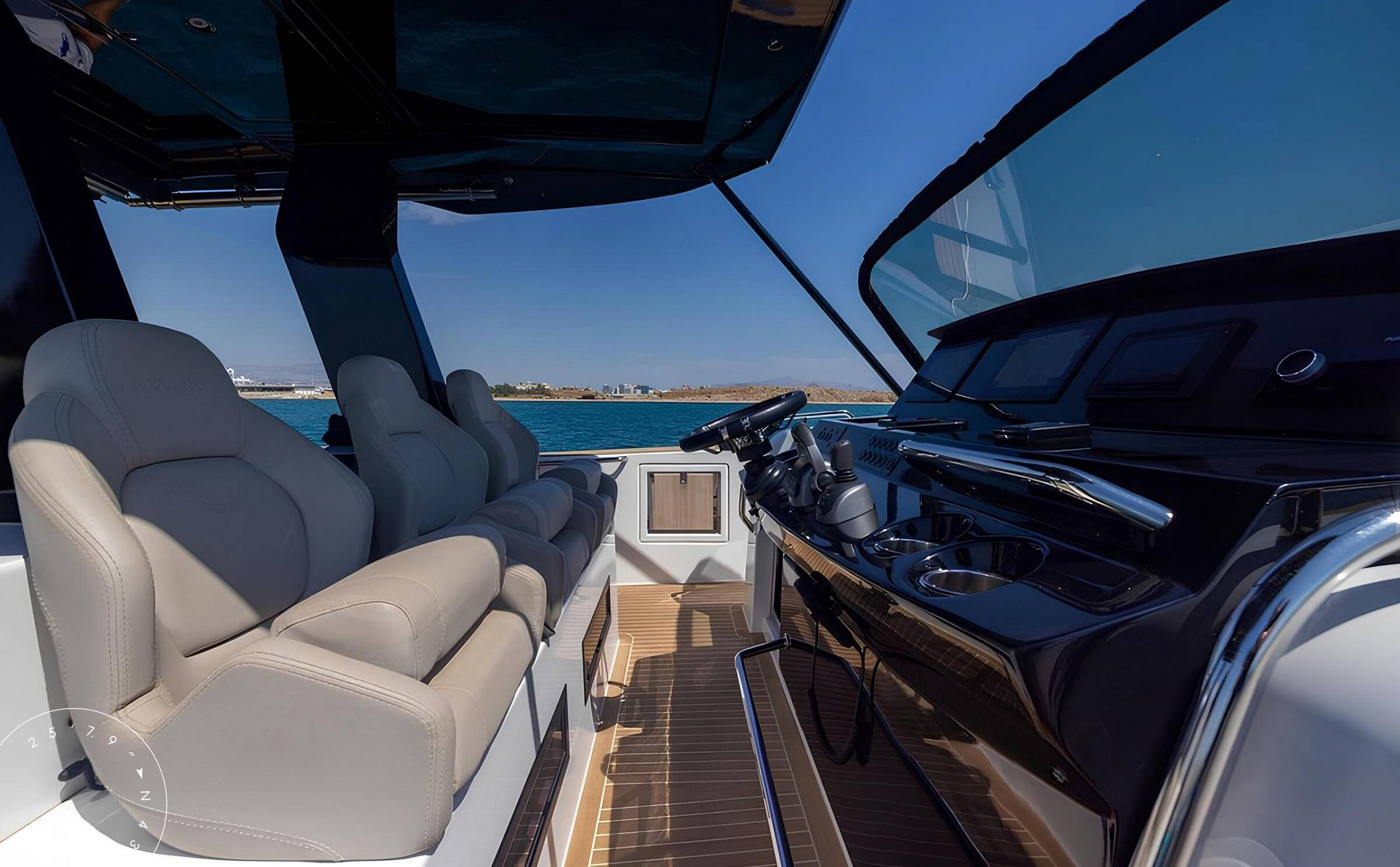
MAIN DECK GRILL