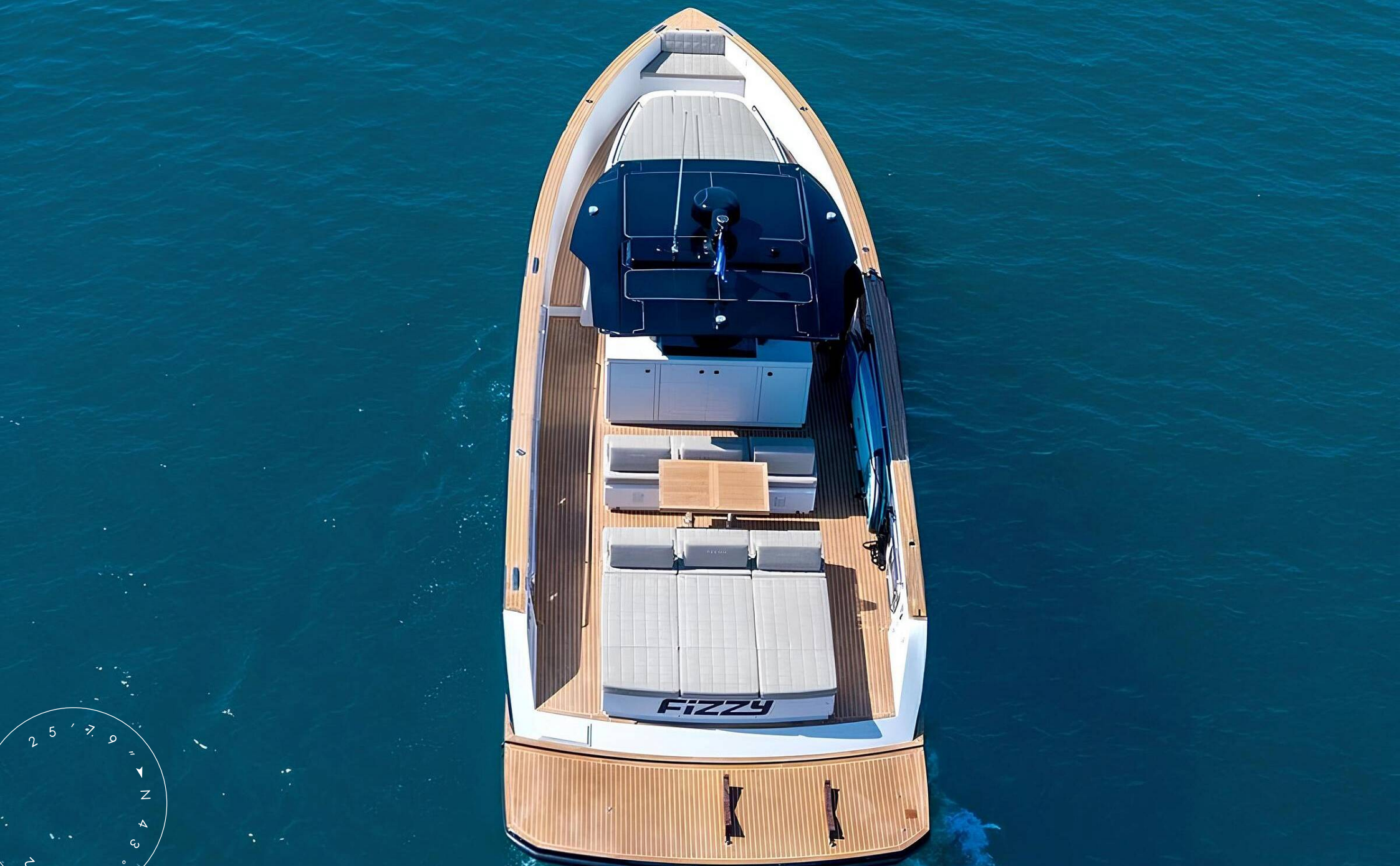
EXTERIOR PARDO P43 2021 MY FIZZY