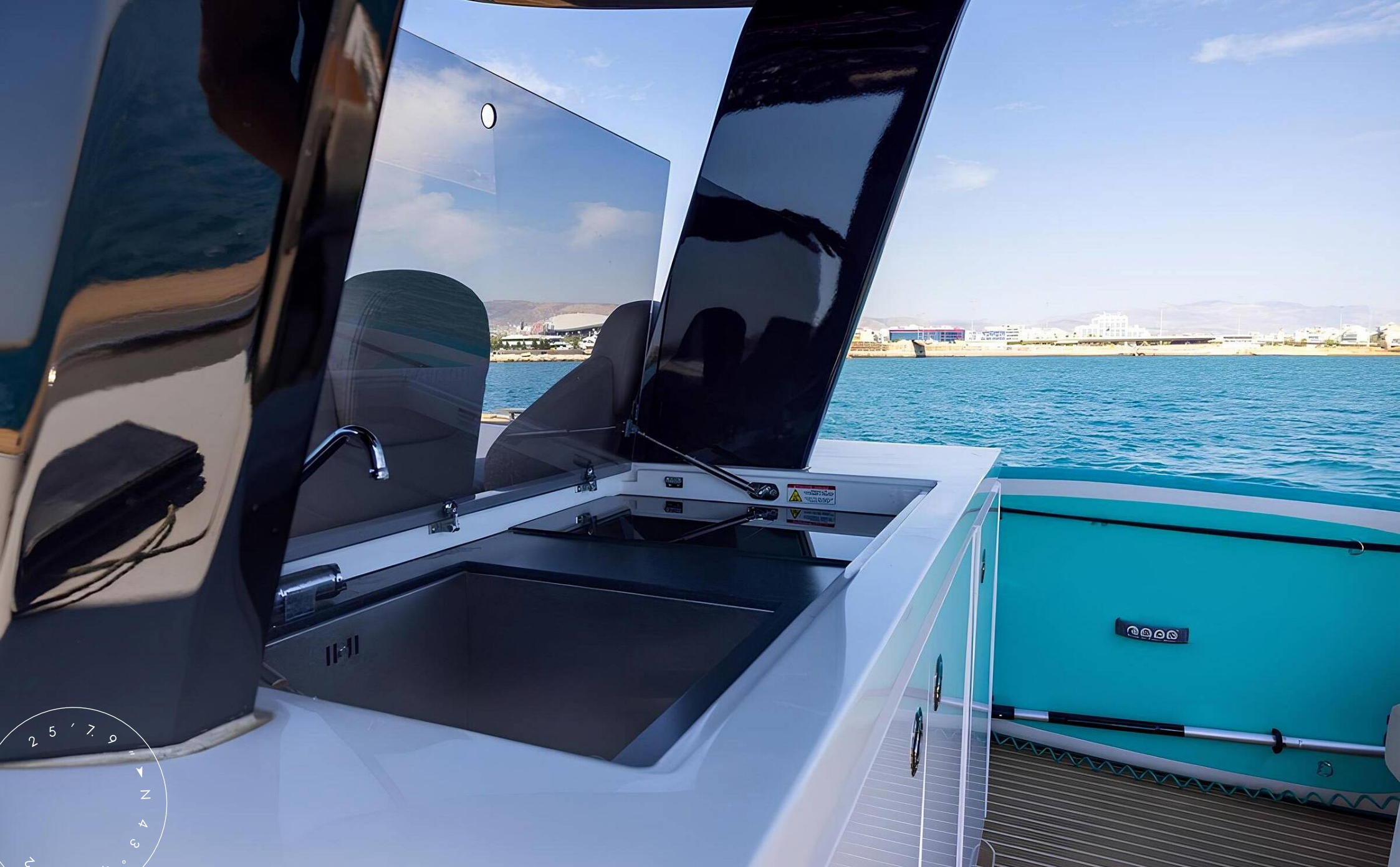
MAIN DECK GRILL