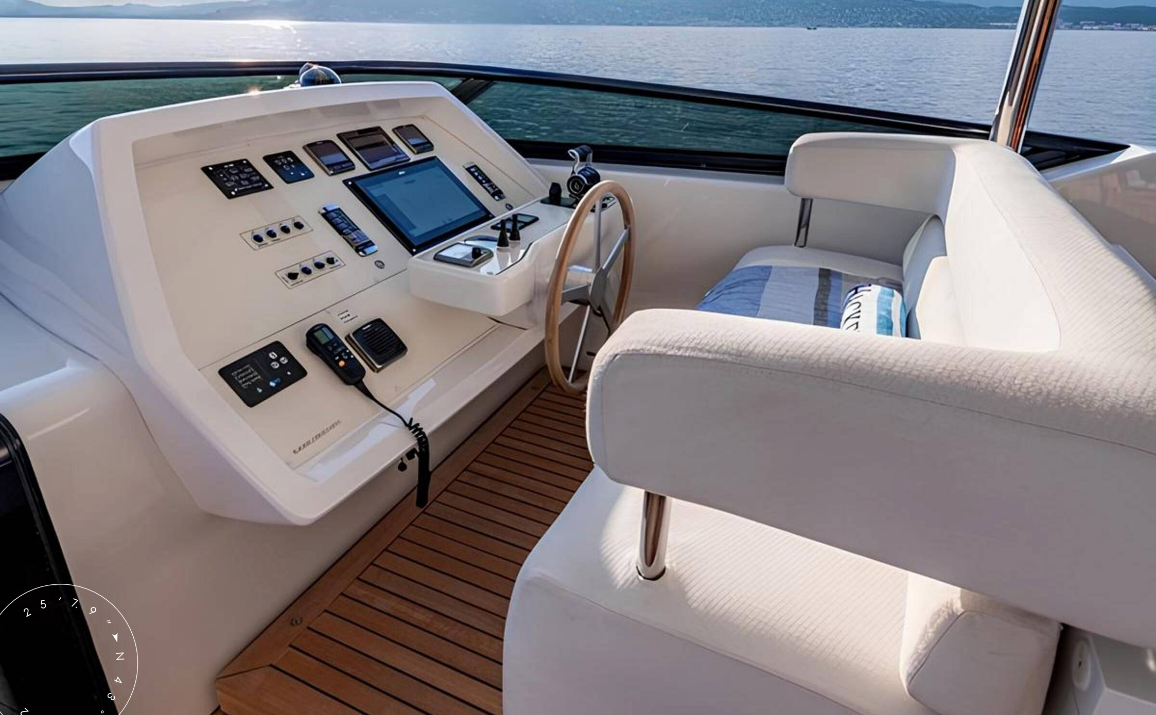
SECOND HELM STATION