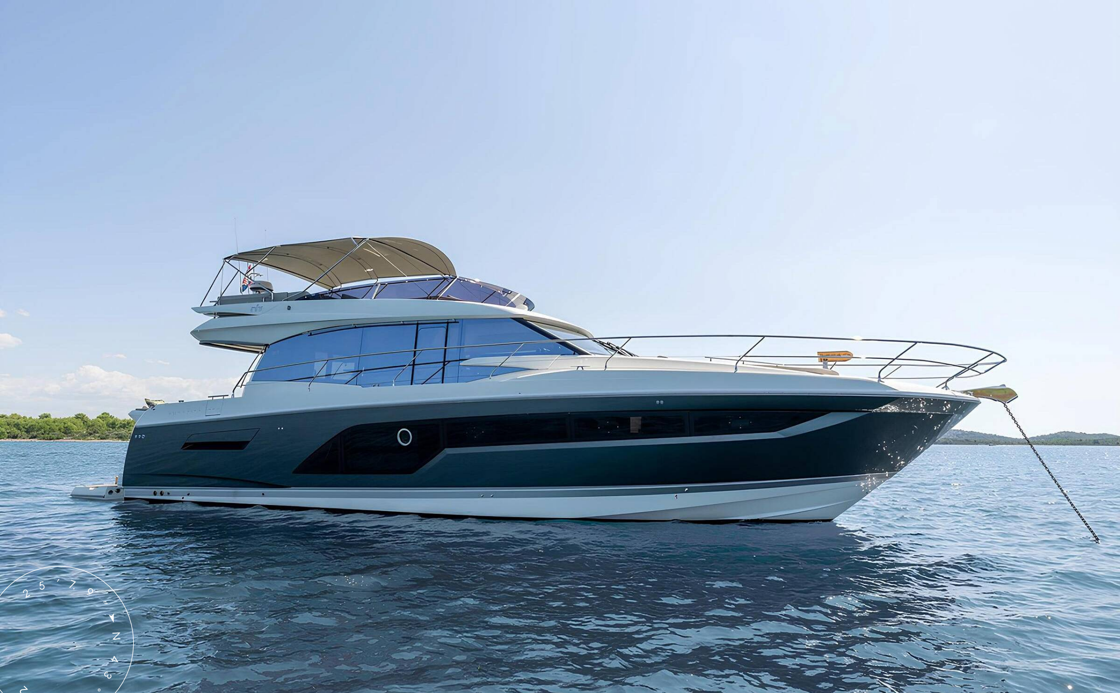
EXTERIOR PRESTIGE 590 2020 M/Y THE SUN