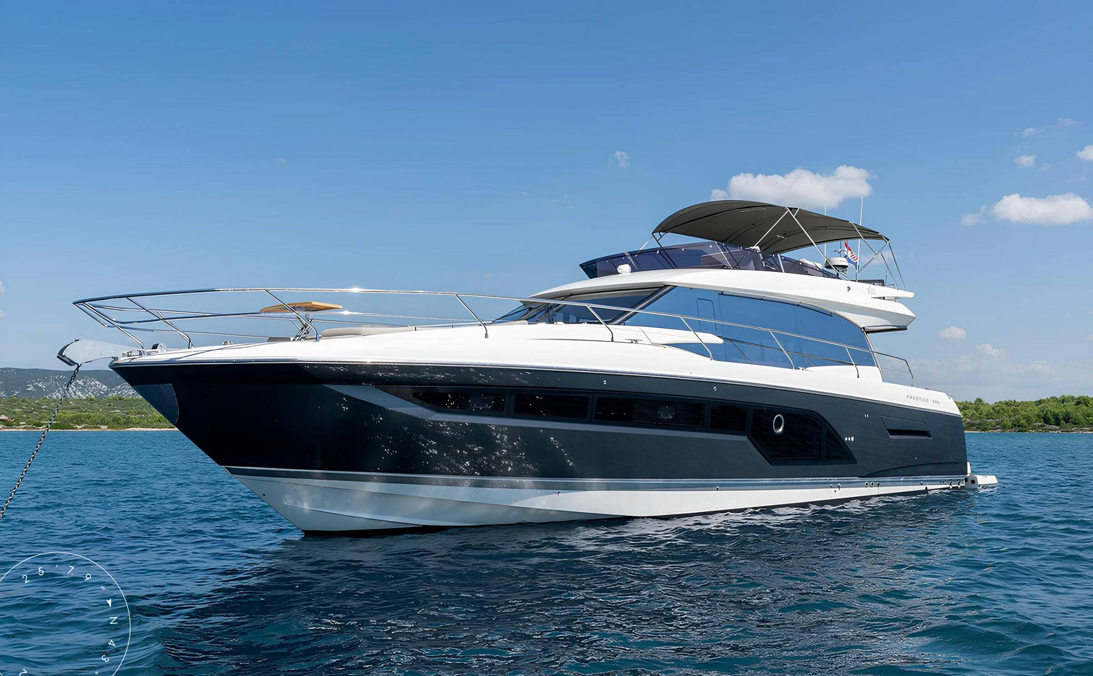
EXTERIOR PRESTIGE 590 2020 MY THE SUN