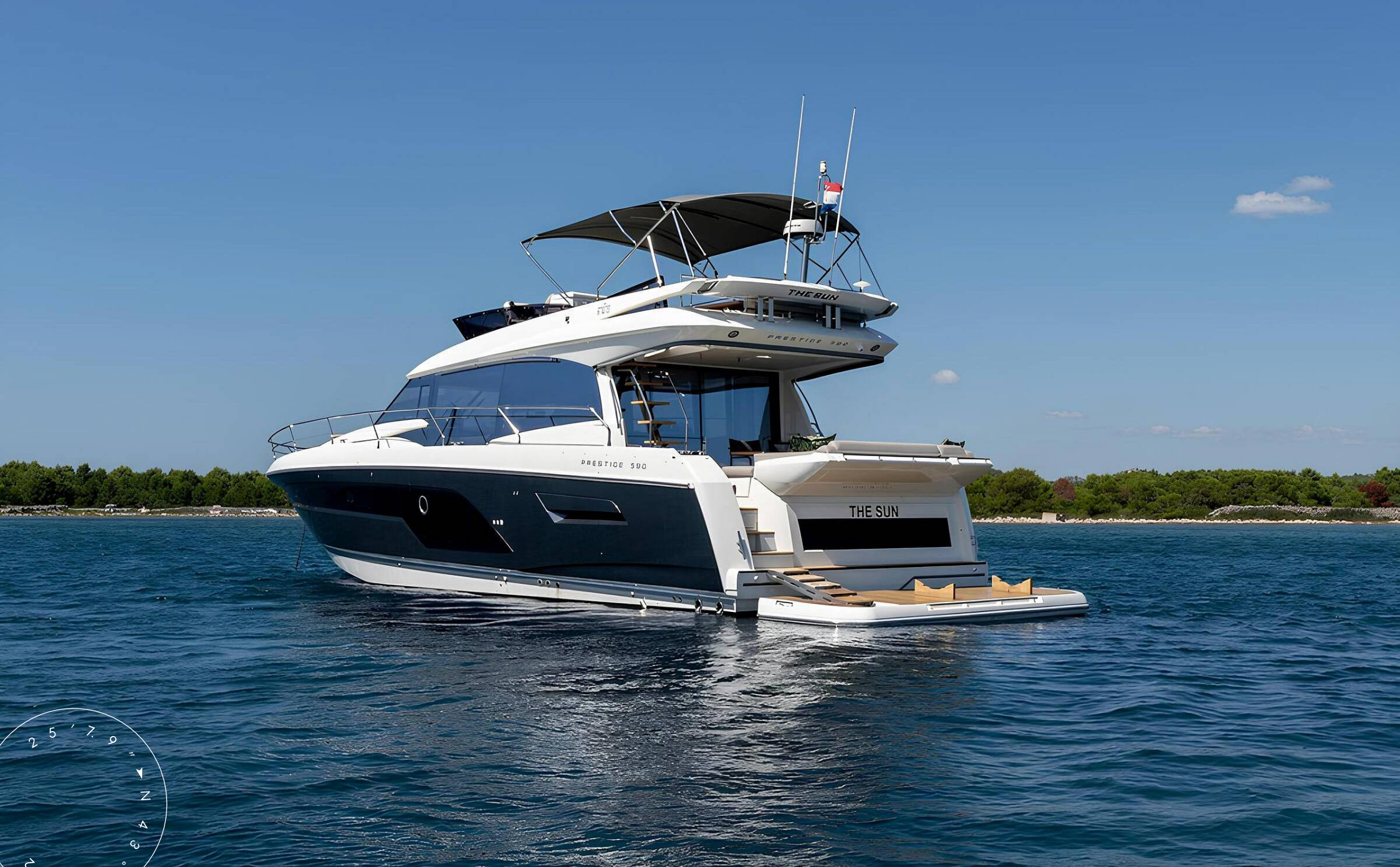
EXTERIOR PRESTIGE 590 2020 MY THE SUN