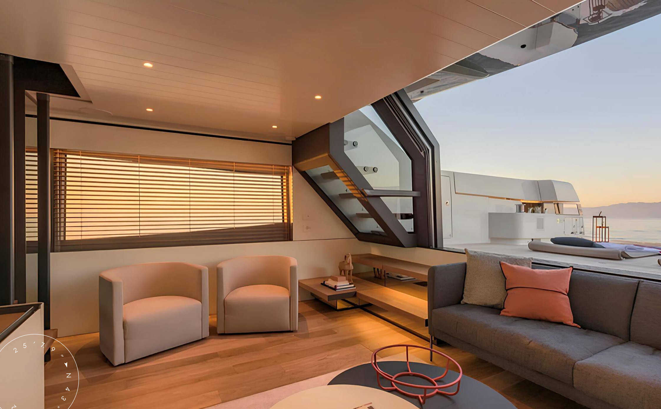
LOWER DECK LOUNGE AREA