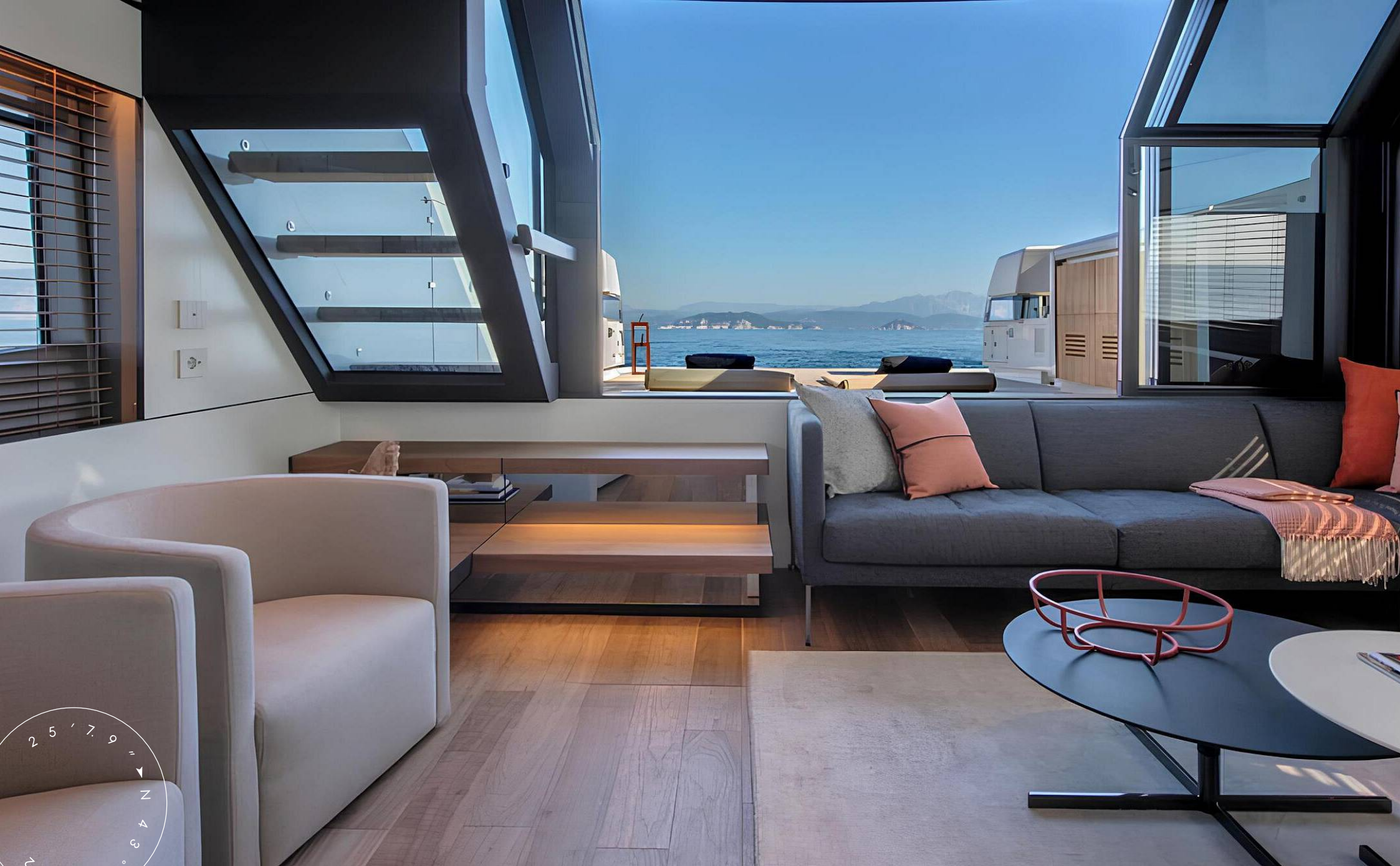
LOWER DECK LOUNGE AREA