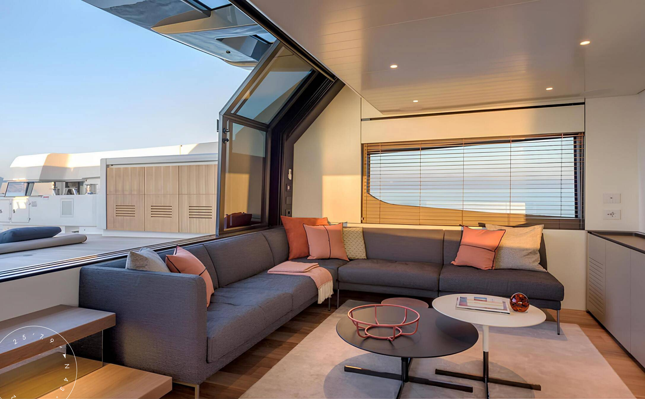
LOWER DECK LOUNGE AREA