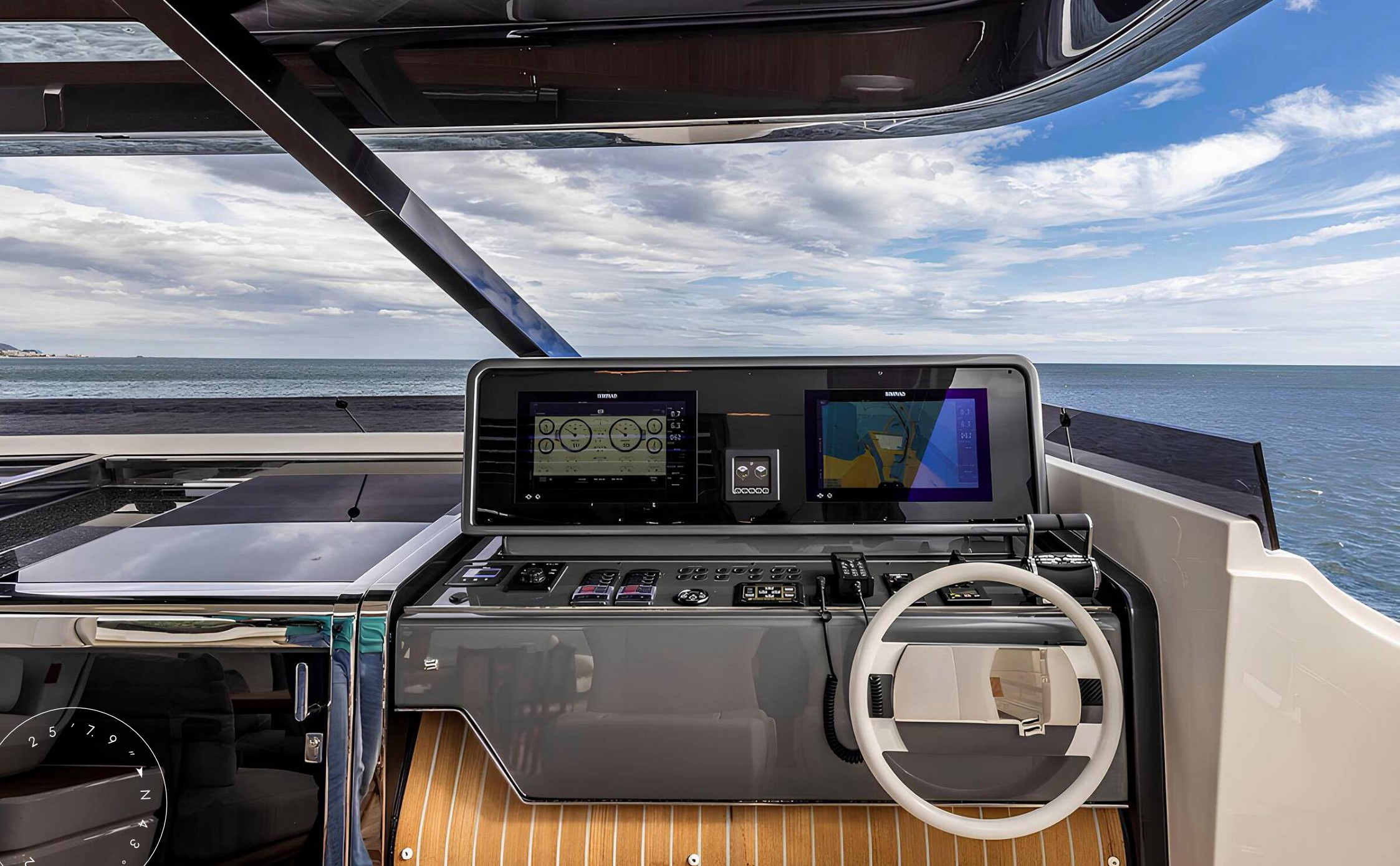
SECOND HELM STATION