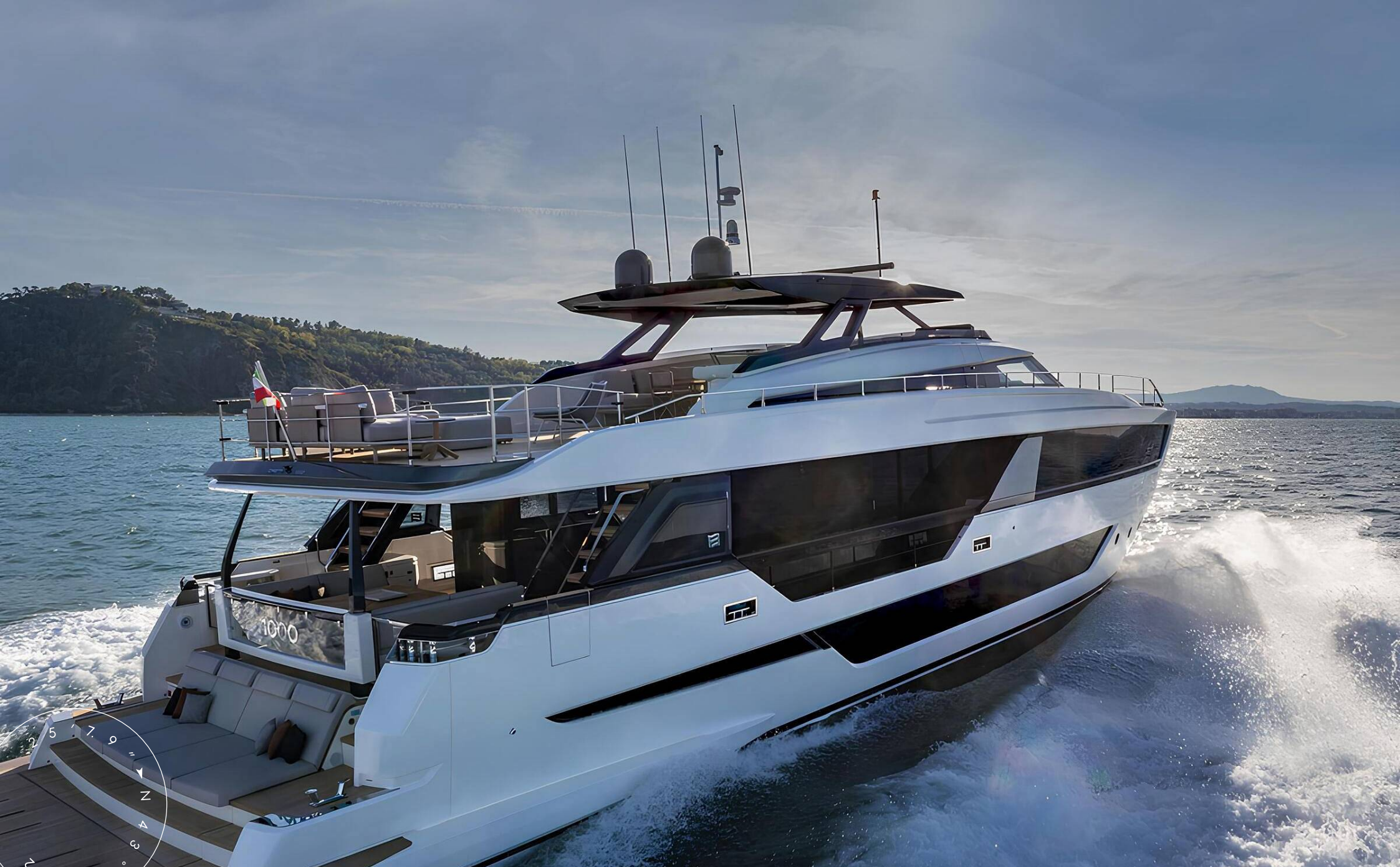
EXTERIOR FERRETTI 1000 2023 MY DANIMA