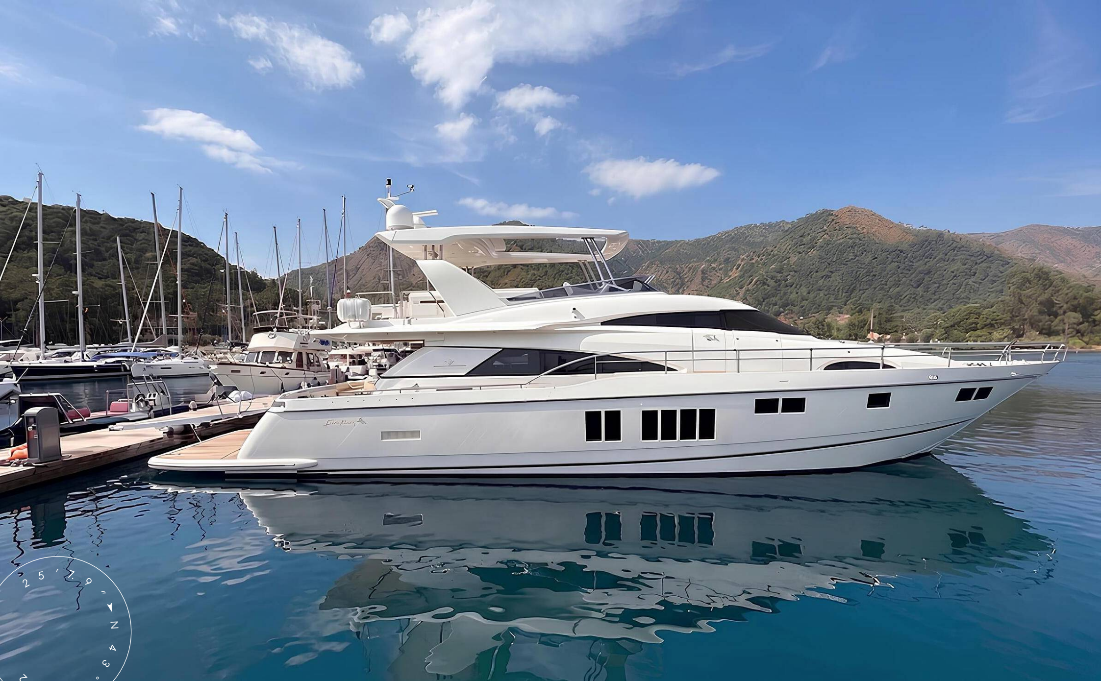
EXTERIOR FAIRLINE SQUADRON 78 2014 MY SED