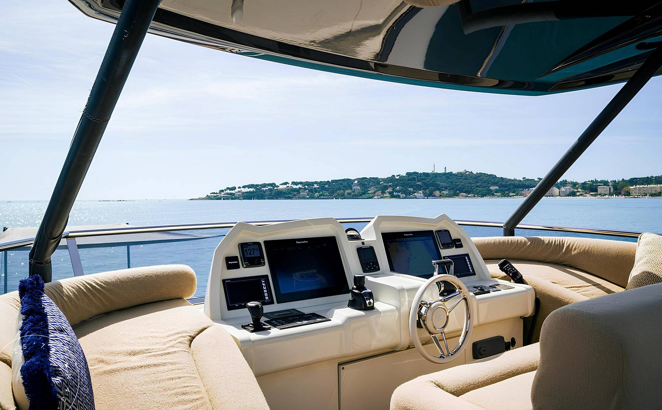
SECOND HELM STATION