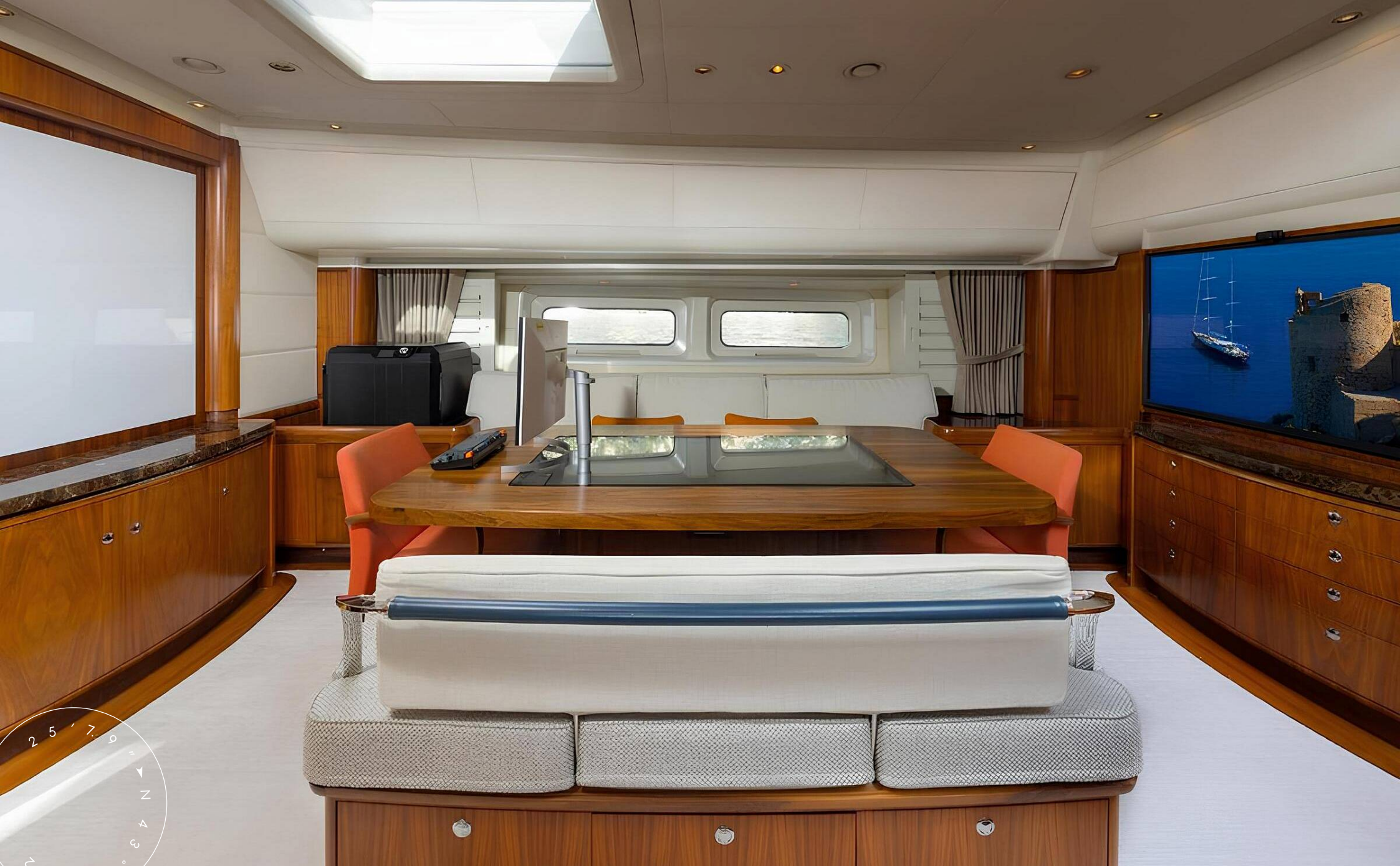
OFFICE IN THE MASTER CABIN