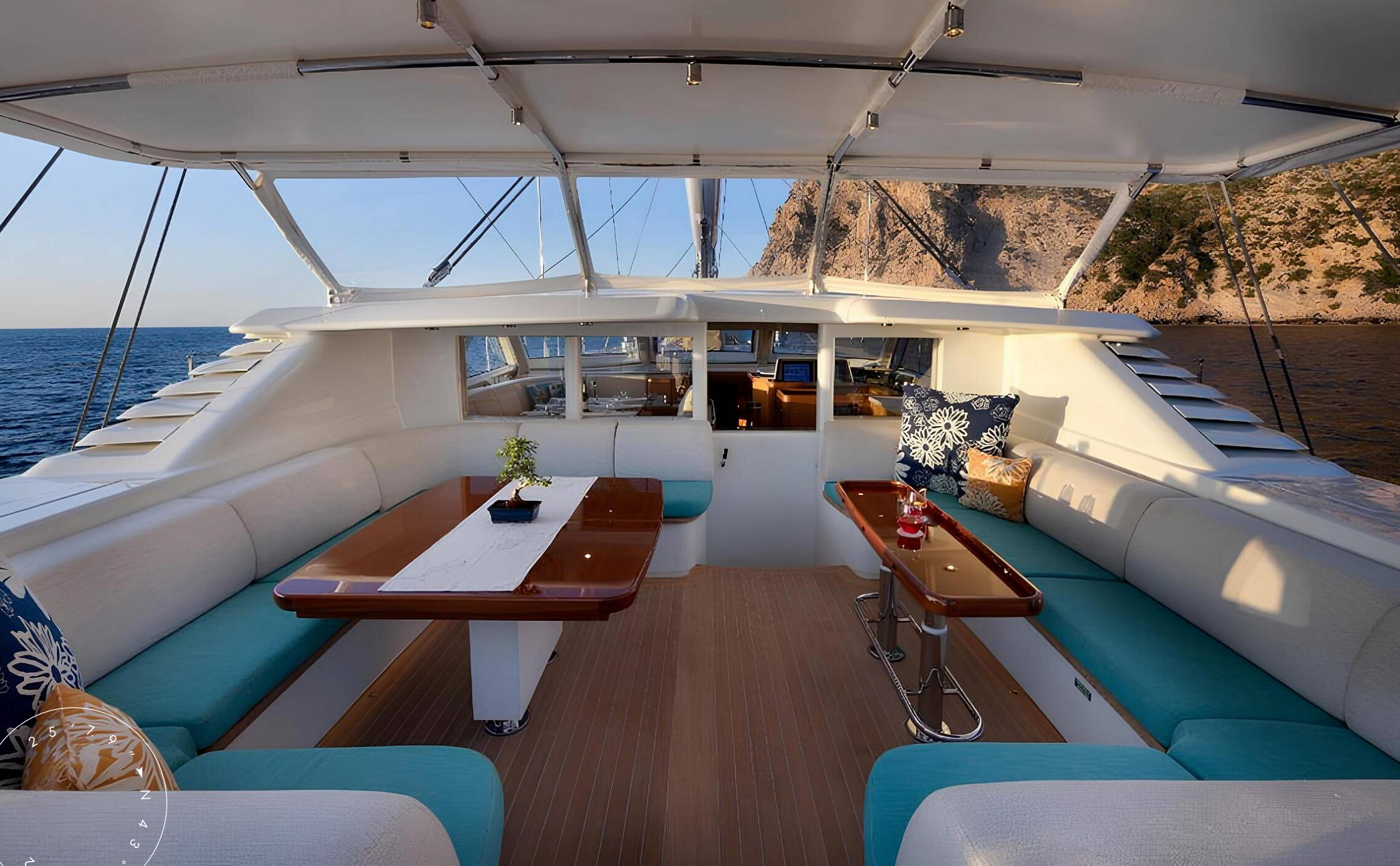
MAIN DECK LOUNGE AREA