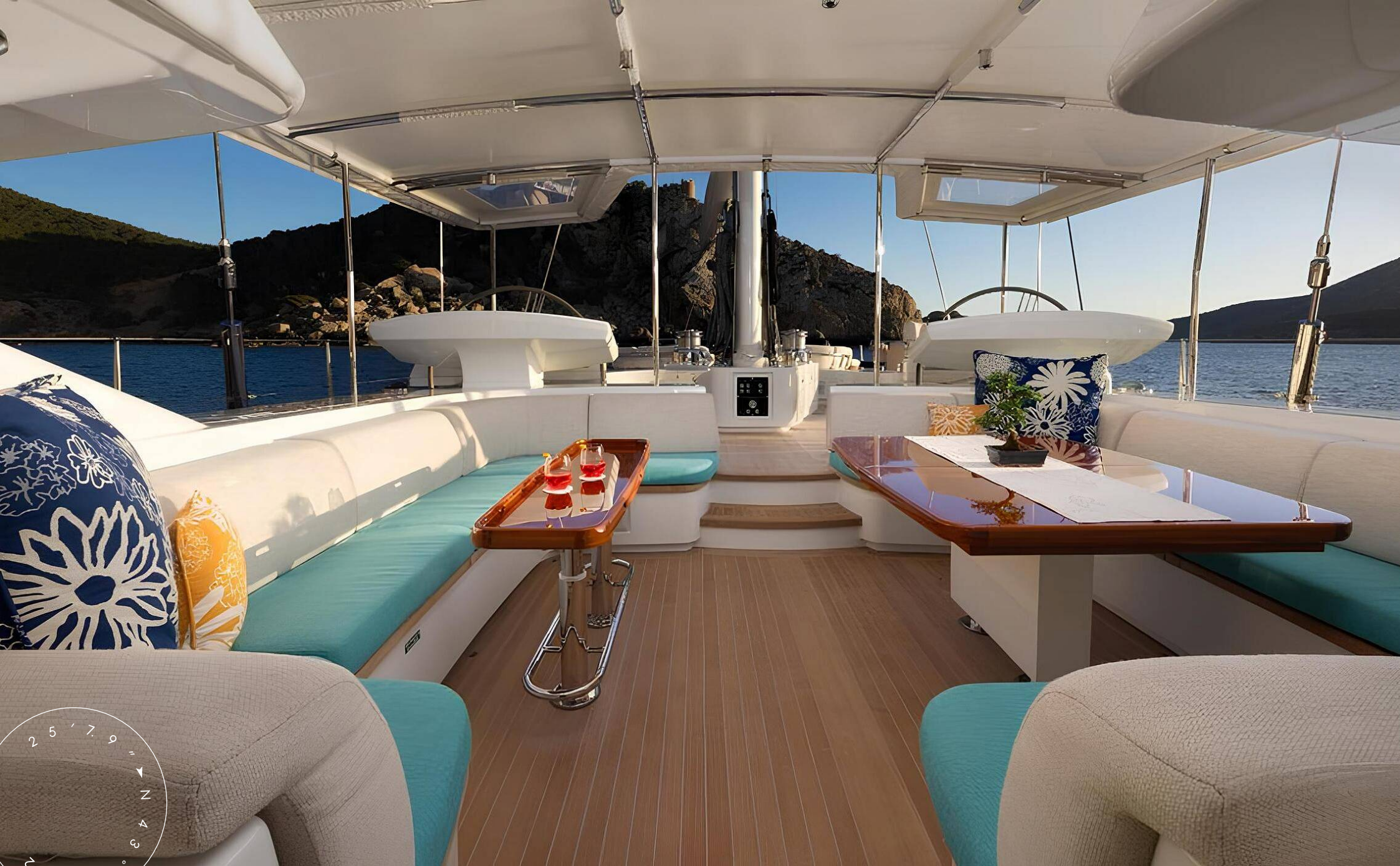
MAIN DECK LOUNGE AREA