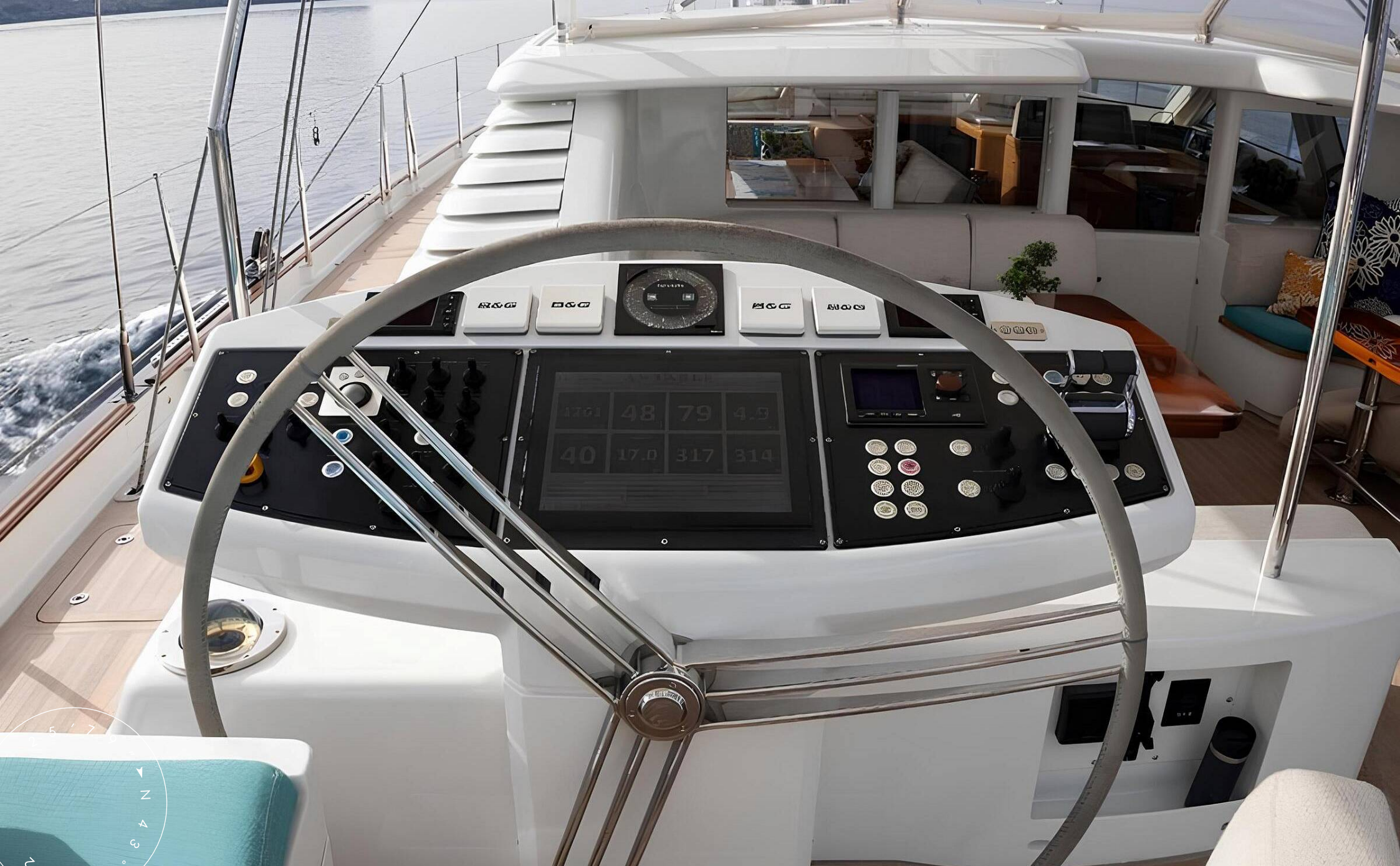
SECOND HELM STATION