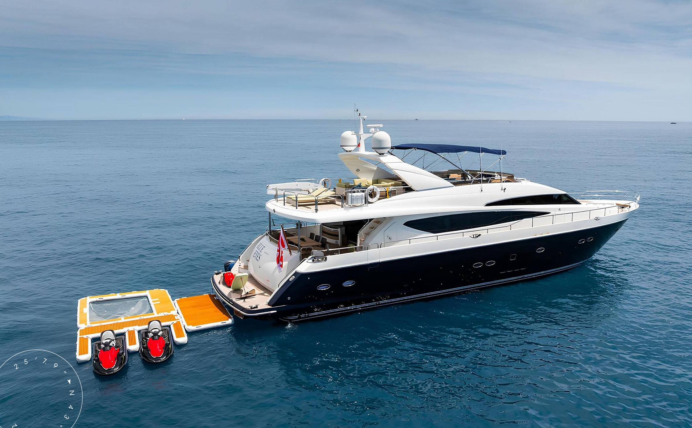
EXTERIOR PRINCESS 95 2009 MY BLUE EYES