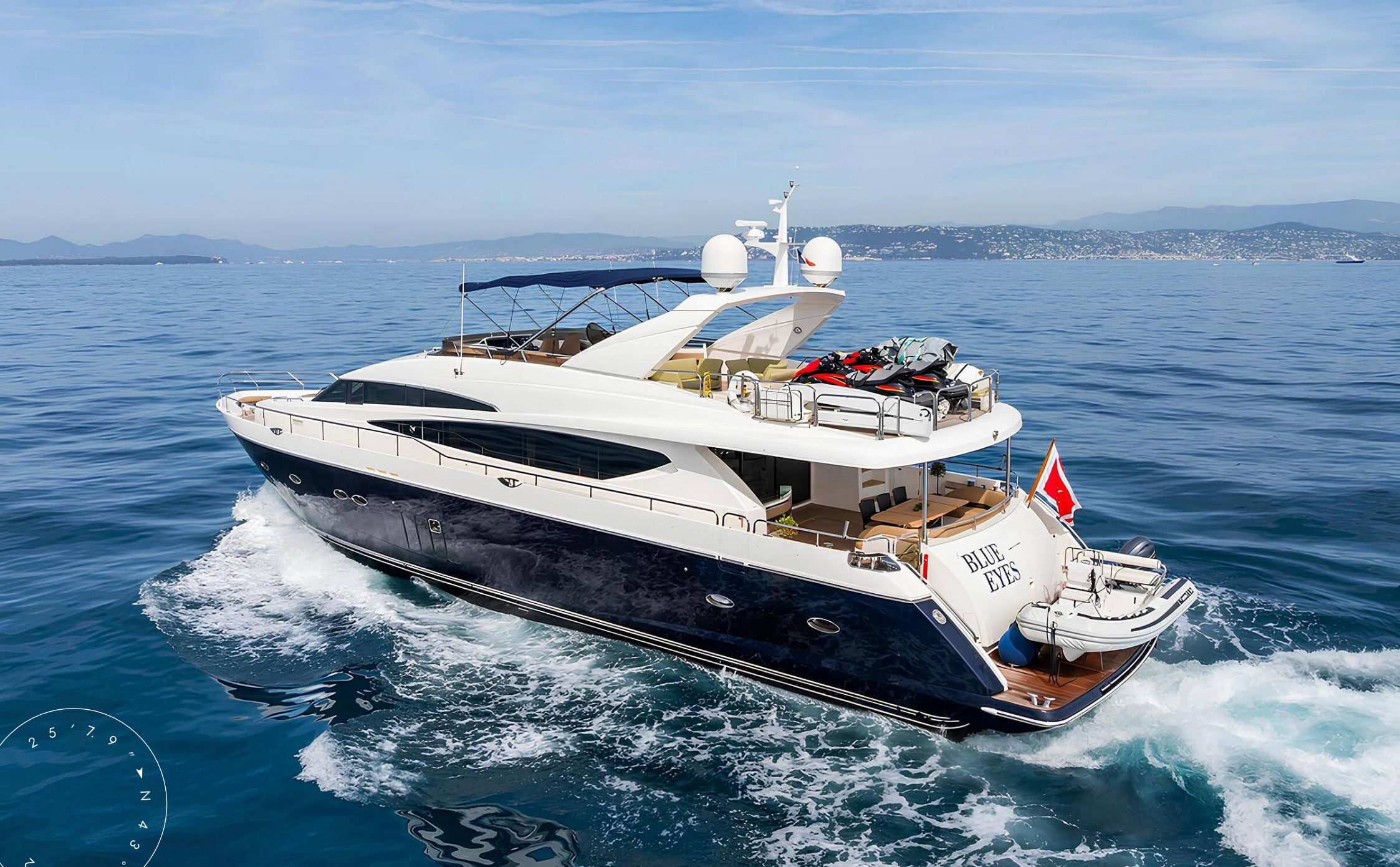
EXTERIOR PRINCESS 95 2009 MY BLUE EYES