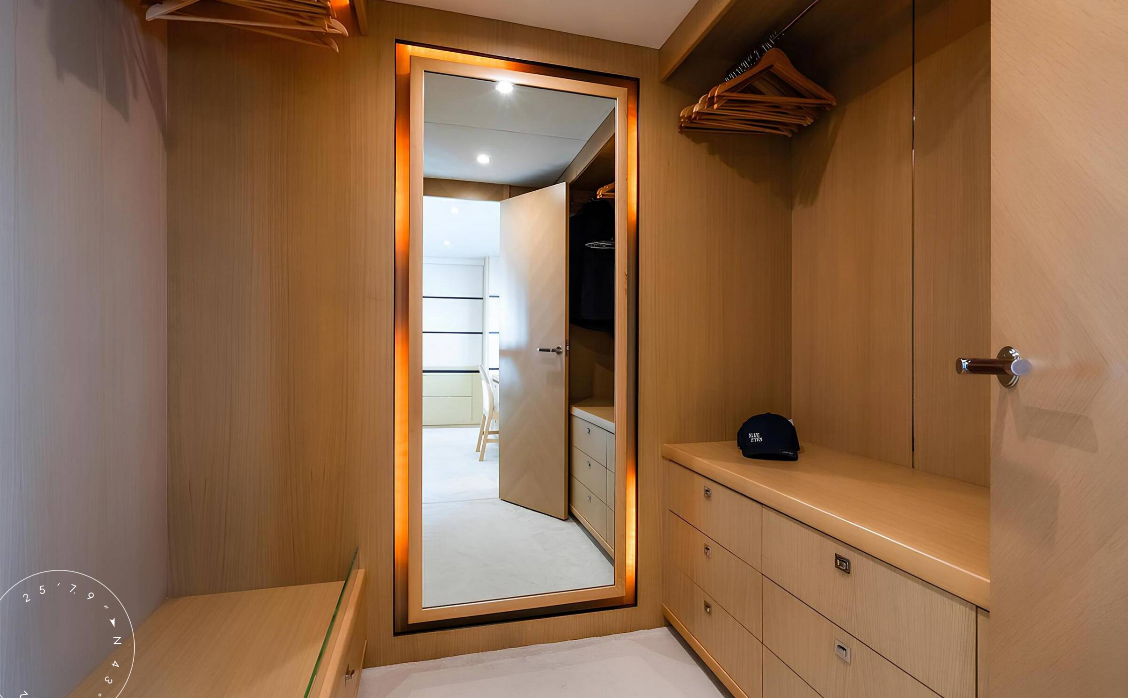
MASTER CABIN DRESSING ROOM