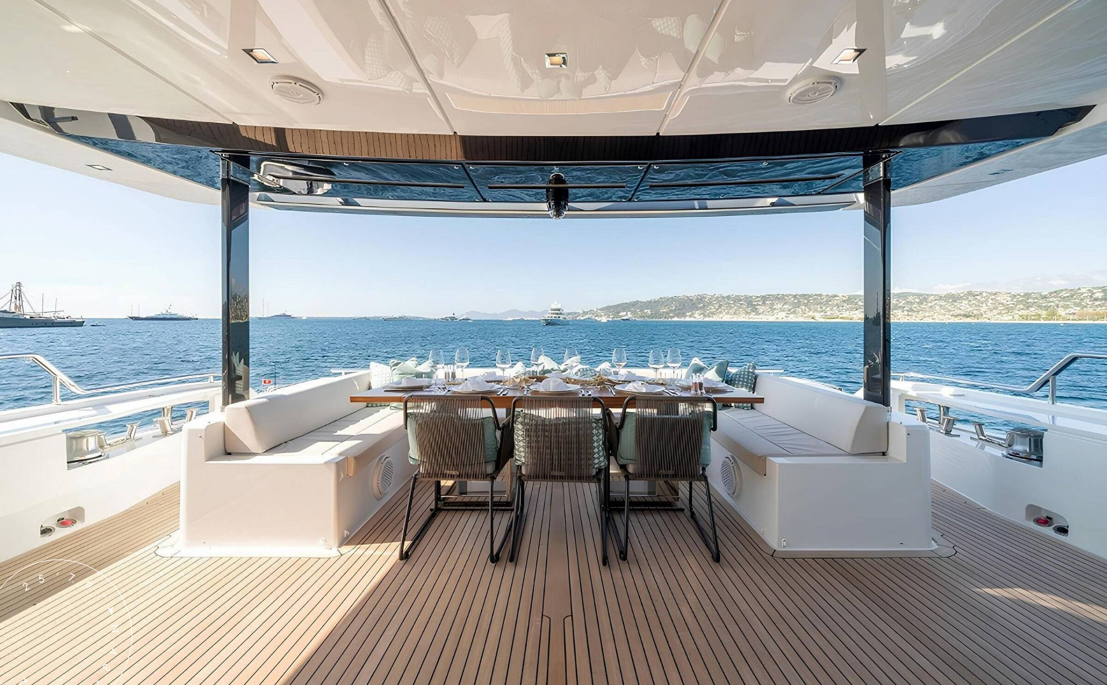
AFT MAIN DECK DINING AREA