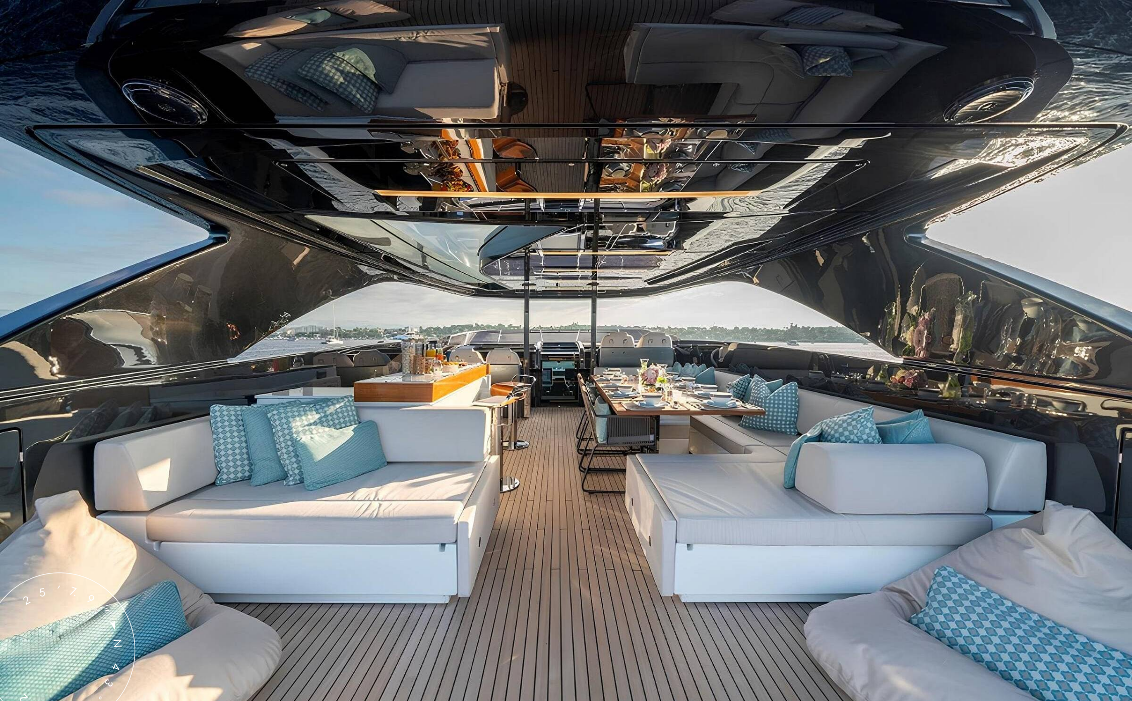
FLYBRIDGE LOUNGE AREA