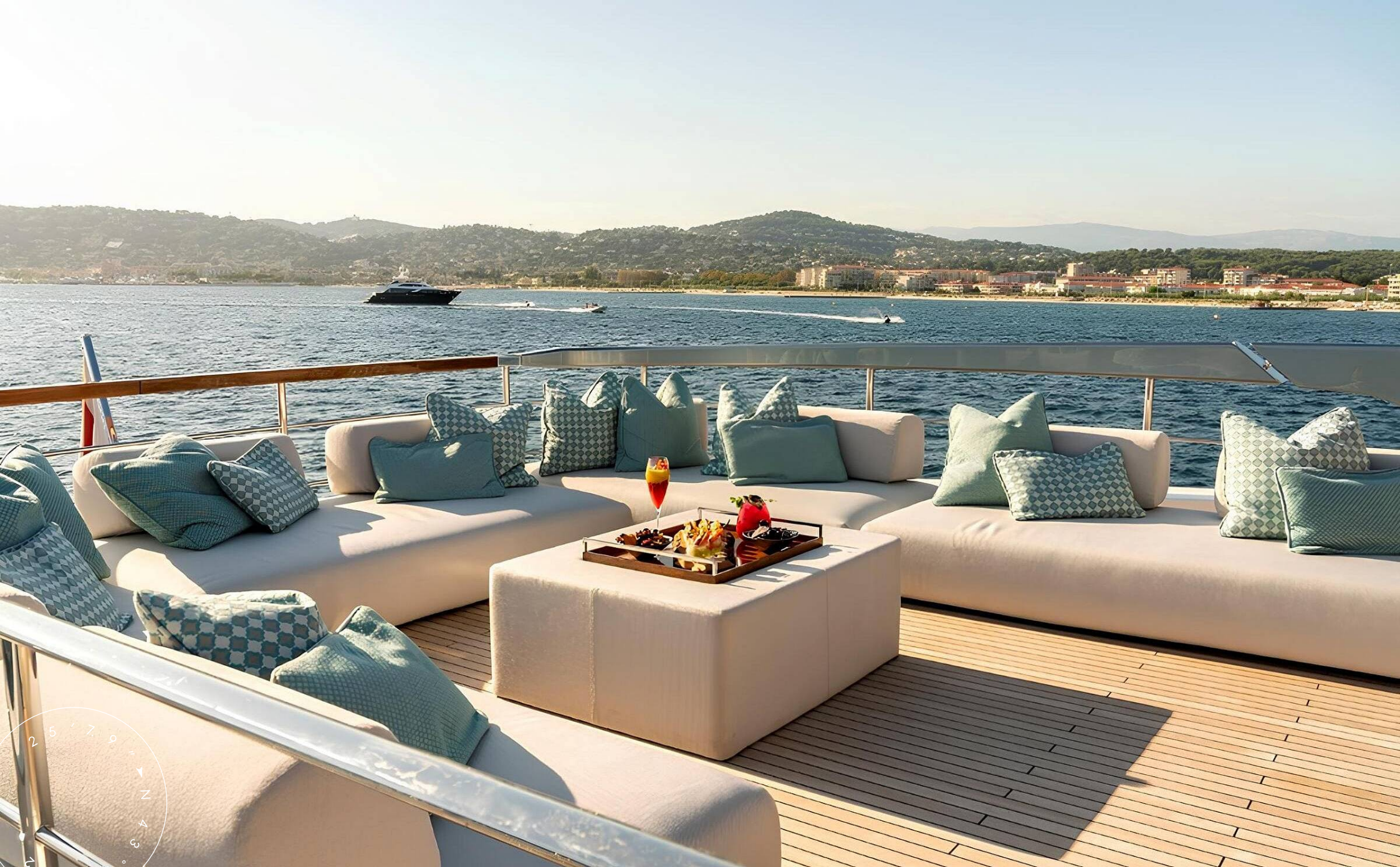
FLYBRIDGE LOUNGE AREA