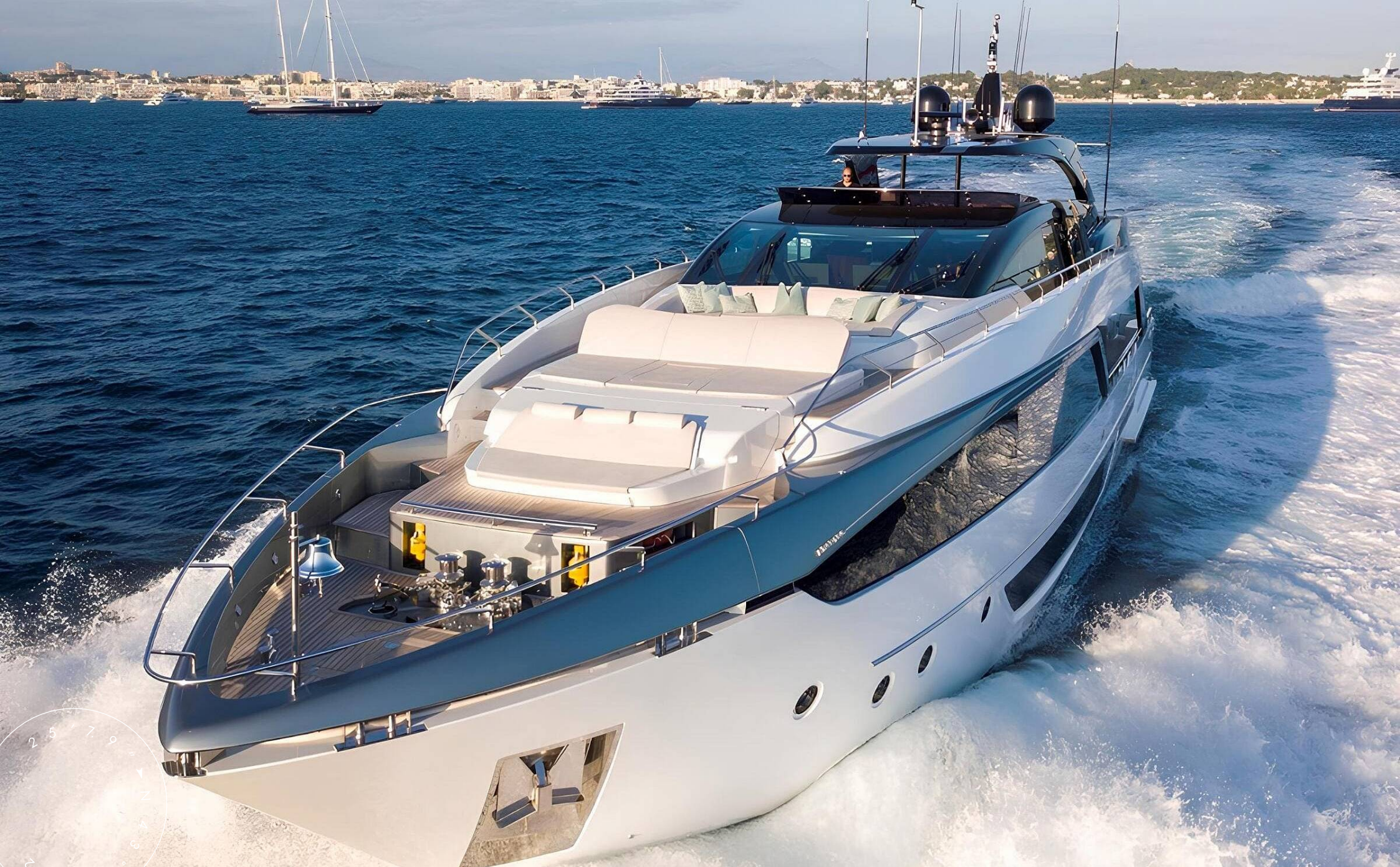
EXTERIOR RIVA 110 DOLCEVITA 2019 MY ELYSIUM I