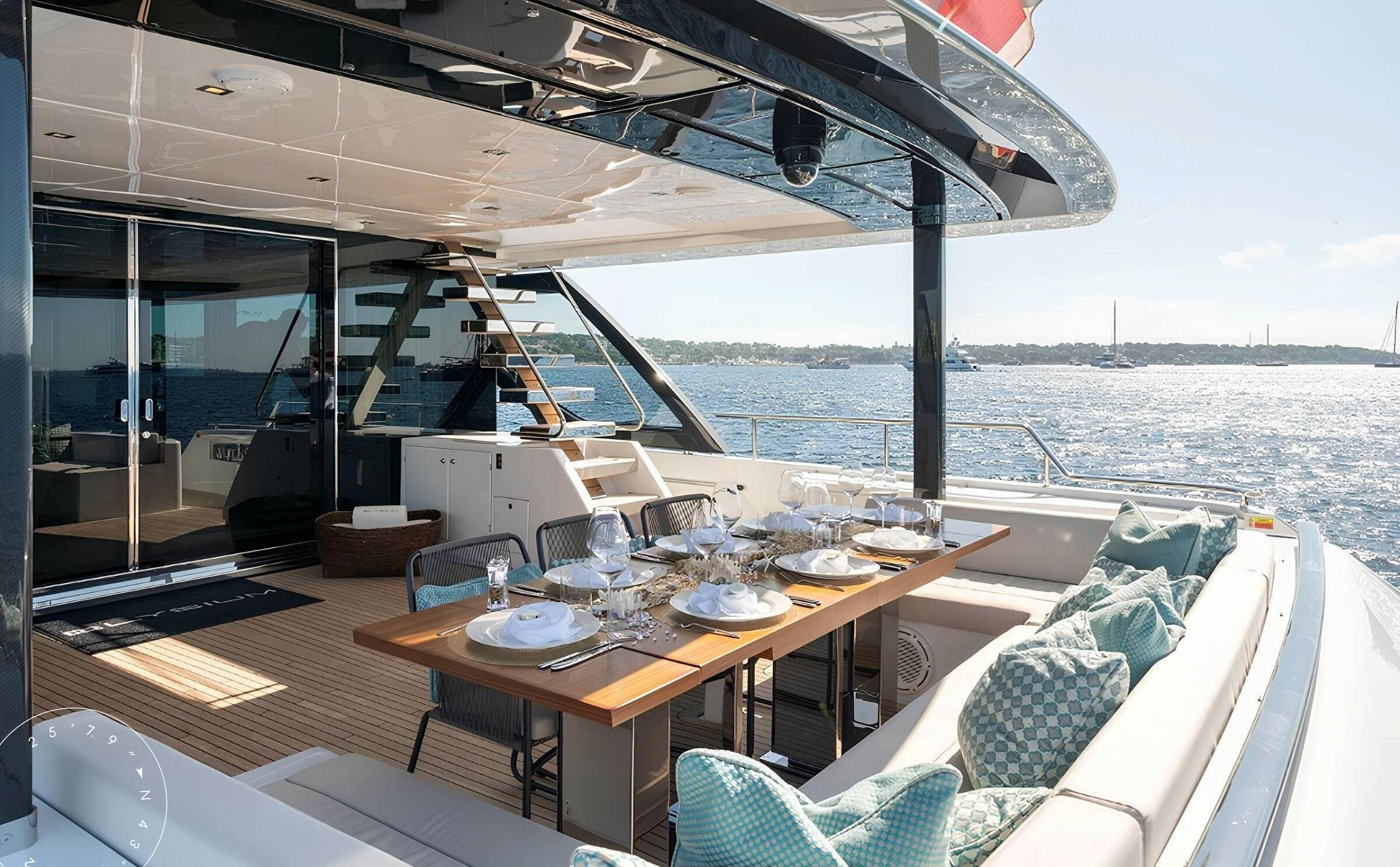
AFT MAIN DECK DINING AREA