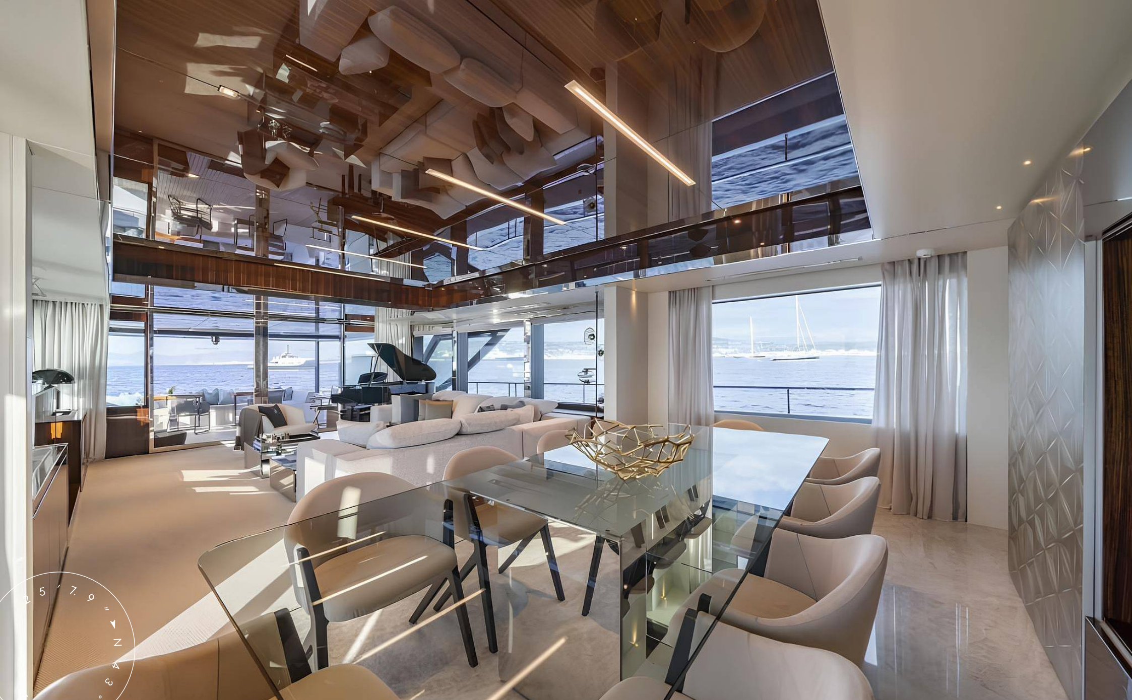
DINING AREA IN THE MAIN SALON